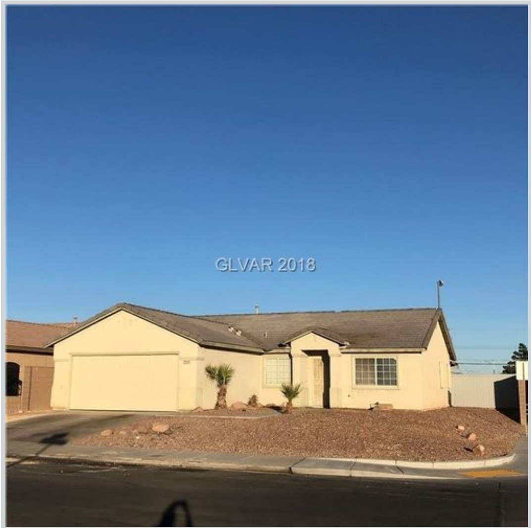
Sold Comp 1 2524 Angel Field St