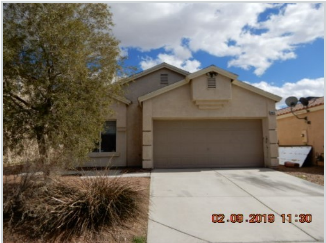
Subject 2726 Wood Drift St View Front

Comment "Entry is located on side of home. "