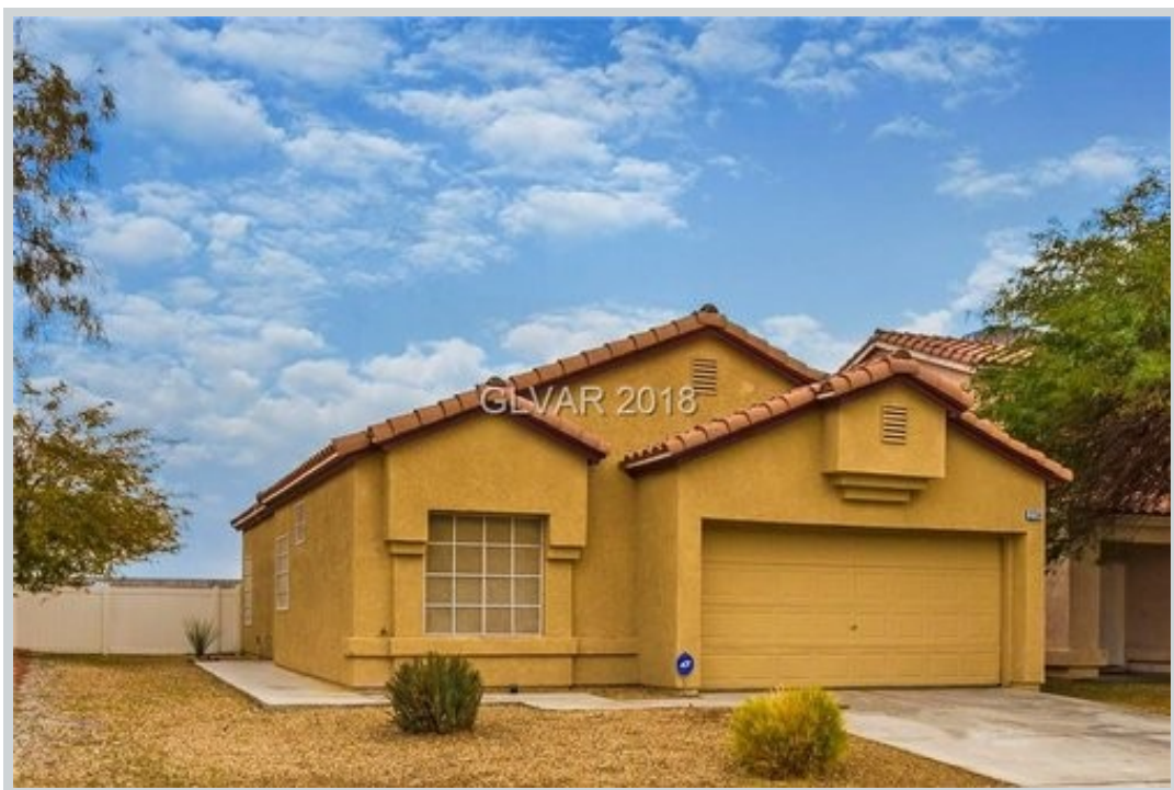
Sold Comp 3 2734 Wood Drift St