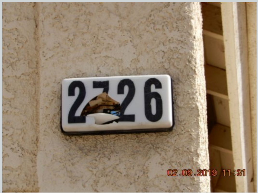
Subject 2726 Wood Drift St