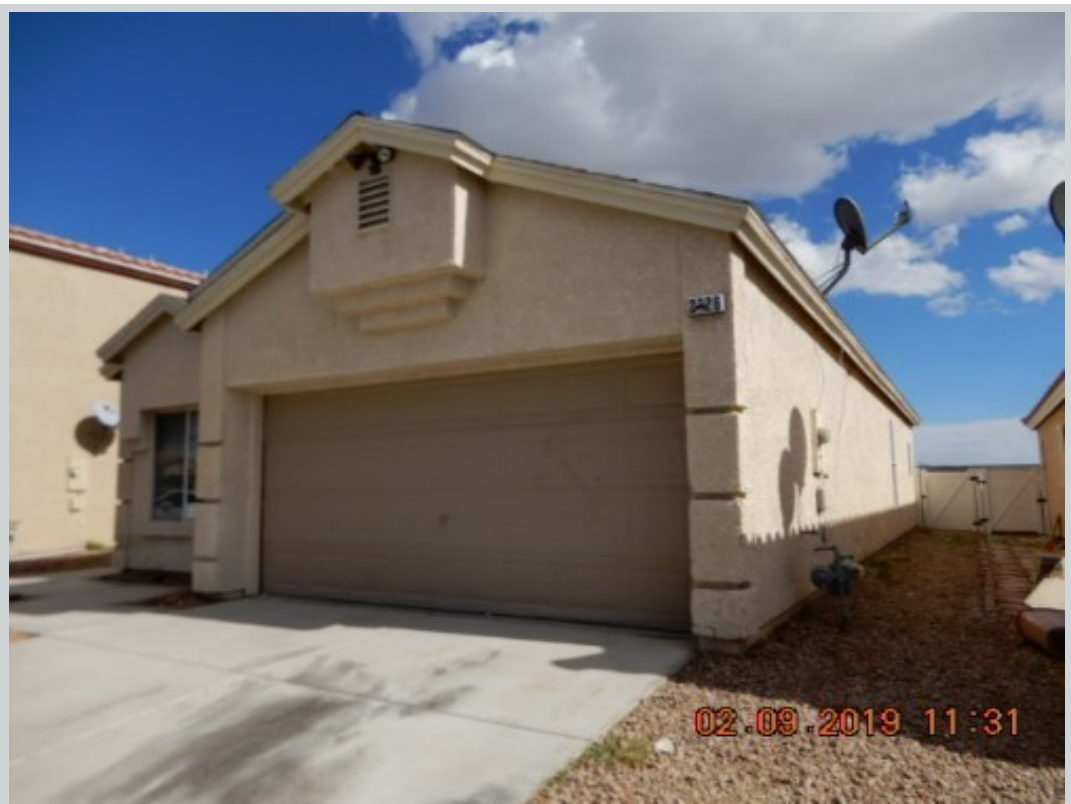
Subject 2726 Wood Drift St