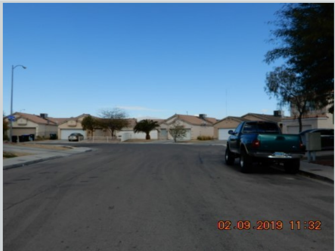
Subject 2726 Wood Drift St