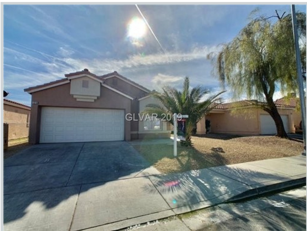
Listing Comp 2 1219 Wizard Ave