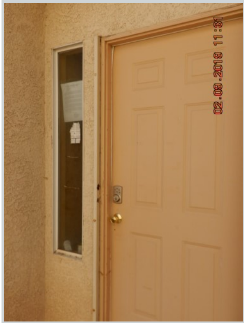
Subject 2726 Wood Drift St View Front

Comment "Entry is located on side of home. "