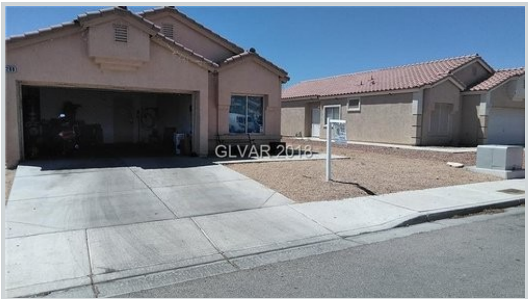
Sold Comp 2 1209 Star Meadow Dr