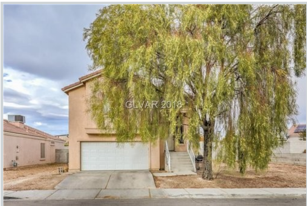
Listing Comp 3 1318 Star Meadow Dr