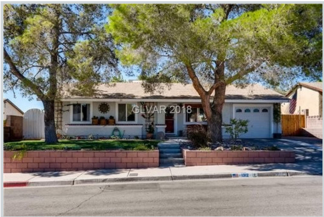
Sold Comp 3 1312 Nadine Way

Address 1403 Nadine Way, Boulder City, NV 89005 Loan Number 37049 Suggested List $308,000 Suggested Repaired $308,000 Sale $295,000