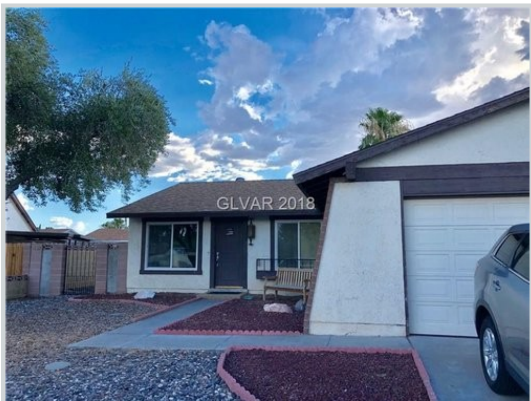
Sold Comp 1 1404 Elsa Way

Address 1403 Nadine Way, Boulder City, NV 89005 Loan Number 37049 Suggested List $308,000 Suggested Repaired $308,000 Sale $295,000