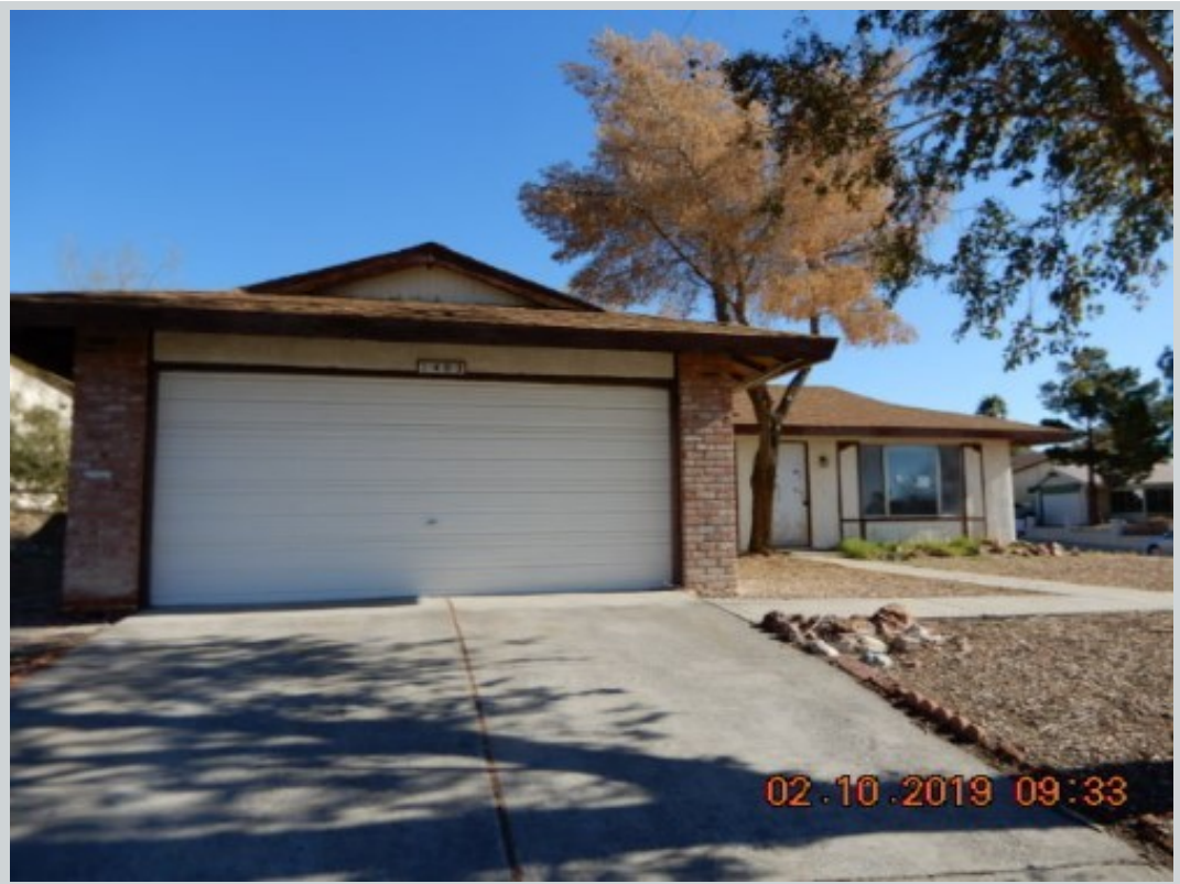
Subject 1403 Nadine Way