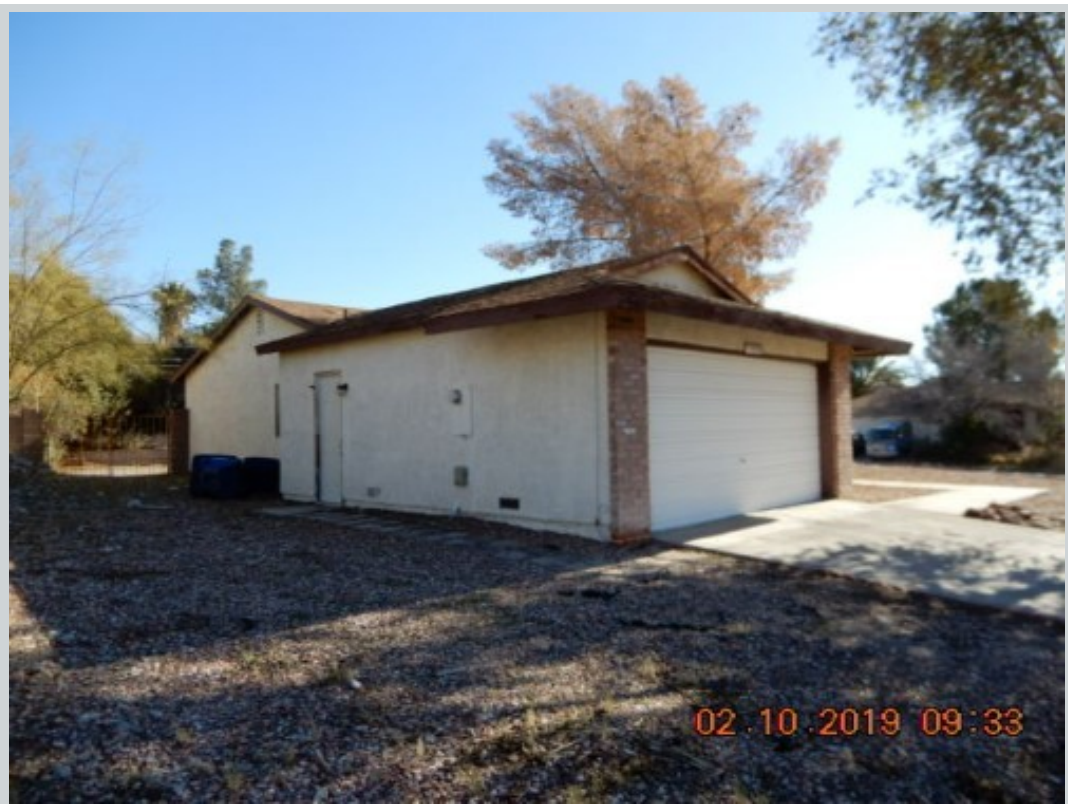
Subject 1403 Nadine Way

Address 1403 Nadine Way, Boulder City, NV 89005 Loan Number 37049 Suggested List $308,000 Suggested Repaired $308,000 Sale $295,000