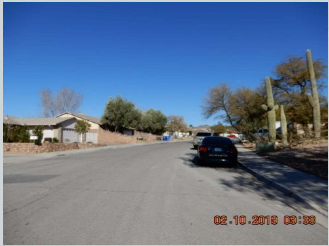
Subject 1403 Nadine Way