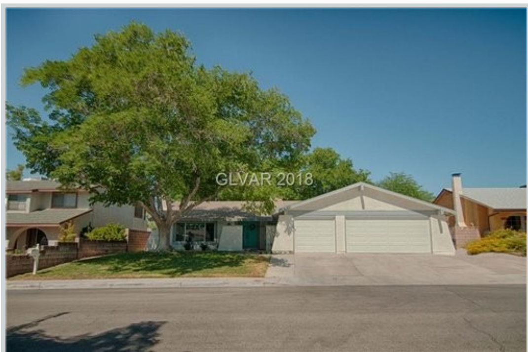
Listing Comp 3 1534 Dorothy Dr