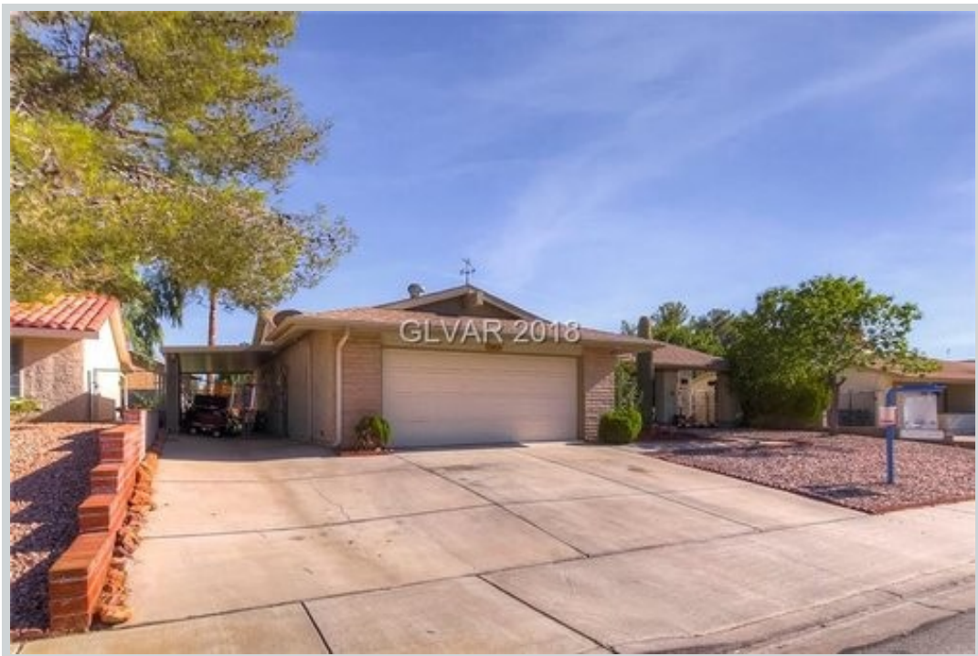
Listing Comp 2 793 Sandra Dr

Address 1403 Nadine Way, Boulder City, NV 89005 Loan Number 37049 Suggested List $308,000 Suggested Repaired $308,000 Sale $295,000