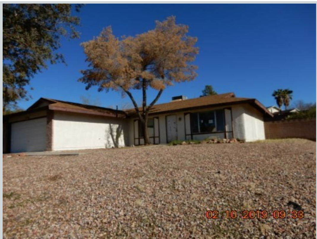
Subject 1403 Nadine Way