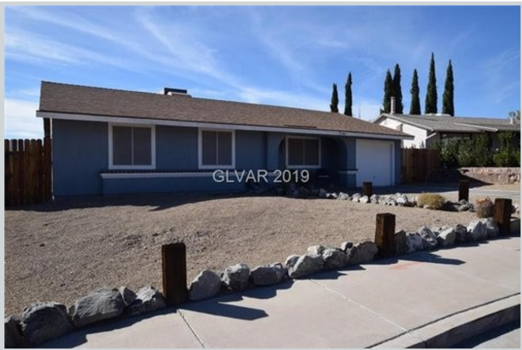
Listing Comp 1 1404 Nadine Way