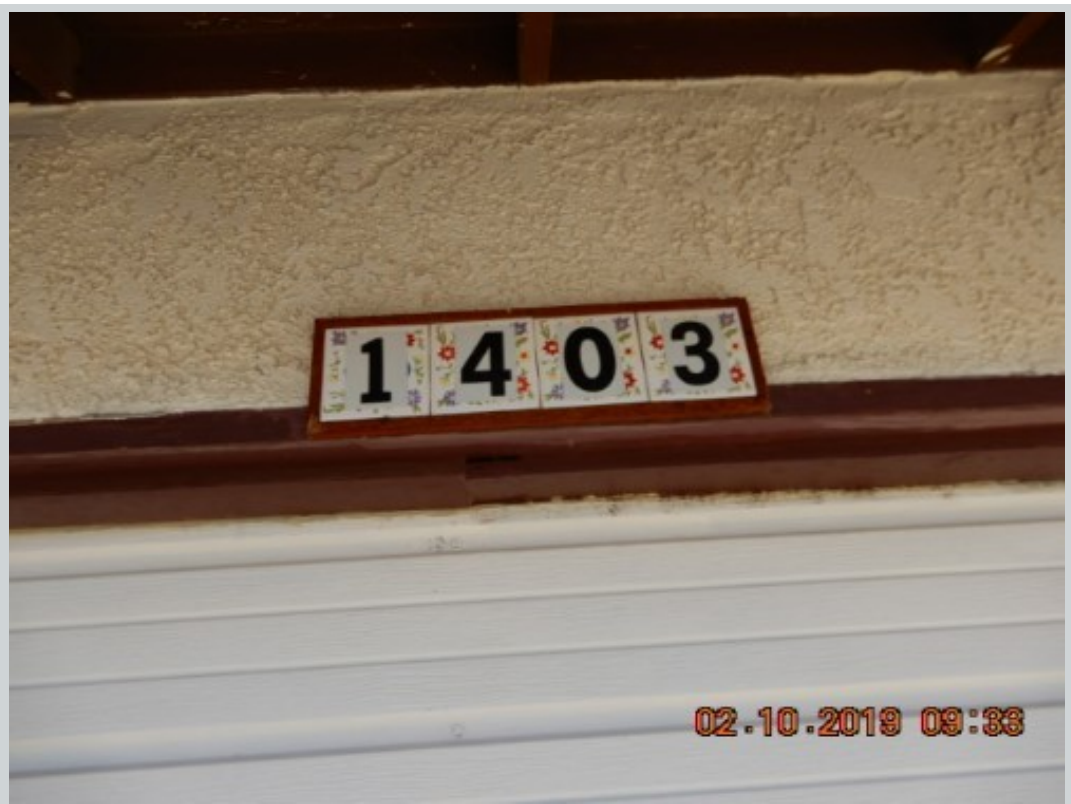
Subject 1403 Nadine Way