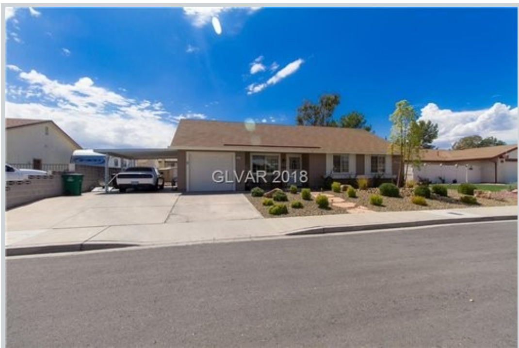
Sold Comp 2 1522 Della Ct