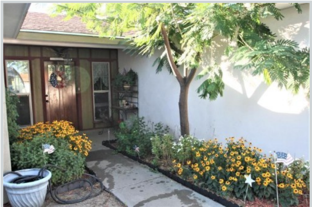
Listing Comp 3 11624 Morenci Ave Ne