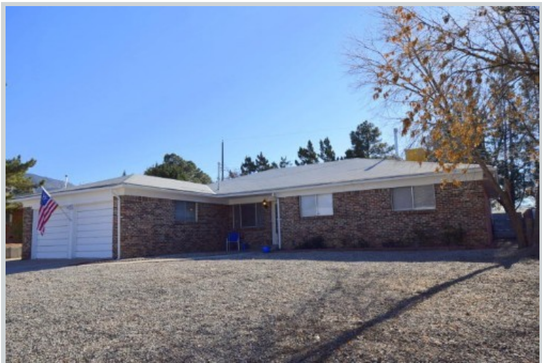
Sold Comp 3 11504 Bar Harbor Pl Ne