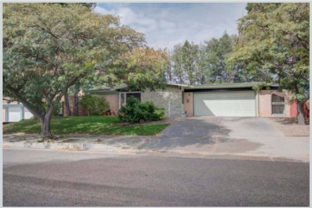
Sold Comp 1 11501 Golden Gate Ave Ne