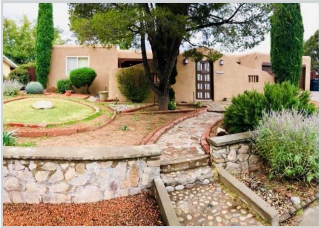
Listing Comp 2 3609 Alaska Pl Ne