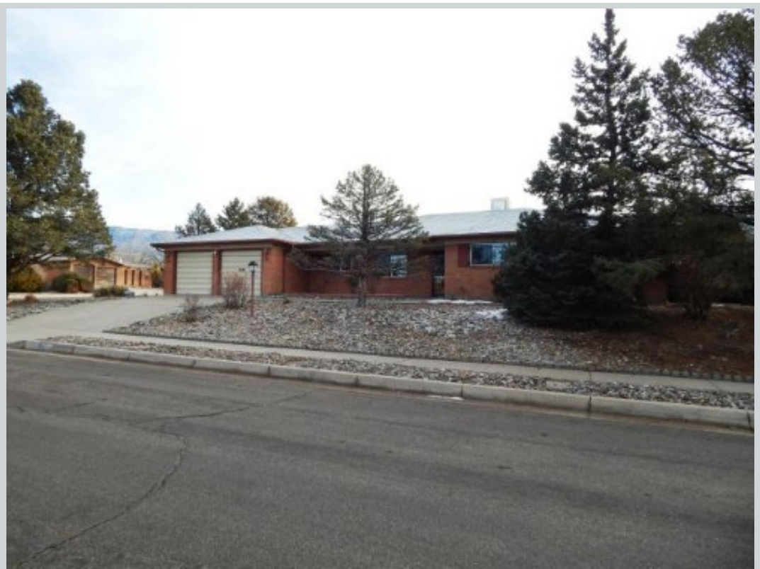
Listing Comp 1 11612 Brussels Ave Ne