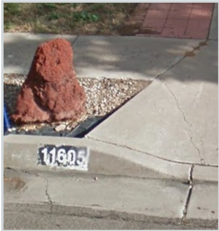
Subject 11605 Golden Gate Ave Ne