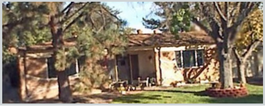
Subject 11605 Golden Gate Ave Ne