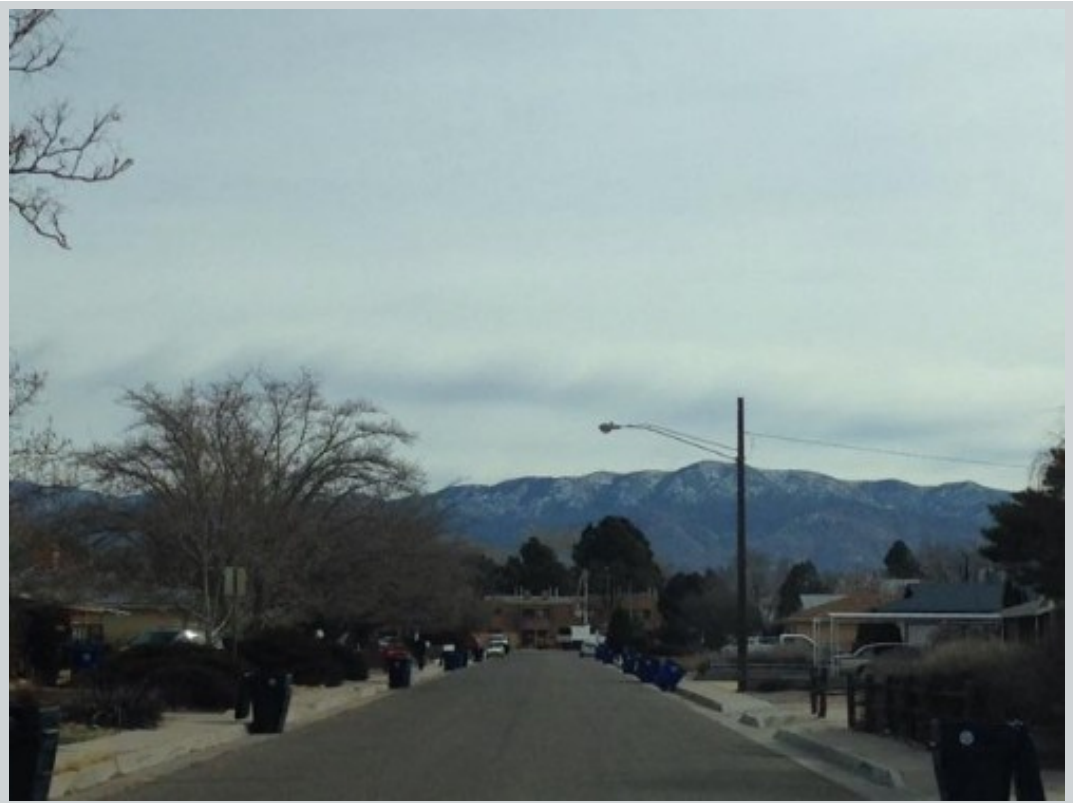
Subject 11605 Golden Gate Ave Ne