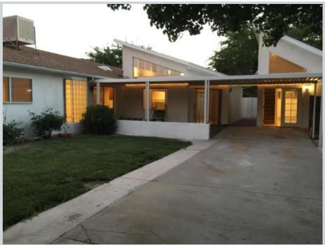
Sold Comp 2 11913 Golden Gate Ave Ne