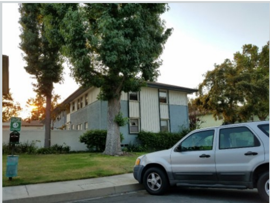
Subject 5805 Bowcroft St Unit 3