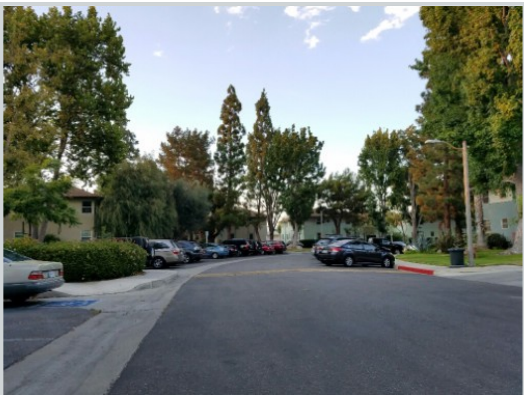
Subject 5805 Bowcroft St Unit 3