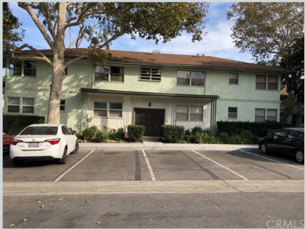
Listing Comp 3 5822 Bowcroft St #3