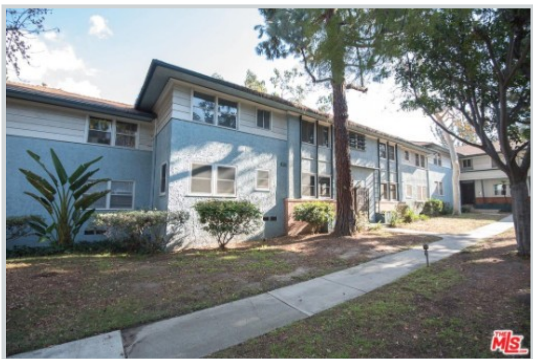
Sold Comp 3 5844 Bowcroft St #4