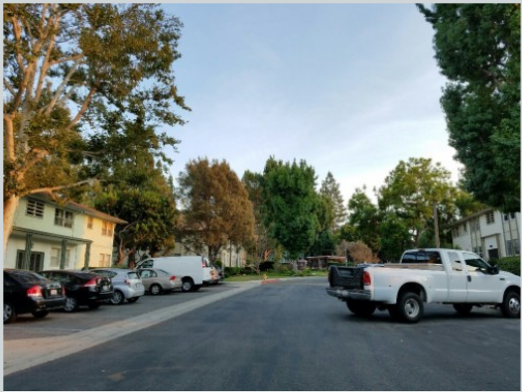
Subject 5805 Bowcroft St Unit 3