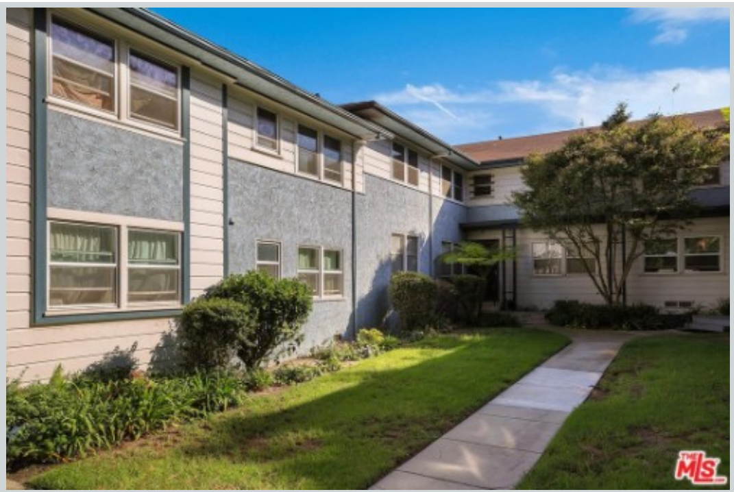
Sold Comp 1 5878 Bowcroft St #3