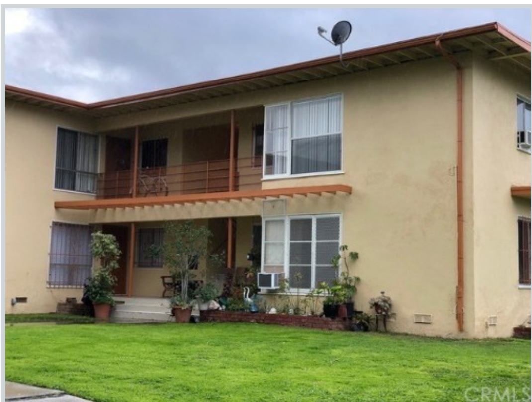
Listing Comp 2 5648 Clemson St