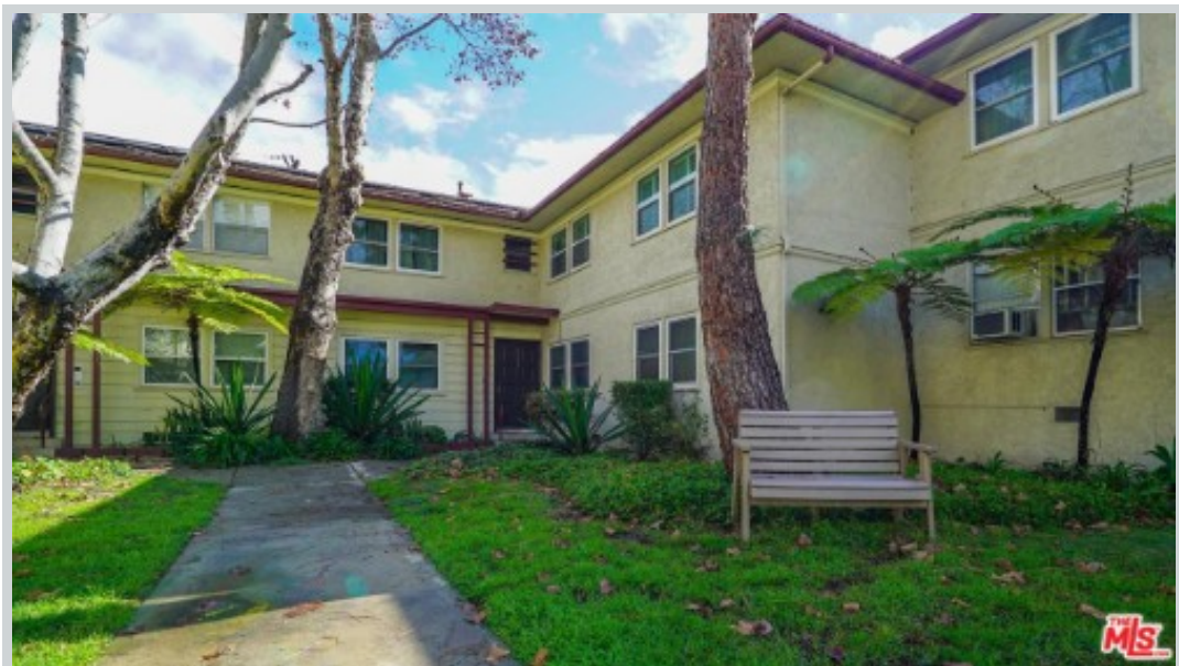
Listing Comp 1 3644 Kalsman Dr #3