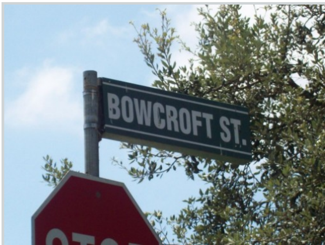
Subject 5805 Bowcroft St Unit 3