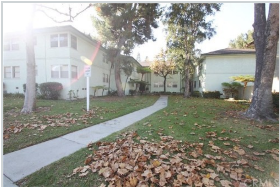
Sold Comp 2 5827 Bowcroft St #4