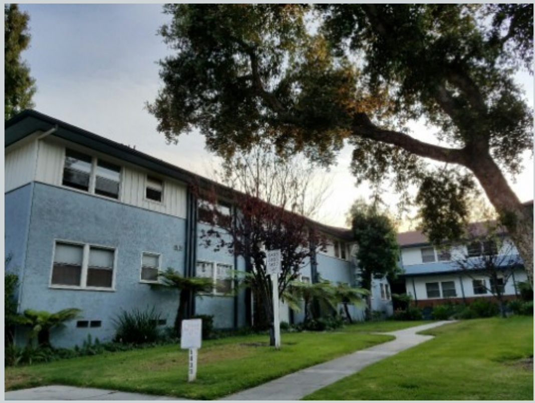
Subject 5805 Bowcroft St Unit 3