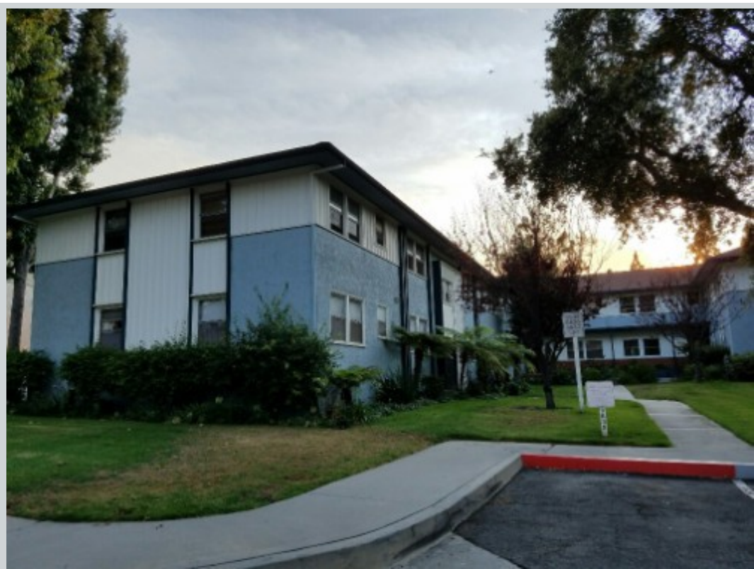
Subject 5805 Bowcroft St Unit 3