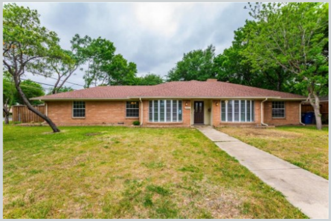
Sold Comp 2 10011 Spokane Circle