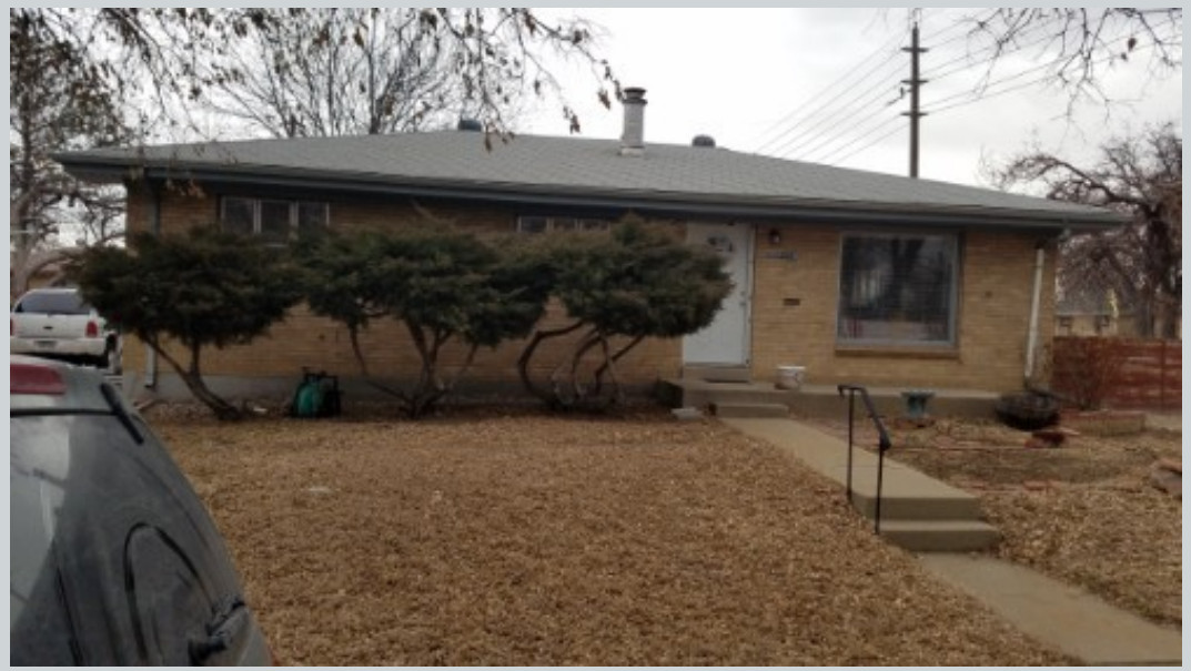
Subject 3021 Timberview Rd