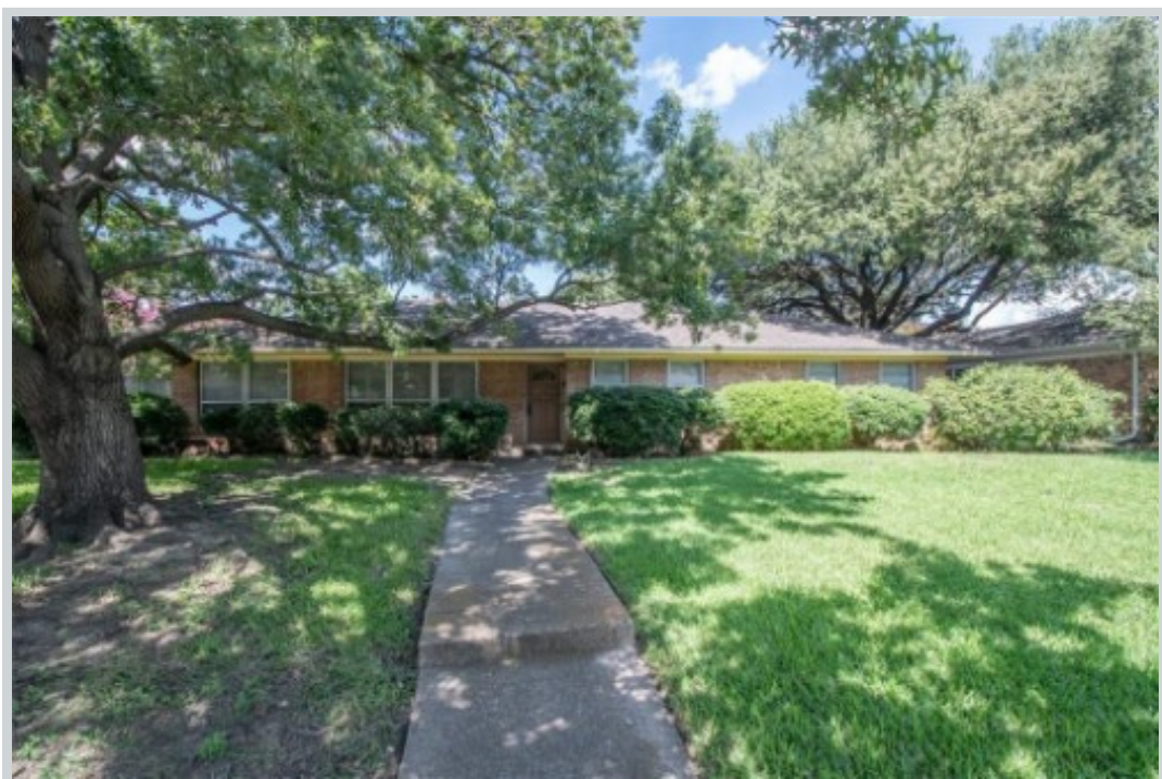
Sold Comp 1 3221 Princess Lane