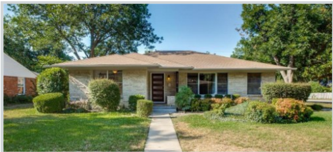
Listing Comp 1 3306 Lockmoor Lane View Front

Address 3021 Timberview Road, Dallas, TX 75229 Loan Number 37081 Suggested List $276,000 Suggested Repaired $276,000 Sale $271,000