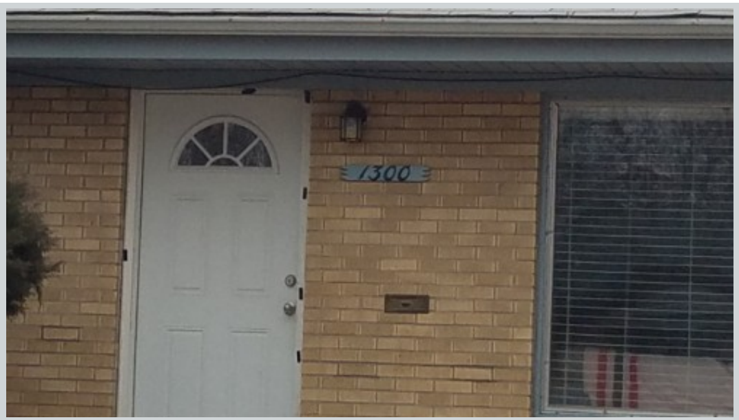
Subject 3021 Timberview Rd