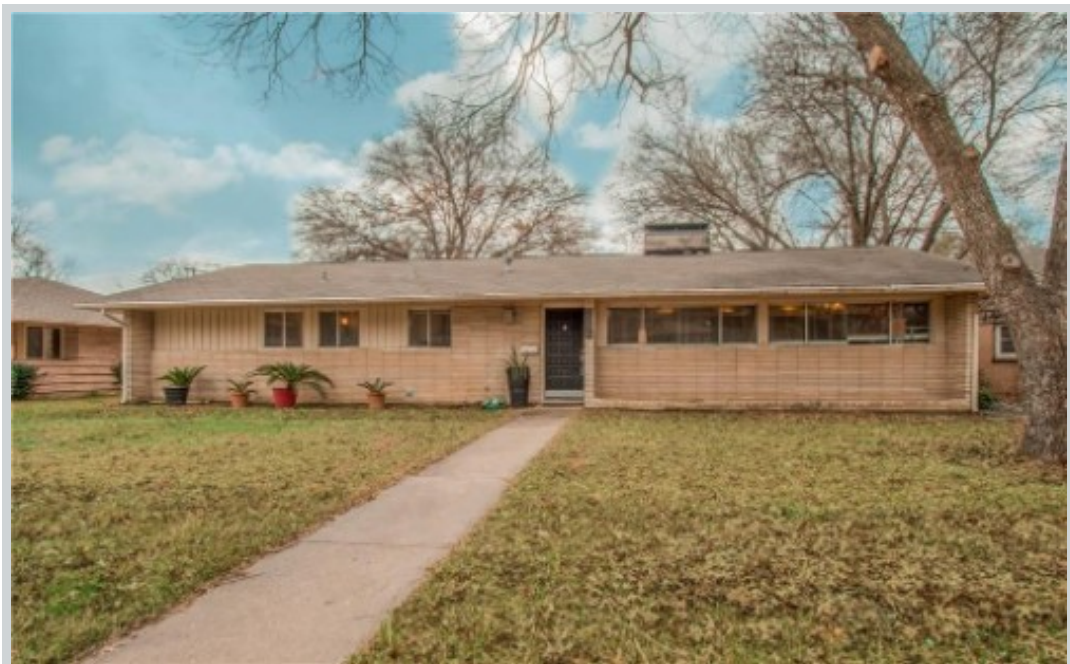
Listing Comp 2 3330 Darvany Drive View Front