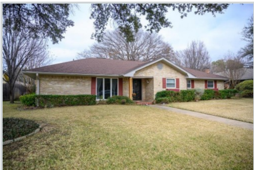
Listing Comp 3 10349 Carry Back Circle

Address 3021 Timberview Road, Dallas, TX 75229 Loan Number 37081 Suggested List $276,000 Suggested Repaired $276,000 Sale $271,000