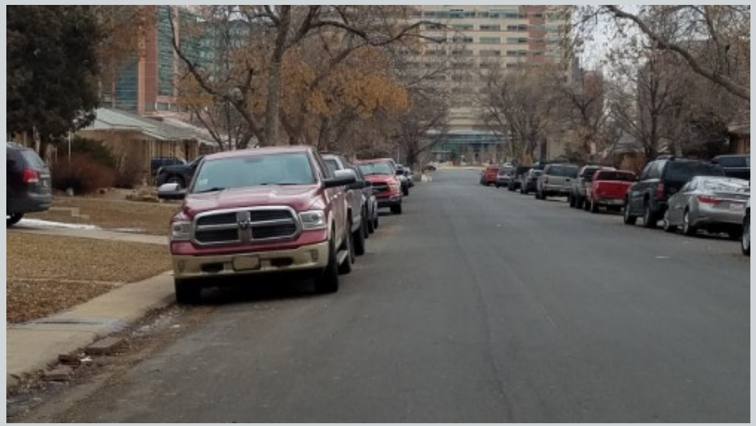
Subject 3021 Timberview Rd