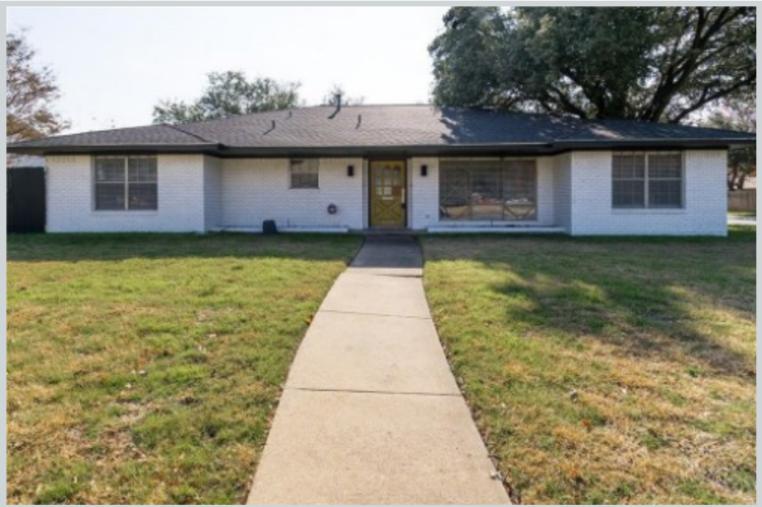
Sold Comp 3 3208 Citation Drive