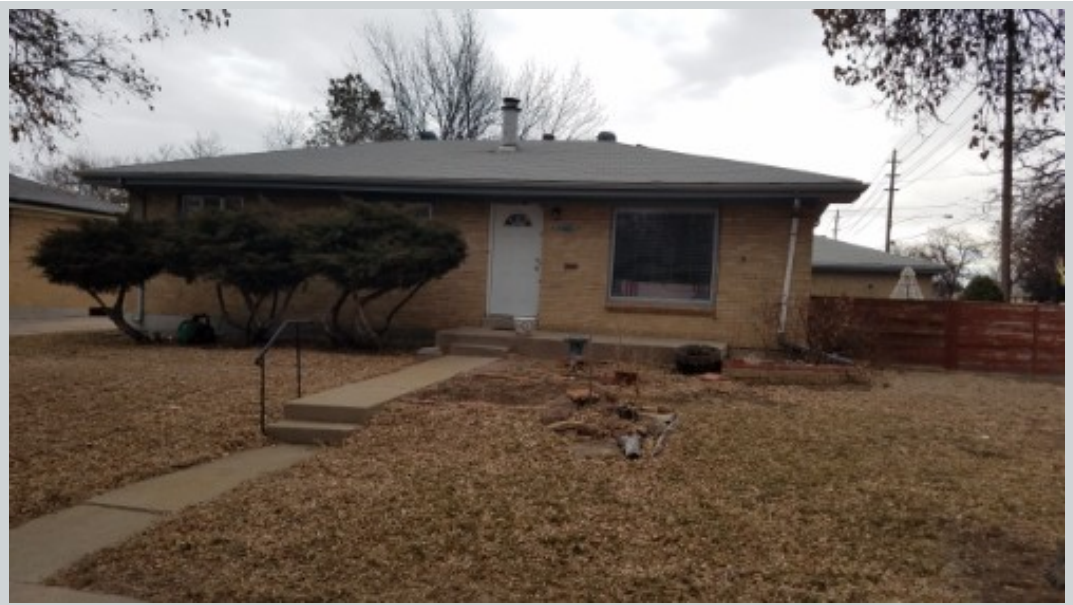
Subject 3021 Timberview Rd