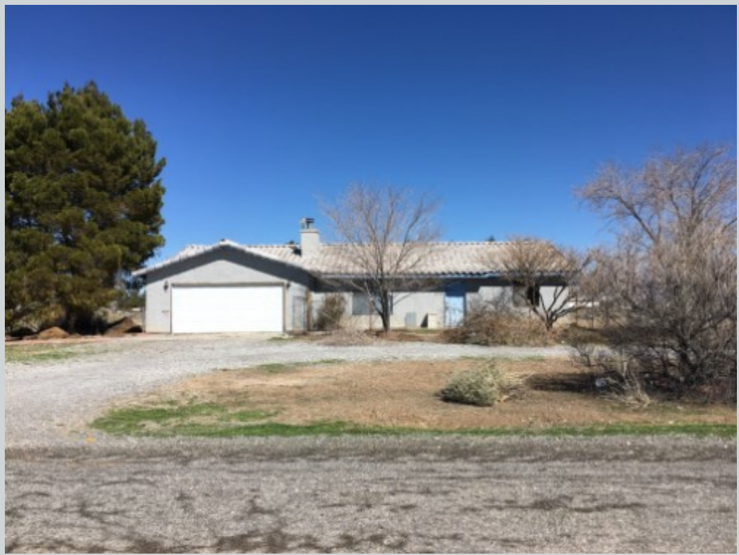
Subject 2760 W Retread Rd