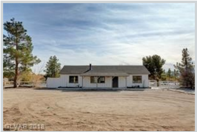
Sold Comp 3