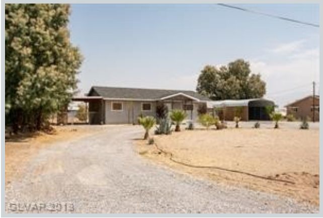
Sold Comp 2