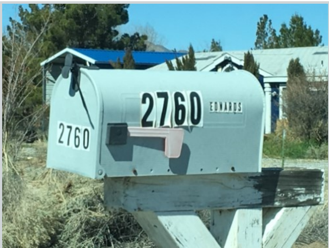
Subject 2760 W Retread Rd