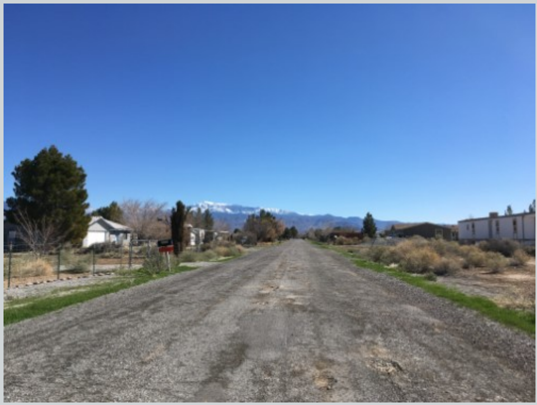
Subject 2760 W Retread Rd