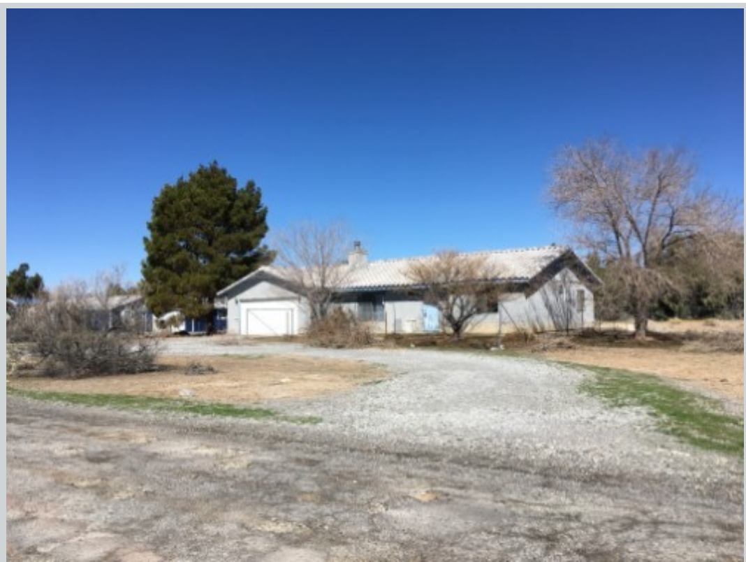
Subject 2760 W Retread Rd