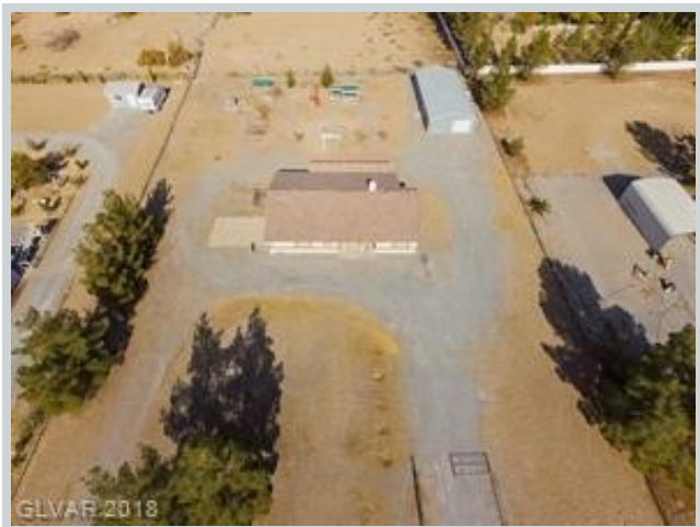
Listing Comp 2 View Front