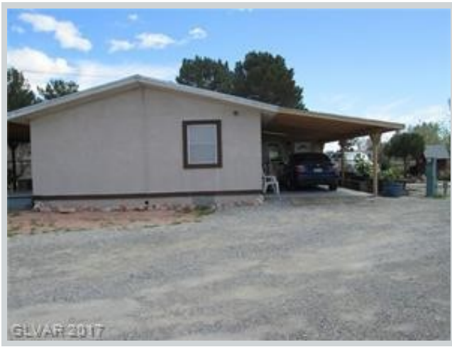
Sold Comp 1