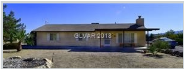
Listing Comp 1 View Front

Address 2760 W Retread Road, Pahrump, NV 89048 Suggested Repaired $160,000 Sale $160,000 Loan Number 37094 Suggested List $160,000