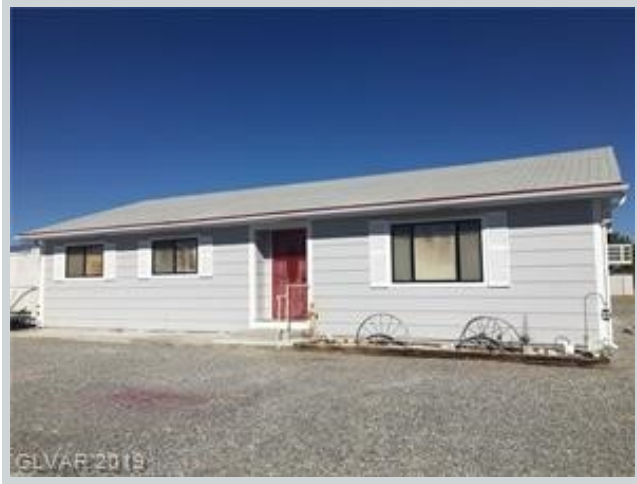
Listing Comp 3