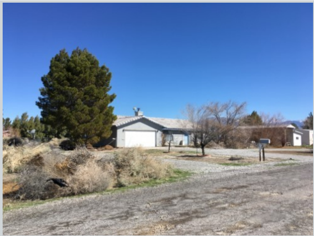
Subject 2760 W Retread Rd