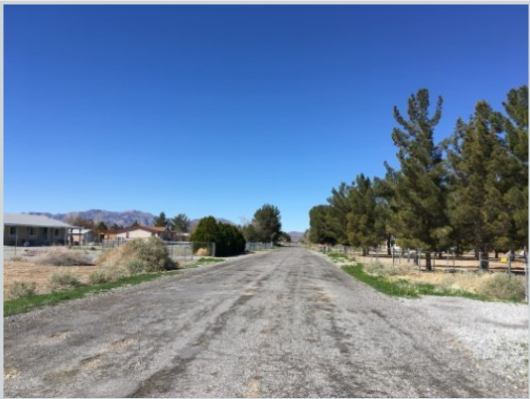
Subject 2760 W Retread Rd