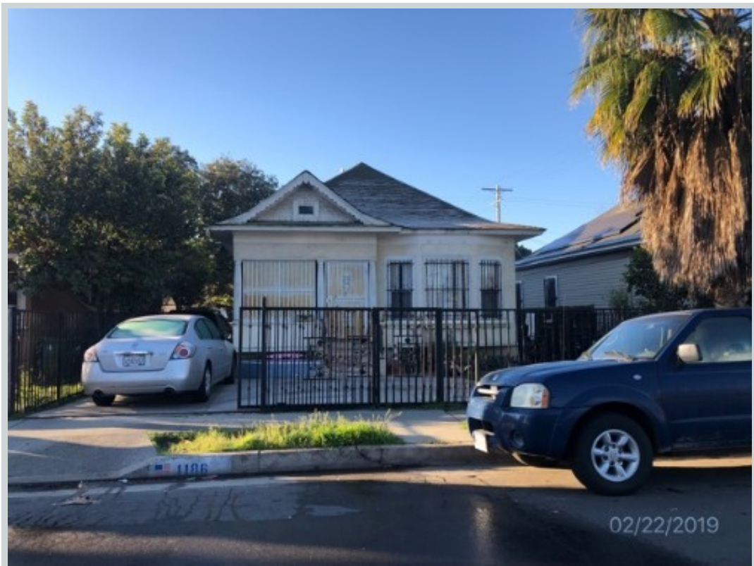
Subject 1186 E 55th St