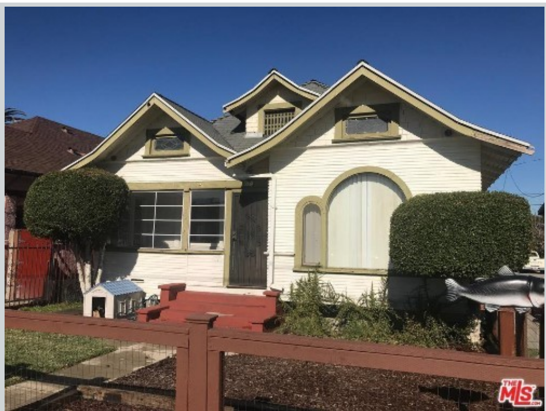
Listing Comp 3 821 E 46th St