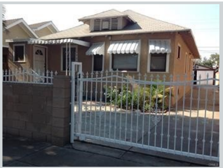
Sold Comp 2 1225 E 54th St View Front