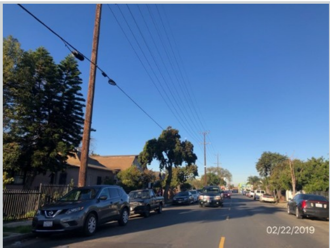
Subject 1186 E 55th St