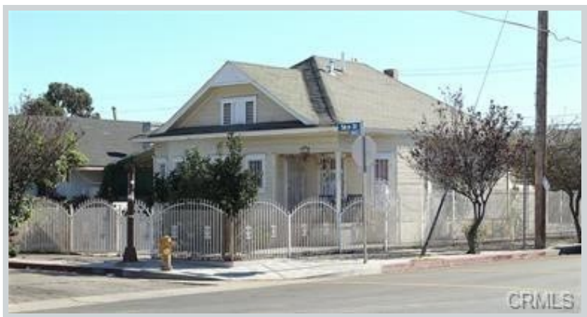
Sold Comp 3 852 E 56th S