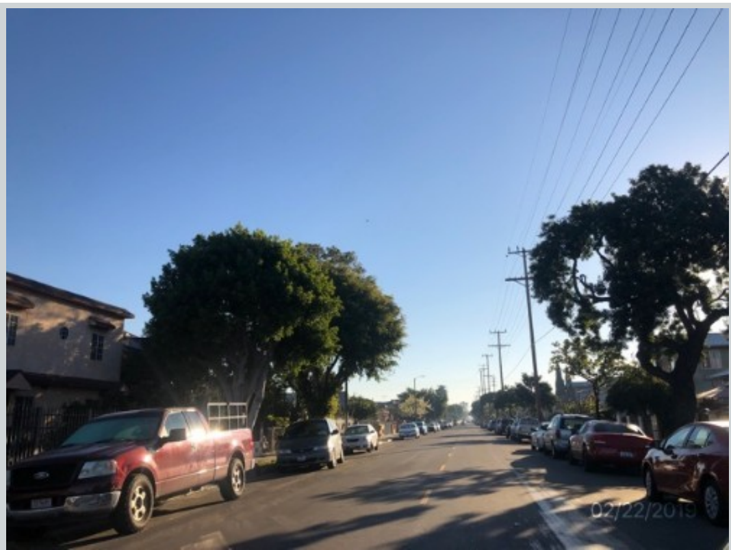
Subject 1186 E 55th St

Address 1186 55th Street, Los Angeles, CA 90011 Loan Number 37103 Suggested List $417,000 Suggested Repaired $417,000 Sale $412,000