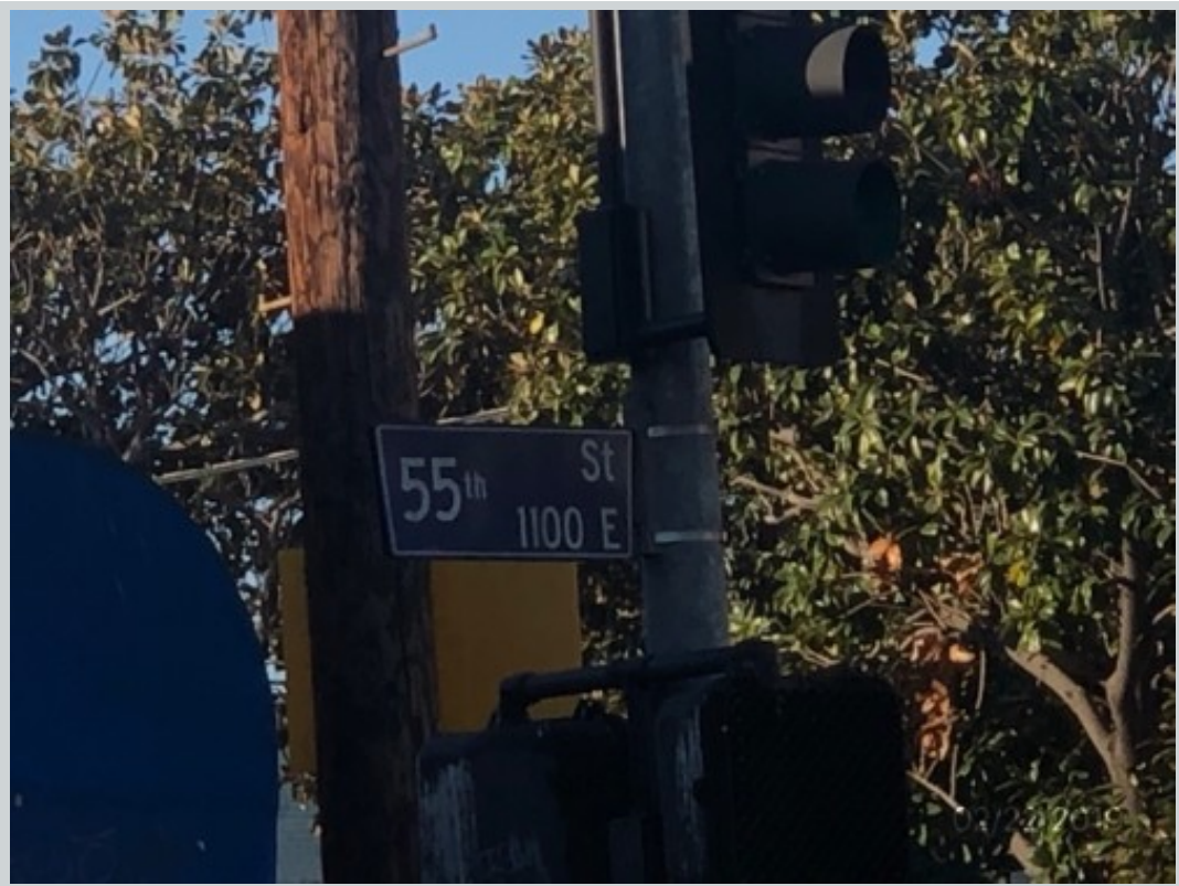
Subject 1186 E 55th St