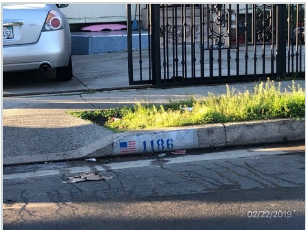
Subject 1186 E 55th St