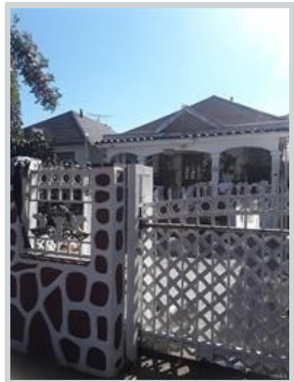
Listing Comp 1 1274 48th St