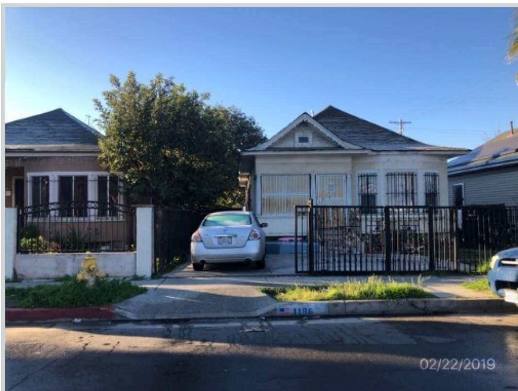
Subject 1186 E 55th St