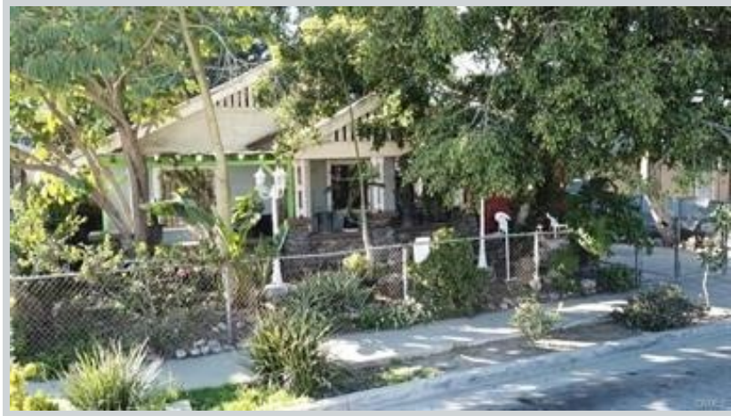
Listing Comp 2 5927 Junction St