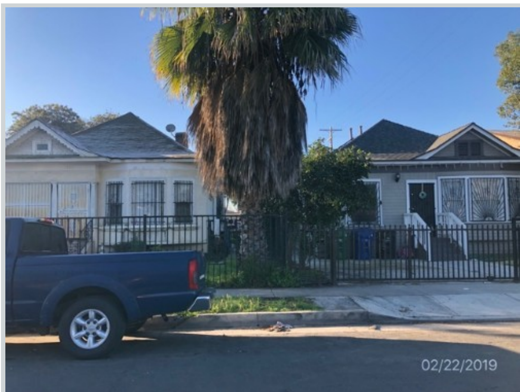
Subject 1186 E 55th St

Address 1186 55th Street, Los Angeles, CA 90011 Loan Number 37103 Suggested List $417,000 Suggested Repaired $417,000 Sale $412,000