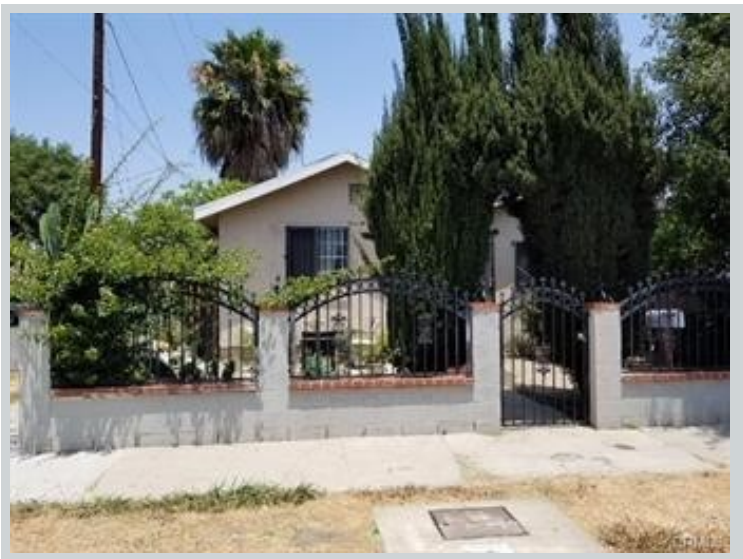
Sold Comp 1 1401 E 50th St View Front

Address 1186 55th Street, Los Angeles, CA 90011 Loan Number 37103 Suggested List $417,000 Suggested Repaired $417,000 Sale $412,000