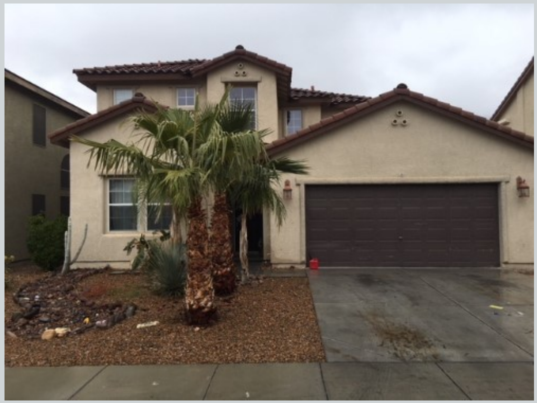
Subject 191 Vine Cliff Ave