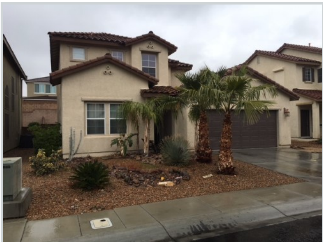
Subject 191 Vine Cliff Ave