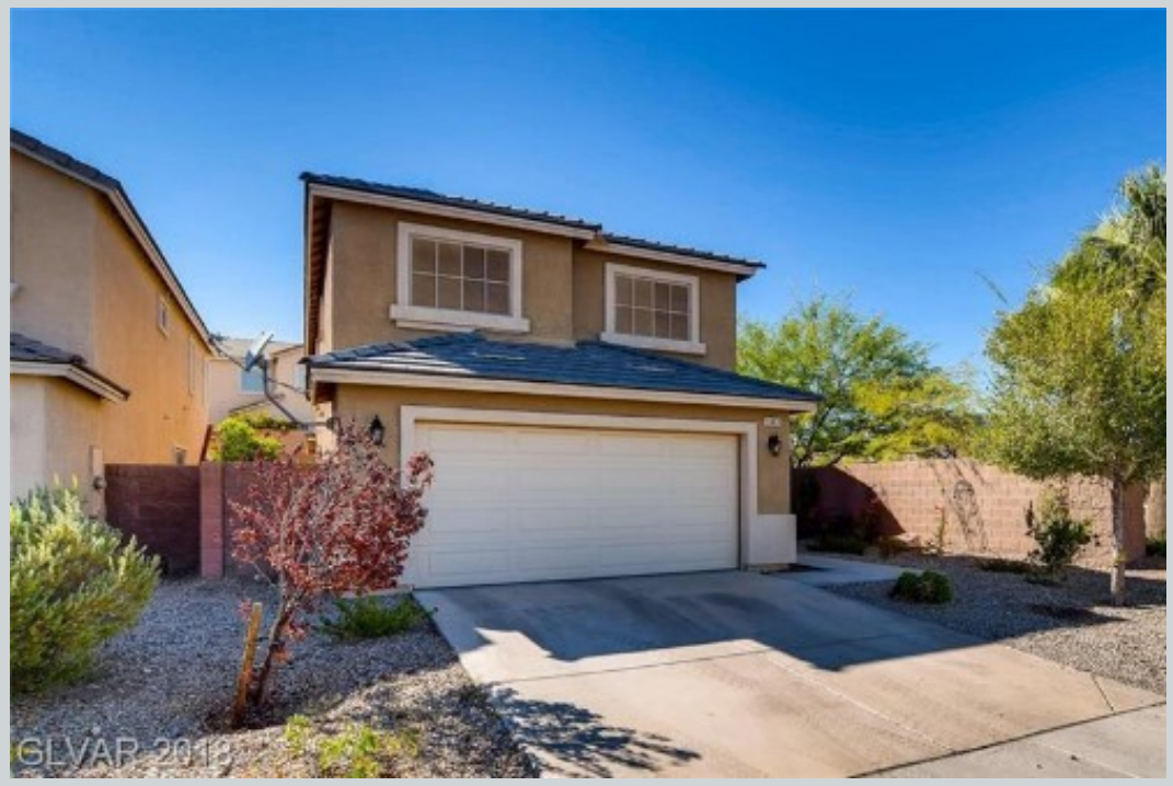
Sold Comp 2 1053 Carson Run