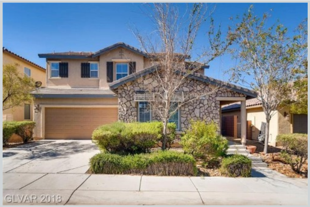
Sold Comp 1 1167 Lake Berryessa