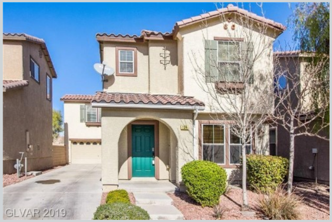
Listing Comp 3 134 Cloud Cover