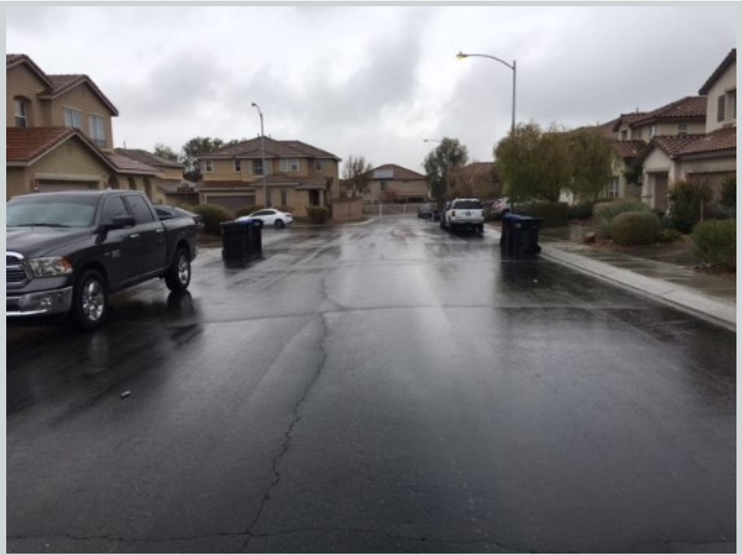
Subject 191 Vine Cliff Ave