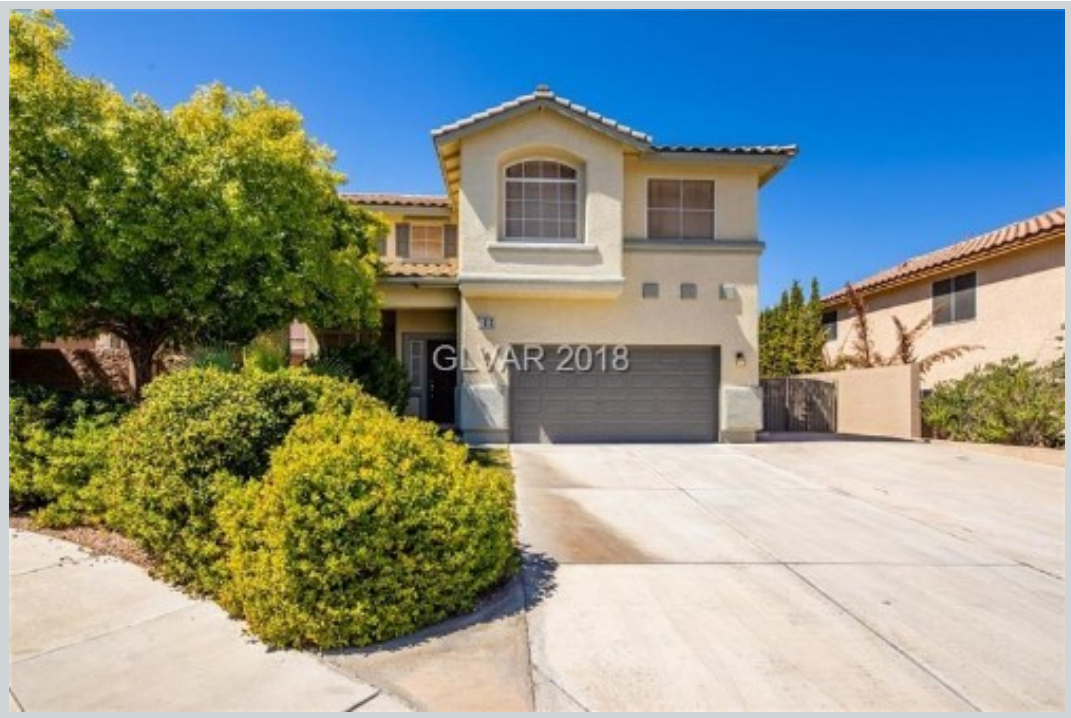
Sold Comp 3 1013 Rocky Coast