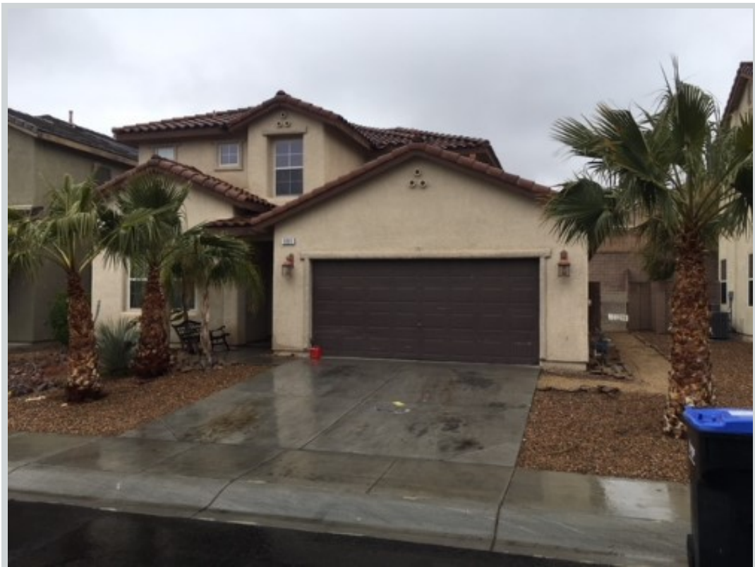
Subject 191 Vine Cliff Ave