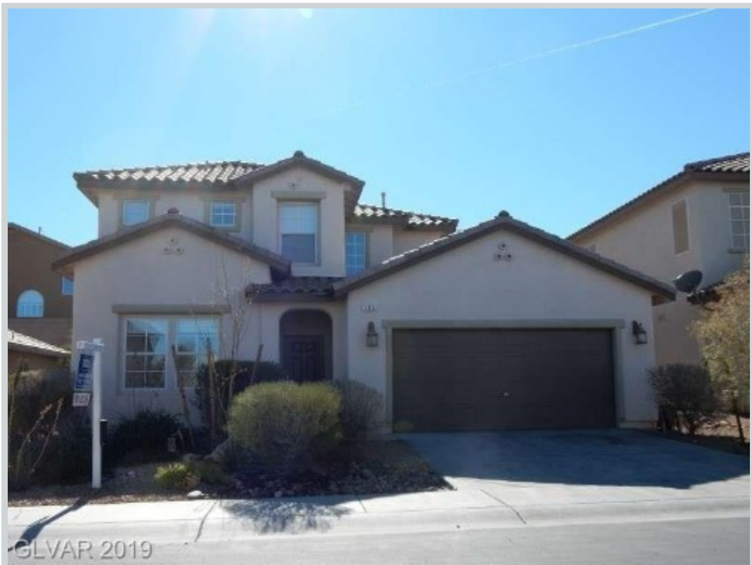
Listing Comp 1 185 Azalea Springs

Address 191 Vine Cliff Avenue, Henderson, NV 89002 Loan Number 37105 Suggested List $329,900 Suggested Repaired $329,900 Sale $319,000