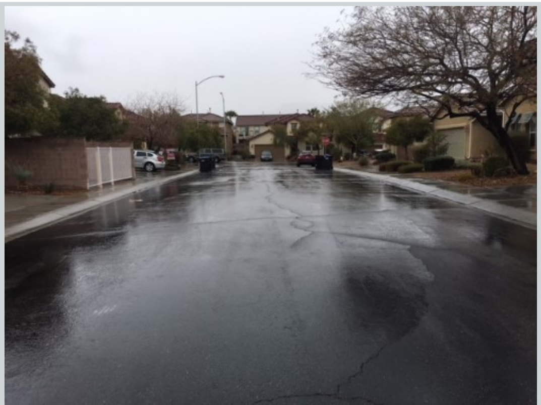
Subject 191 Vine Cliff Ave