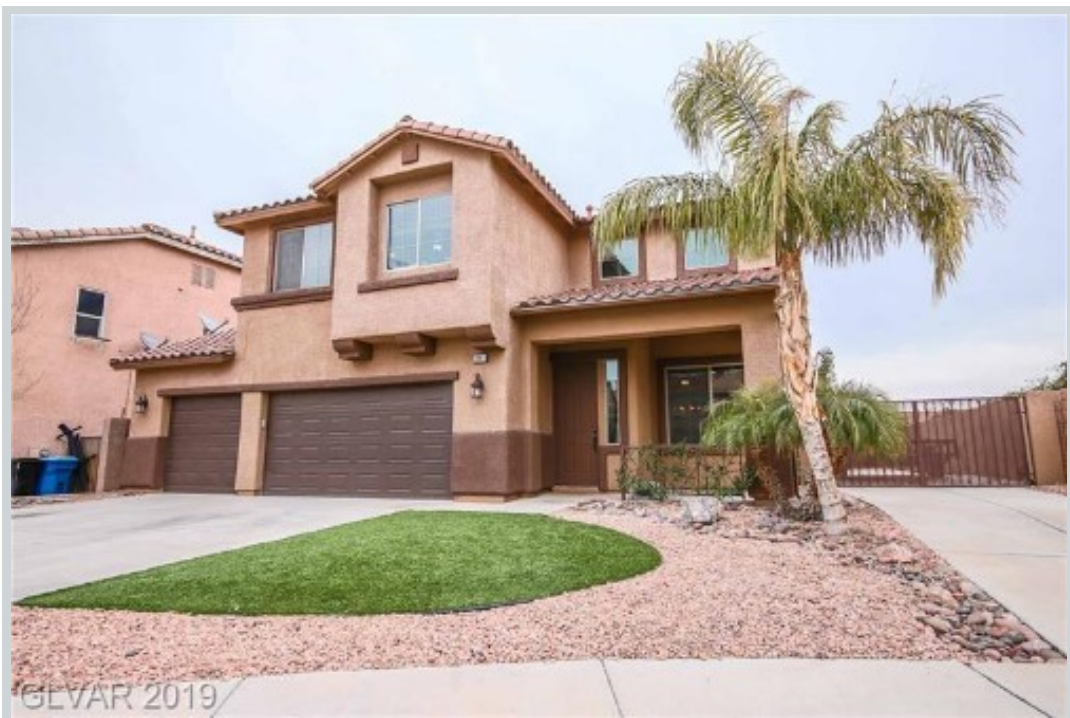
Listing Comp 2 1084 Plantation Rose