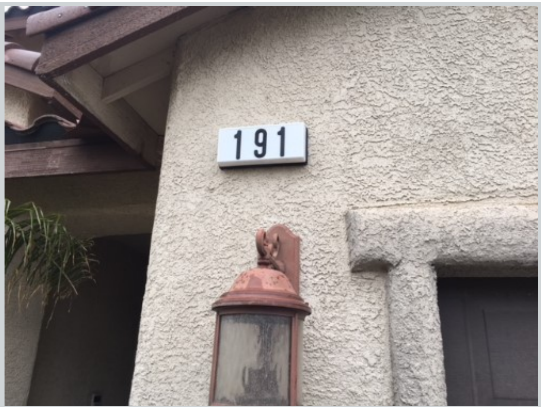
Subject 191 Vine Cliff Ave