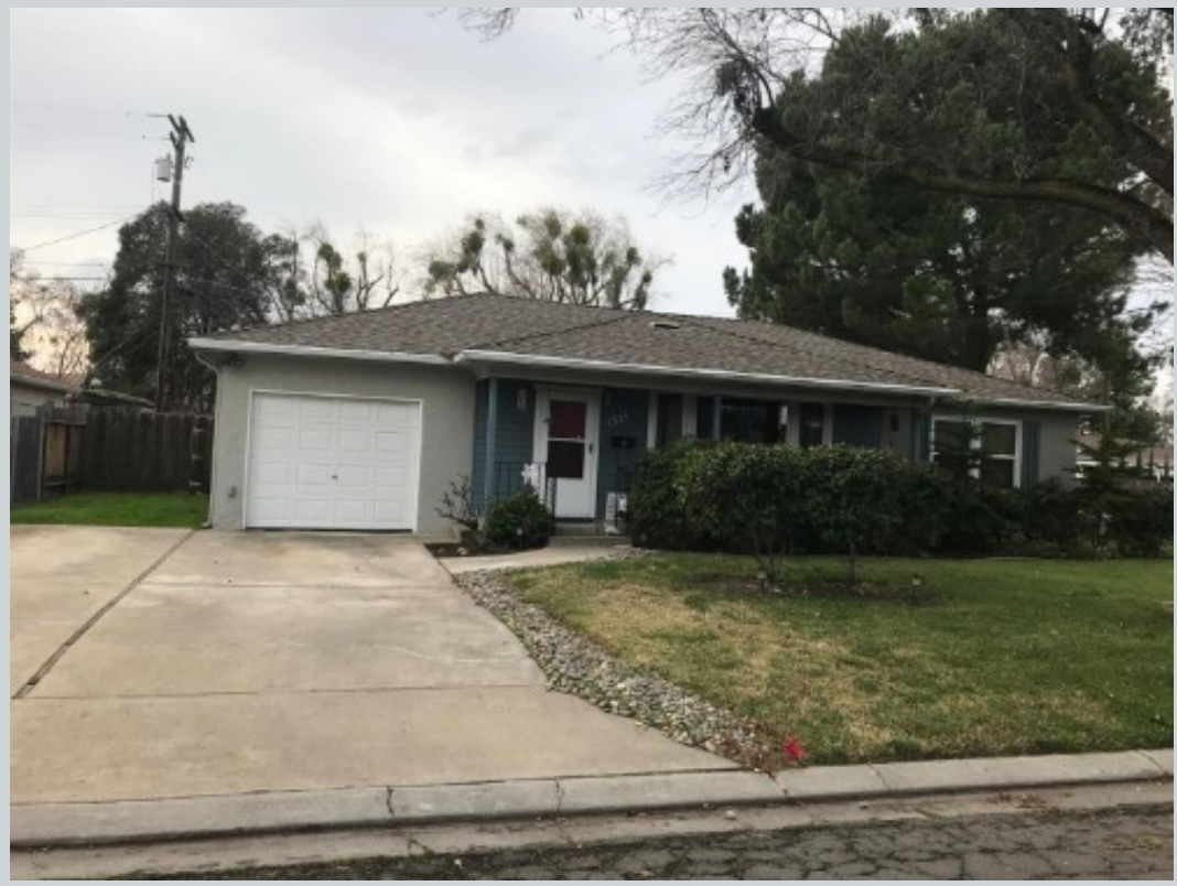
Listing Comp 3 1721 Ruby Ln