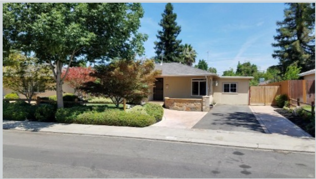
Sold Comp 1 241 Emerson Ave