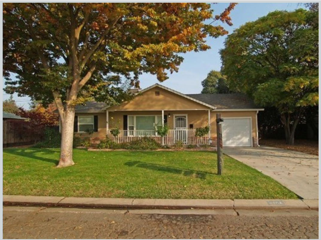
Sold Comp 3 1704 Opal Ave