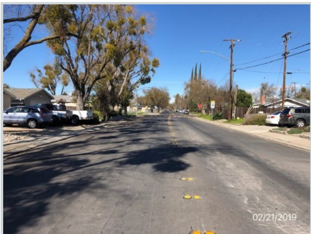
Subject 1916 Sunrise Ave

Address 1916 Sunrise Avenue, Modesto, CA 95350 Loan Number 37108 Suggested List $264,000 Suggested Repaired $264,000 Sale $251,000