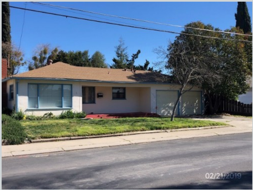
Subject 1916 Sunrise Ave