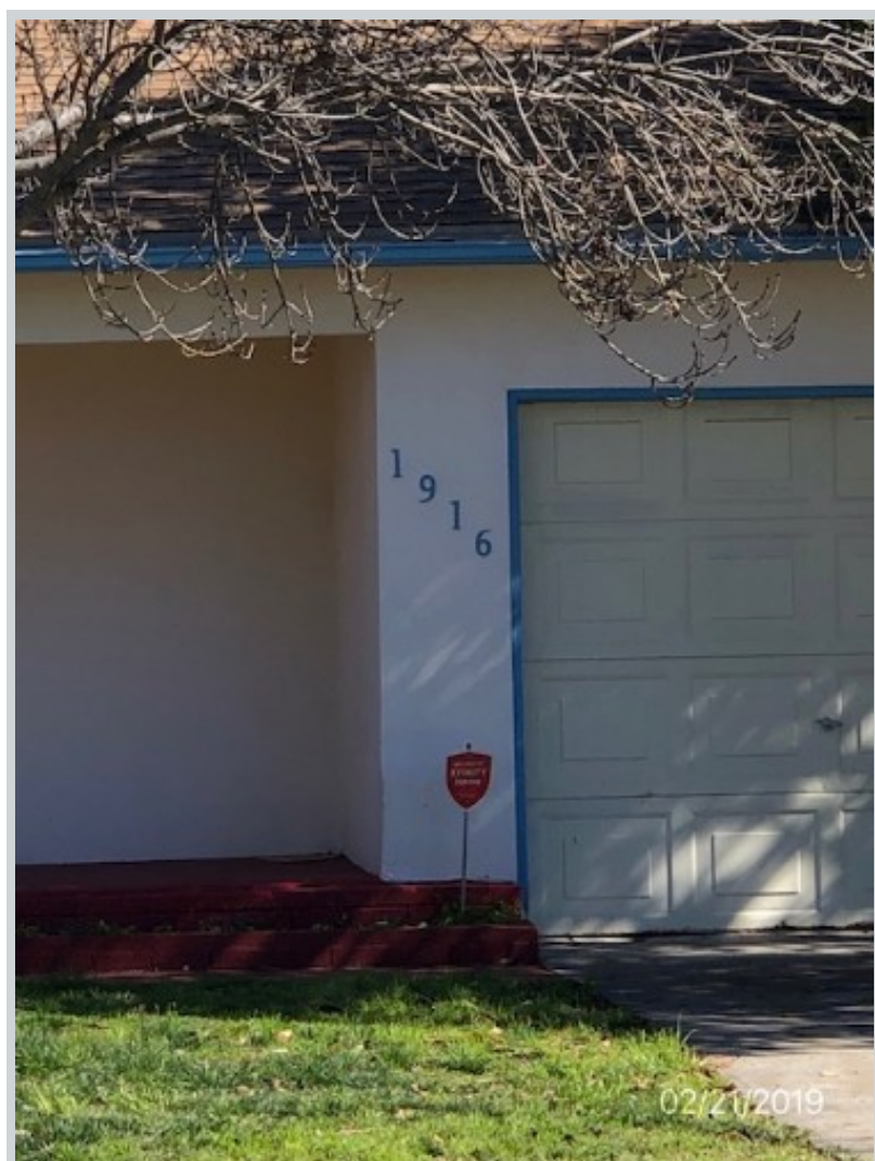
Subject 1916 Sunrise Ave