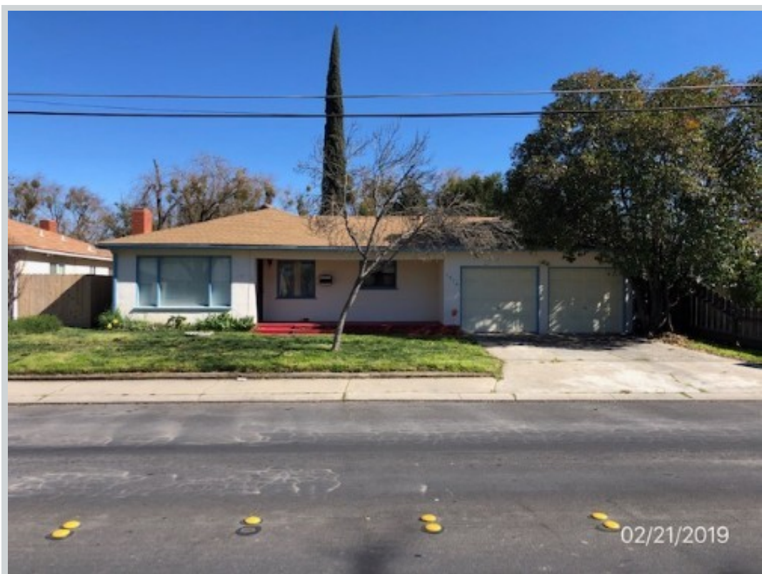
Subject 1916 Sunrise Ave

Address 1916 Sunrise Avenue, Modesto, CA 95350 Loan Number 37108 Suggested List $264,000 Suggested Repaired $264,000 Sale $251,000