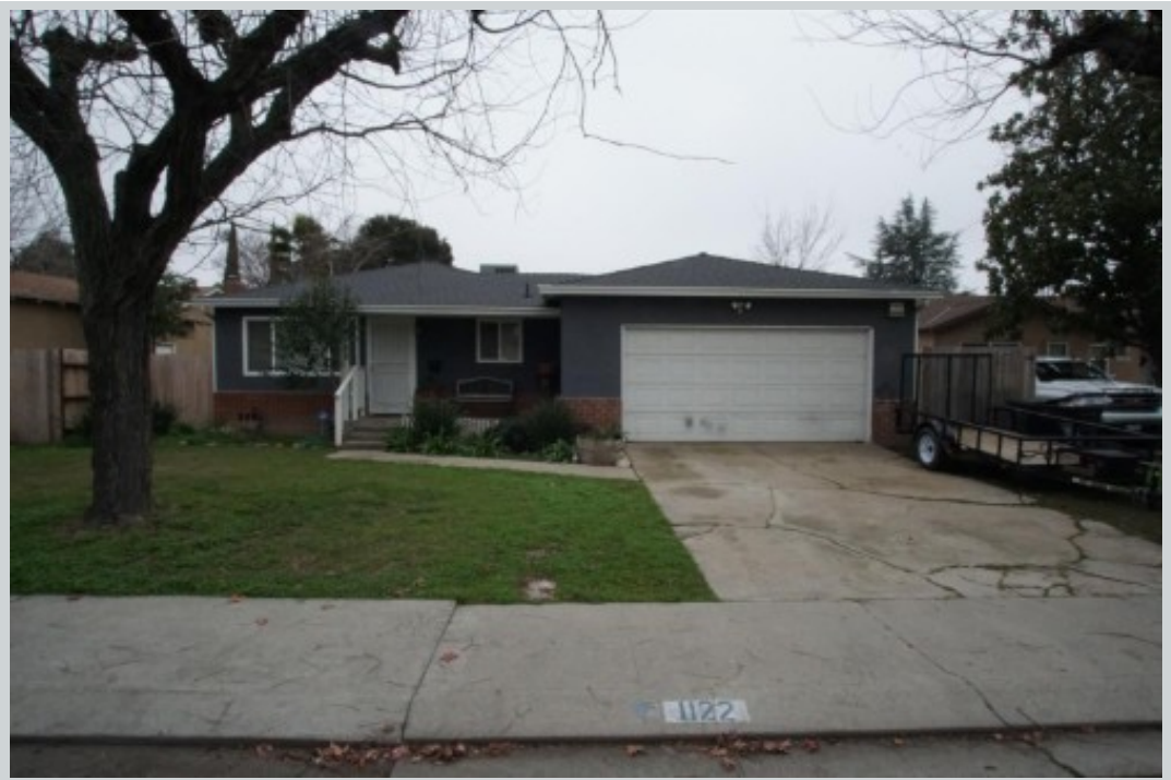
Listing Comp 2 1122 Huntington Dr