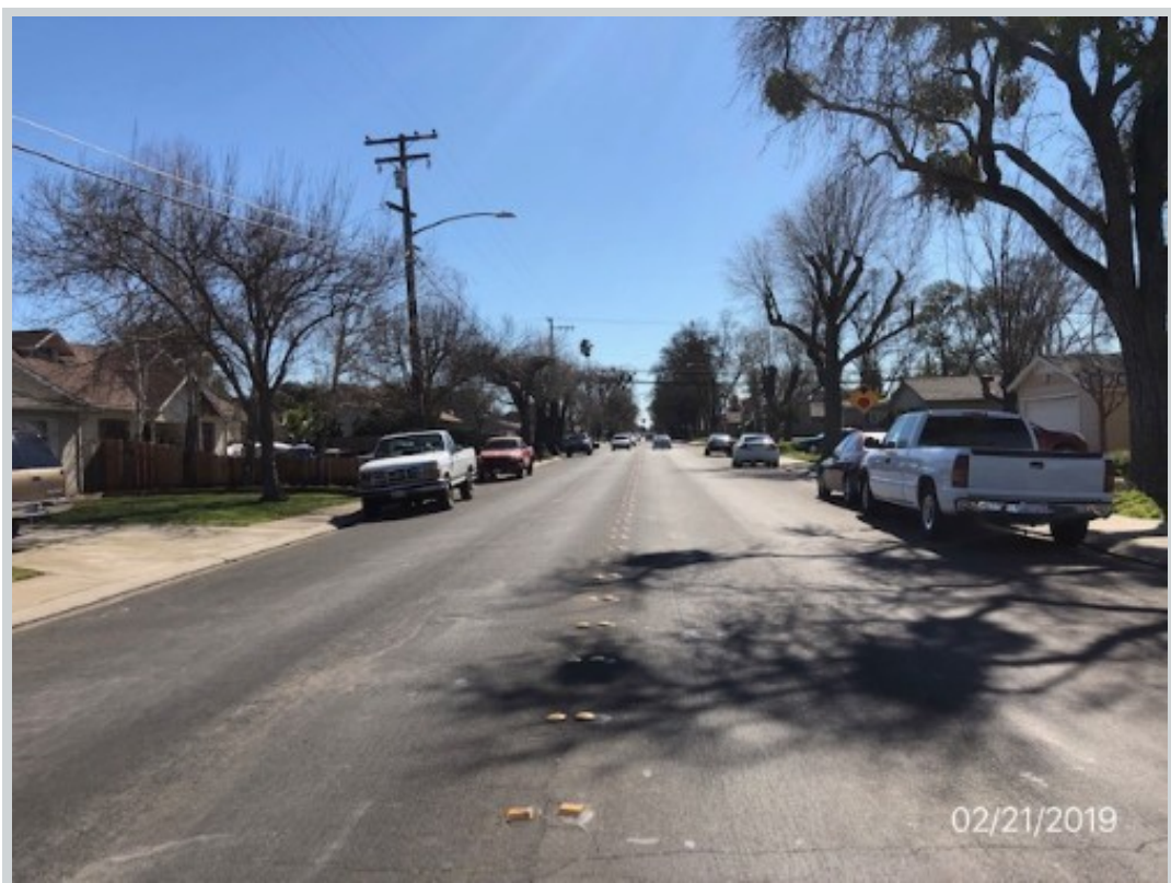
Subject 1916 Sunrise Ave