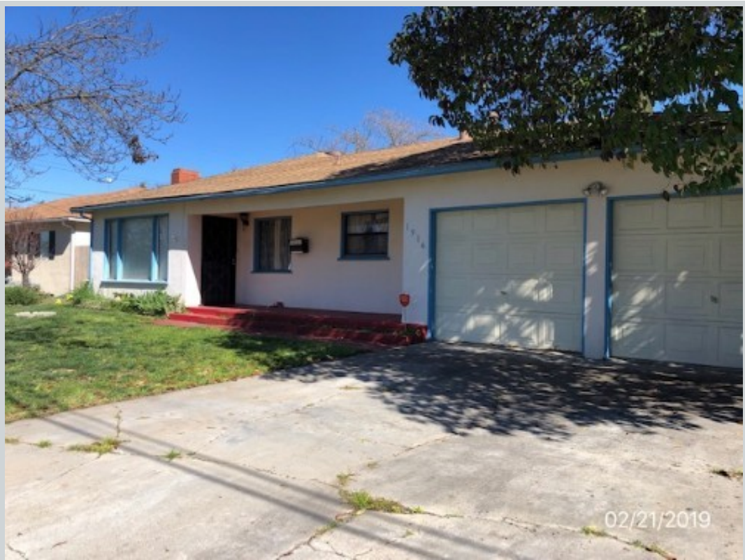
Subject 1916 Sunrise Ave