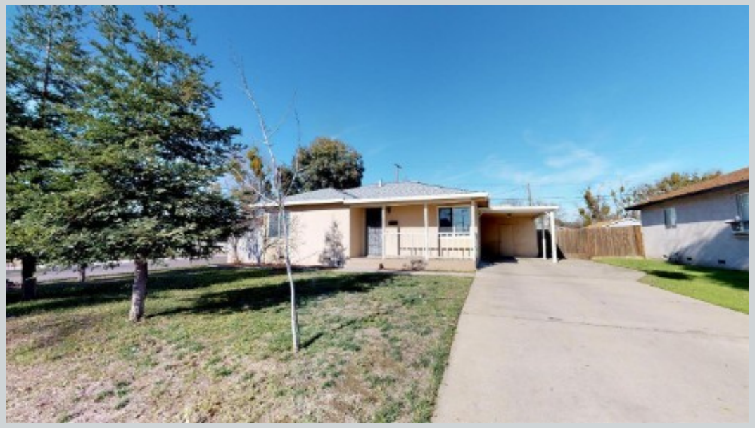
Listing Comp 1 201 Kavanagh Ave