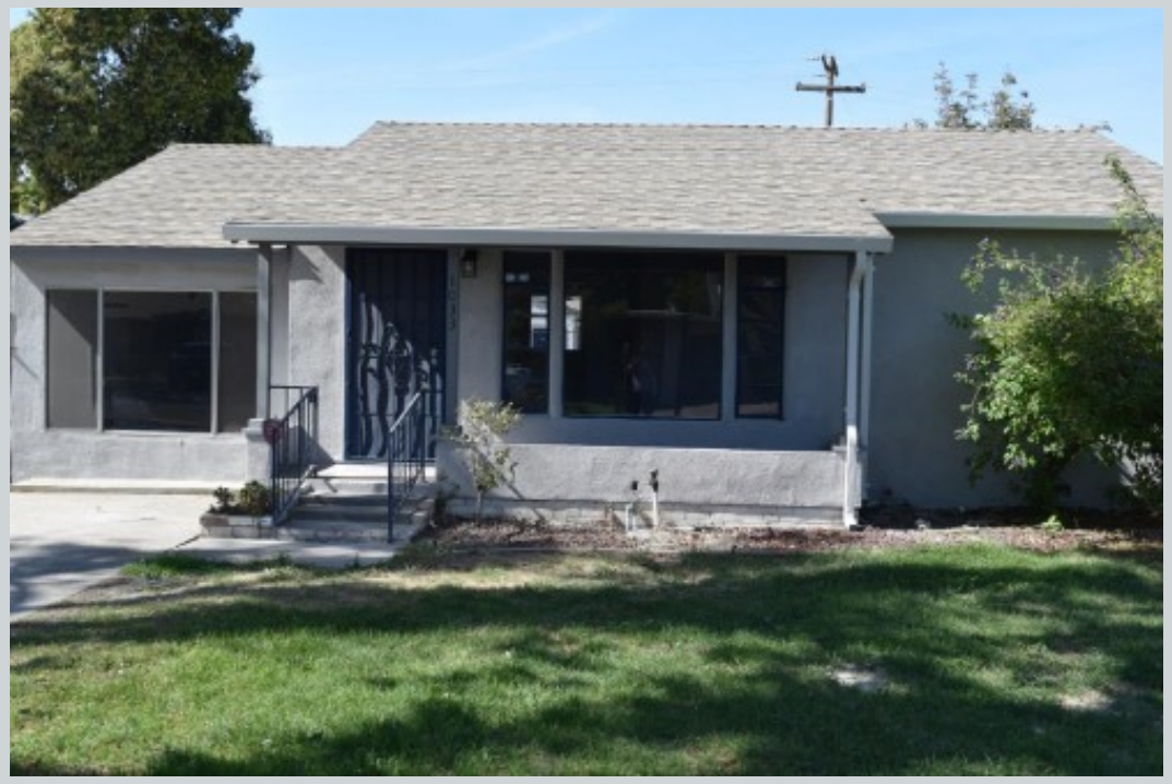
Sold Comp 2 1033 Badgley Dr