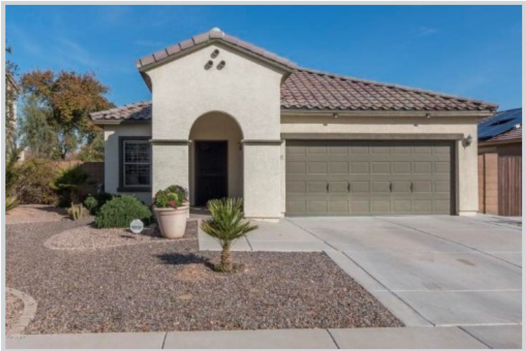
Listing Comp 1 42416 W Arvada Ln