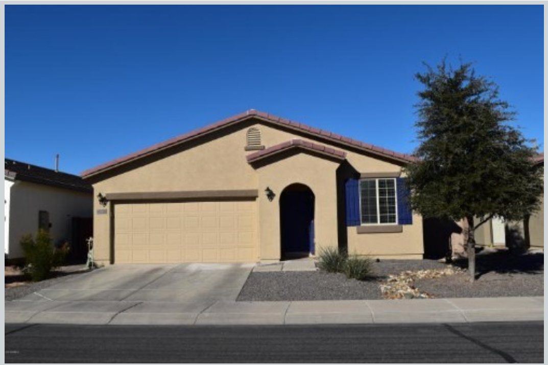
Listing Comp 3 42596 W Santa Fe St