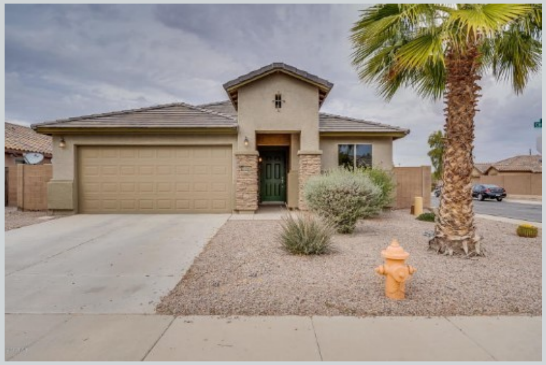
Listing Comp 2 42132 W Cheyenne Dr