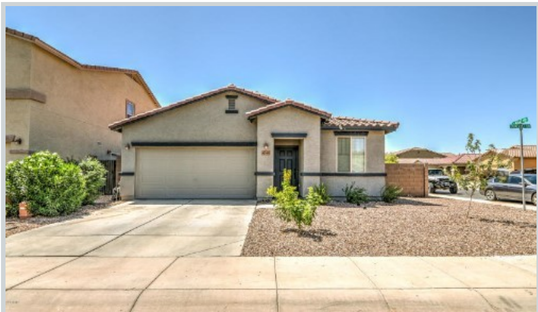
Sold Comp 1 42605 W Somerset Dr

Address 19133 N Ventana Lane, Maricopa, AZ 85138 Loan Number 37118 Suggested List $208,000 Suggested Repaired $208,000 Sale $199,000