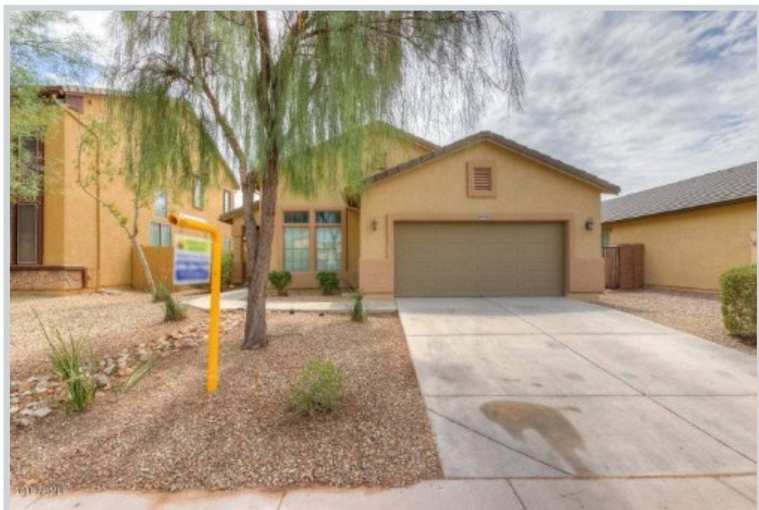
Sold Comp 3 41311 W Barcelona Dr