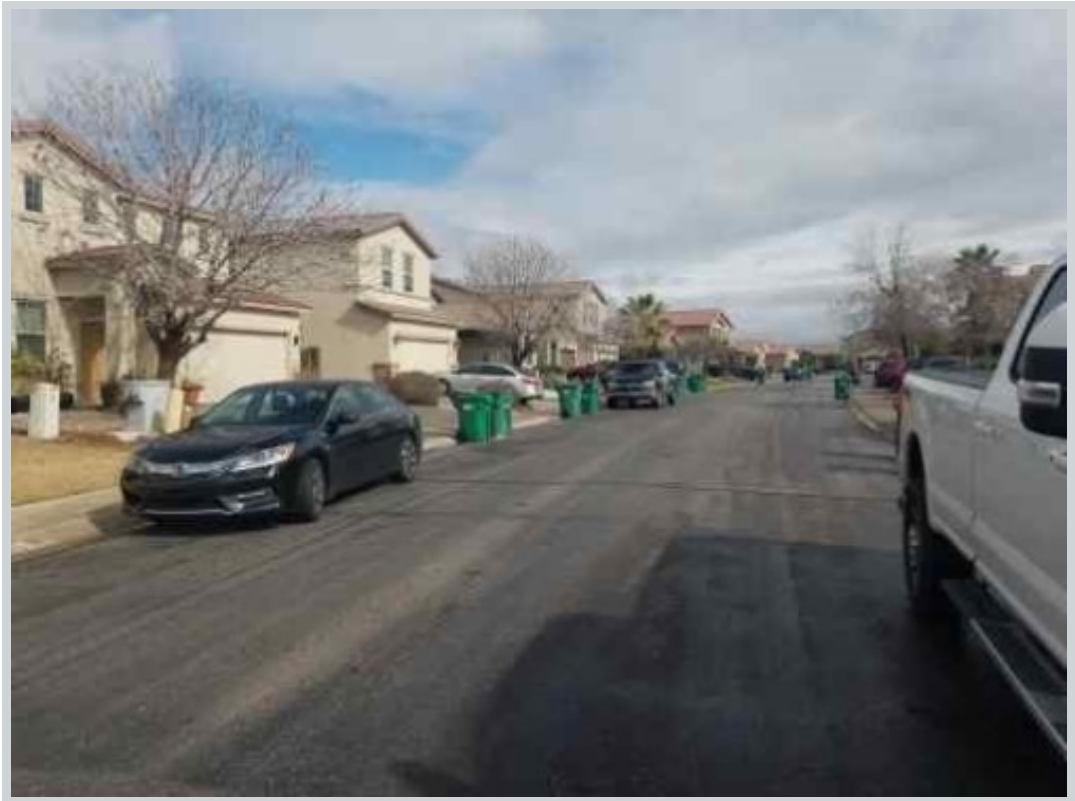
Subject 19133 N Ventana Ln