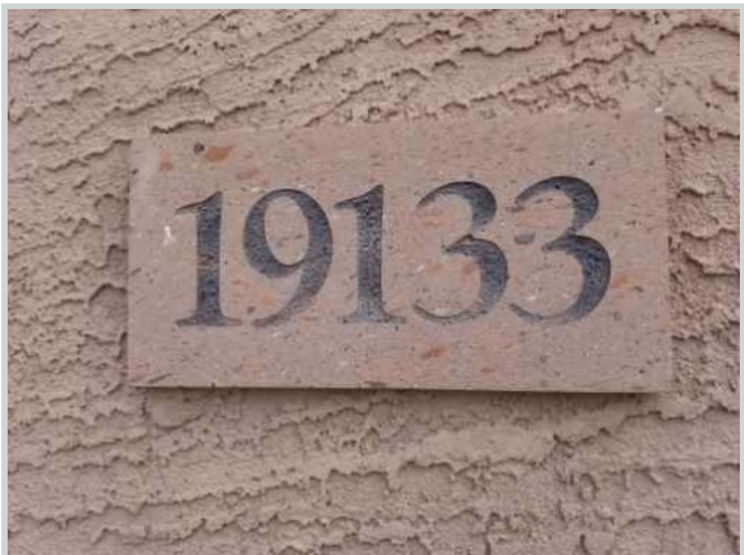
Subject 19133 N Ventana Ln