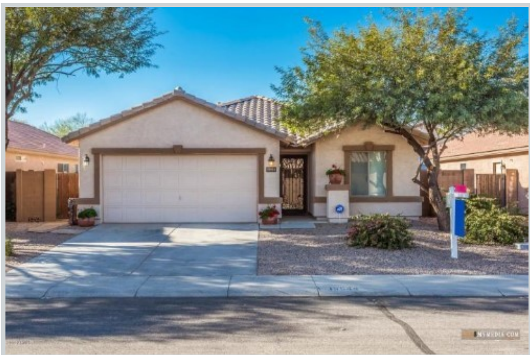
Sold Comp 2 19544 N Falcon Ln