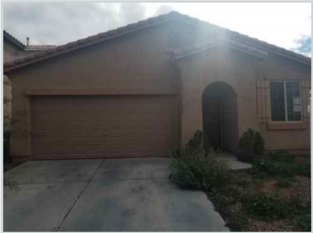
Subject 19133 N Ventana Ln