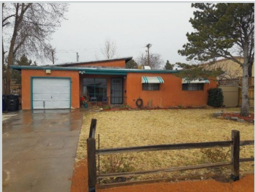
Listing Comp 1 5105 Palo Duro Ave Ne