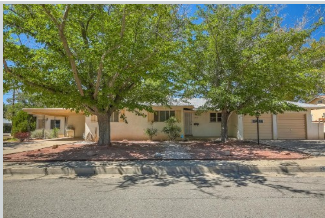
Sold Comp 1 2919 Arizona St Ne