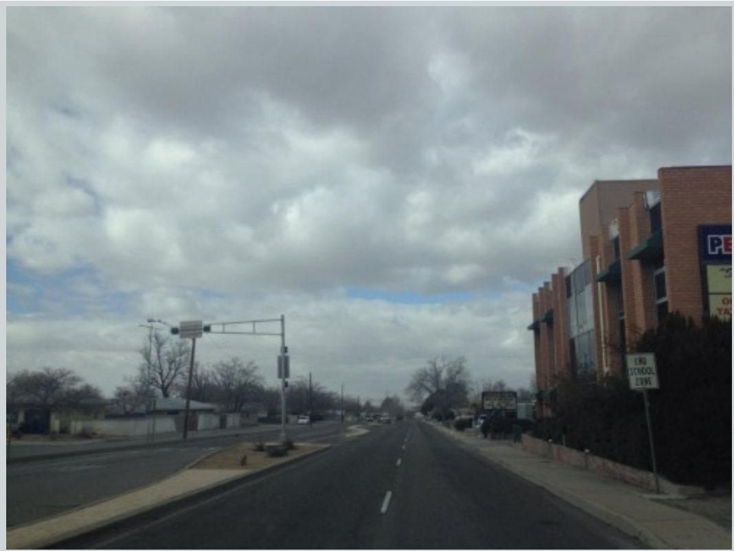
Subject 5917 Candelaria Rd Ne