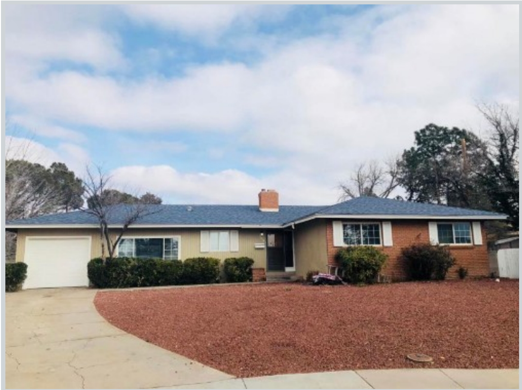
Listing Comp 2 3618 Colorado Ct Ne