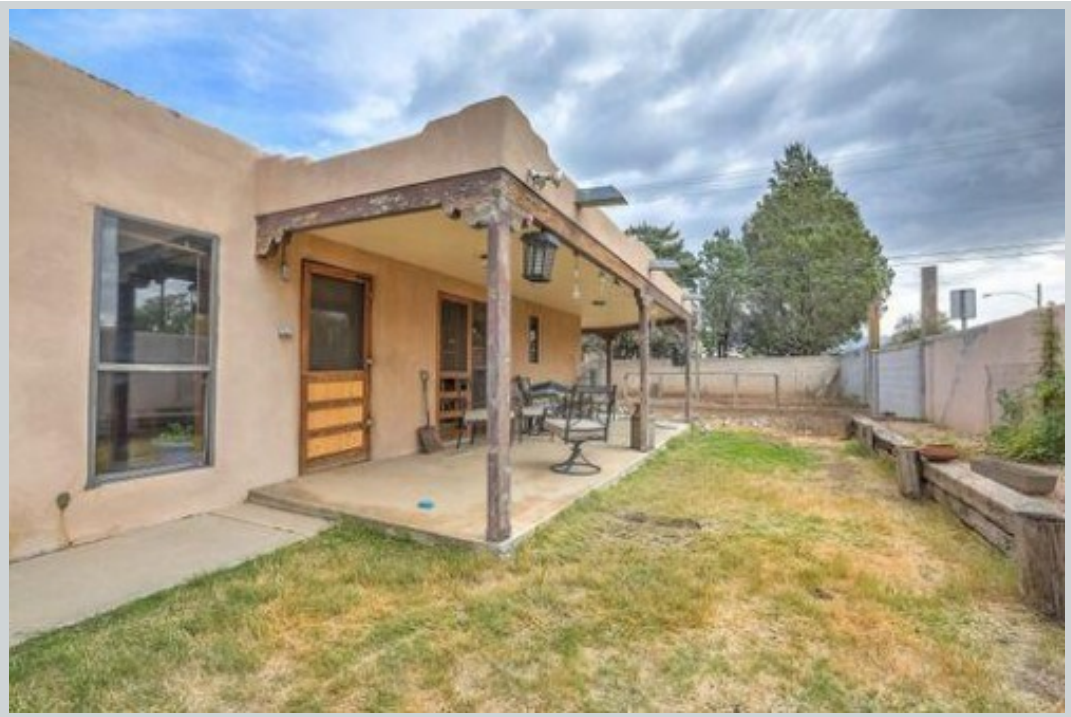
Sold Comp 3 3002 Quincy St Ne