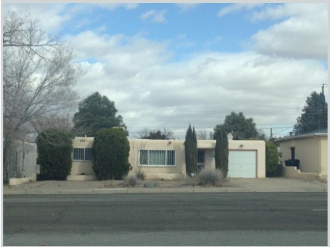
Subject 5917 Candelaria Rd Ne