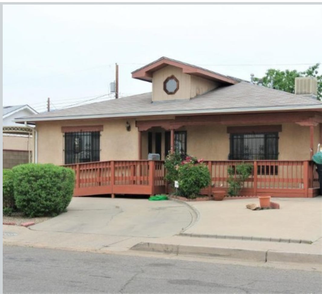
Sold Comp 2 3328 La Veta Dr Ne