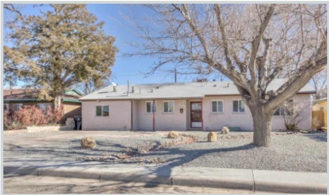
Listing Comp 3 2704 Espanola St Ne