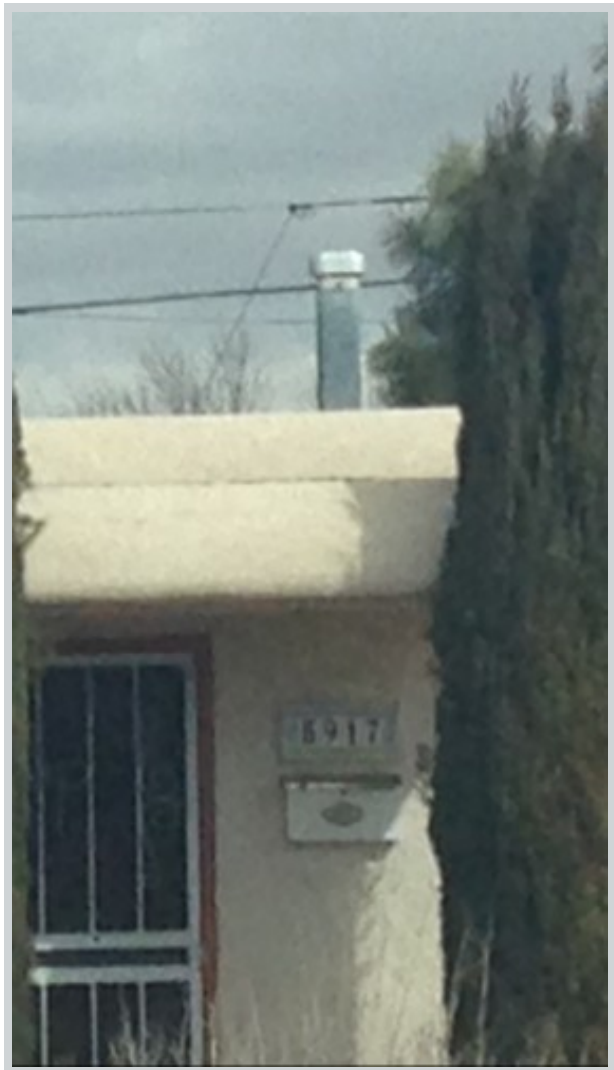
Subject 5917 Candelaria Rd Ne