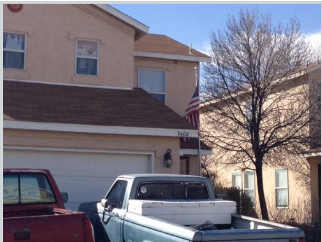
Subject 9404 Alvera Ct Sw