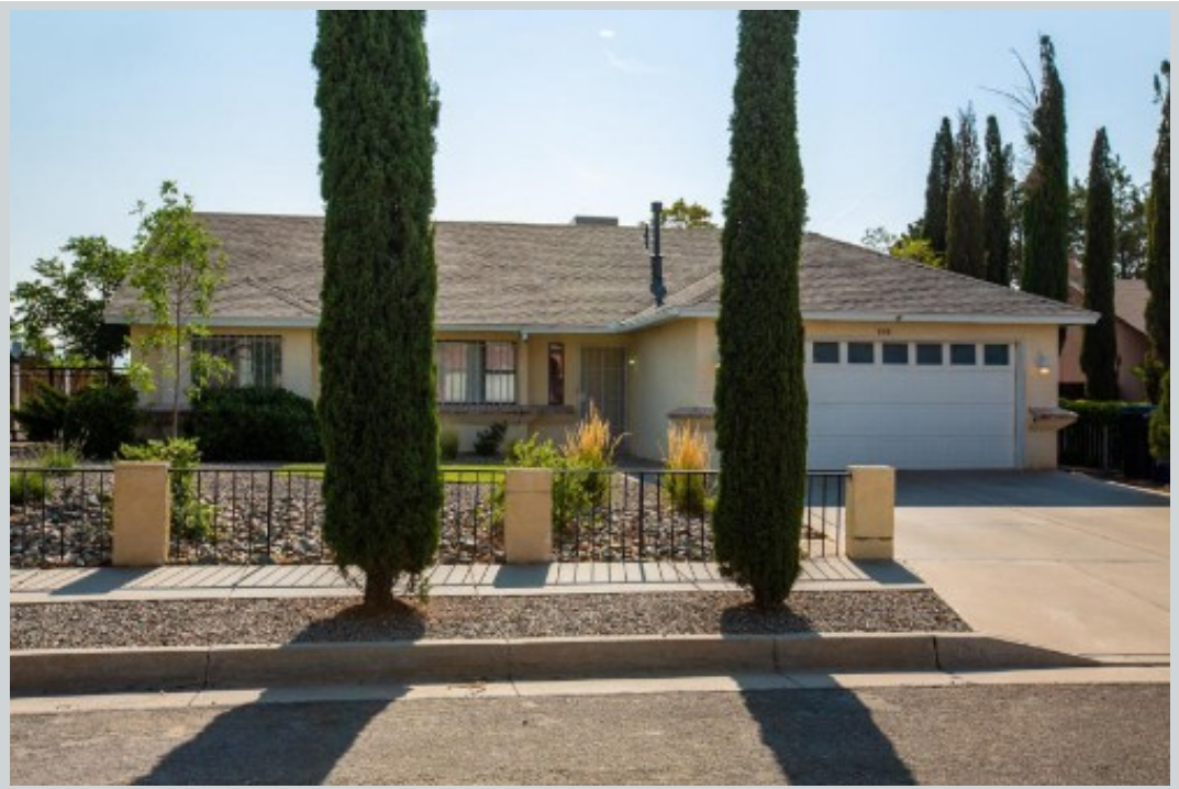
Sold Comp 2 900 Sunbird Rd Sw