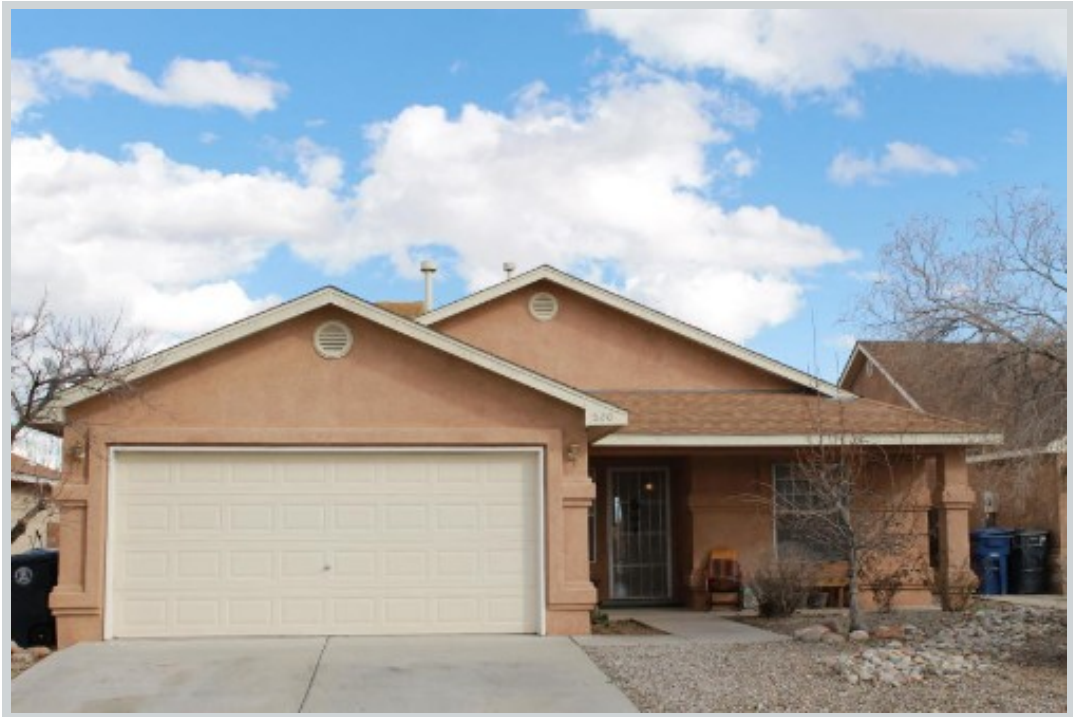
Listing Comp 2 520 Mayfair Pl Sw