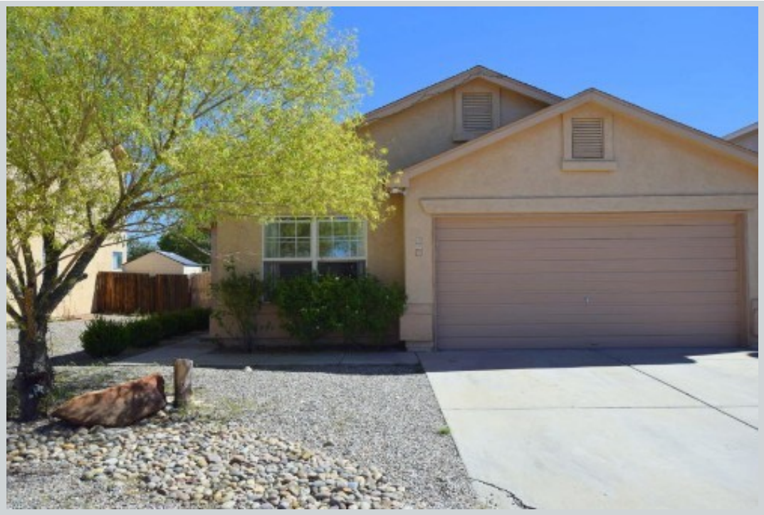
Sold Comp 3 828 Terracotta Pl Sw