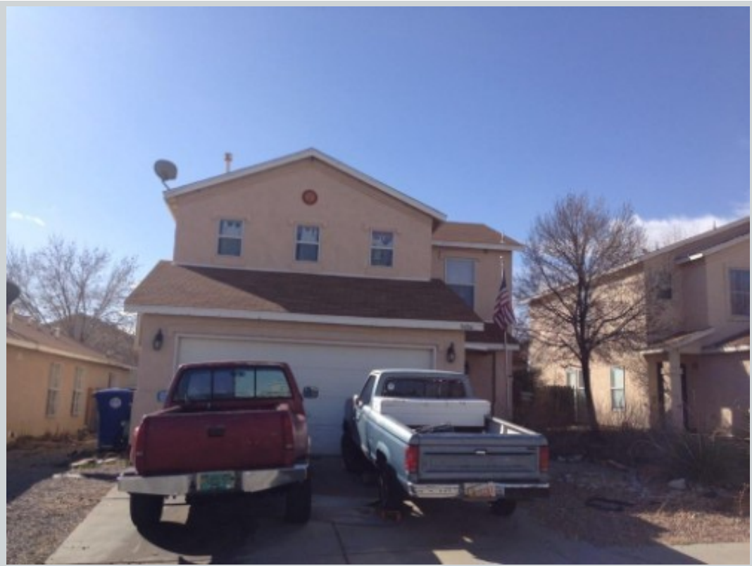
Subject 9404 Alvera Ct Sw