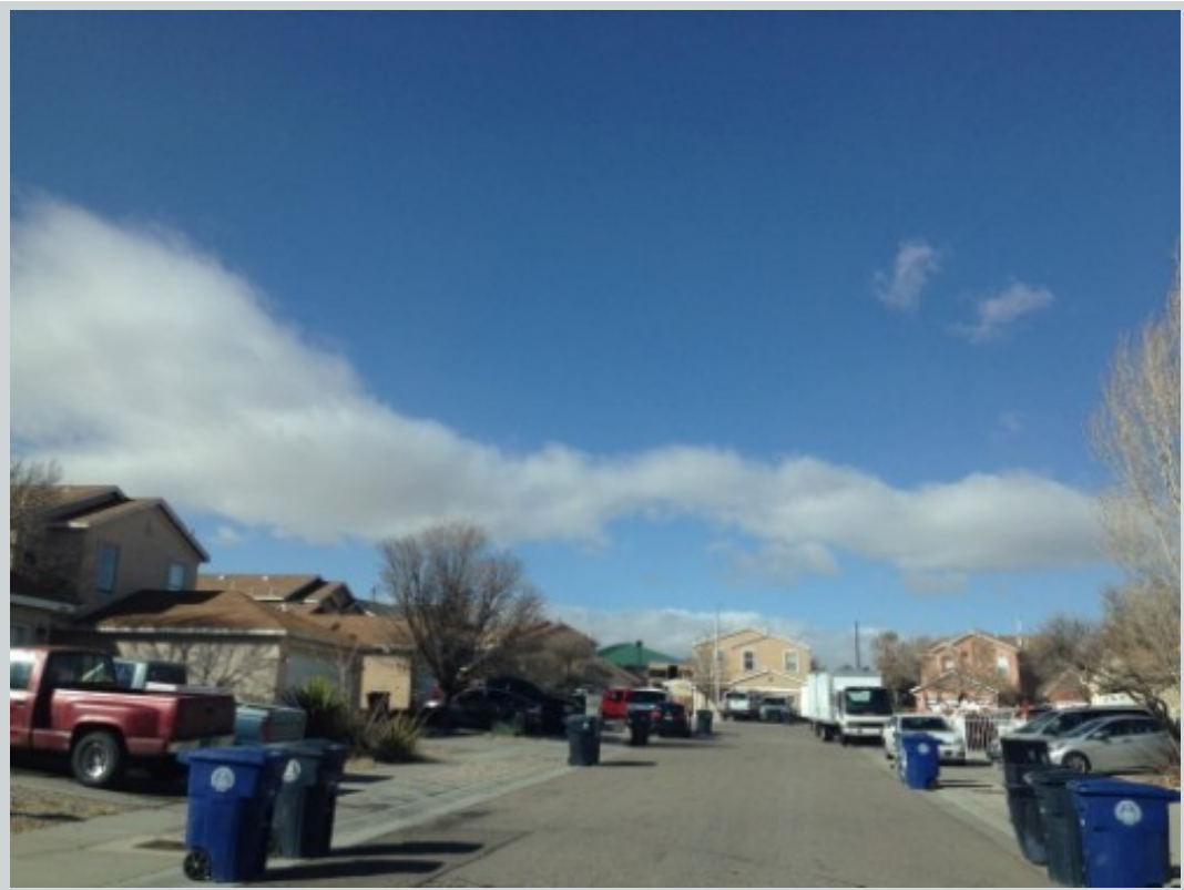
Subject 9404 Alvera Ct Sw