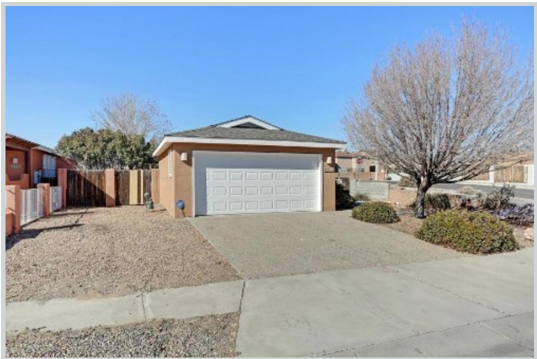
Listing Comp 3 501 Mayfair Pl Sw