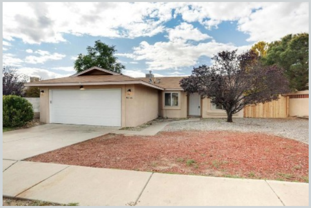
Sold Comp 1 9116 Sunbow Ave Sw