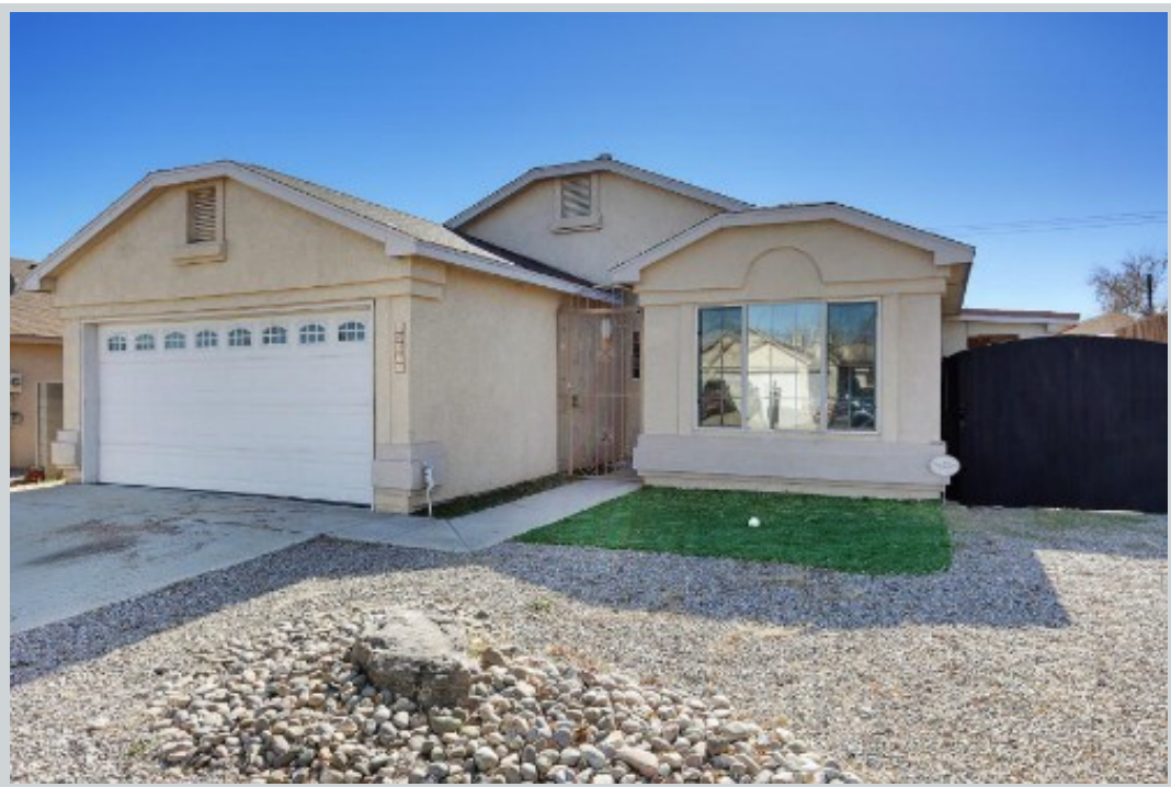
Listing Comp 1 10224 Andalusian Ave Sw