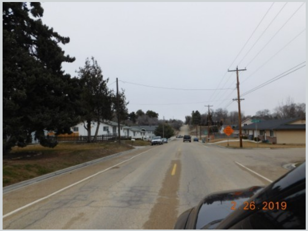
Subject 217 N Indiana Ave