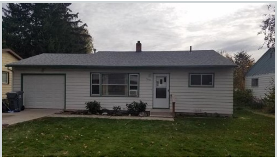
Sold Comp 2 1916 Terrace Dr