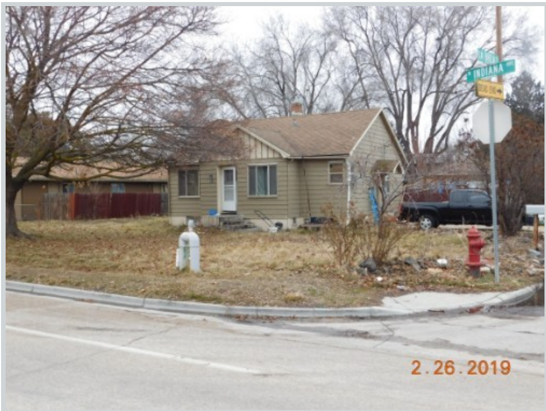
Subject 217 N Indiana Ave

Address 217 N Indiana Avenue, Caldwell, IDAHO 83605 Loan Number 37143 Suggested List $137,000 Suggested Repaired $137,000 Sale $135,000