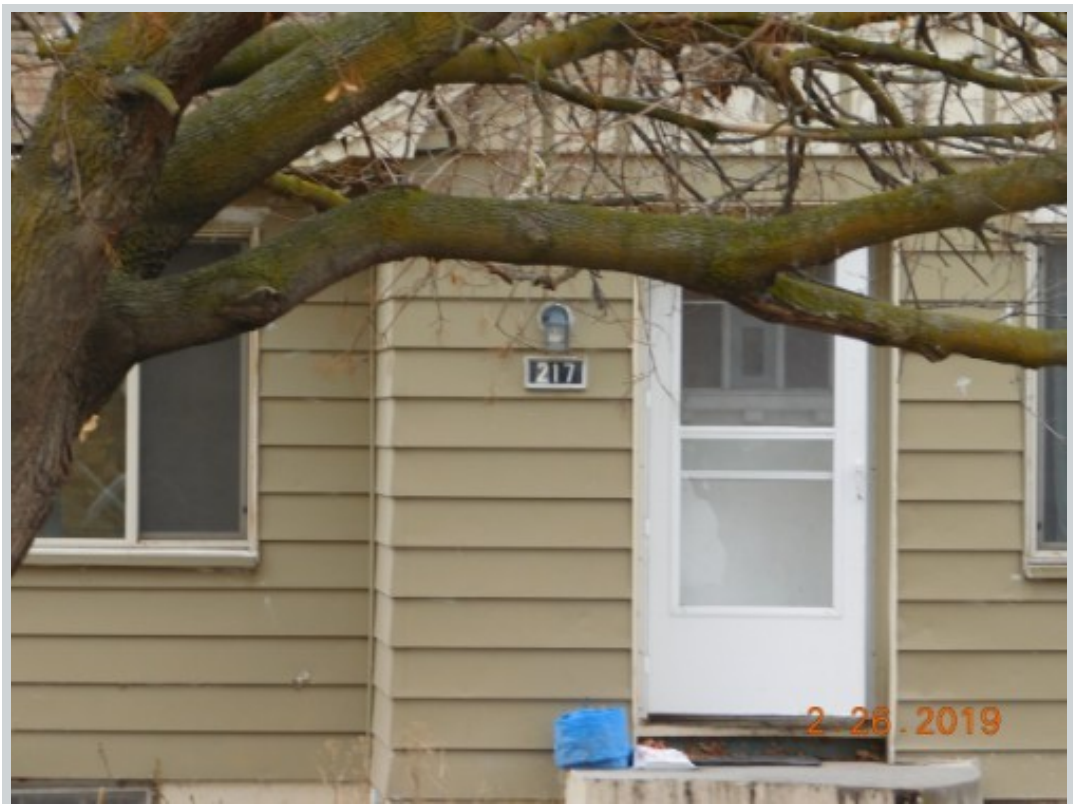
Subject 217 N Indiana Ave