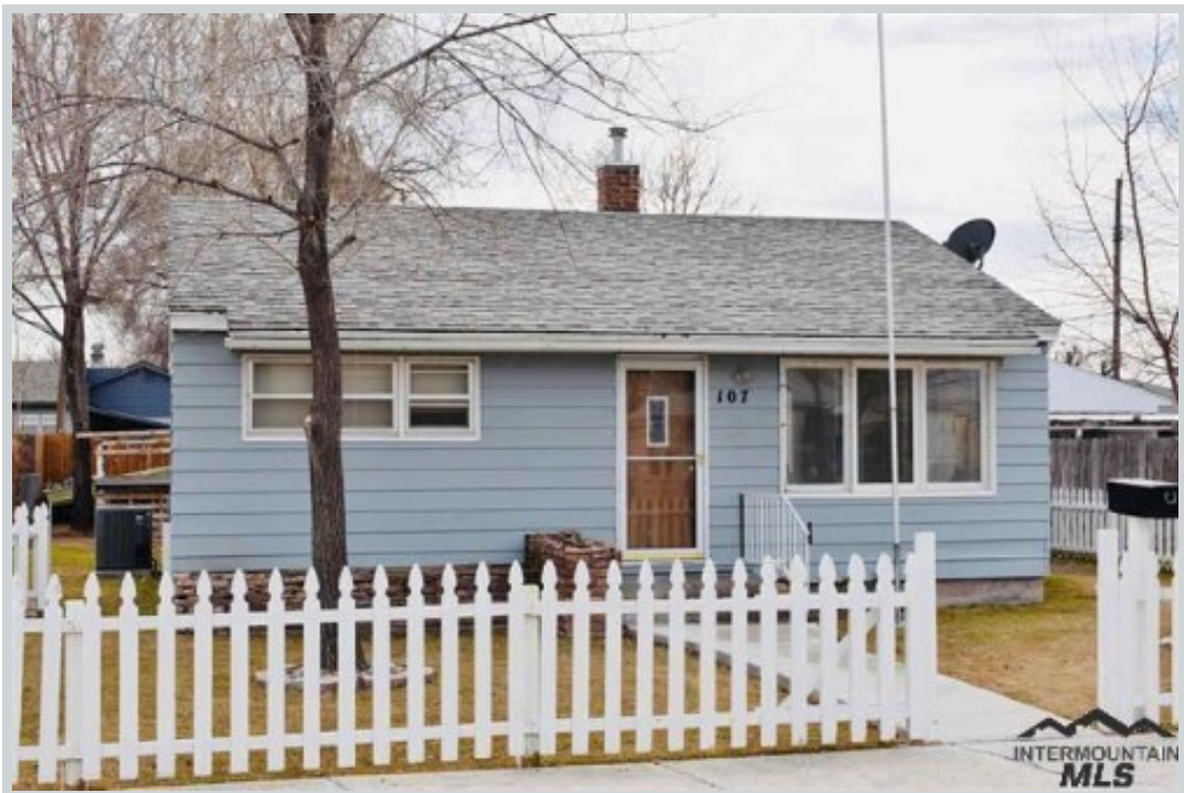
Listing Comp 2 107 Parkhurst Ave