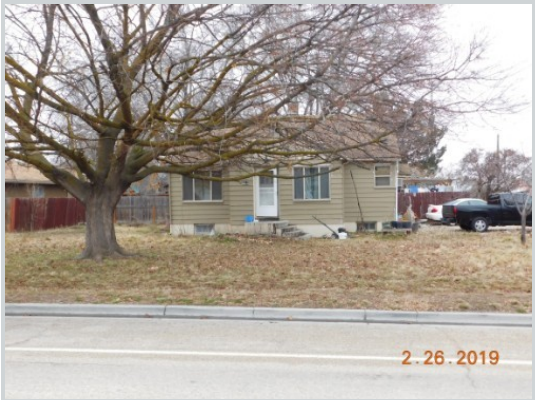
Subject 217 N Indiana Ave