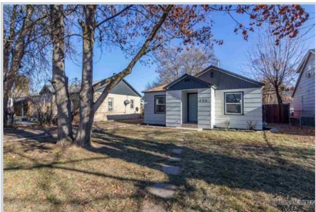
Sold Comp 3 1922 Lnasing Ave