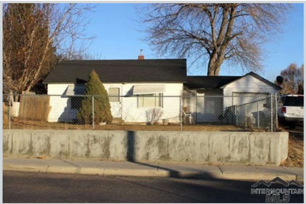
Listing Comp 1 1602 N Illinois Ave