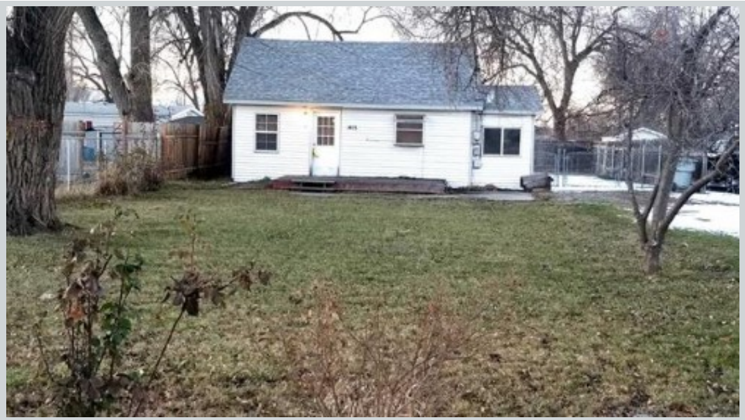
Sold Comp 1 1415 Lury Ln