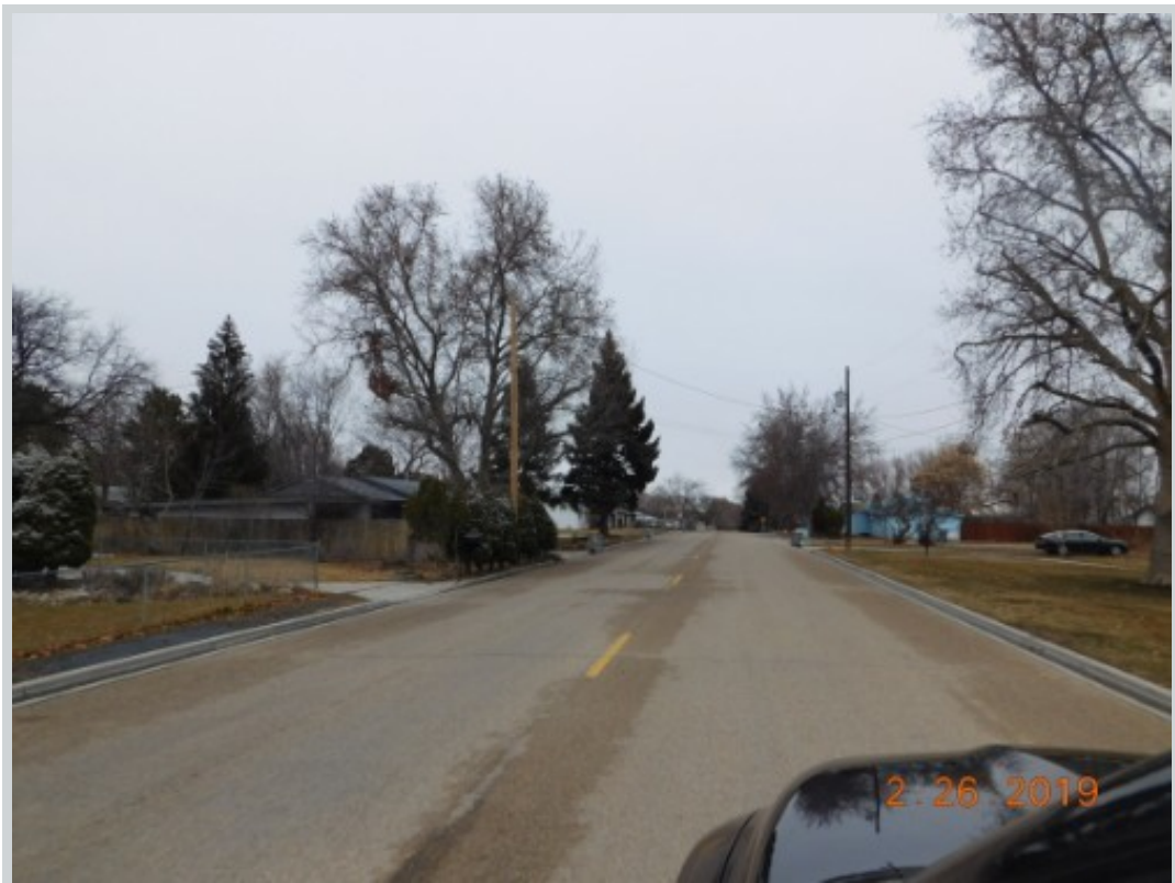
Subject 217 N Indiana Ave