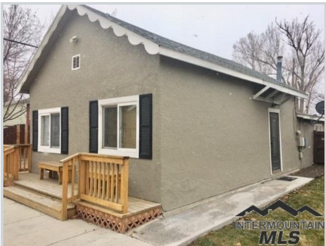
Listing Comp 3 512 N Kimball Ave