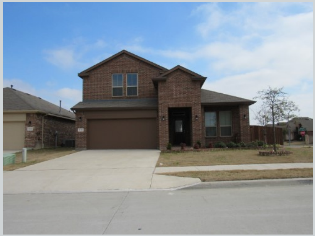
Subject 14100 Rabbit Brush Ln