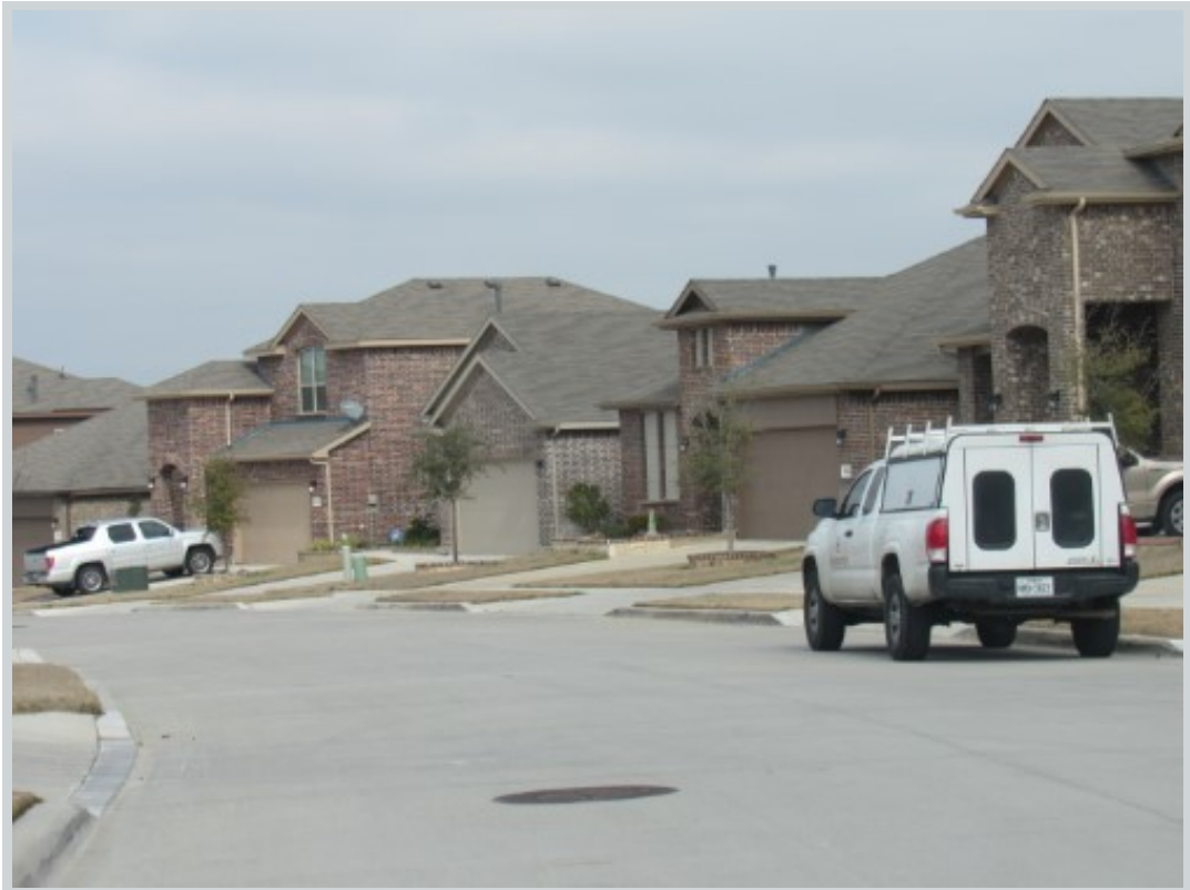
Subject 14100 Rabbit Brush Ln