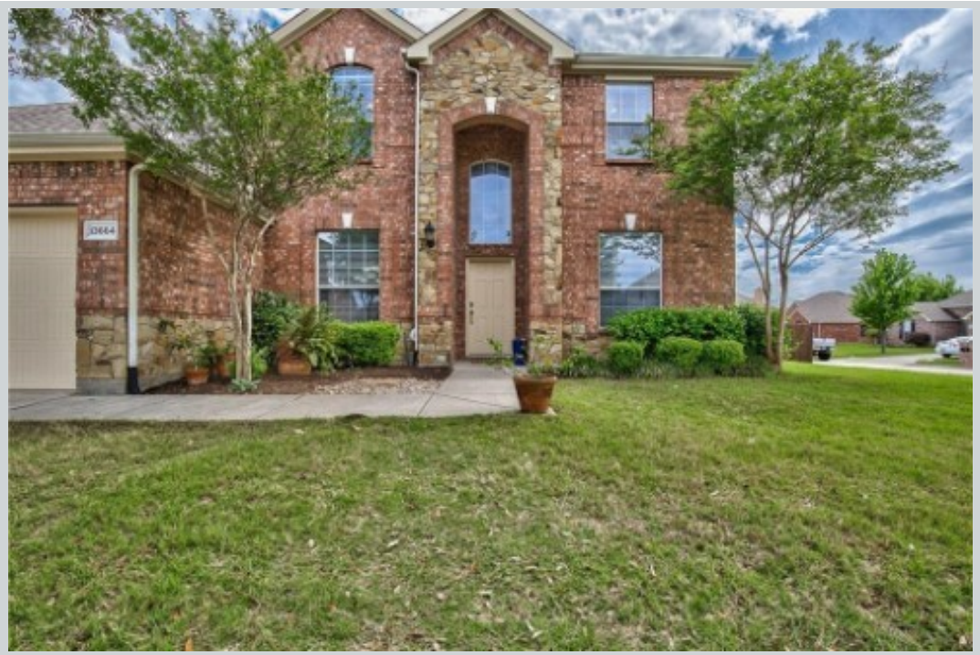
Sold Comp 1 13664 Saddlewood Drive