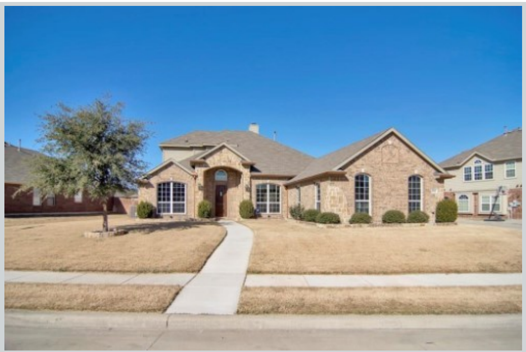
Sold Comp 2 1612 Suncatcher Way