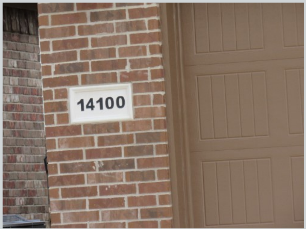
Subject 14100 Rabbit Brush Ln