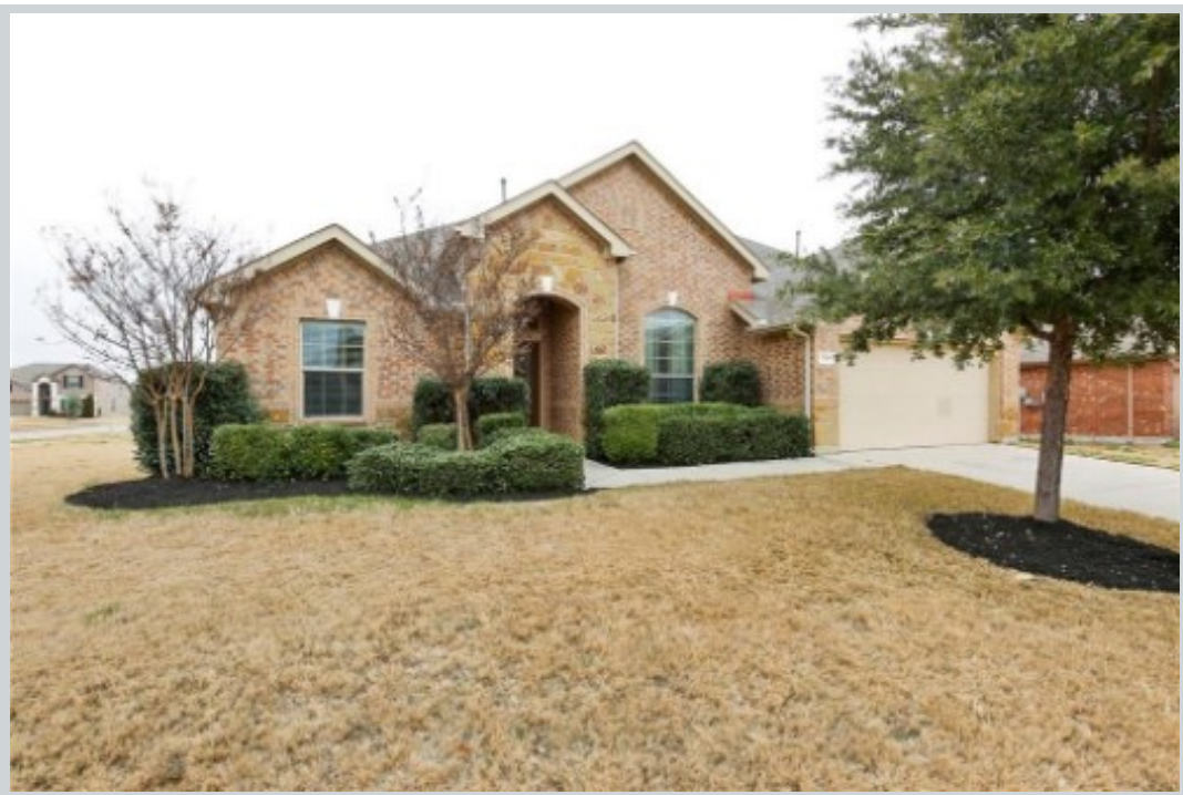
Listing Comp 3 1524 Enchanted Sky Lane