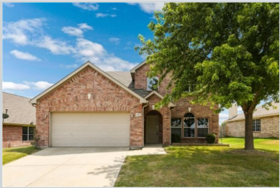
Listing Comp 2 1413 Dun Horse Drive