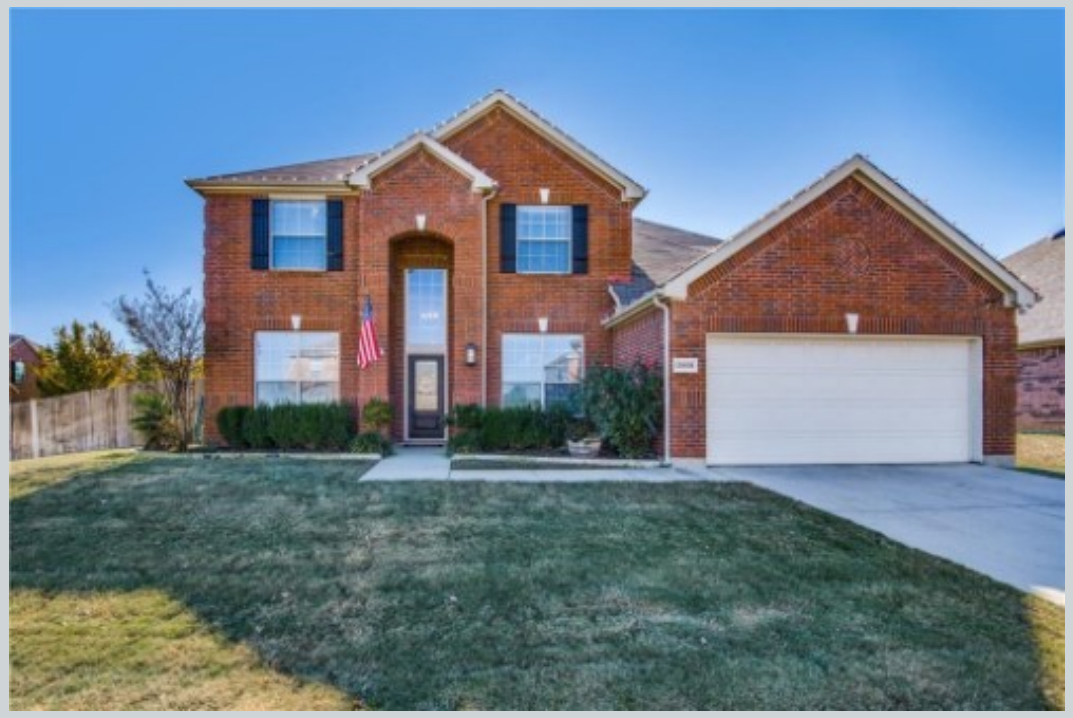
Sold Comp 3 13801 Ranch Horse Run