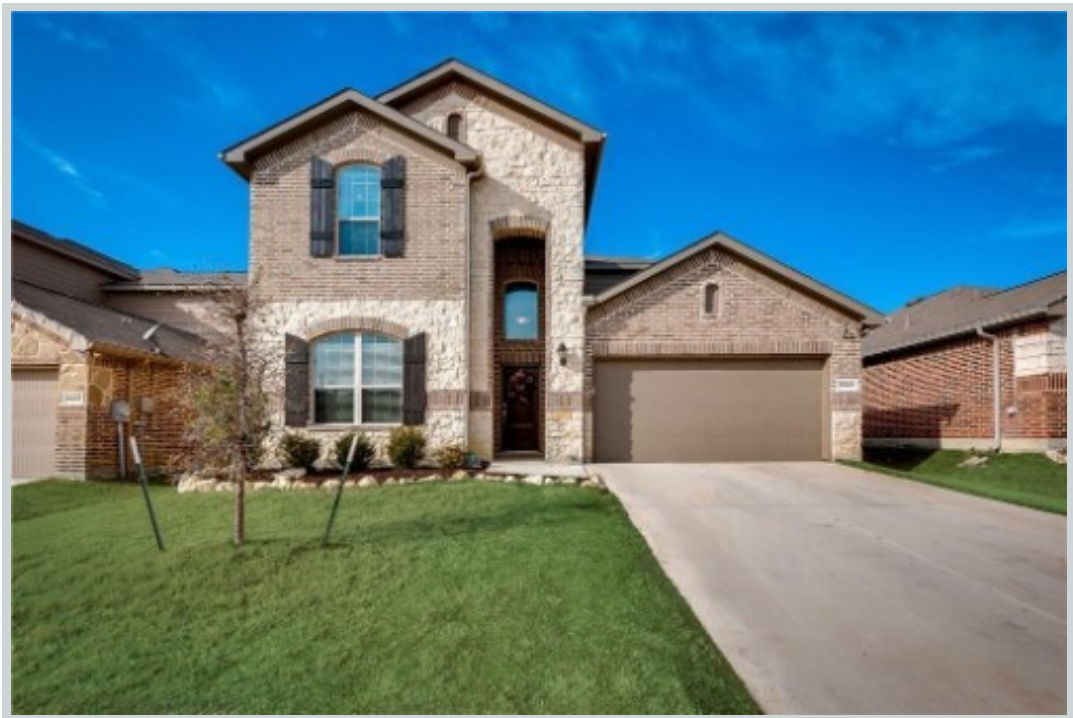
Listing Comp 1 14321 Broomstick Road