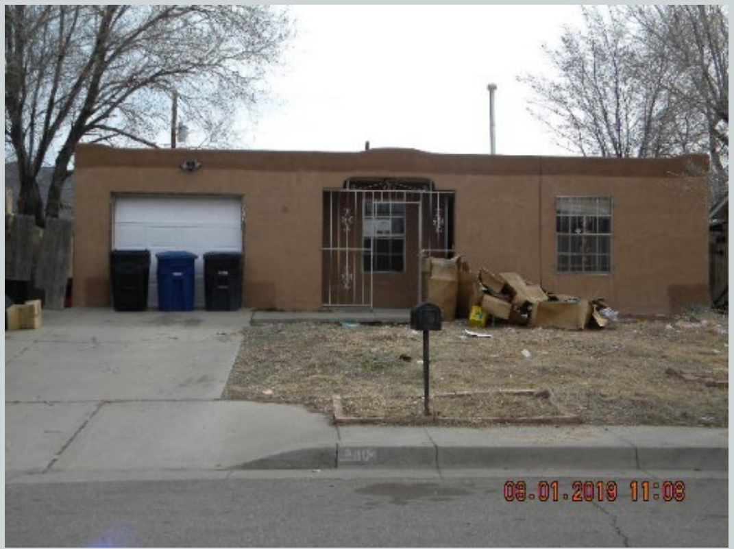
Subject 240 Maxine St Ne