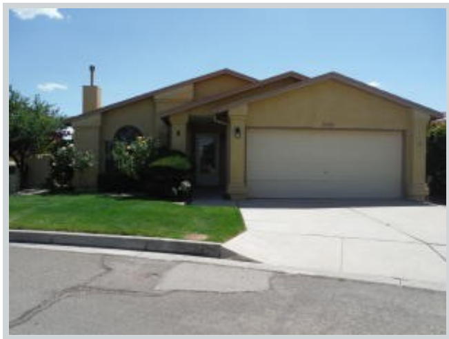
Sold Comp 1 10900 Echo Park Dr Ne View Front