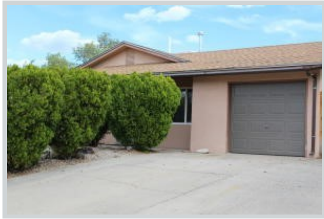
Listing Comp 1 324 Jane St Ne View Front