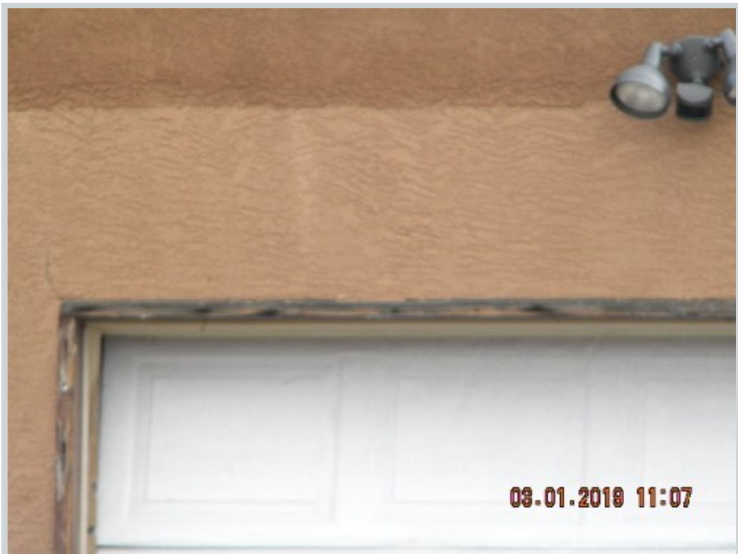
Subject 240 Maxine St Ne View Other Comment "Exterior paint"

Address 240 Maxine Street Ne, Albuquerque, NM 87123 Loan Number 37163 Suggested List $136,000 Suggested Repaired $145,000 Sale $134,000