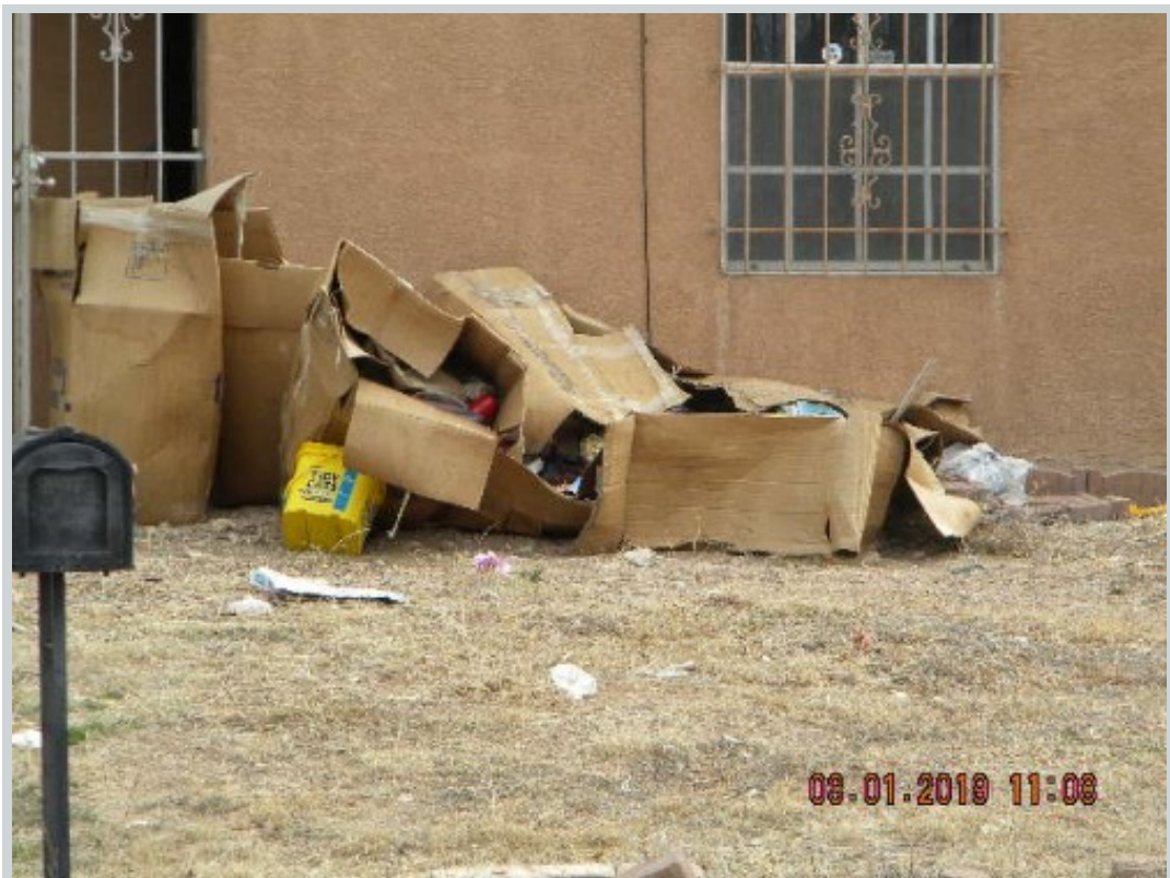
Subject 240 Maxine St Ne View Other Comment "Yard trash"