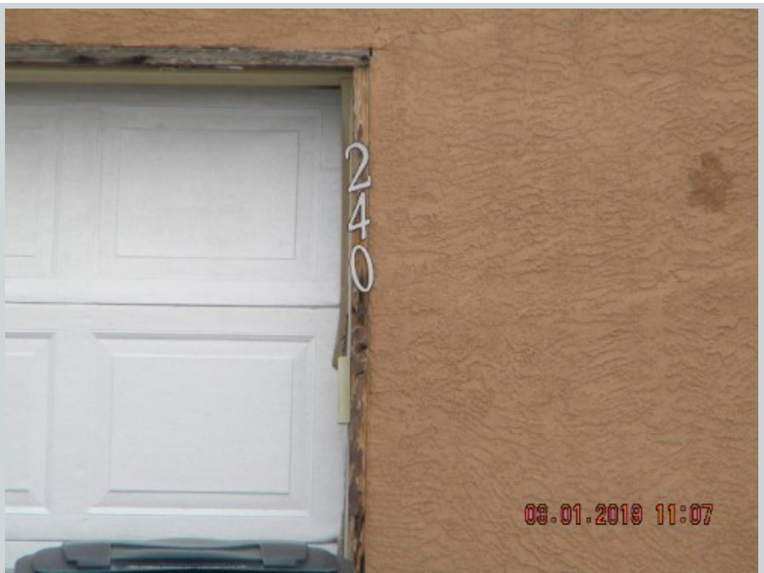
Subject 240 Maxine St Ne