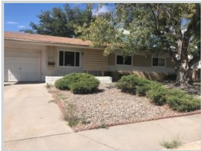
Sold Comp 3 605 Jane St Ne View Front