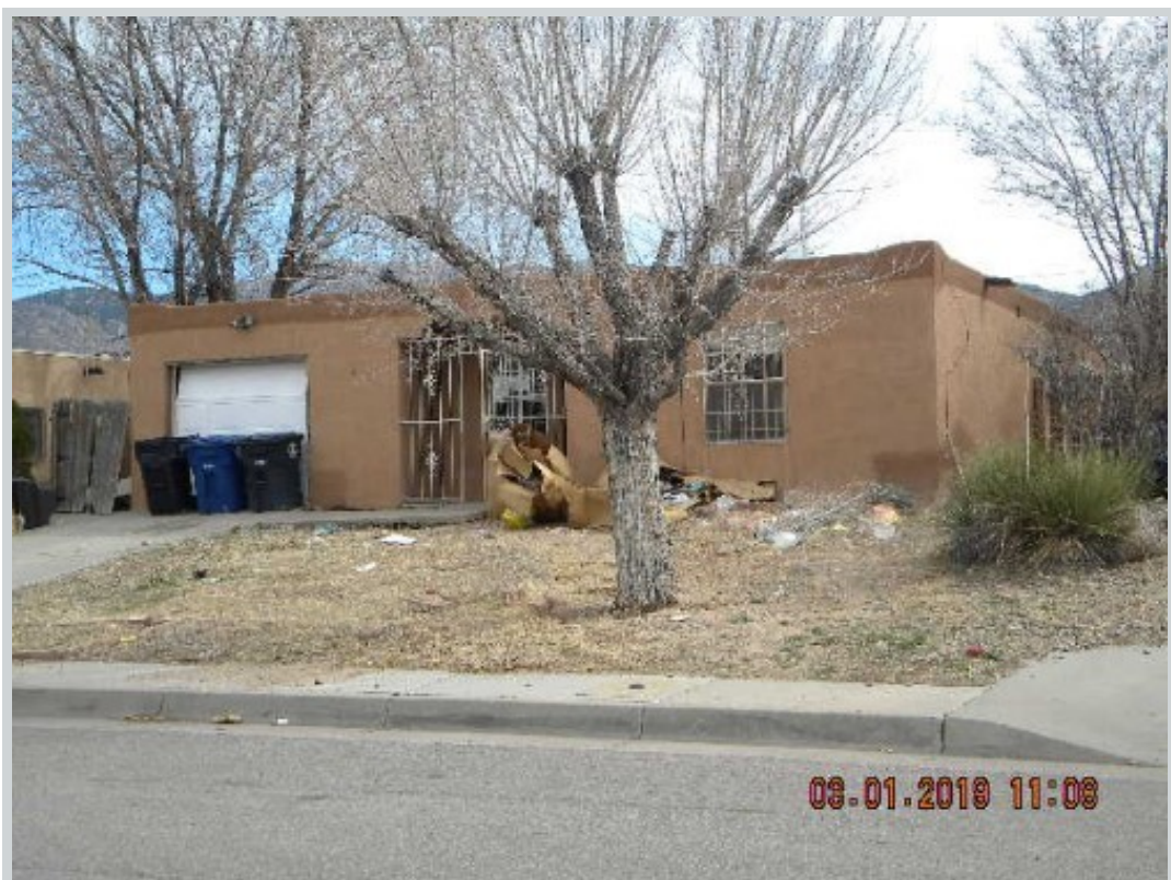
Subject 240 Maxine St Ne

Address 240 Maxine Street Ne, Albuquerque, NM 87123 Loan Number 37163 Suggested List $136,000 Suggested Repaired $145,000 Sale $134,000