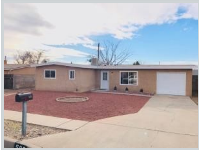
Listing Comp 3 509 Burma Dr Ne View Front