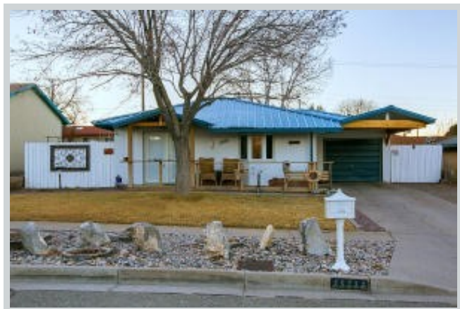
Listing Comp 2 13112 Lomas Verdes Ave Ne View Front