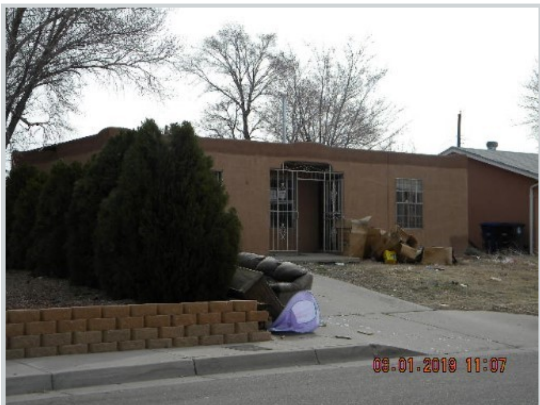
Subject 240 Maxine St Ne