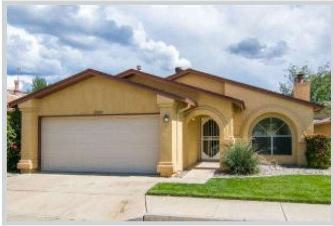
Sold Comp 2 11008 Griffith Park Dr Ne View Front