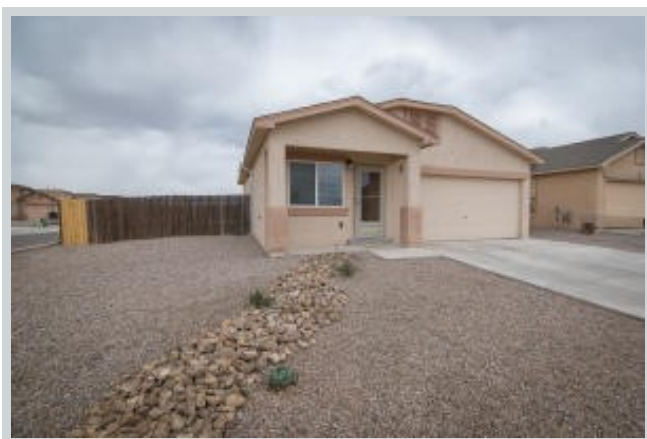
Sold Comp 2 31 Salida Del Sol View Front