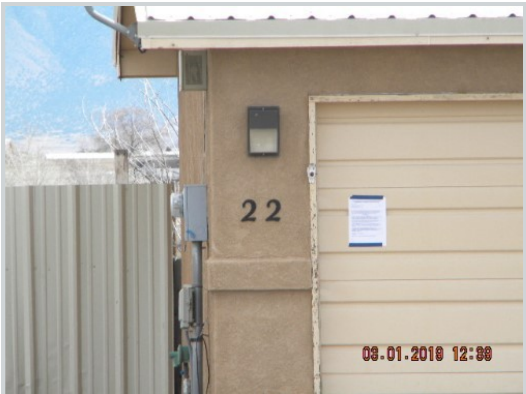
Subject 22 Rio Abajo Dr