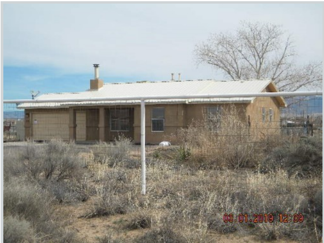
Subject 22 Rio Abajo Dr Comment "Right side"

Address 22 Rio Abajo Drive, Los Lunas, NM 87031 Loan Number 37170 Suggested List $125,000 Suggested Repaired $125,000 Sale $120,000