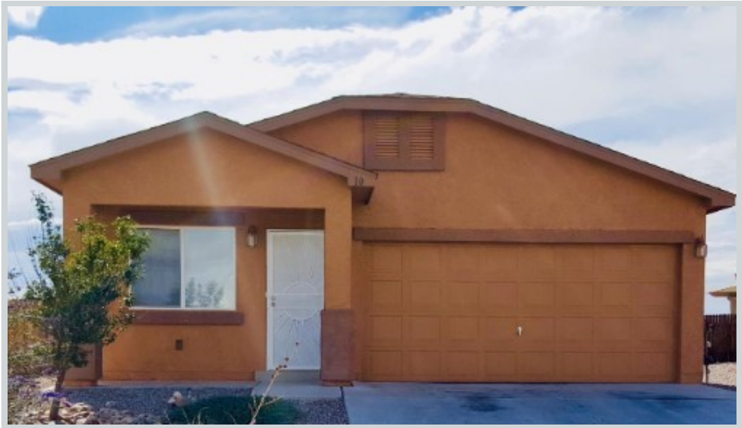
Listing Comp 1 10 Tome Vista Dr