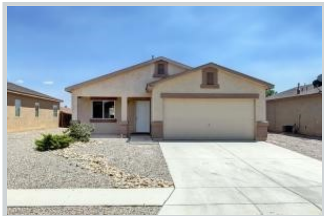
Sold Comp 1 26 Salida Del Sol View Front