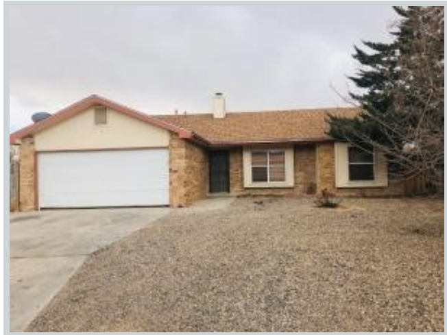
Listing Comp 3 24 Marigold Blvd View Front