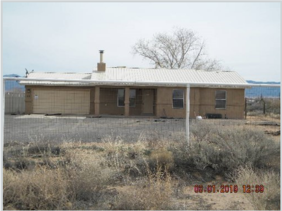
Subject 22 Rio Abajo Dr