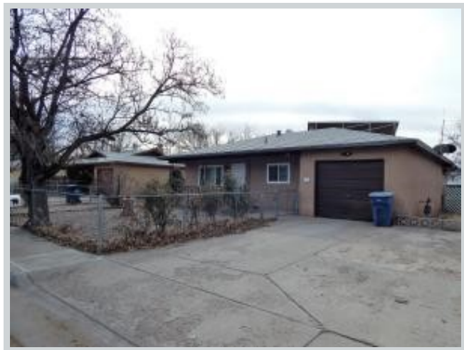
Listing Comp 2 1111 Pine Ct Se