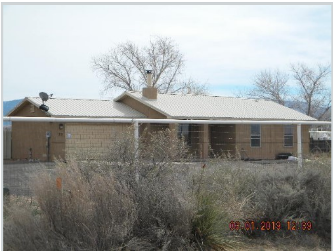
Subject 22 Rio Abajo Dr Comment "Left side"