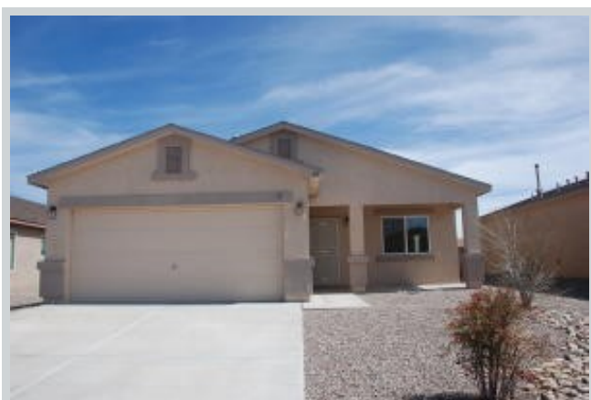
Sold Comp 3 29 Tome Vista Dr View Front