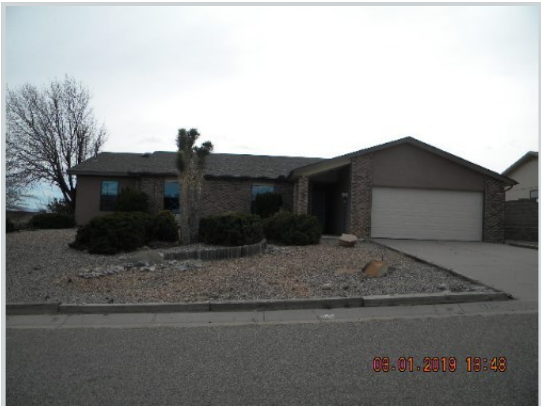
Subject 4550 Pyrite Ct Ne