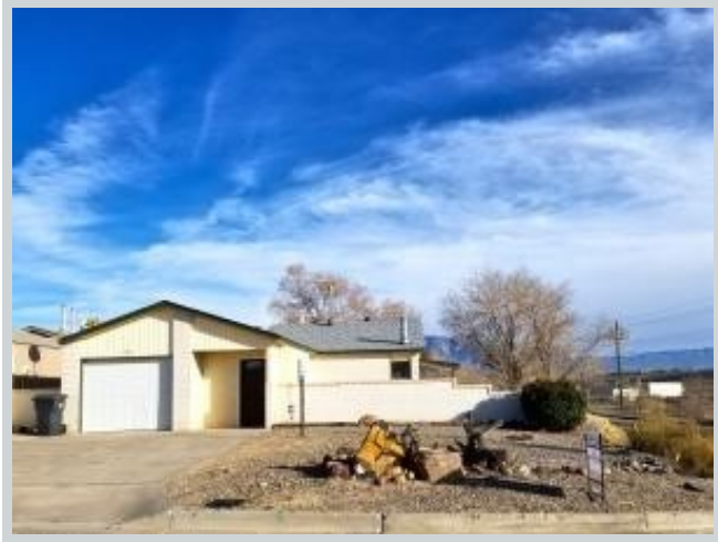
Listing Comp 3 100 Pearl Dr Ne View Front