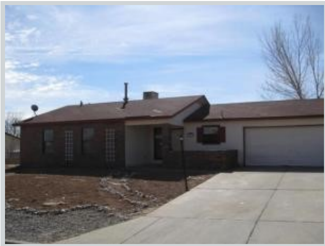
Listing Comp 2 4728 Limestone Dr Ne View Front