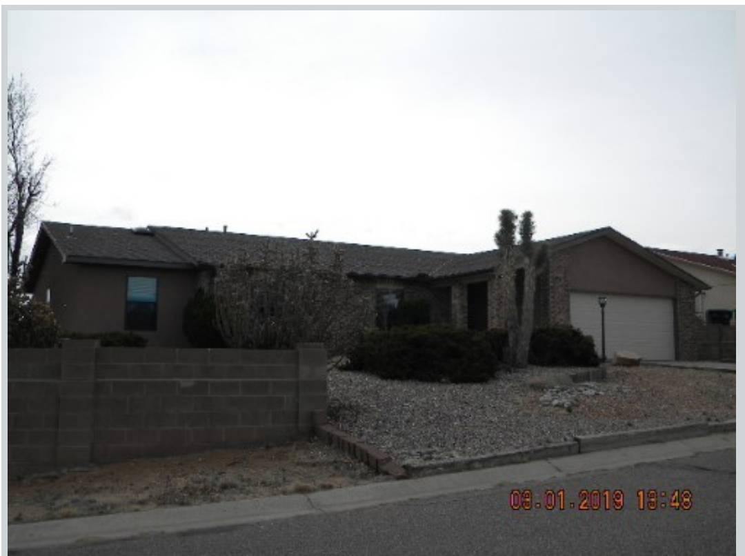
Subject 4550 Pyrite Ct Ne View Side Comment "Left side"