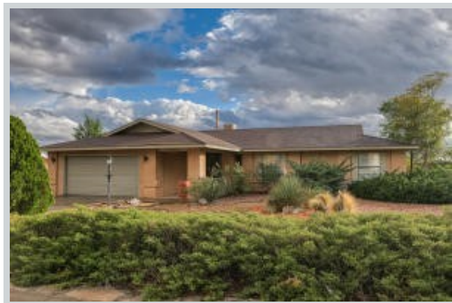
Sold Comp 3 633 Emerald Dr Ne View Front