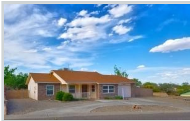
Sold Comp 2 4695 Zirconia Dr Ne View Front

Address 4550 Pyrite Court, Rio Rancho, NM 87124 Loan Number 37171 Suggested List $165,000 Suggested Repaired $165,000 Sale $160,000