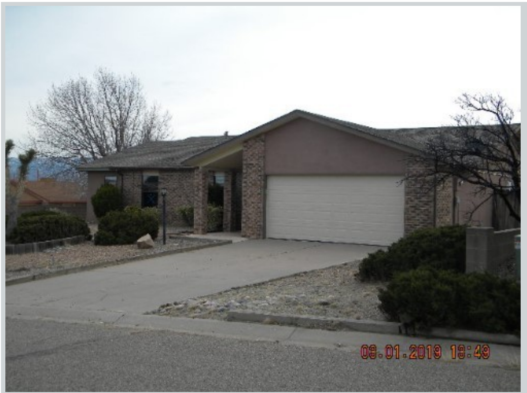
Subject 4550 Pyrite Ct Ne View Side Comment "Right side"

Address 4550 Pyrite Court, Rio Rancho, NM 87124 Loan Number 37171 Suggested List $165,000 Suggested Repaired $165,000 Sale $160,000