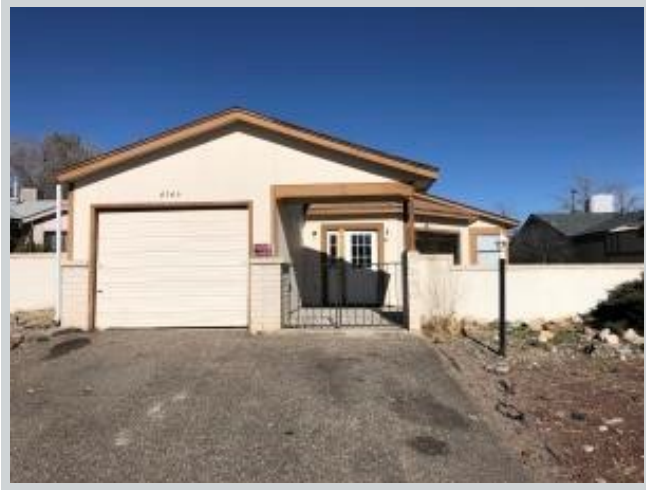
Listing Comp 1 4745 Platinum Dr Ne View Front