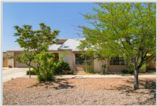
Sold Comp 1 4660 Gypsum Dr Ne View Front