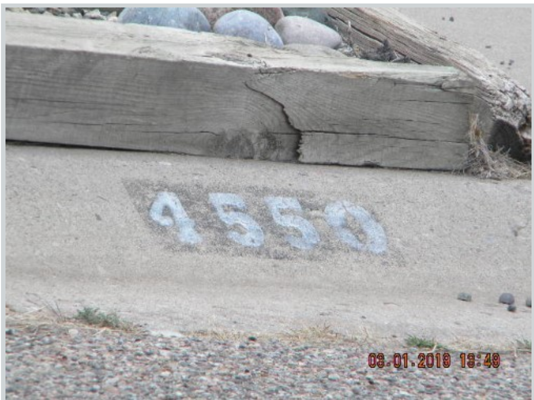
Subject 4550 Pyrite Ct Ne