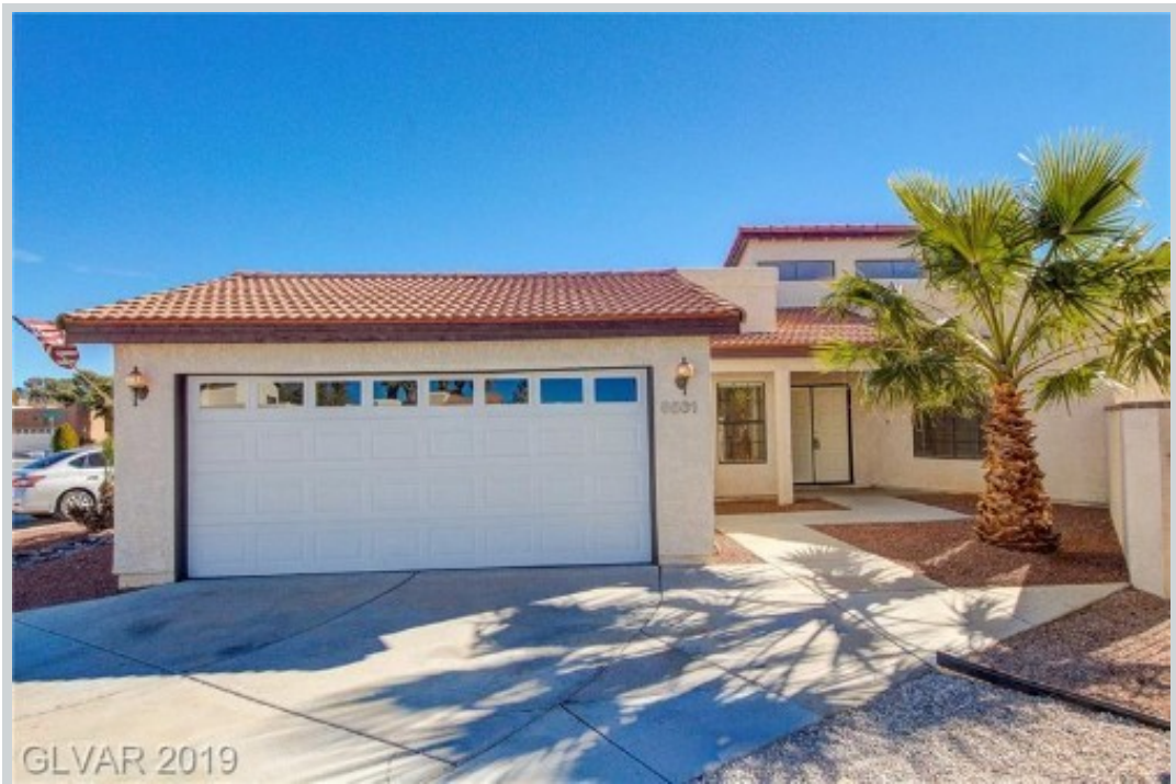
Listing Comp 3 6561 Beacon Rd