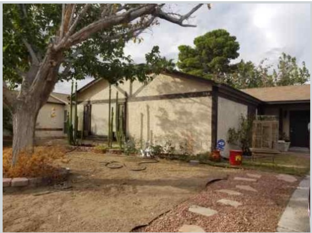
Listing Comp 1 6544 Ouida Wy