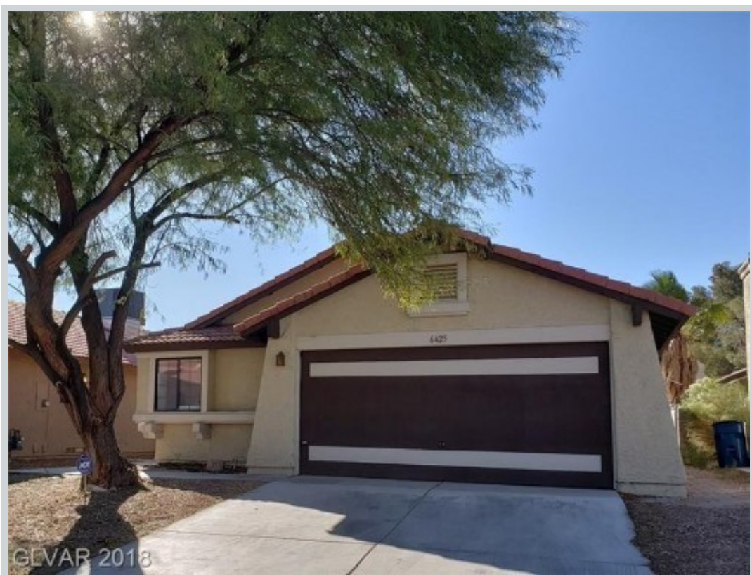
Sold Comp 1 6425 Plumcrest Rd

Address 6613 Beacon Road, Las Vegas, NV 89108 Suggested Repaired $218,000 Sale $208,000 Loan Number 37173 Suggested List $218,000