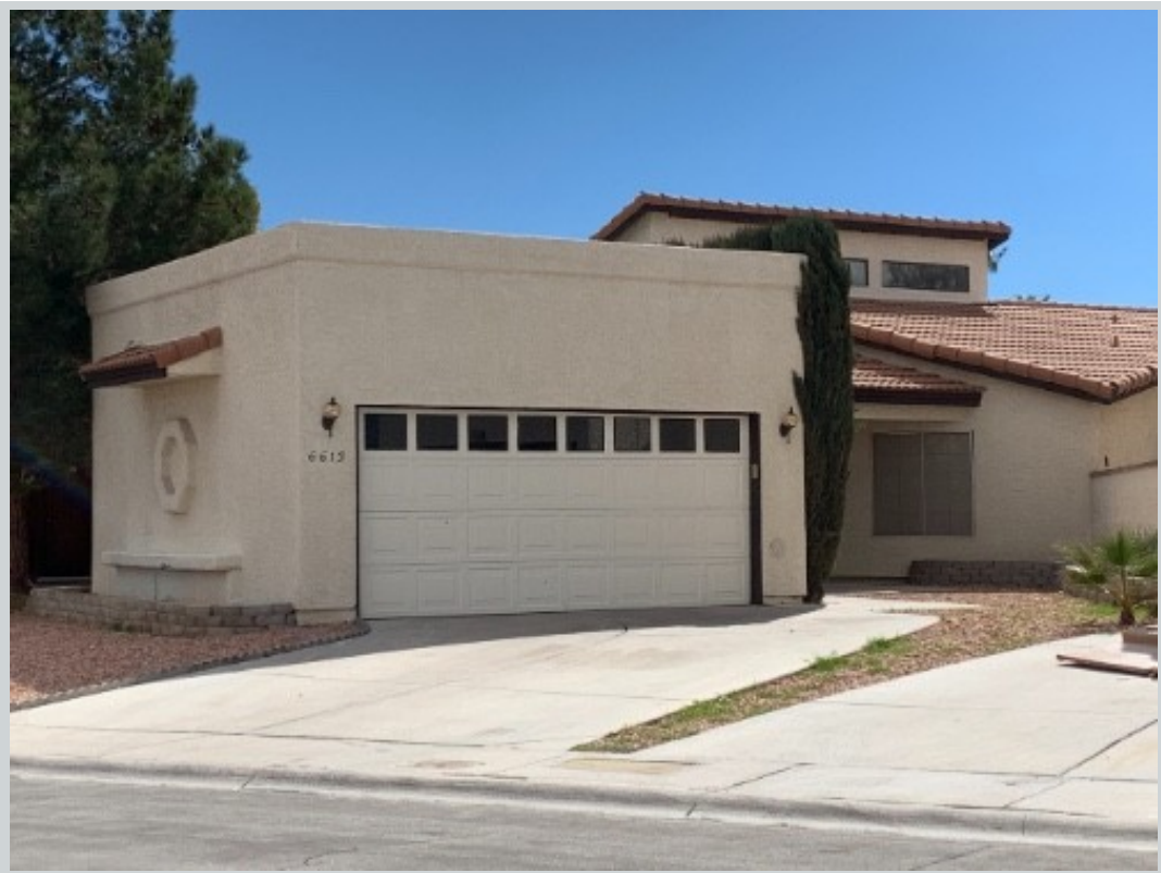
Subject 6613 Beacon Rd