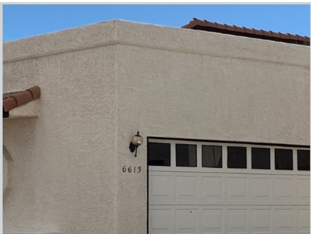
Subject 6613 Beacon Rd