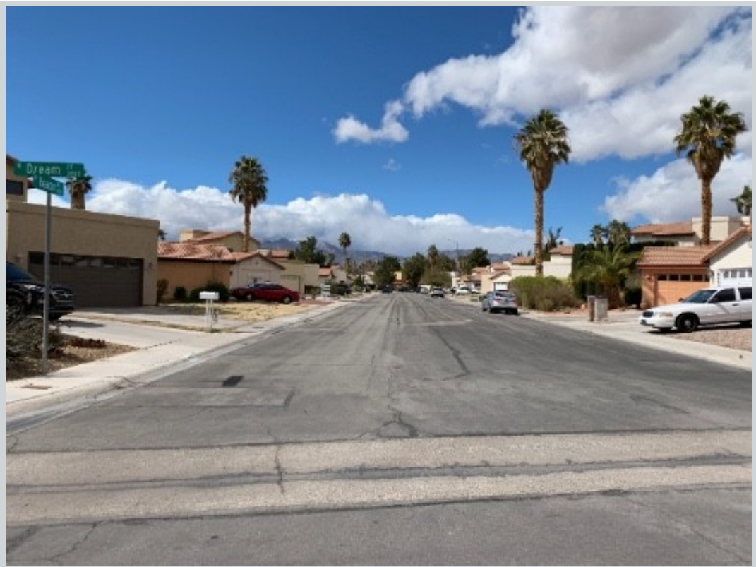
Subject 6613 Beacon Rd