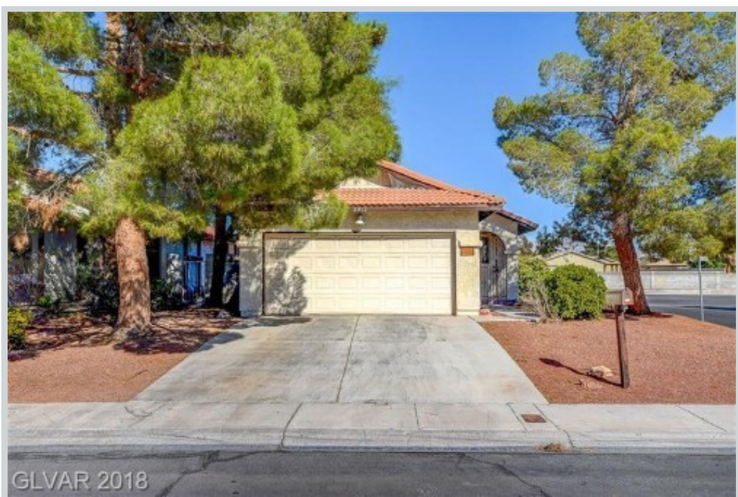
Sold Comp 2 6412 Pearcrest Rd