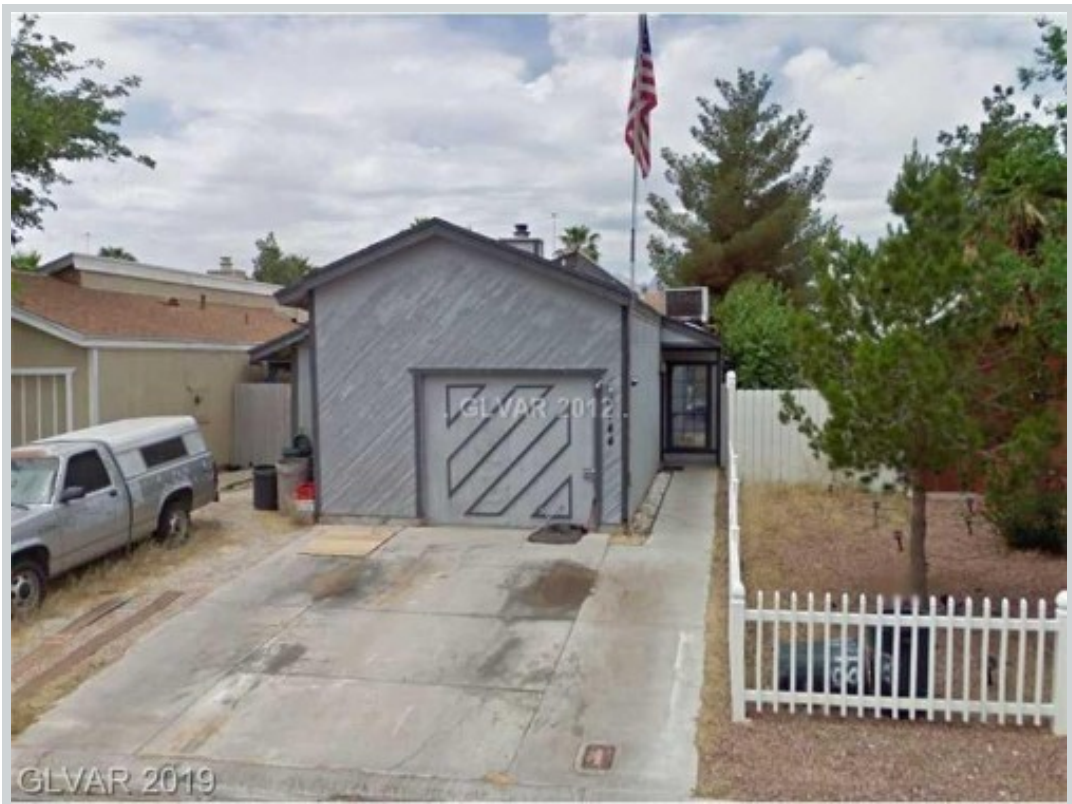
Listing Comp 2 4144 Woodgreen Dr

Address 6613 Beacon Road, Las Vegas, NV 89108 Loan Number 37173 Suggested List $218,000 Suggested Repaired $218,000 Sale $208,000