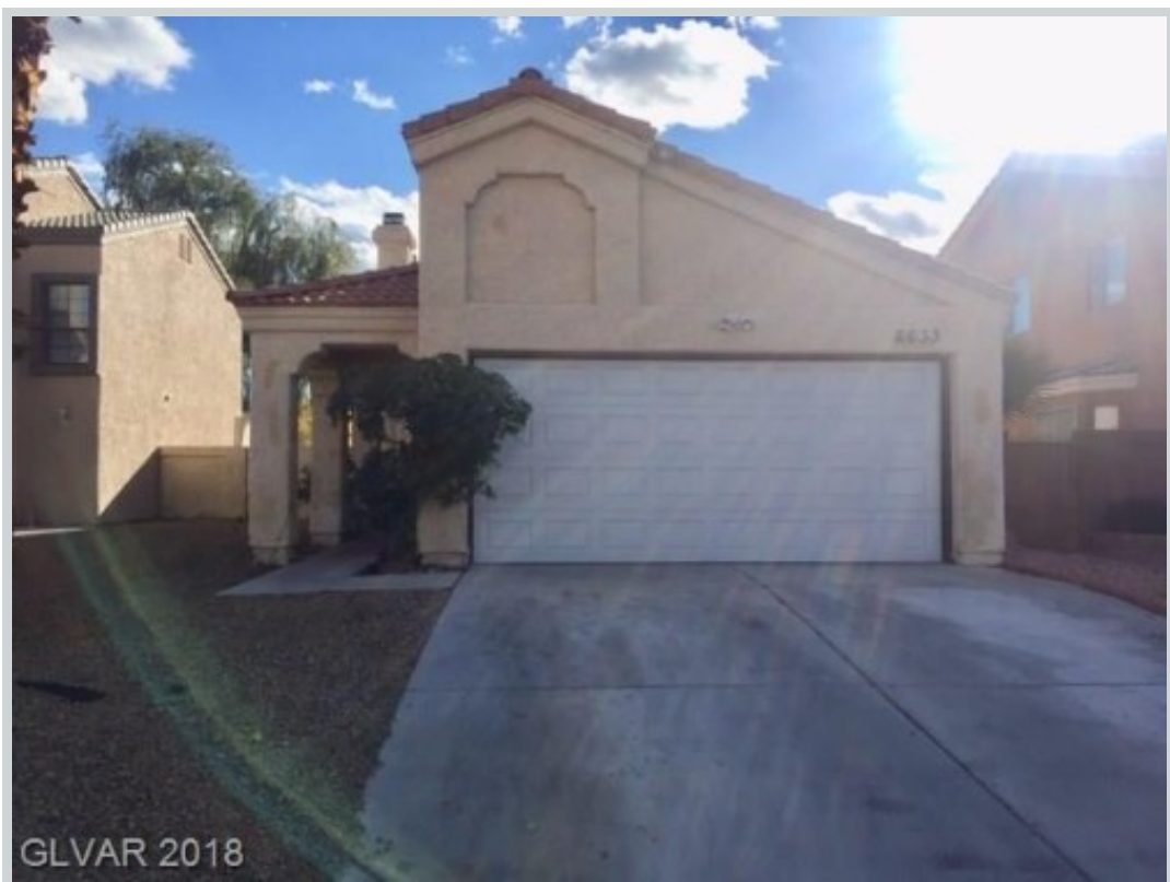
Sold Comp 3 6633 Chardonay Wy

Address 6613 Beacon Road, Las Vegas, NV 89108 Loan Number 37173 Suggested List $218,000 Suggested Repaired $218,000 Sale $208,000