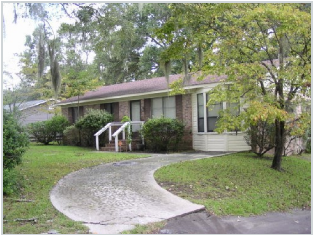
Listing Comp 3 1501 Lafayette St