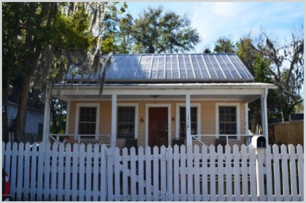
Listing Comp 2 1210 Congress St