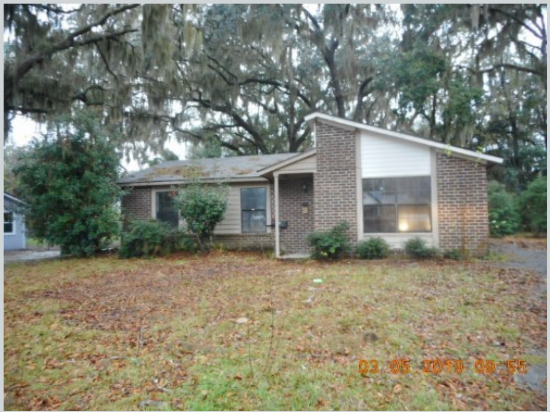
Subject 1314 Church St