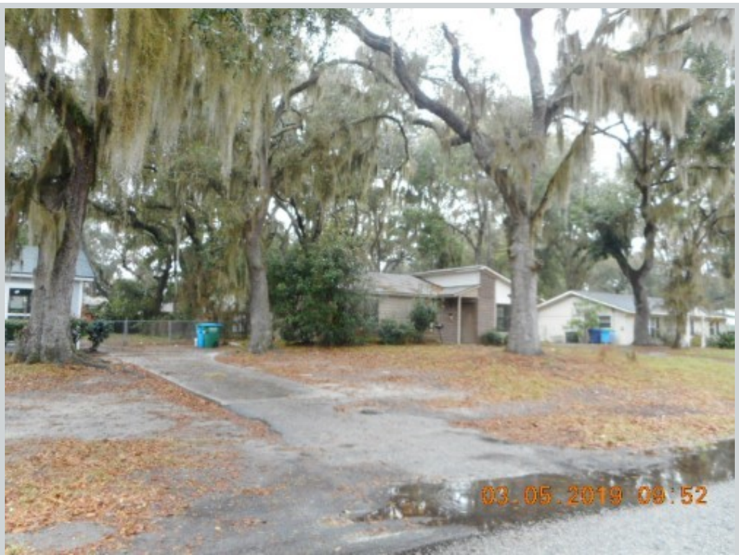
Subject 1314 Church St