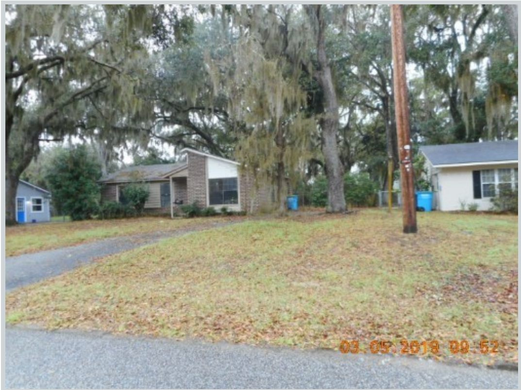
Subject 1314 Church St