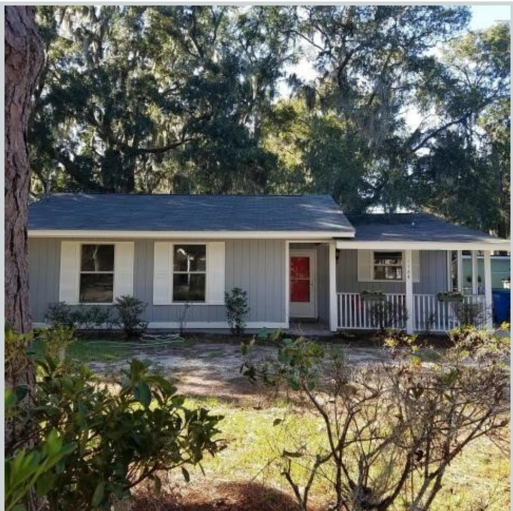
Listing Comp 1 1124 Emmons St