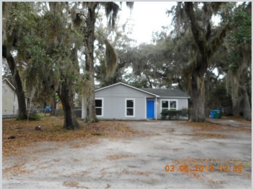
Sold Comp 1 1312 Church St # A