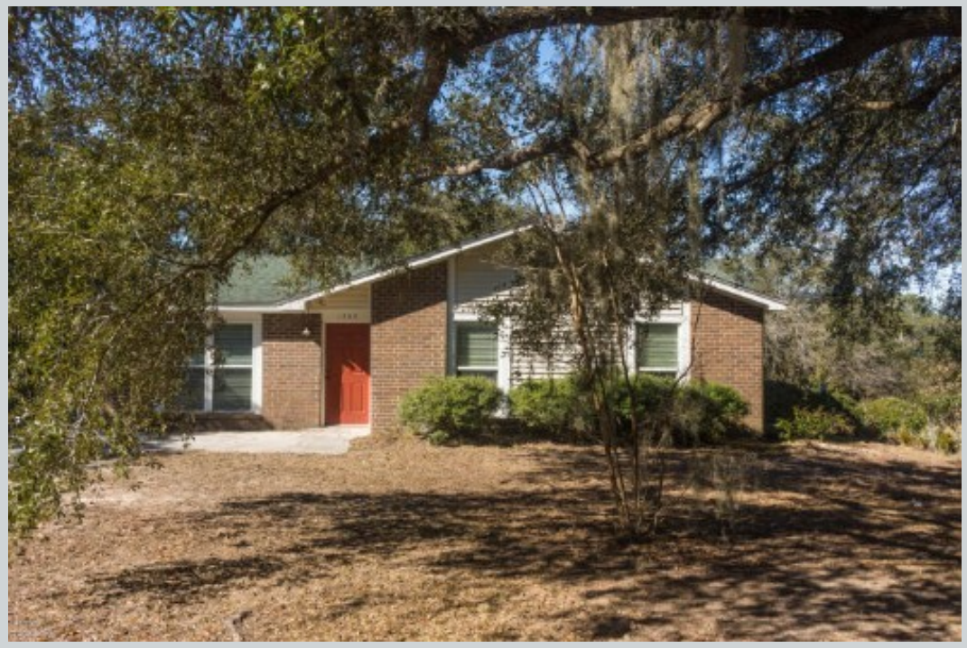
Sold Comp 3 1504 Sycamore St