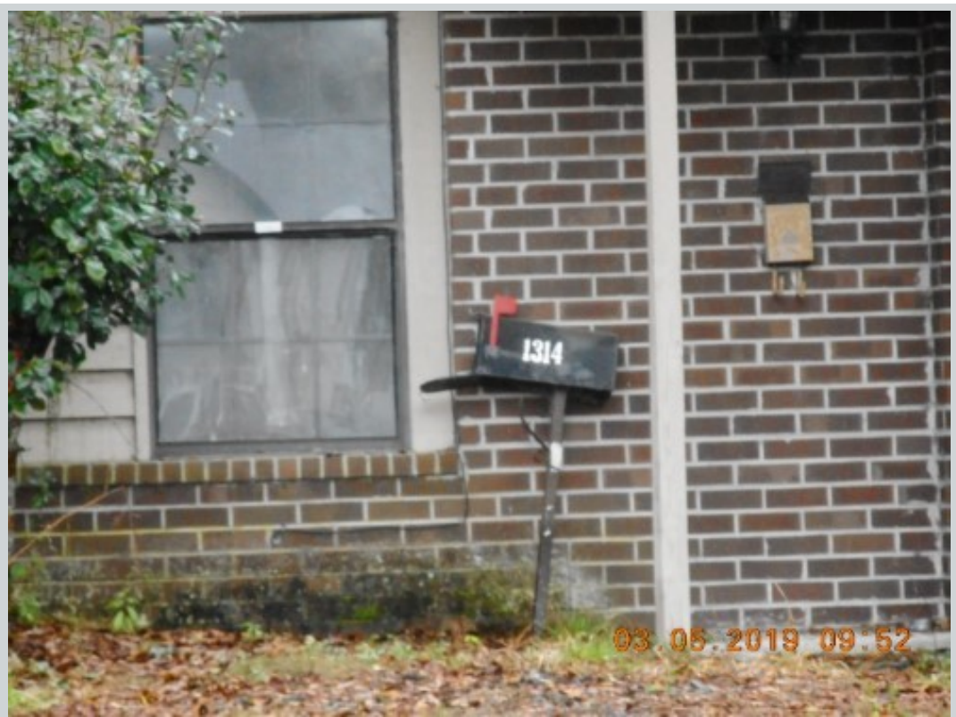
Subject 1314 Church St