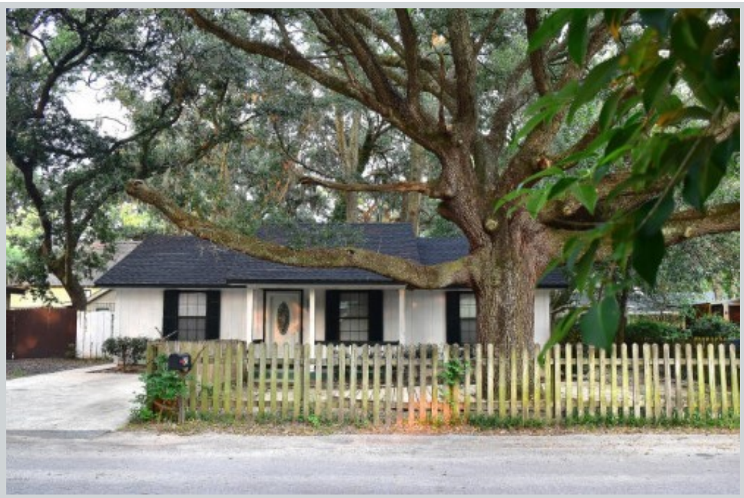
Sold Comp 2 423 Waight St