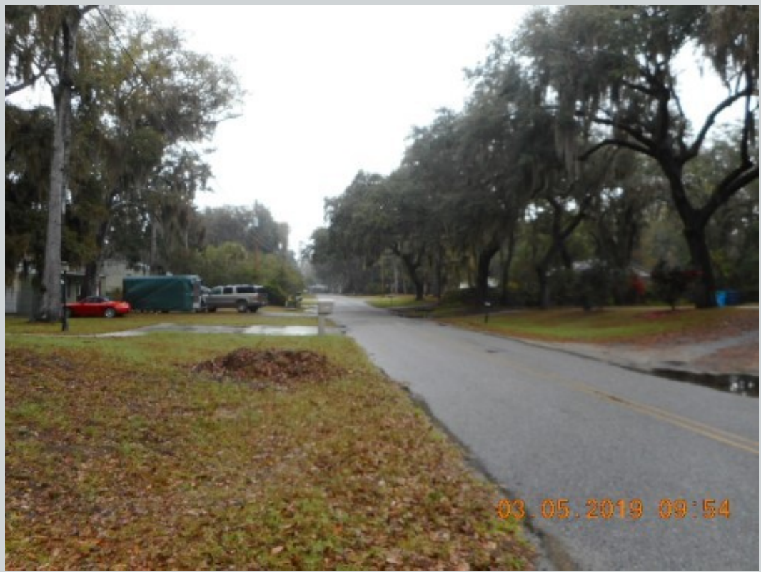
Subject 1314 Church St