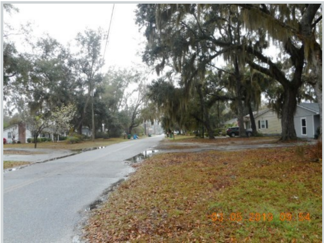
Subject 1314 Church St