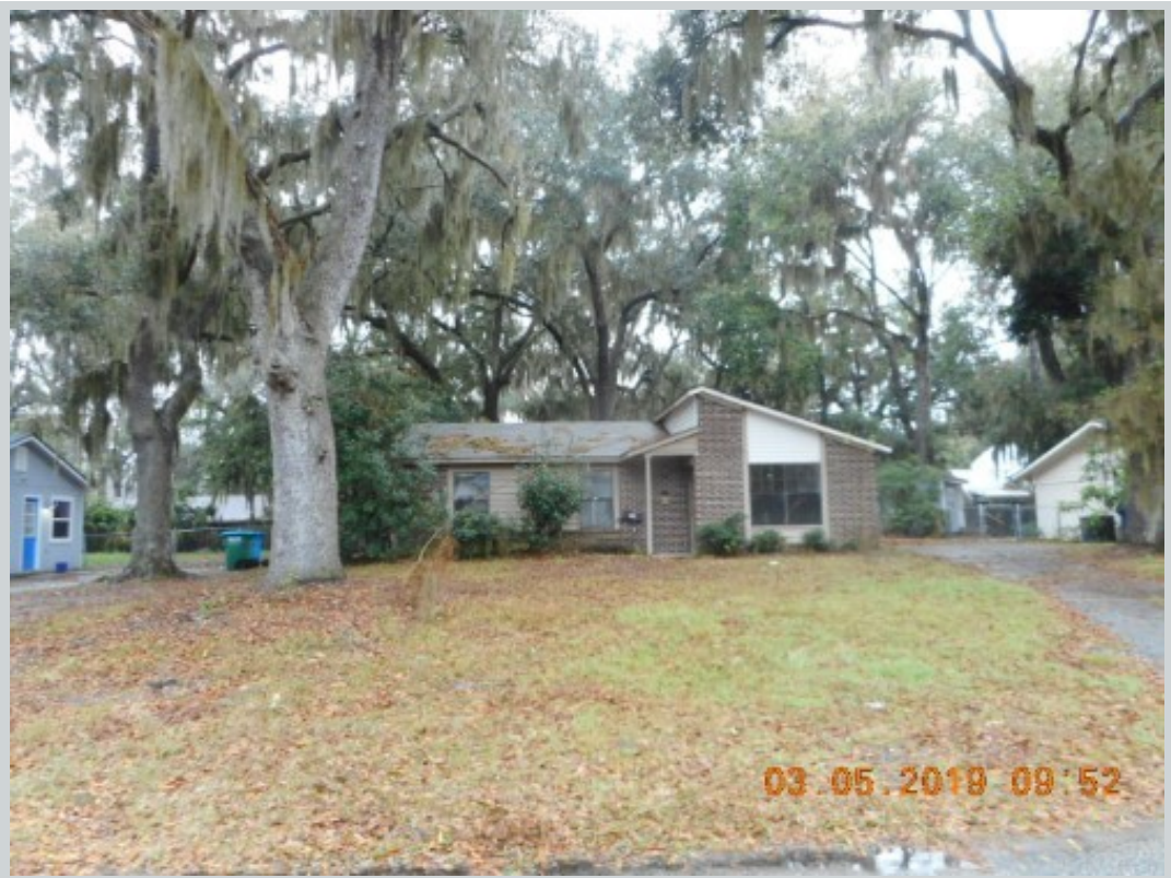
Subject 1314 Church St