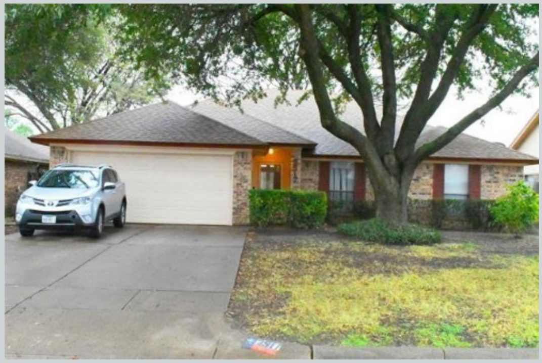
Listing Comp 3 2517 Hallmark St