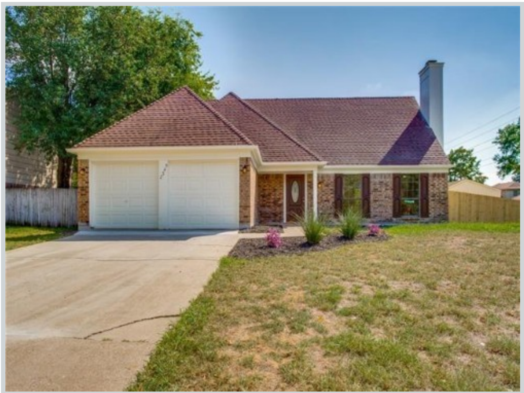
Sold Comp 3 2345 Warwick Ave