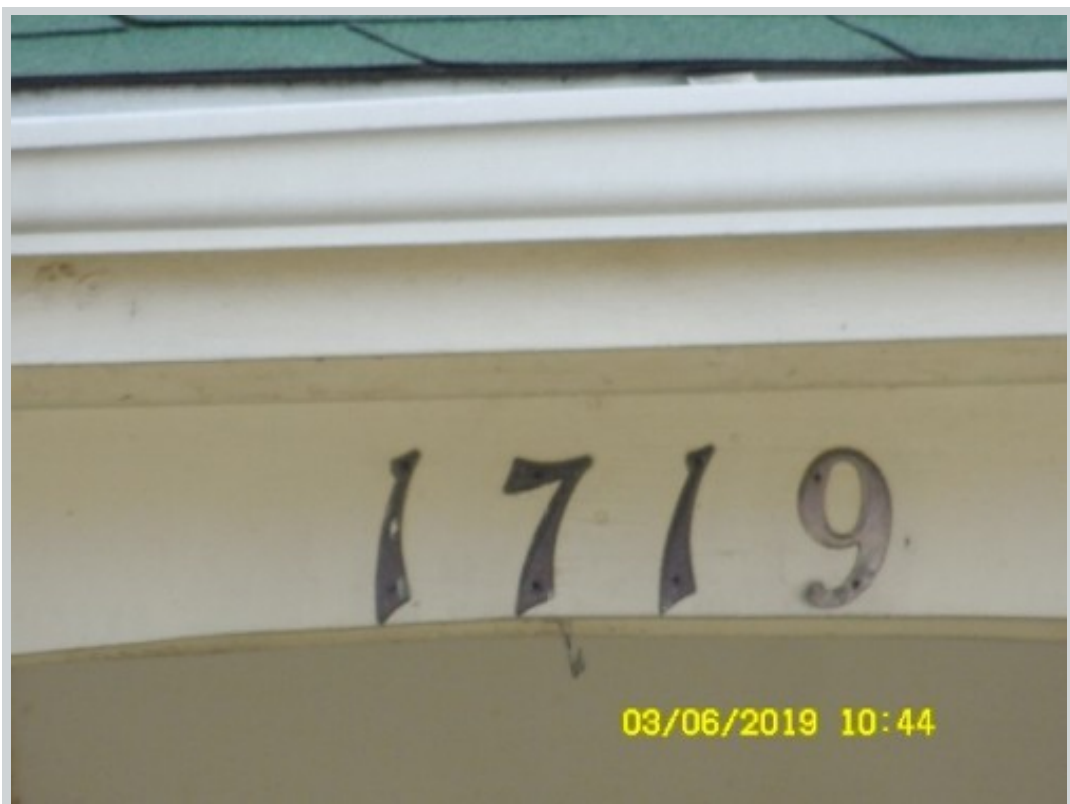
Subject 1719 Vicky Ln