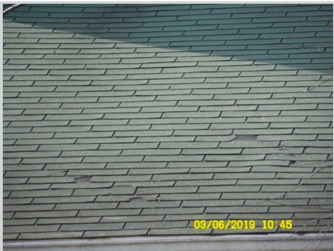
Subject 1719 Vicky Ln