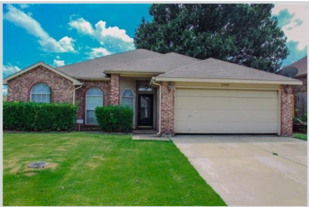
Sold Comp 1 2349 Bentley Ct