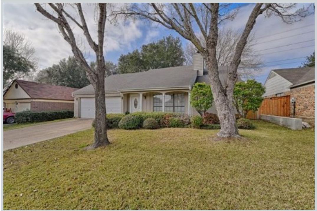
Sold Comp 2 4317 Winchester Ct