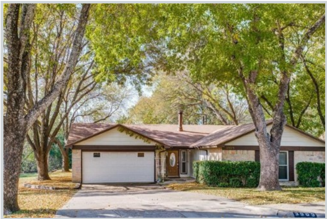
Listing Comp 2 3909 Raywood Dr