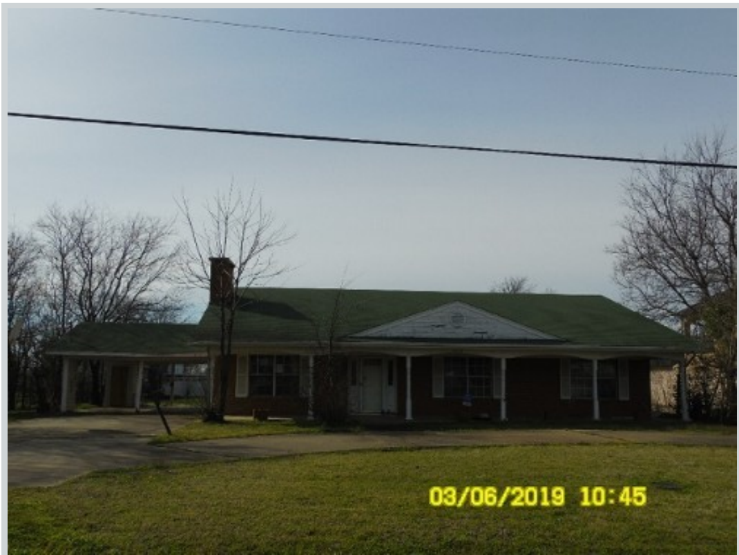
Subject 1719 Vicky Ln