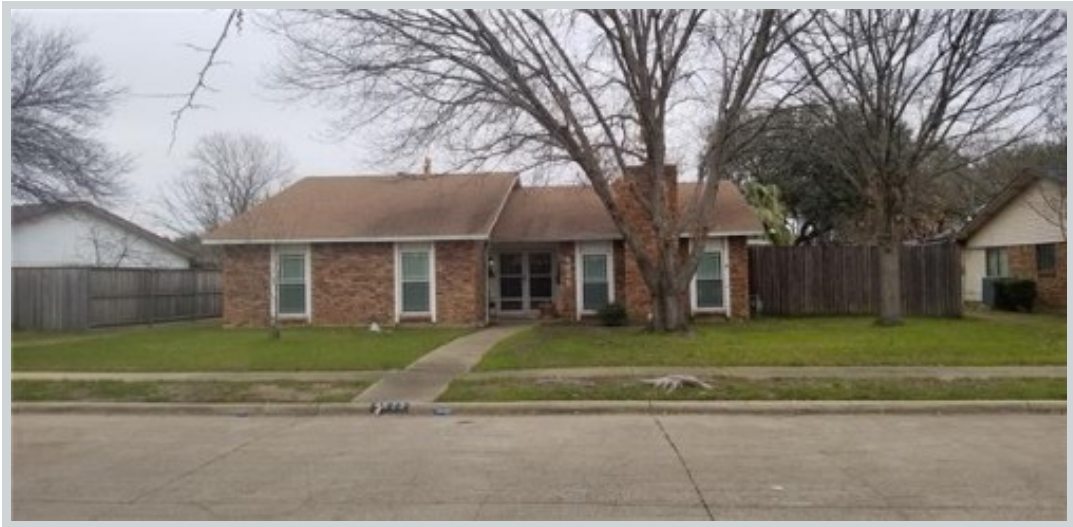
Listing Comp 1 4625 Goodnight Trl