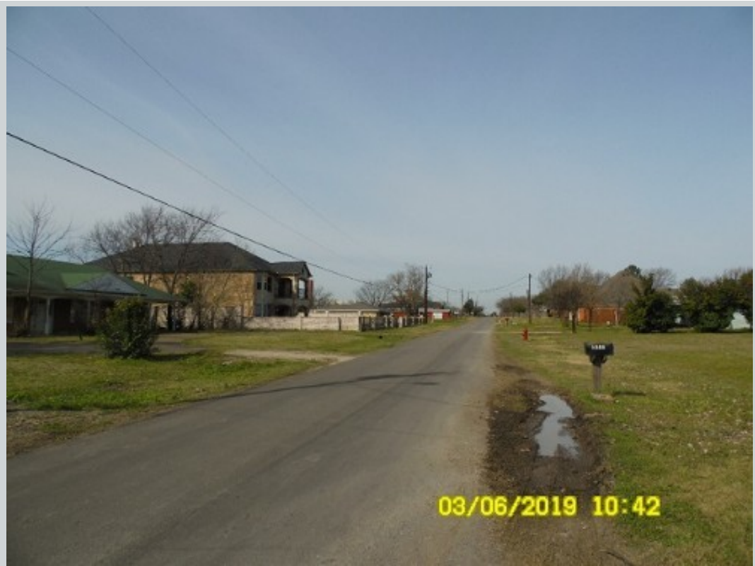
Subject 1719 Vicky Ln