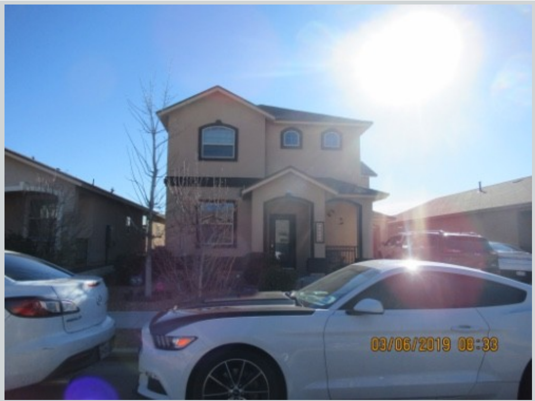
Subject 10936 Coyote Ranch Ln