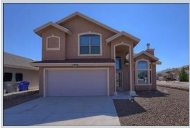
Sold Comp 3 4800 Red Canyon Ct