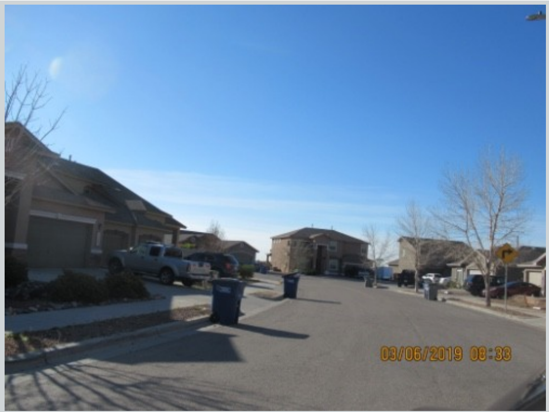
Subject 10936 Coyote Ranch Ln