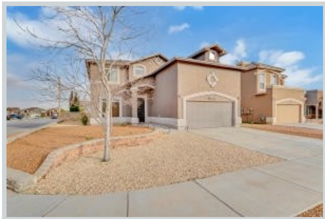
Listing Comp 1 11072 Ray Mena Lane