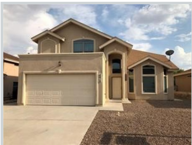
Sold Comp 2 4816 Red Canyon Ct View Front