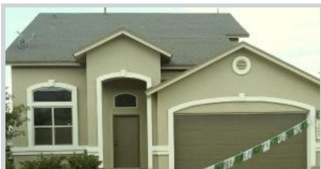
Listing Comp 2 10952 Coyote Ranch Lane View Front

Address 10936 Coyote Ranch Lane, El Paso, TX 79934 Loan Number 37192 Suggested List $190,000 Suggested Repaired $190,000 Sale $187,000