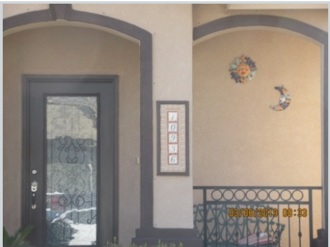
Subject 10936 Coyote Ranch Ln