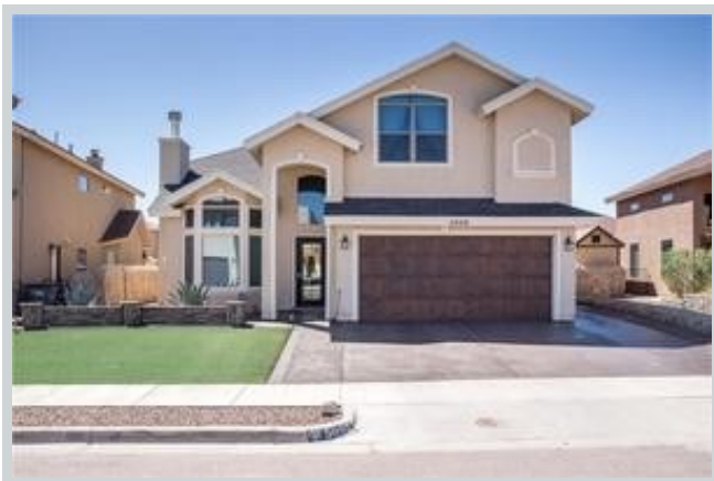
Sold Comp 1 5008 Silver Cholia View Front