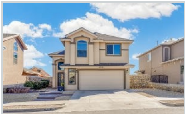
Listing Comp 3 4948 Cattle Lane View Front