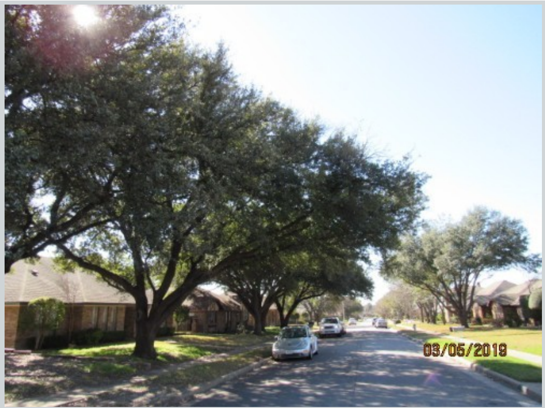
Subject 10223 Chisholm Trl