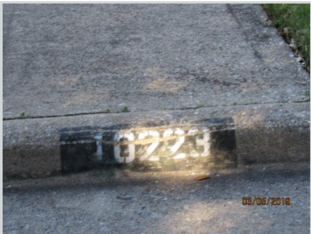
Subject 10223 Chisholm Trl