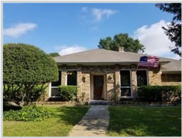
Listing Comp 3 9715 Windham Drive View Front