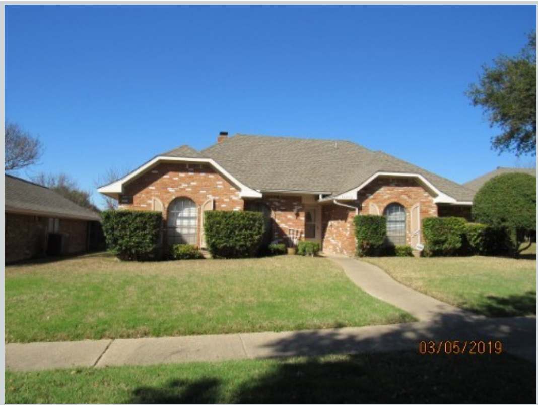
Subject 10223 Chisholm Trl