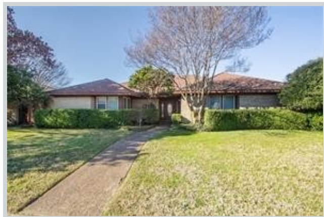
Sold Comp 2 13407 Baythorne Drive