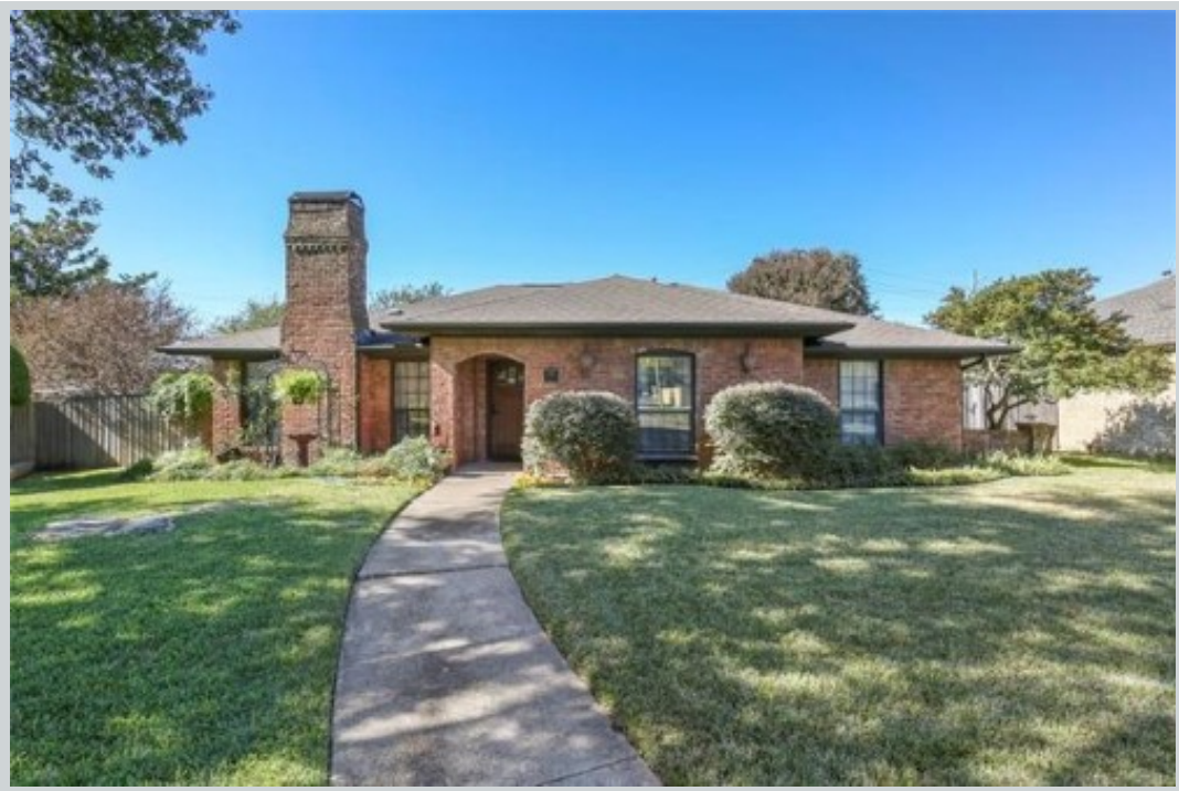
Sold Comp 1 13401 Hedgeapple Drive