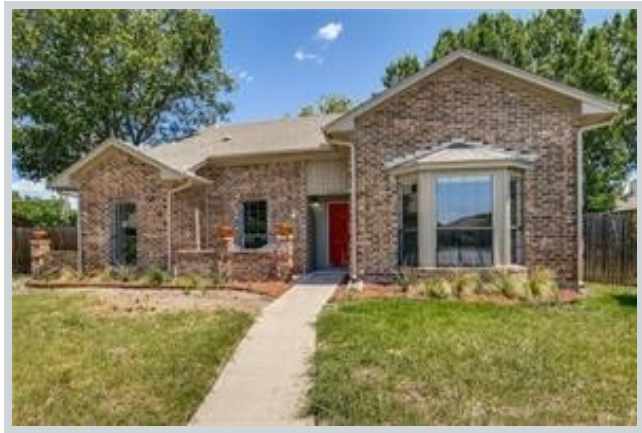
Sold Comp 3 13310 Carthage Lane View Front