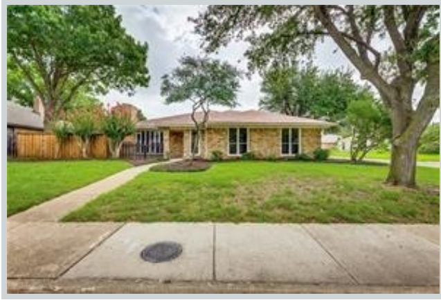
Listing Comp 2 13414 Whispering Hills Drive View Front