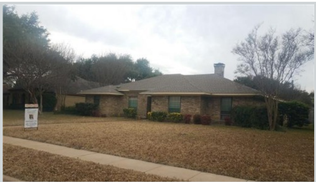
Listing Comp 1 900 E Spring Valley Road