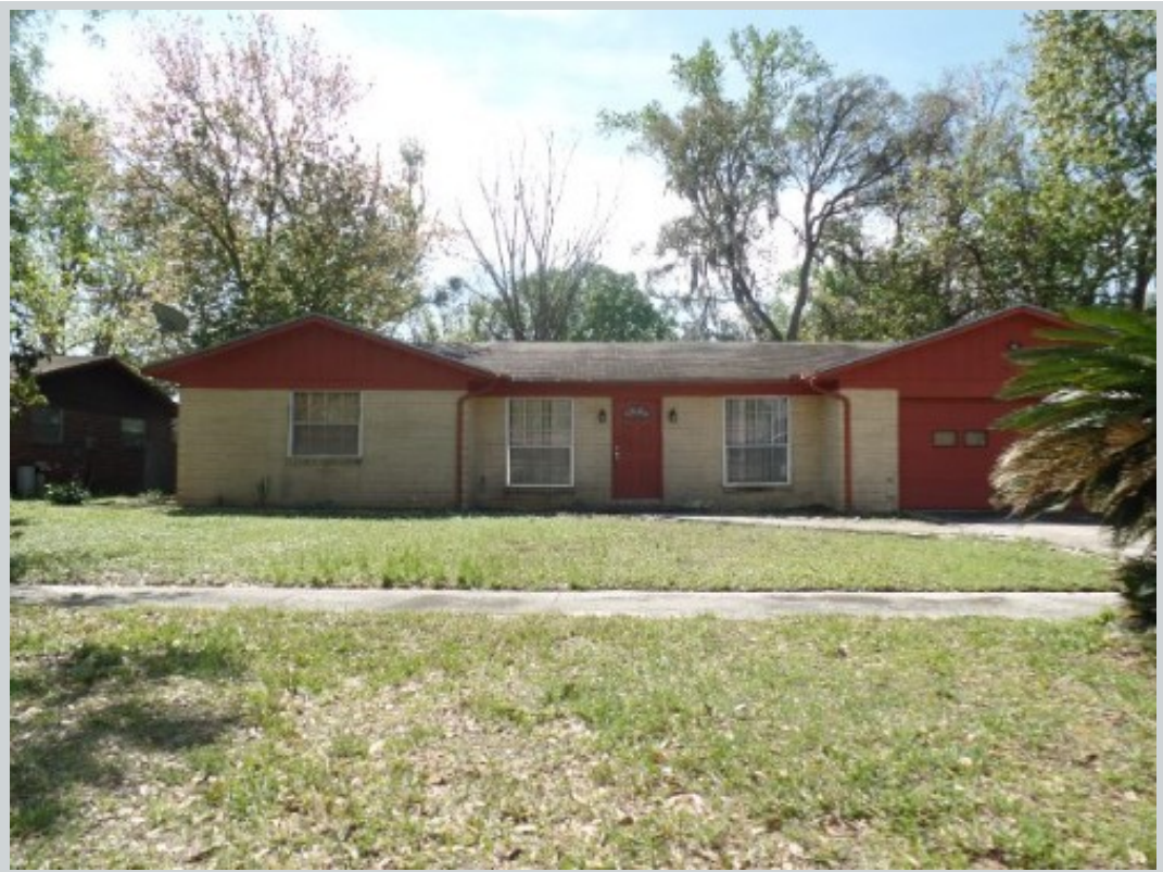
Subject 1695 Pecan Ct