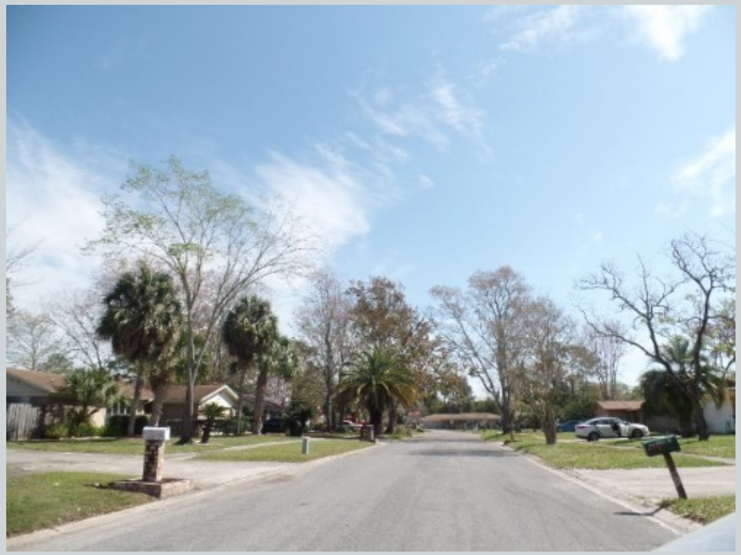
Subject 1695 Pecan Ct