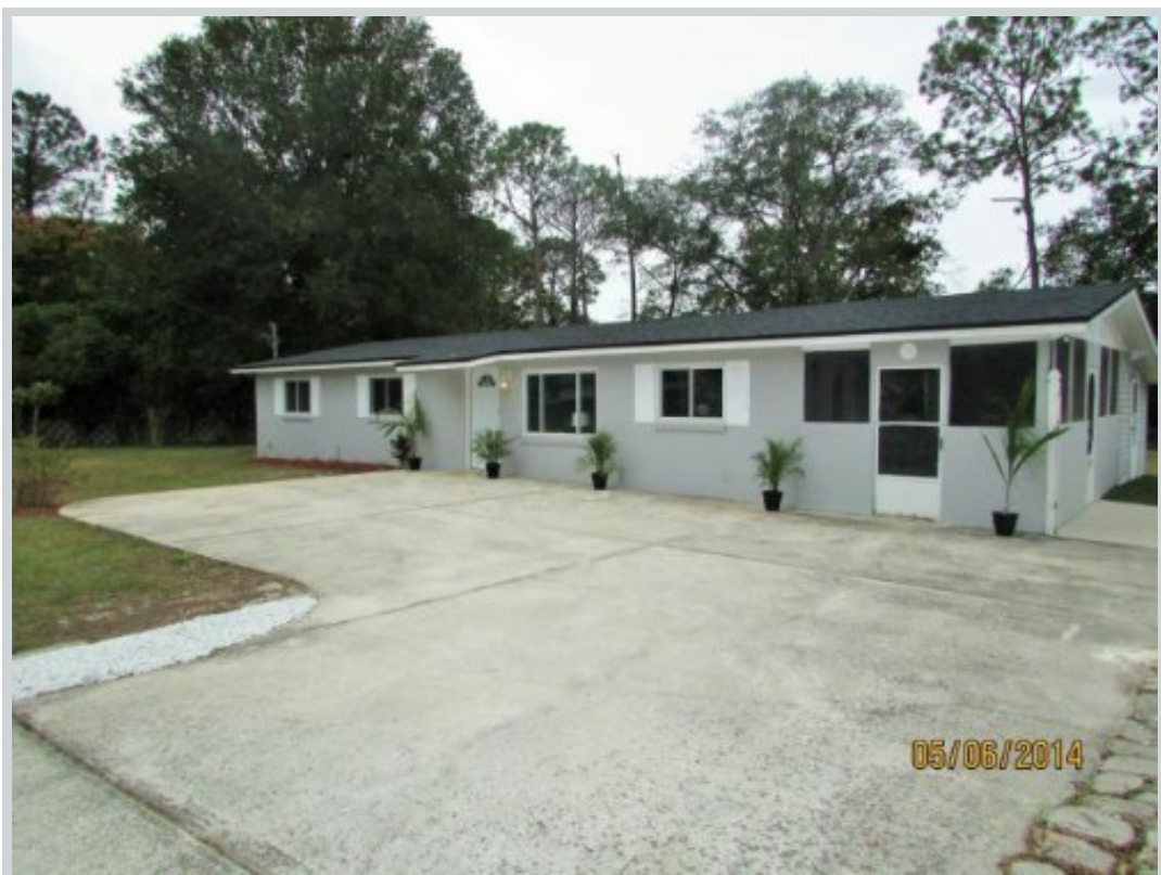
Listing Comp 2 468 Alsey Dr