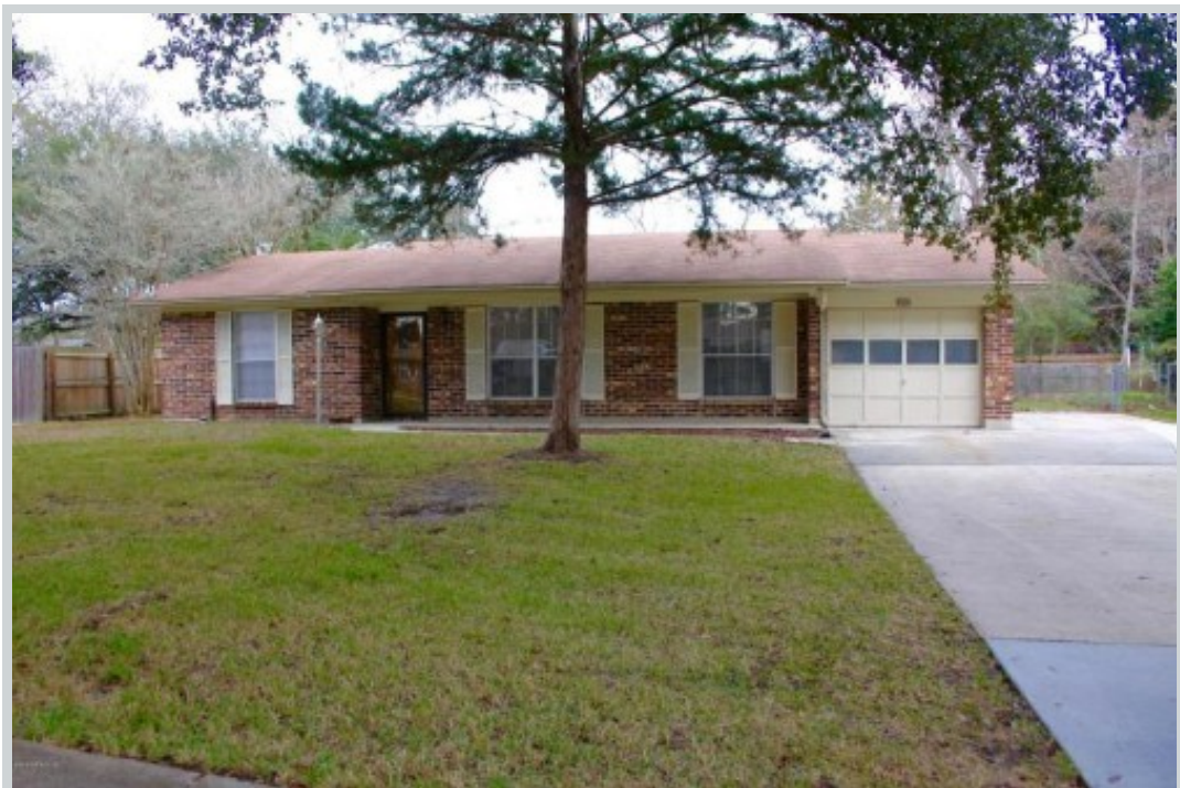
Listing Comp 1 1531 Gano Ave

Address 1695 Pecan Court, Orange Park, FL 32073 Loan Number 37203 Suggested List $179,900 Suggested Repaired $179,900 Sale $175,000