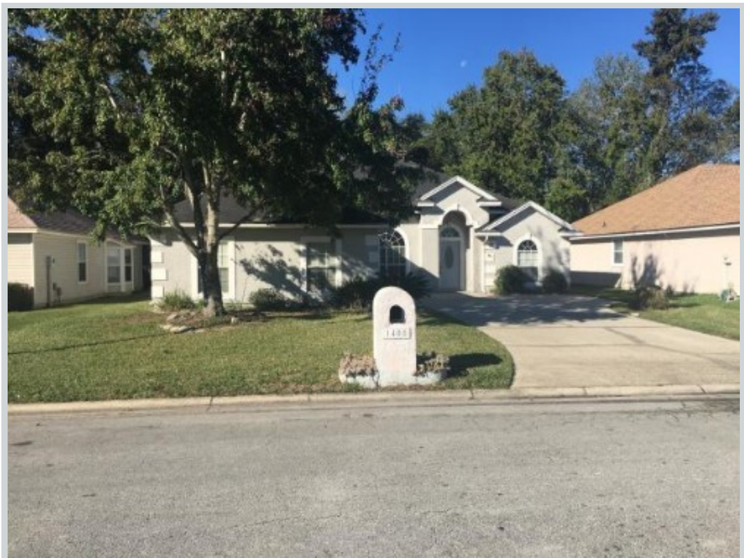
Sold Comp 3 1408 Sapling Dr