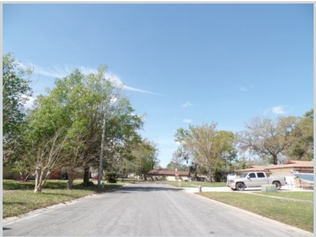
Subject 1695 Pecan Ct