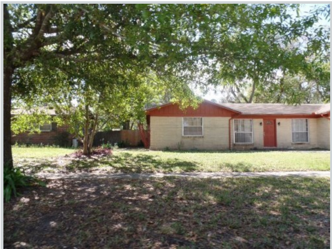
Subject 1695 Pecan Ct