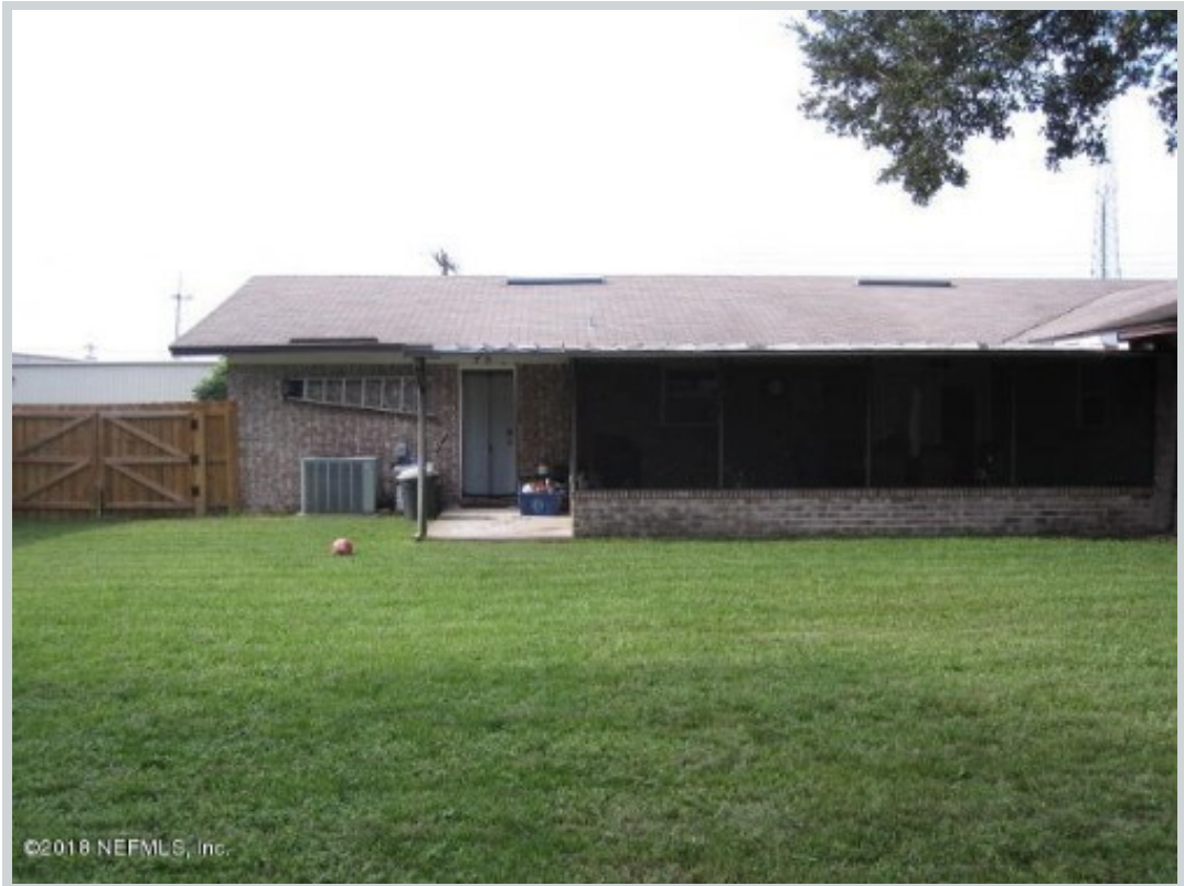
Sold Comp 2 1649 Bartlett Ave