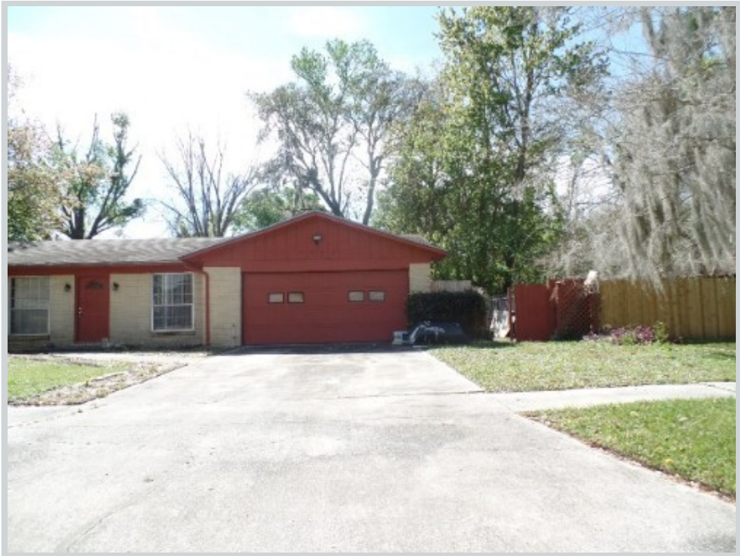
Subject 1695 Pecan Ct