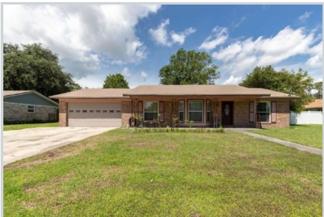
Sold Comp 1 184 Debarry Ave