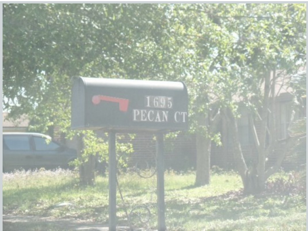
Subject 1695 Pecan Ct