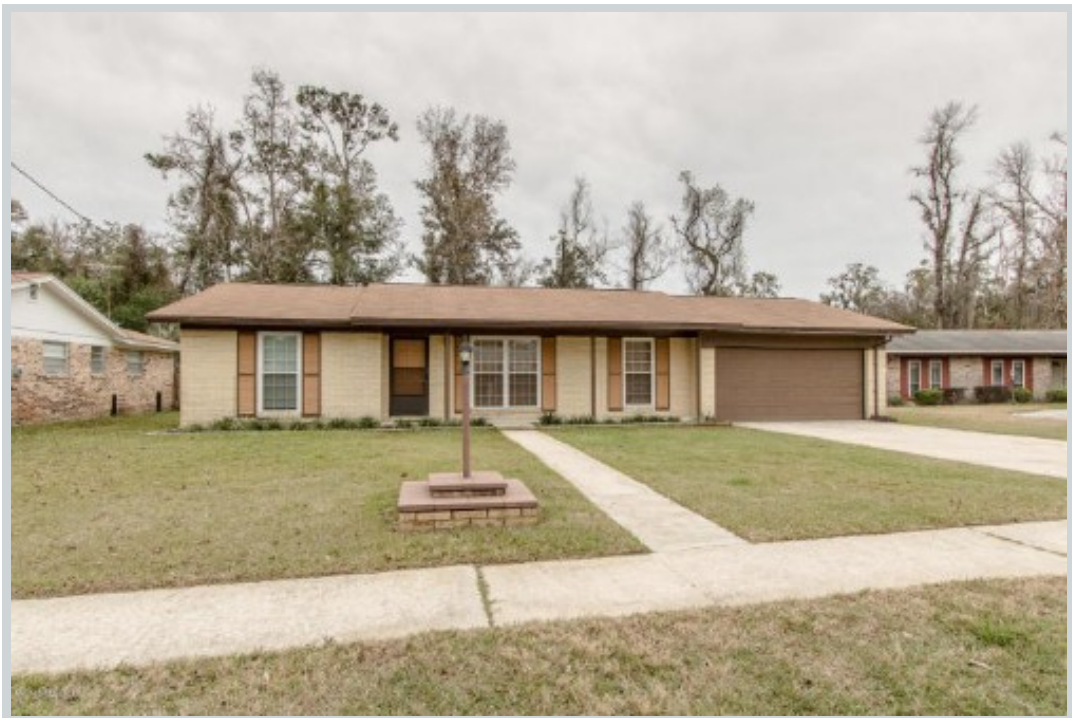
Listing Comp 3 1050 Bay Cir S

Address 1695 Pecan Court, Orange Park, FL 32073 Loan Number 37203 Suggested List $179,900 Suggested Repaired $179,900 Sale $175,000