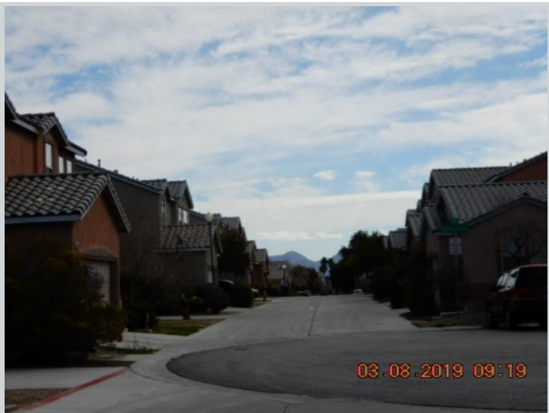
Subject 2713 Living Rock St