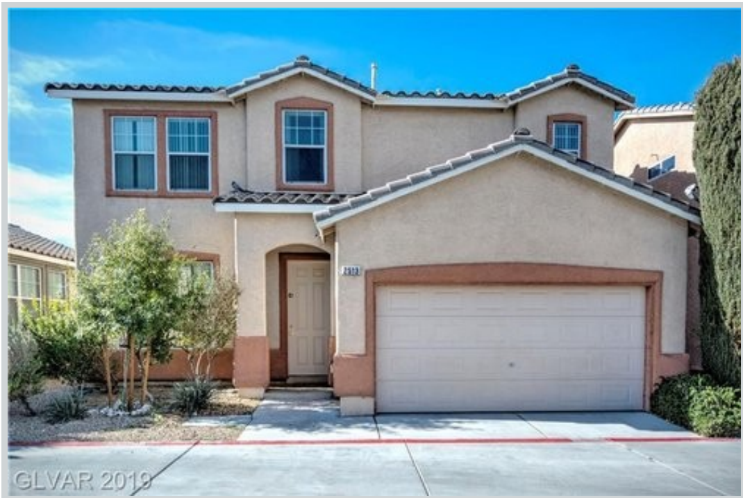
Listing Comp 2 2513 Plaid Cactus Ct