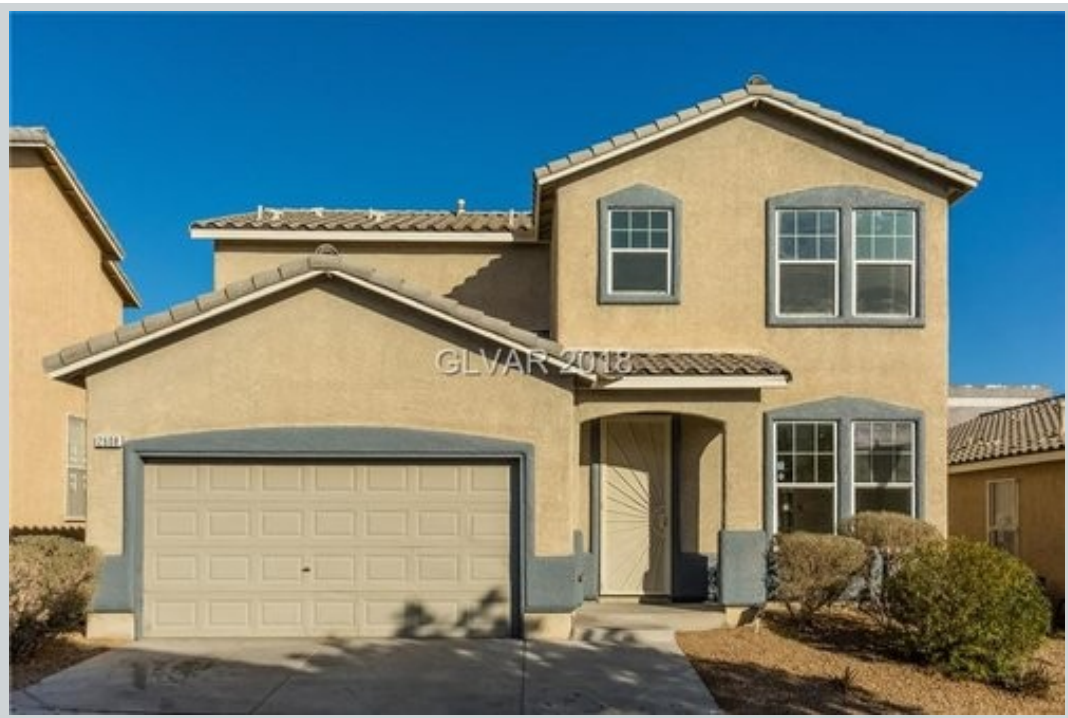
Sold Comp 3 2608 Living Rock St