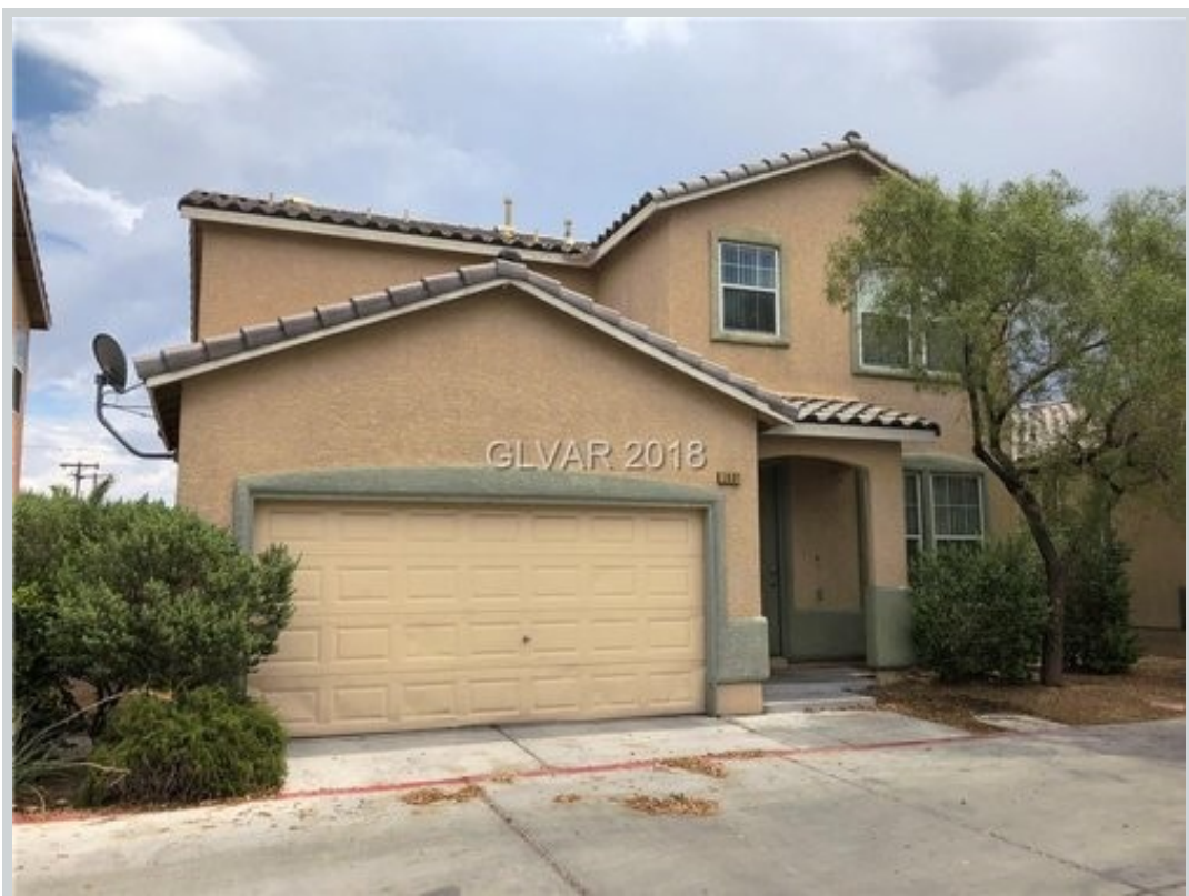
Sold Comp 1 2401 Blue Aloe Ct View Front