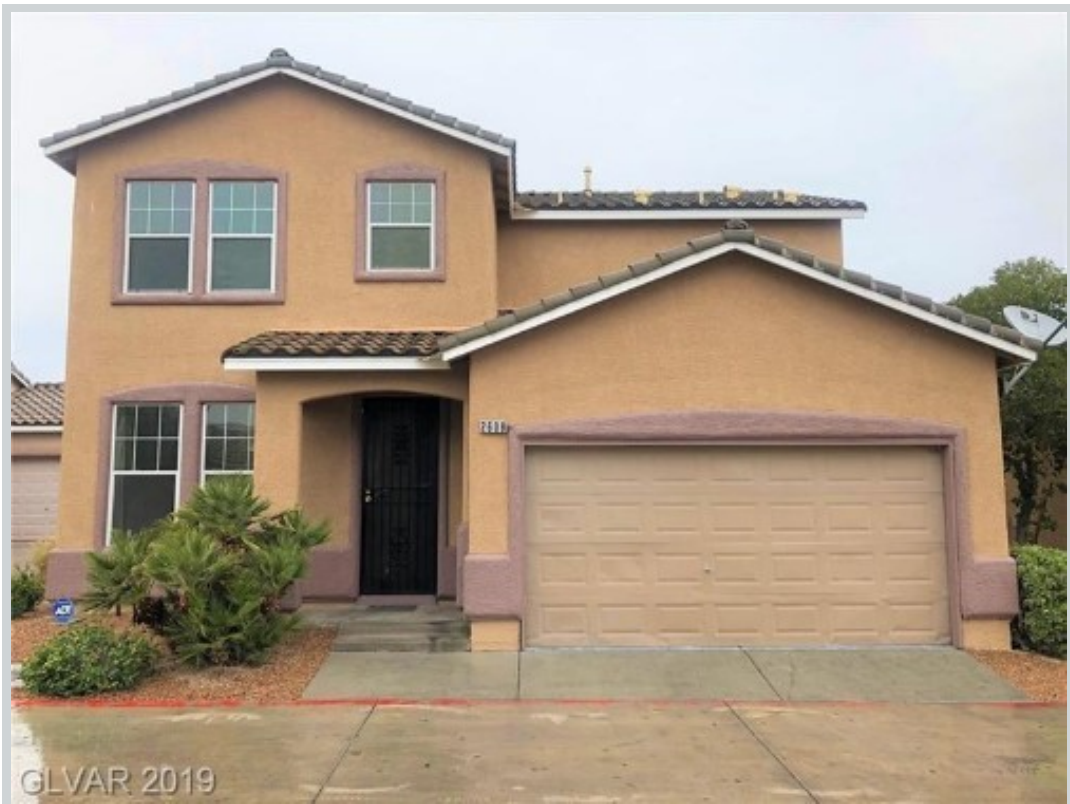
Listing Comp 3 2608 Owls Eyes Ct View Front

Address 2713 Living Rock Street, Las Vegas, NV 89106 Loan Number 37206 Suggested List $220,000 Suggested Repaired $220,000 Sale $210,000