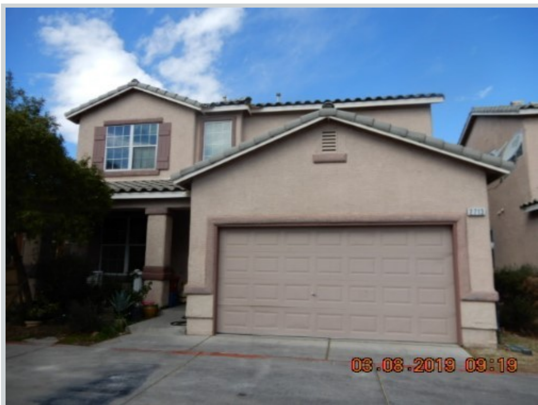
Subject 2713 Living Rock St