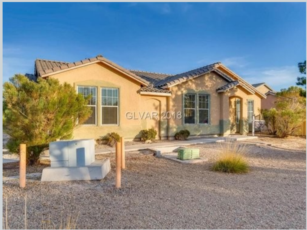
Sold Comp 2 2713 Corncob Cactus Ct