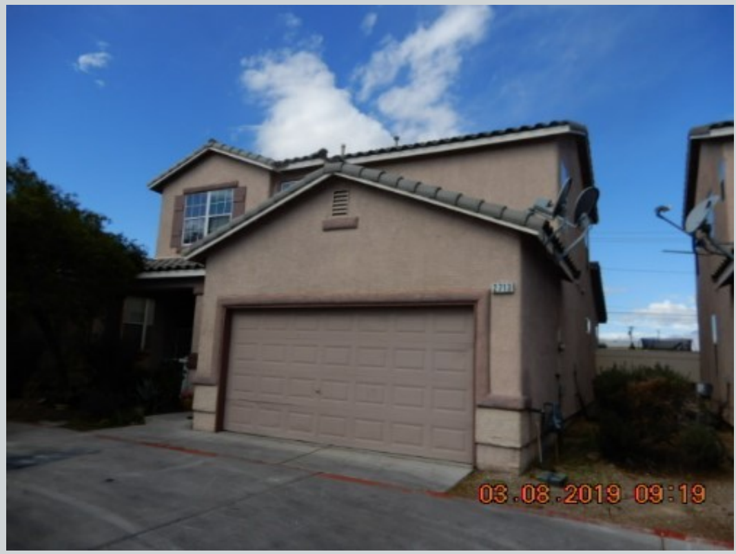
Subject 2713 Living Rock St