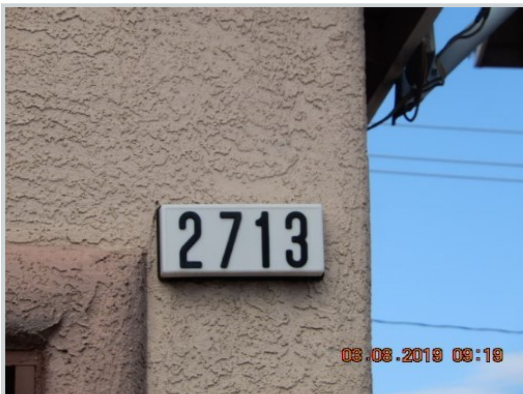
Subject 2713 Living Rock St