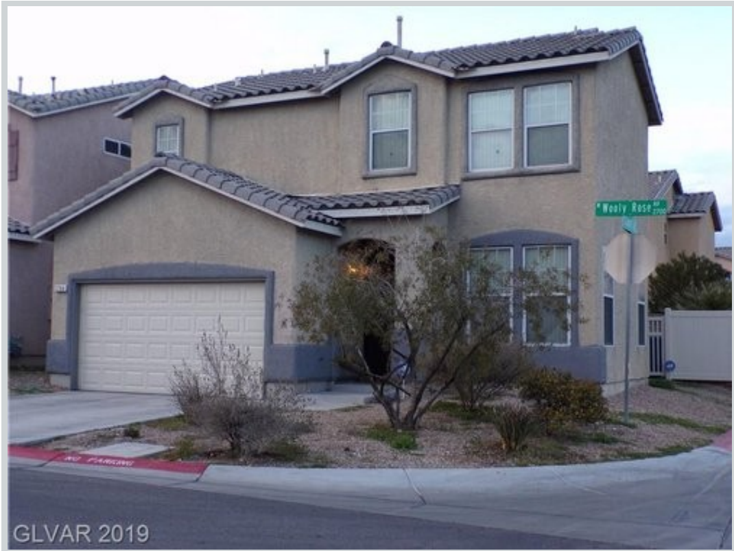
Listing Comp 1 2704 Woolly Rose Ave