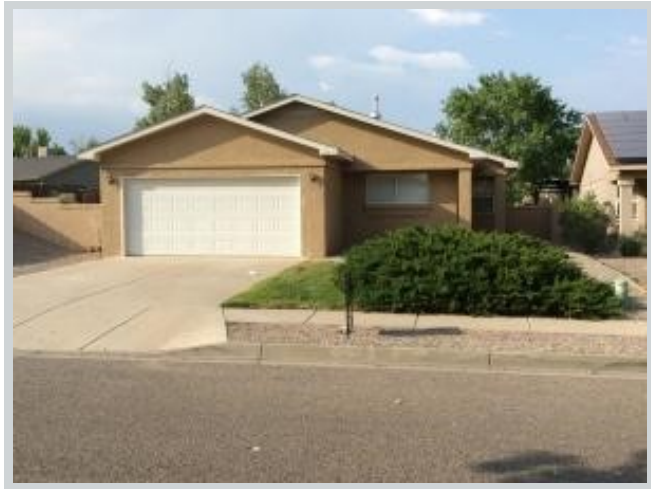
Sold Comp 1 601 Clayton Meadows Dr Ne View Front