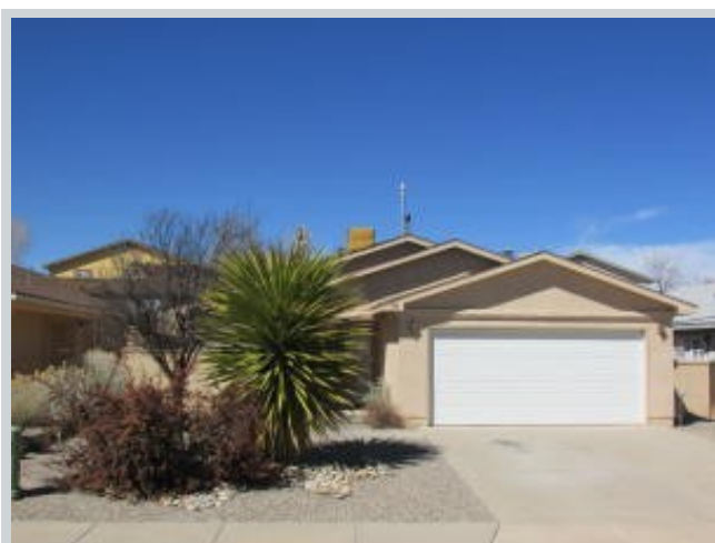
Listing Comp 3 541 Bloomfield Meadows Dr Ne View Front