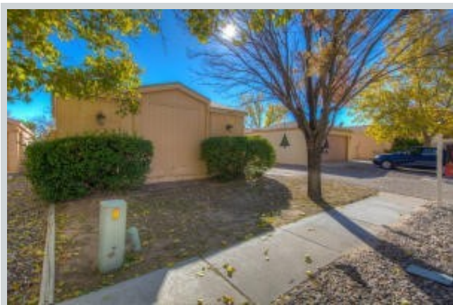
Listing Comp 2 1353 Rebecca Rd Ne View Front