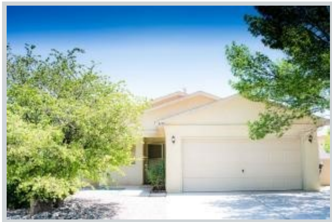
Subject 908 Somerset Meadows Dr Ne