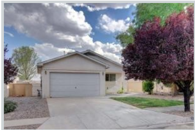
Sold Comp 2 720 Winston Meadows Dr Ne View Front