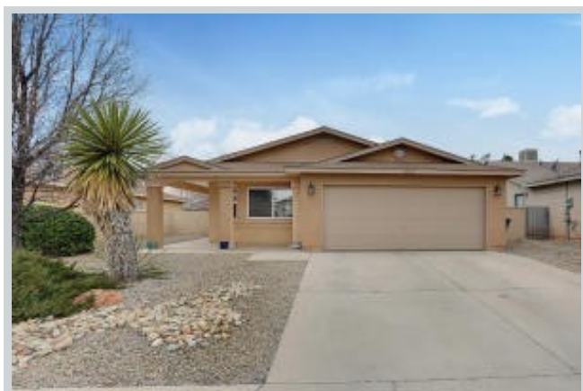
Listing Comp 1 3025 Mason Meadows Dr Ne View Front