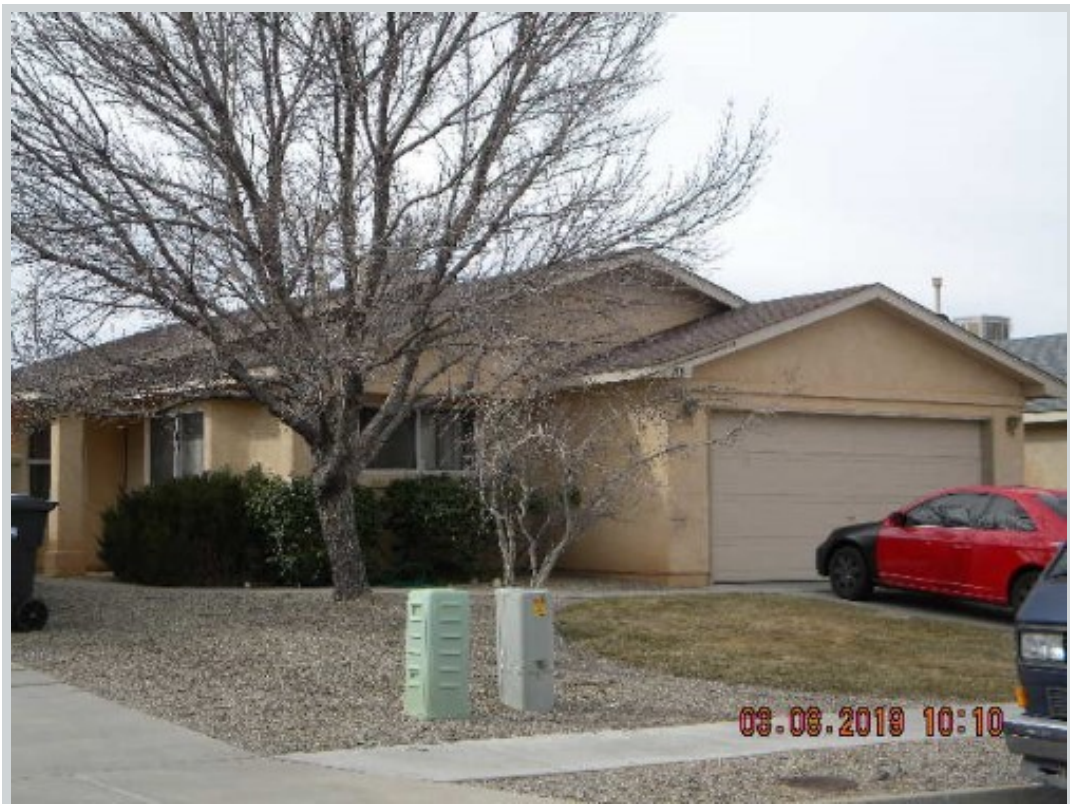
Subject 908 Somerset Meadows Dr Ne