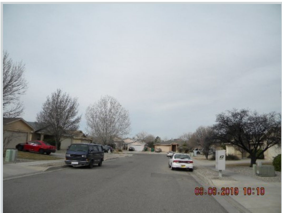
Subject 908 Somerset Meadows Dr Ne View Street Comment "Street - West"

Address 908 Somerset Meadows Drive Ne, Rio Rancho, NM 87144 Loan Number 37207 Suggested List $139,000 Suggested Repaired $139,000 Sale $135,000