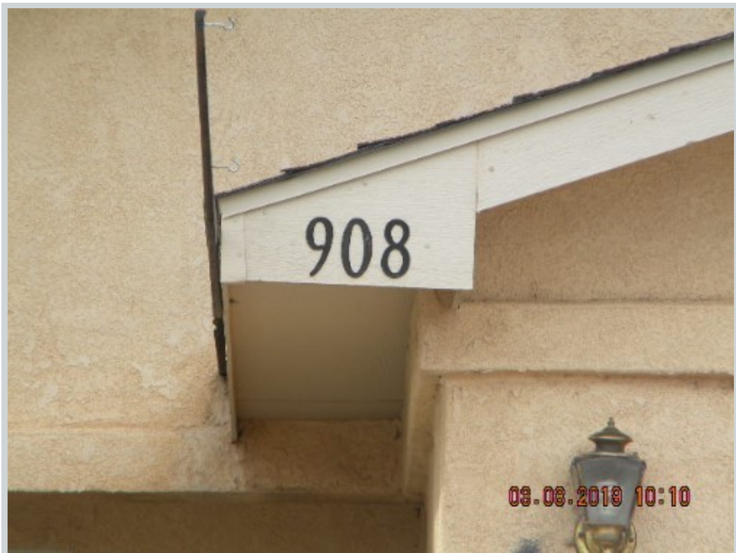
Subject 908 Somerset Meadows Dr Ne

Address 908 Somerset Meadows Drive Ne, Rio Rancho, NM 87144 Loan Number 37207 Suggested List $139,000 Suggested Repaired $139,000 Sale $135,000