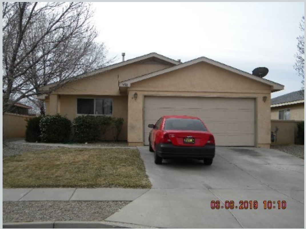
Subject 908 Somerset Meadows Dr Ne