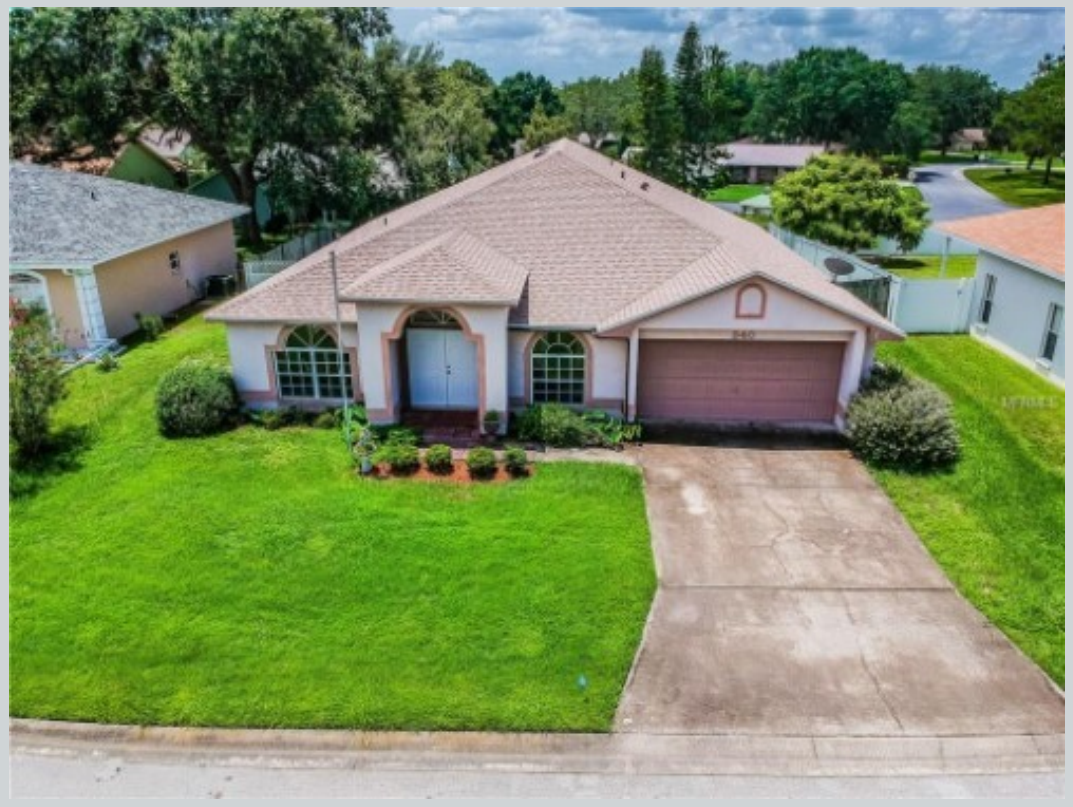
Sold Comp 1 340 Sterling Dr.