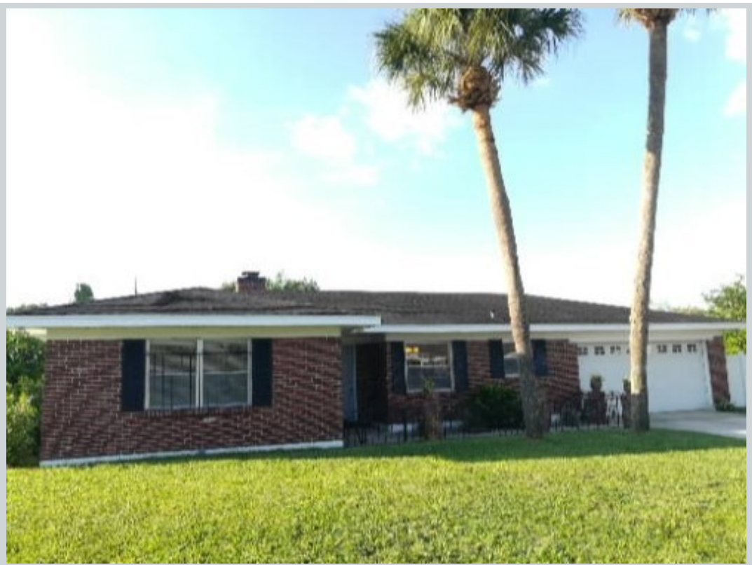
Sold Comp 2 133 Shelley Dr.