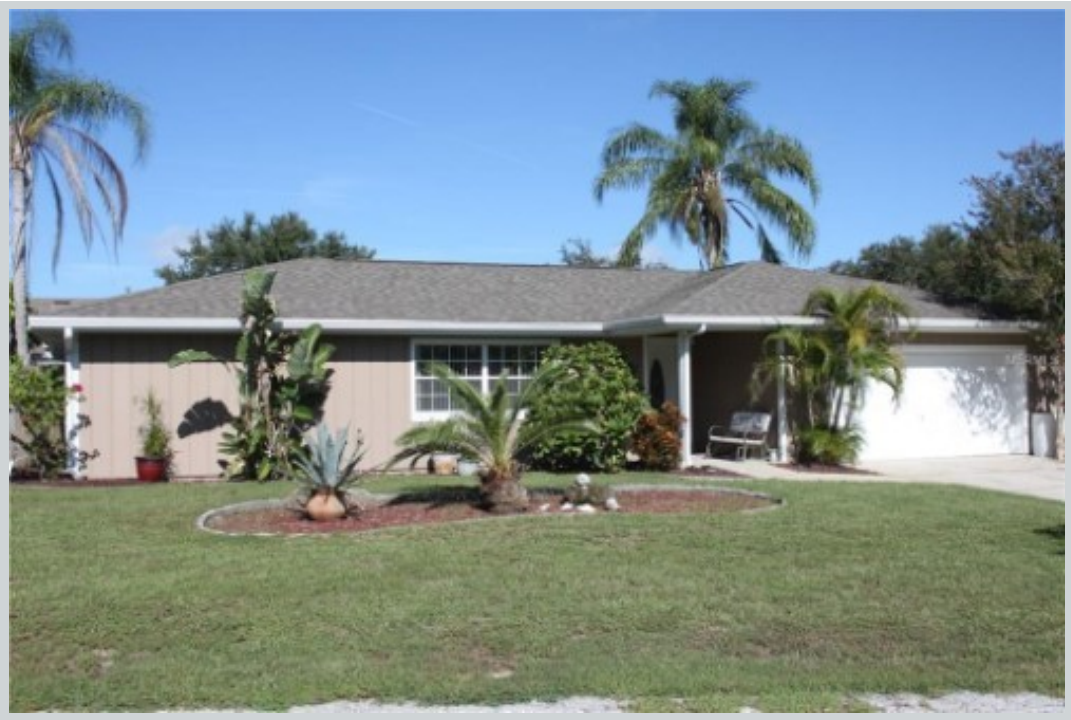
Sold Comp 3 942 W. Heron Cir.