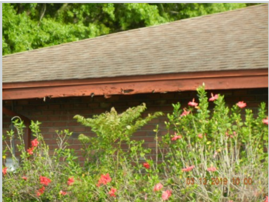
Subject 911 E Heron Cir