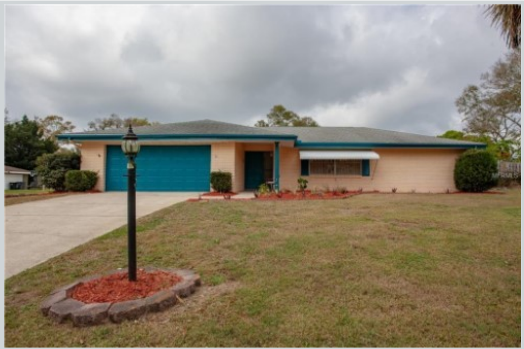
Listing Comp 3 1001 Mockingbird Cir.