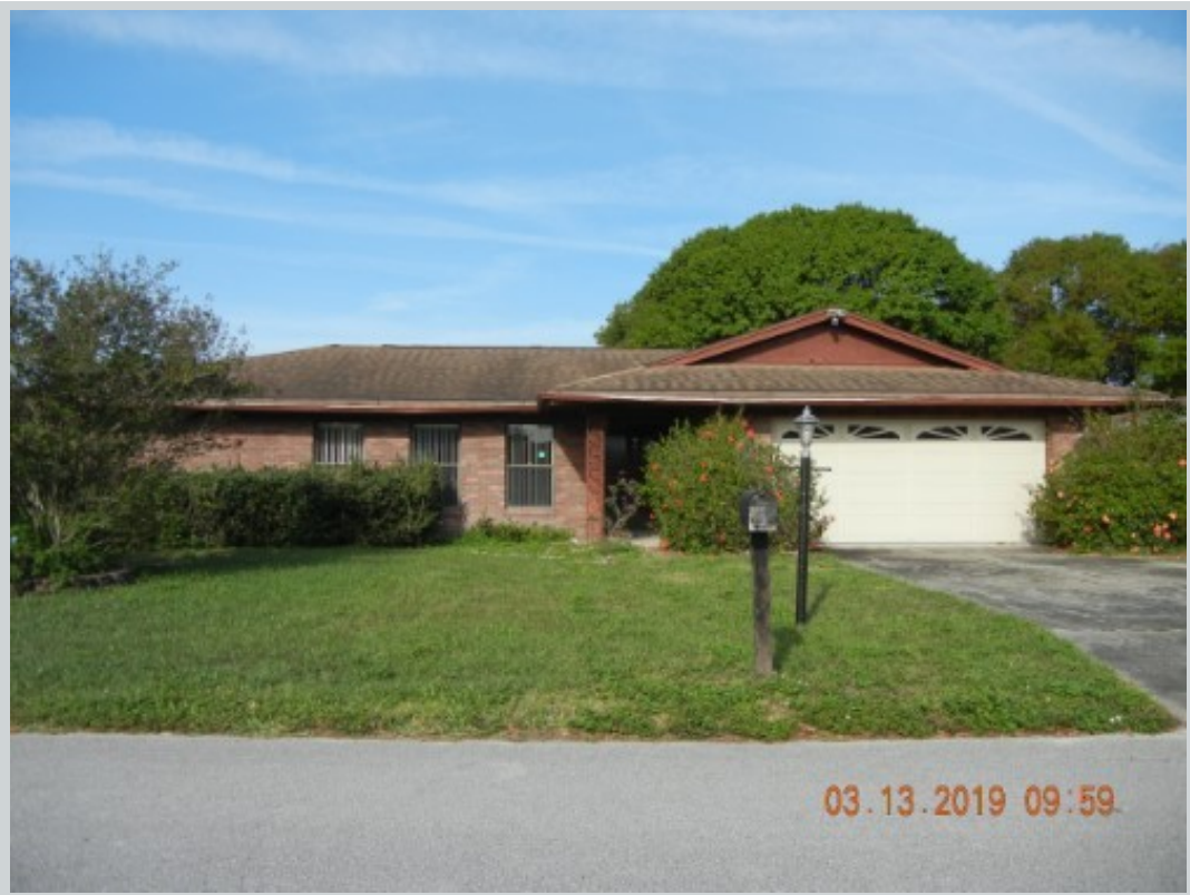
Subject 911 E Heron Cir