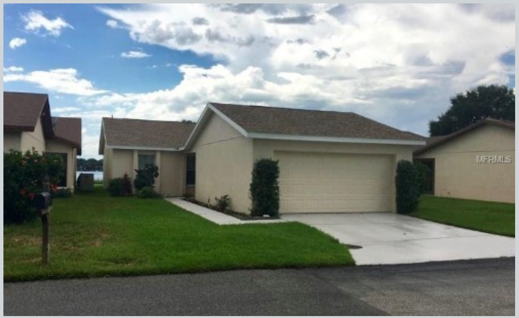
Listing Comp 2 3972 Cypress Landing W.