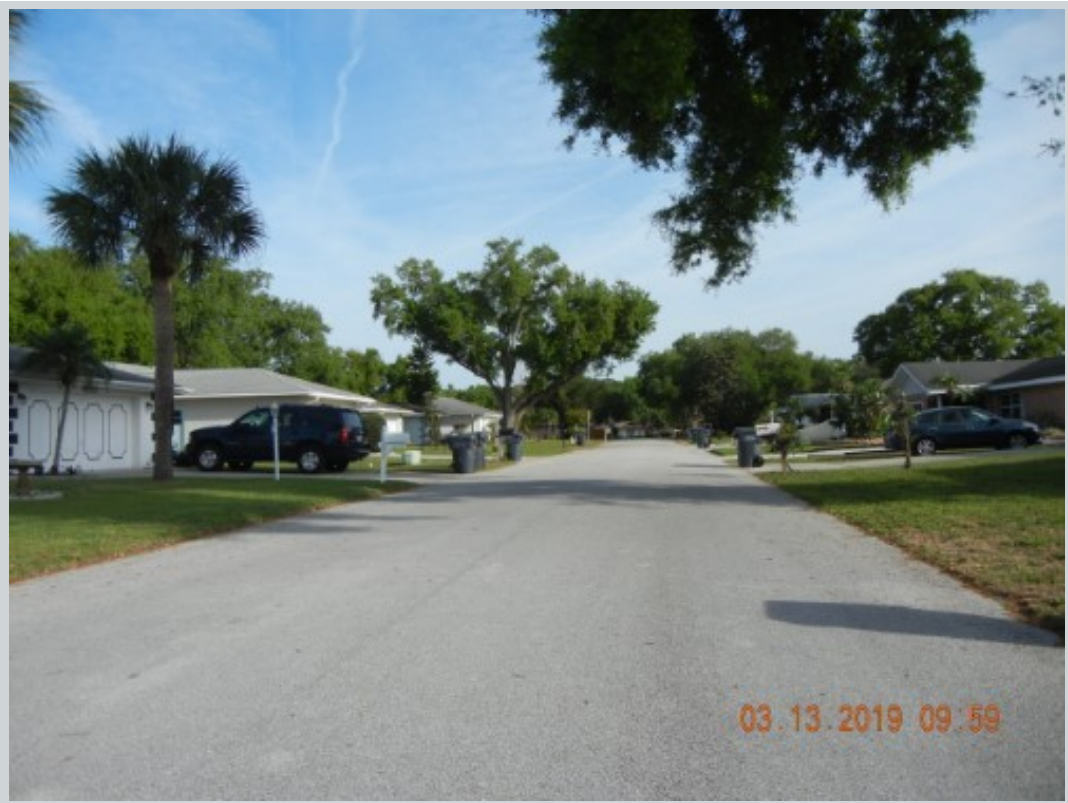
Subject 911 E Heron Cir