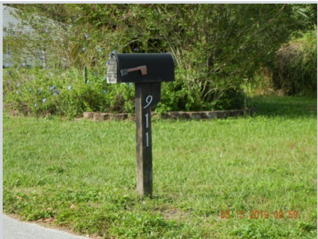
Subject 911 E Heron Cir