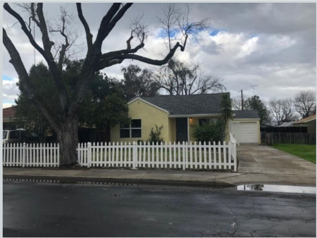
Listing Comp 1 1545 Pearl St