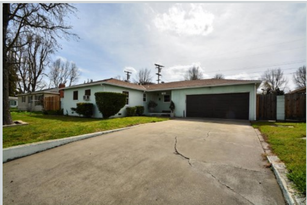
Listing Comp 2 1306 Joni Ave