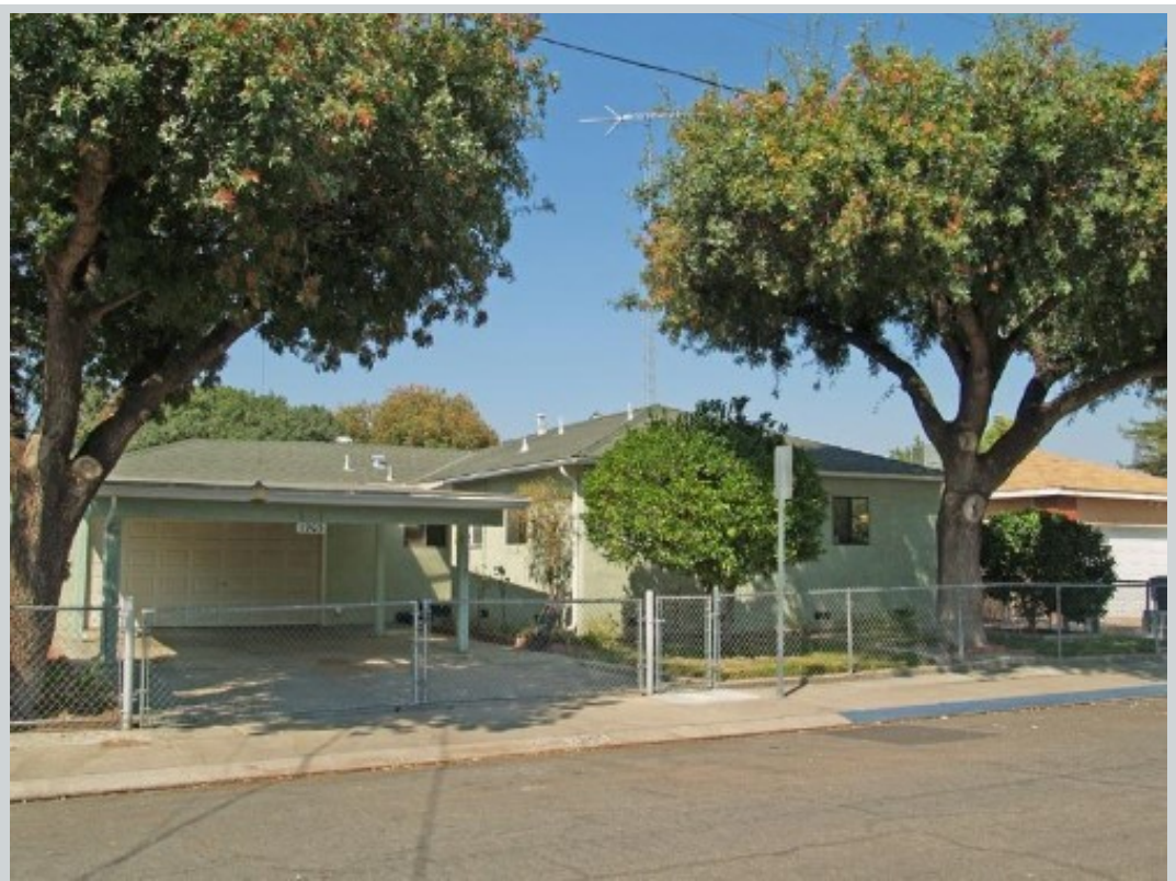
Sold Comp 3 1905 Ricky Ave