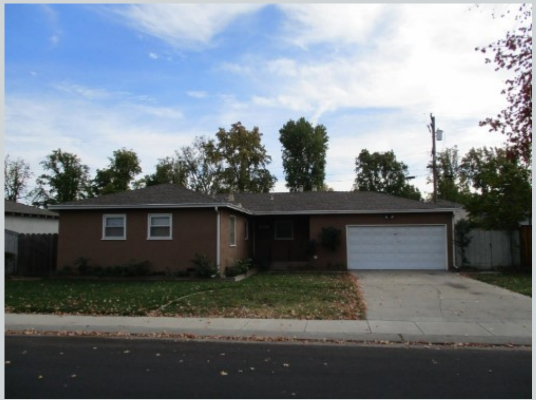
Sold Comp 2 1402 Joni Ave