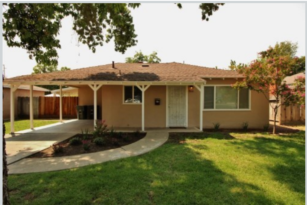
Sold Comp 1 916 Hawthorne Ave