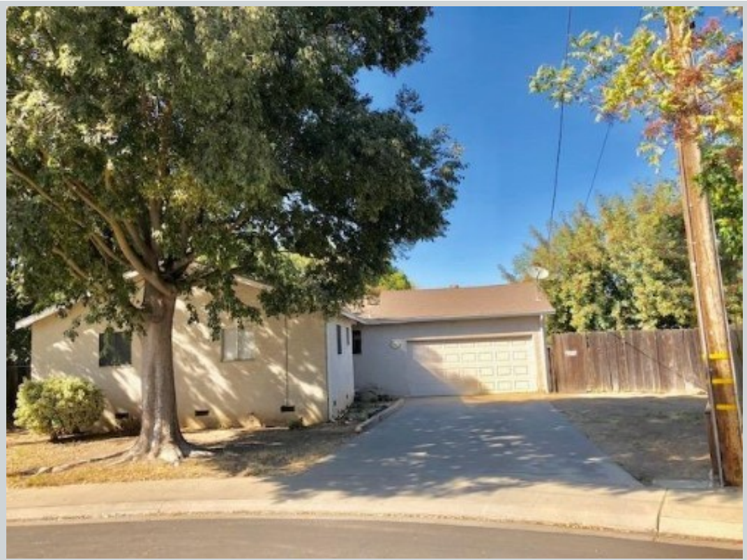
Listing Comp 3 1925 Klemm Ct