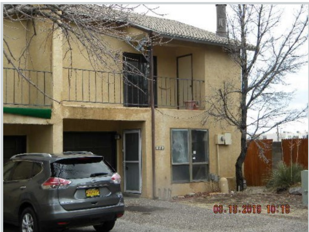
Subject 197 Vista Point Ct Ne