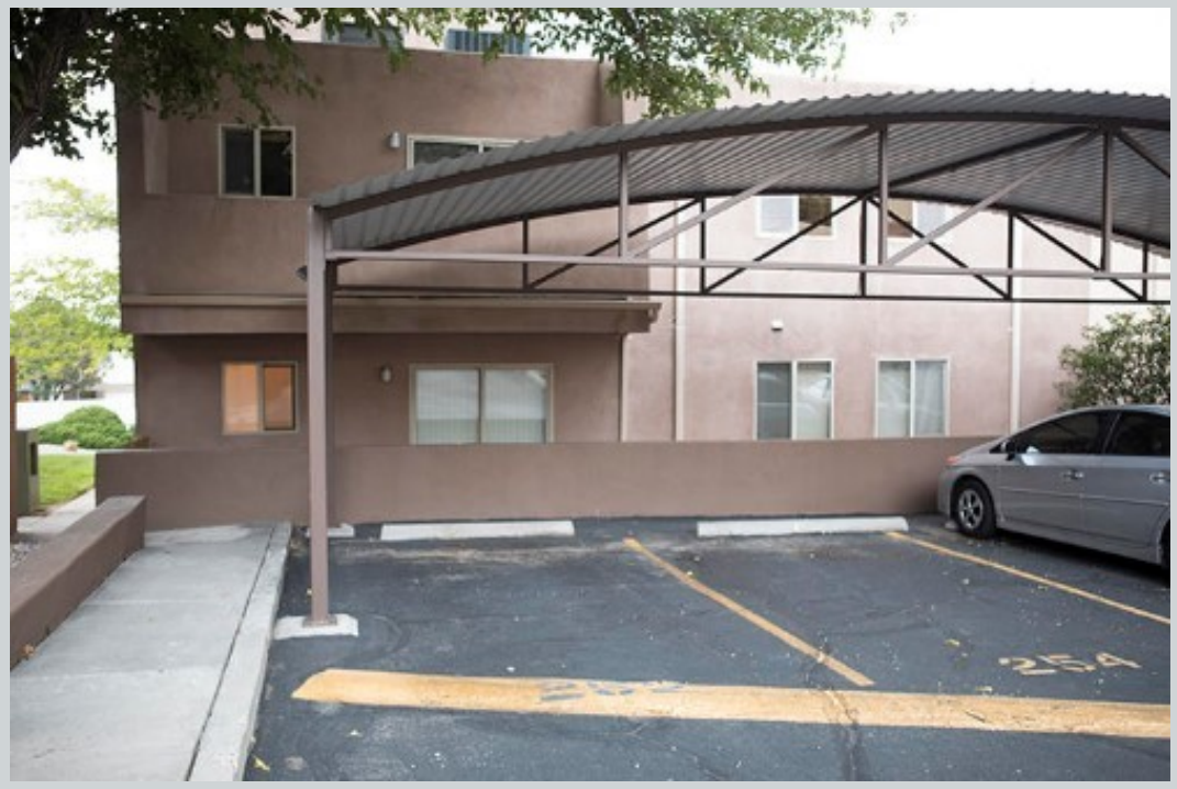
Listing Comp 1 13252 Candelaria Rd