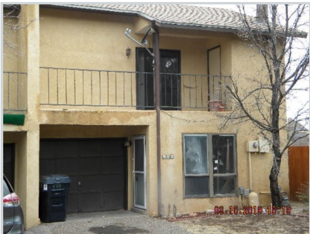
Subject 197 Vista Point Ct Ne