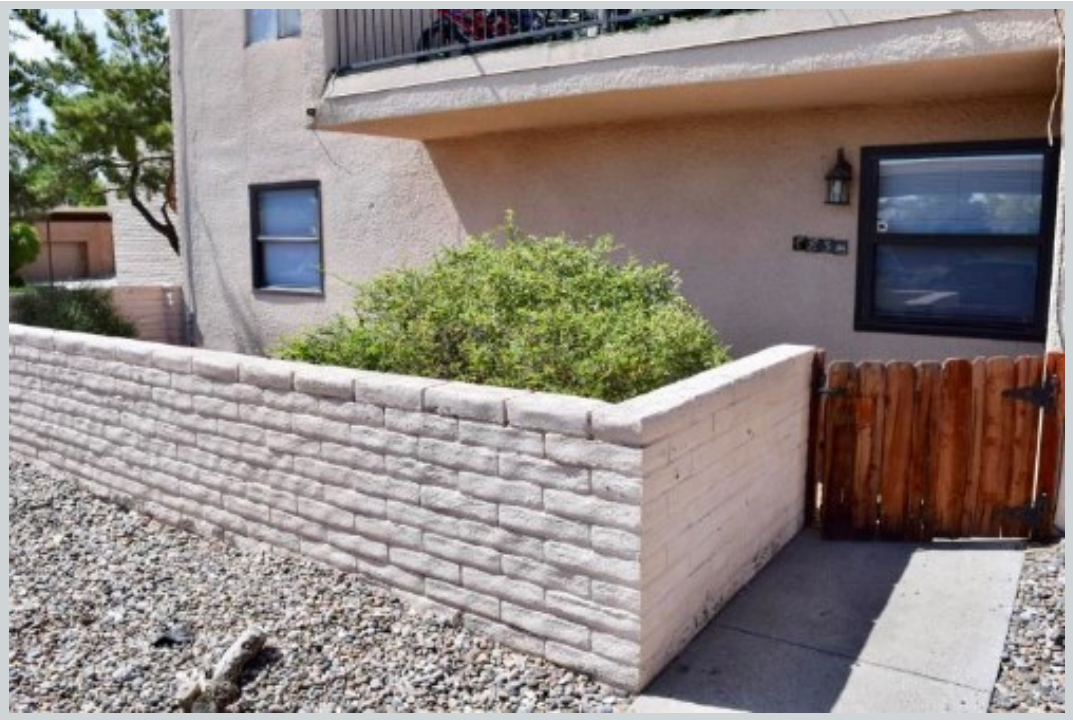
Listing Comp 3 3501 Juan Tabo Blvd E3