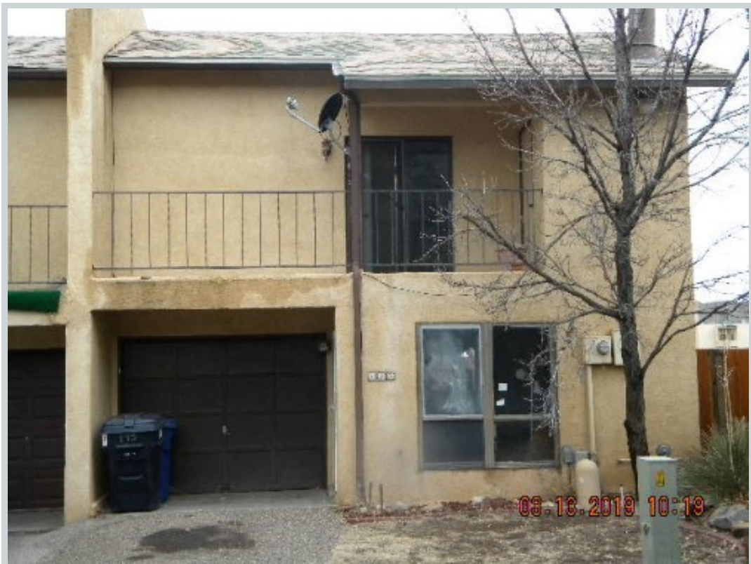
Subject 197 Vista Point Ct Ne