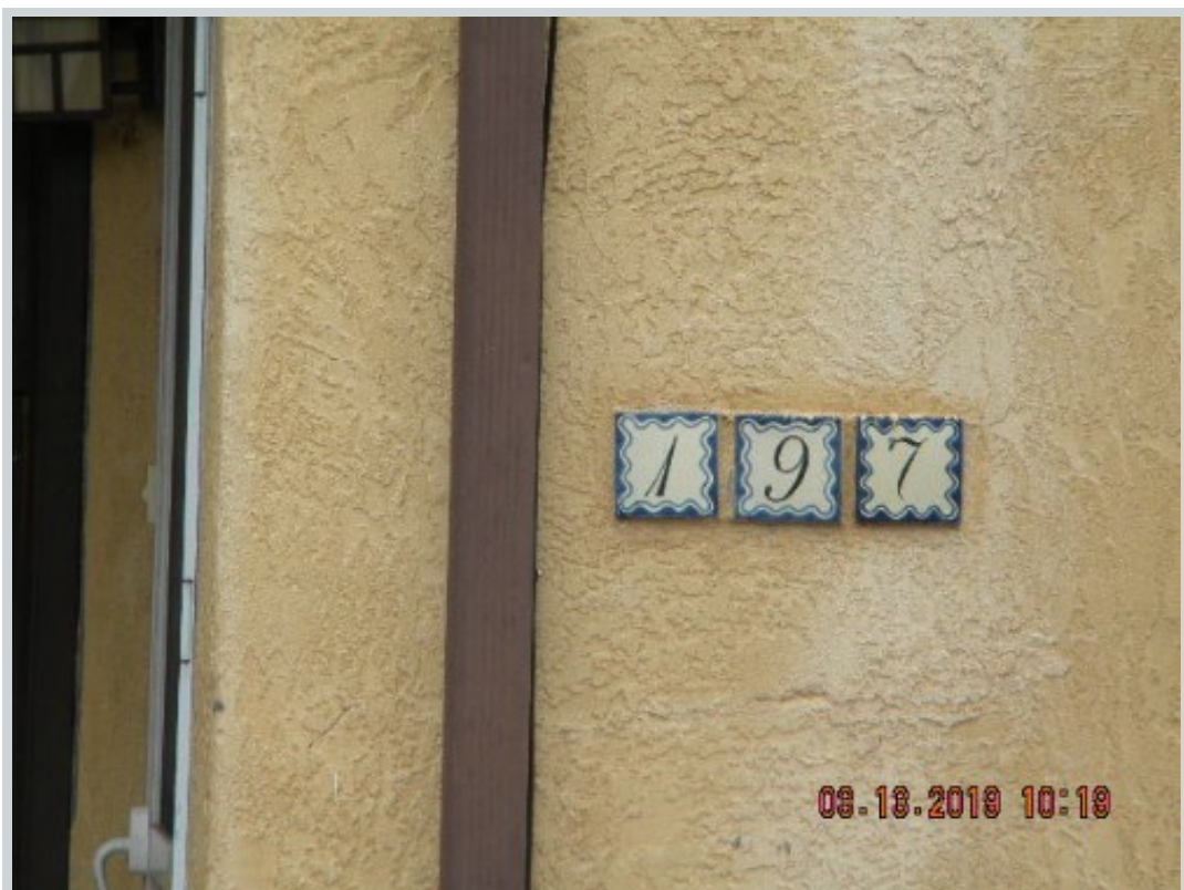
Subject 197 Vista Point Ct Ne