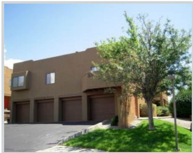
Sold Comp 3 2900 Vista Del Rey 33-D