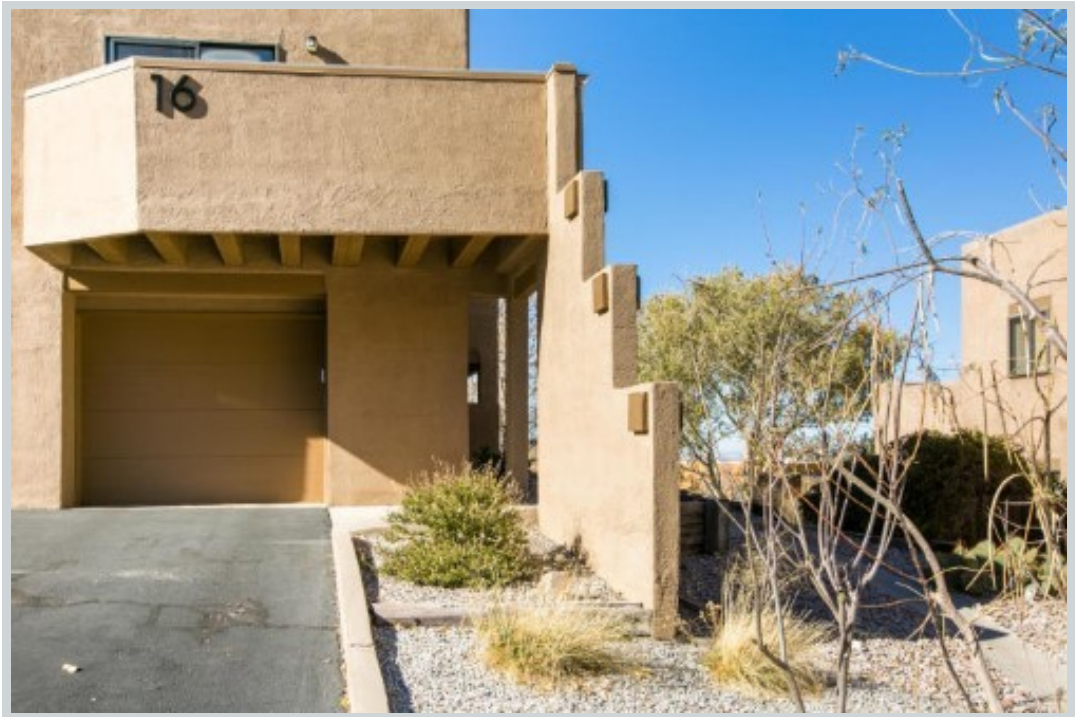
Sold Comp 2 2900 Vista Del Rey 16-D