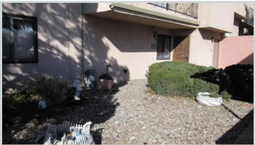
Listing Comp 2 3501 Juan Tabo Blvd D5