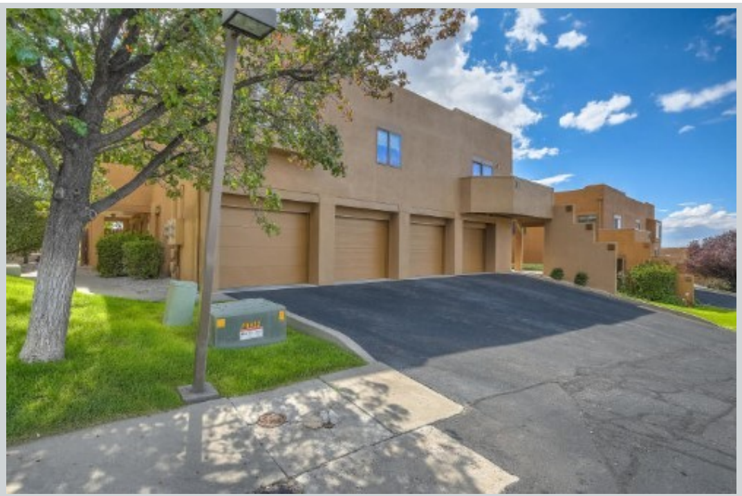
Sold Comp 1 2900 Vista Del Rey 31-C