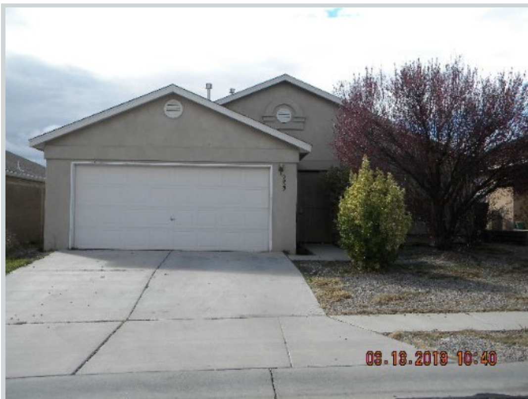
Subject 9022 Seaside Rd Nw