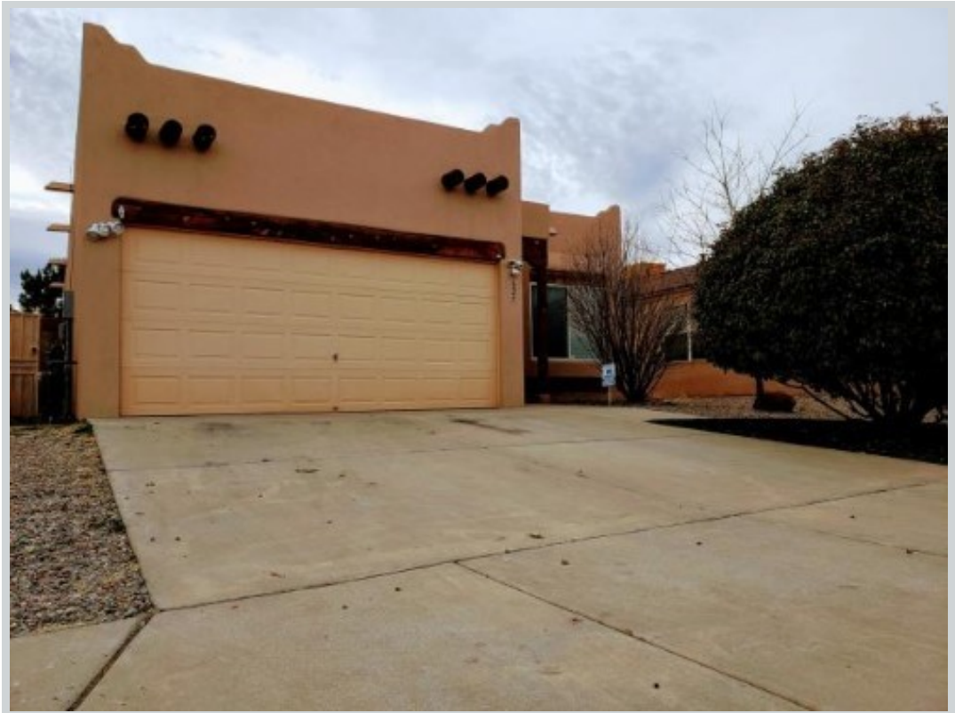
Listing Comp 1 627 Cyan Ct Nw