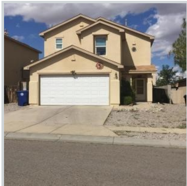
Listing Comp 2 9701 Gemstone Rd Sw