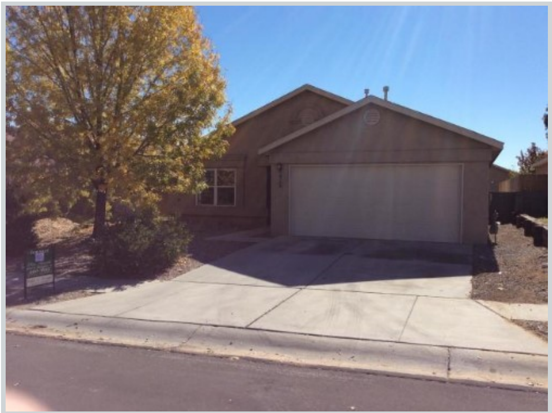
Sold Comp 1 9100 Starboard Rd Nw