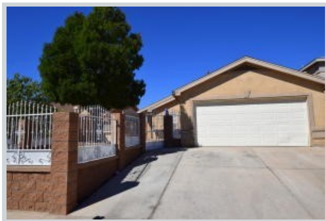
Sold Comp 3 439 Barberry St Sw