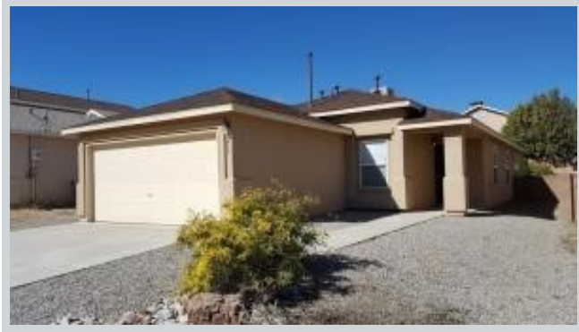
Listing Comp 3 8215 Crimson Ave Nw View Front