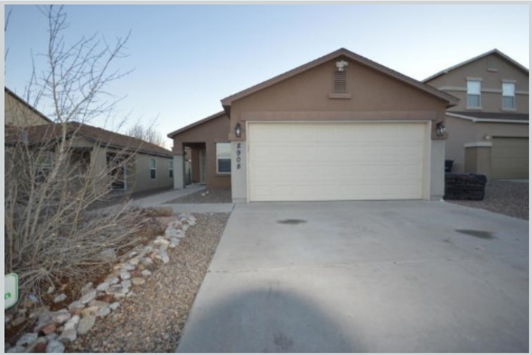
Sold Comp 2 8908 Hatteras Pl Nw