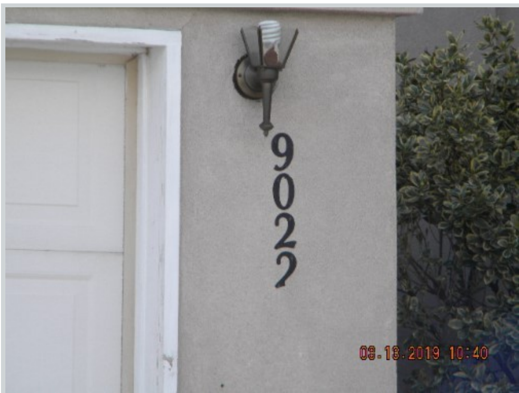
Subject 9022 Seaside Rd Nw