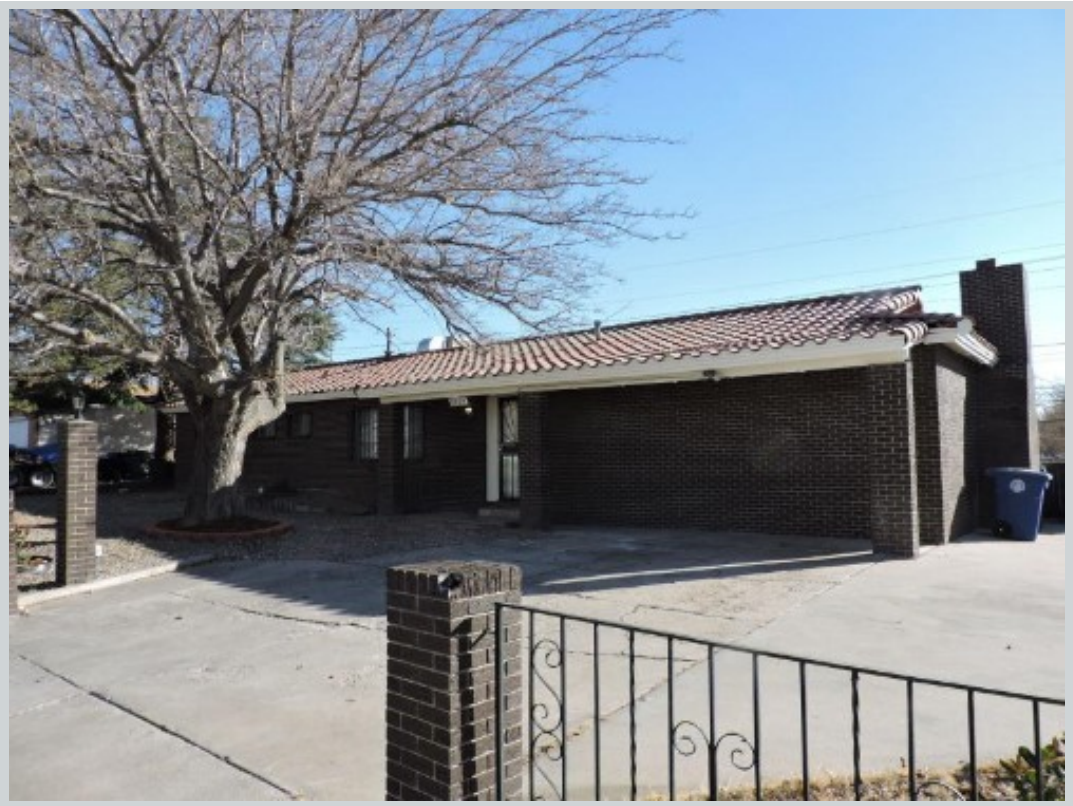
Listing Comp 1 8804 Lagrima De Oro Rd Ne