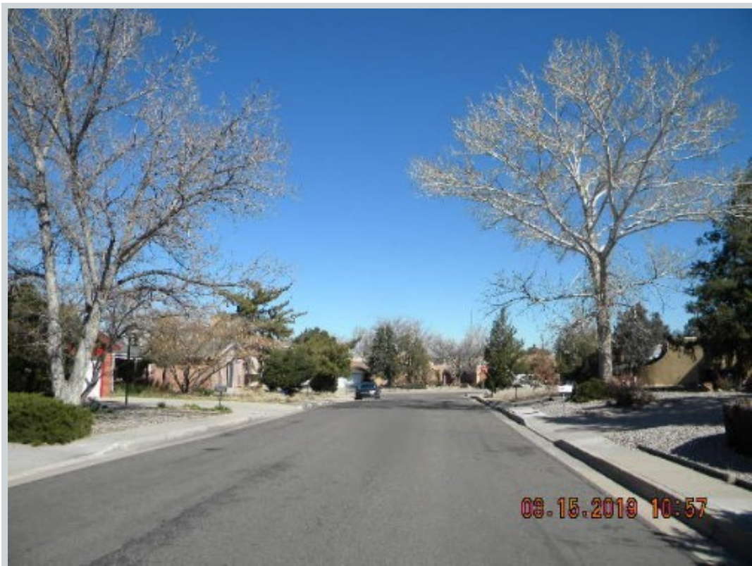
Subject 3816 Cheraz Rd Ne Comment "Street – North"

Address 3816 Cheraz Road Ne, Albuquerque, NM 87111 Loan Number 37255 Suggested List $210,000 Suggested Repaired $210,000 Sale $205,000