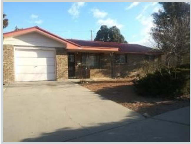
Listing Comp 3 8719 Gutierrez Rd Ne View Front