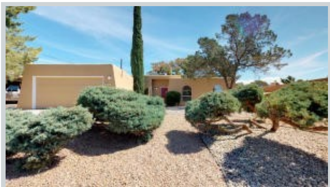
Sold Comp 2 3804 Altez St Ne View Front

Address 3816 Cheraz Road Ne, Albuquerque, NM 87111 Loan Number 37255 Suggested List $210,000 Suggested Repaired $210,000 Sale $205,000