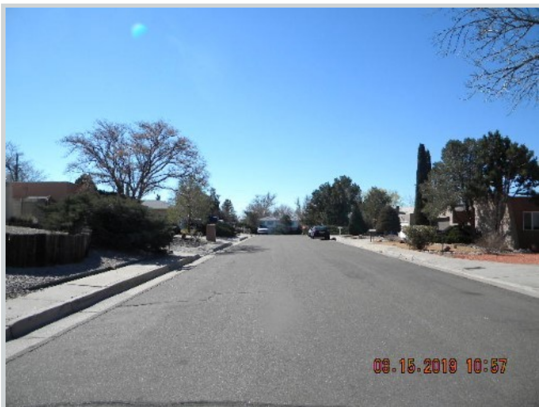
Subject 3816 Cheraz Rd Ne Comment "Street – South"