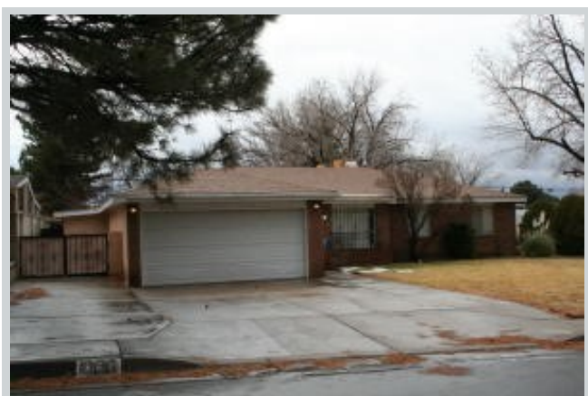
Sold Comp 3 8900 Delamar Ave Ne View Front