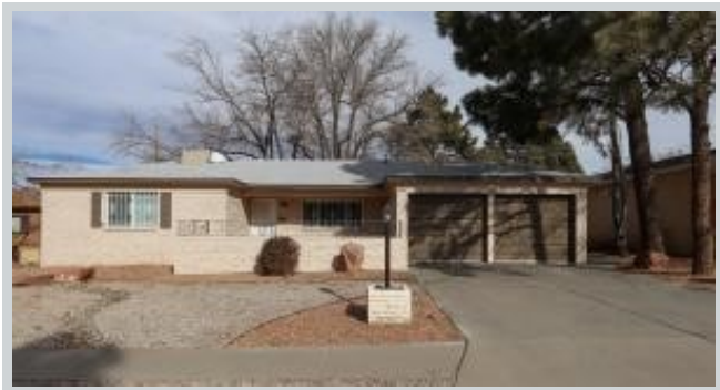
Sold Comp 1 9513 Dona Marguerita Ave Ne View Front