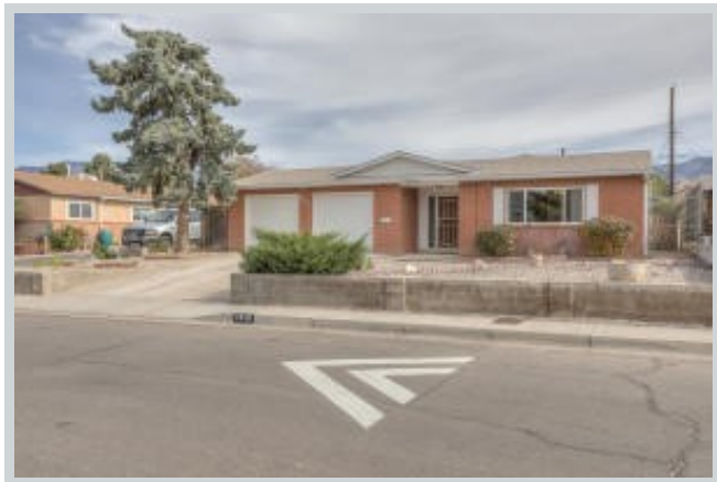
Listing Comp 2 3816 Moon St Ne