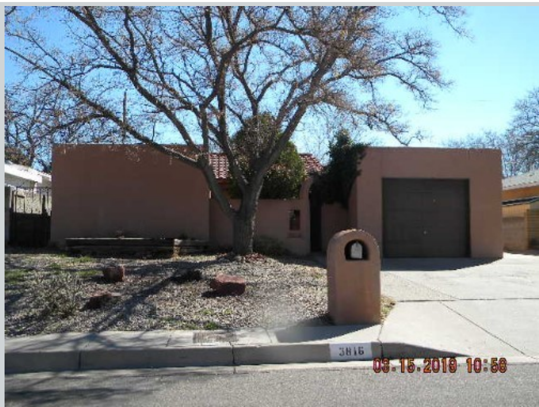
Subject 3816 Cheraz Rd Ne