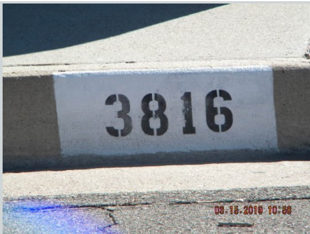
Subject 3816 Cheraz Rd Ne