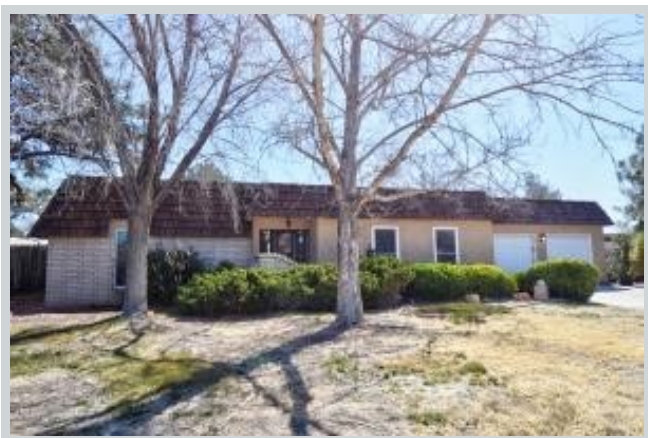
Listing Comp 2 10304 Jarmel Dr Nw View Front