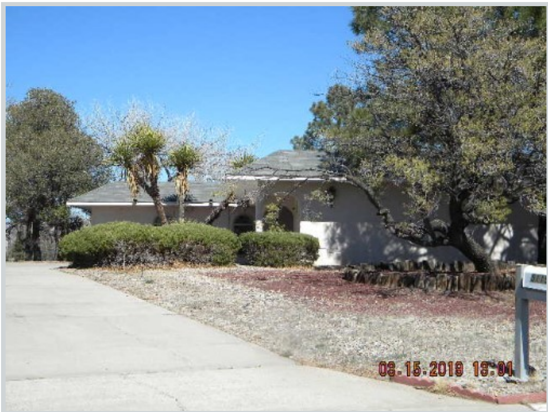
Subject 5119 Justin Dr Nw

Address 5119 Justin Drive, Albuquerque, NM 87114 Loan Number 37256 Suggested List $239,000 Suggested Repaired $239,000 Sale $230,000