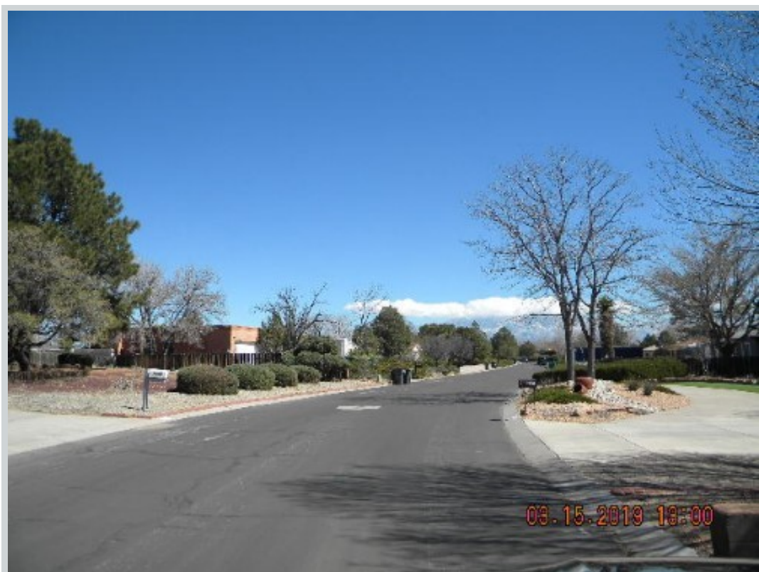
Subject 5119 Justin Dr Nw View Street Comment "Street – East"

Address 5119 Justin Drive, Albuquerque, NM 87114 Loan Number 37256 Suggested List $239,000 Suggested Repaired $239,000 Sale $230,000