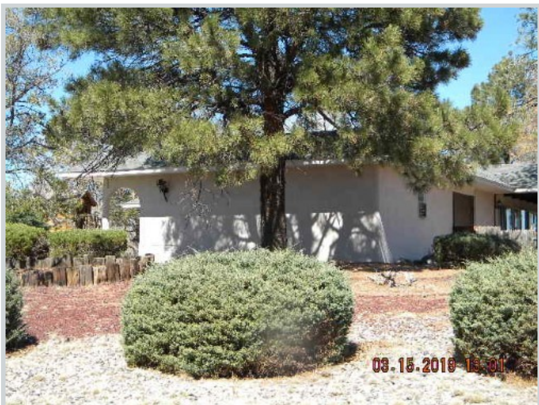
Subject 5119 Justin Dr Nw Comment "Right side"