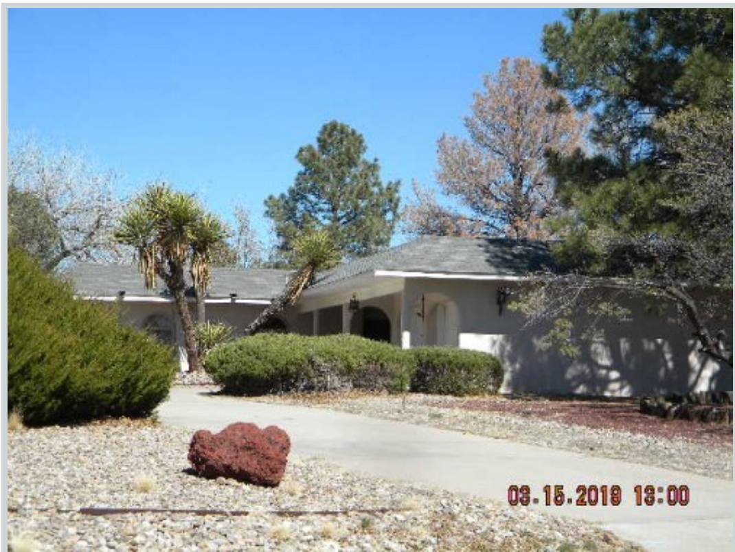
Subject 5119 Justin Dr Nw Comment "Left side"

Address 5119 Justin Drive, Albuquerque, NM 87114 Loan Number 37256 Suggested List $239,000 Suggested Repaired $239,000 Sale $230,000