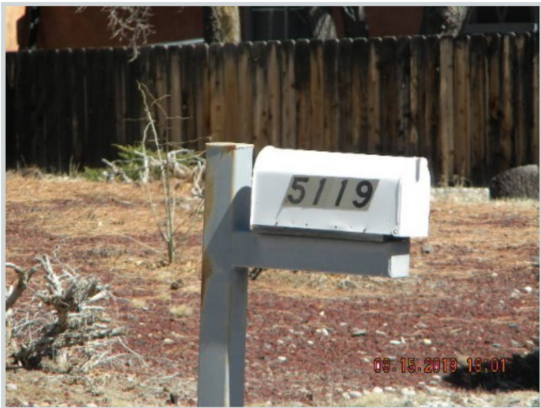
Subject 5119 Justin Dr Nw