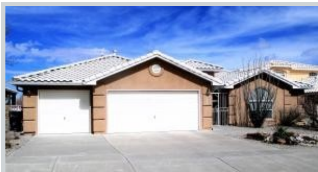
Listing Comp 3 5505 Rabadi Castle Ave Nw View Front

Address 5119 Justin Drive, Albuquerque, NM 87114 Loan Number 37256 Suggested List $239,000 Suggested Repaired $239,000 Sale $230,000