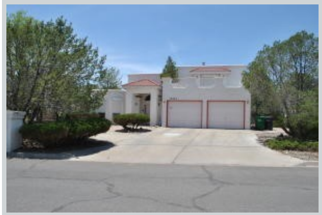
Sold Comp 3 10305 Rempas Dr Nw View Front