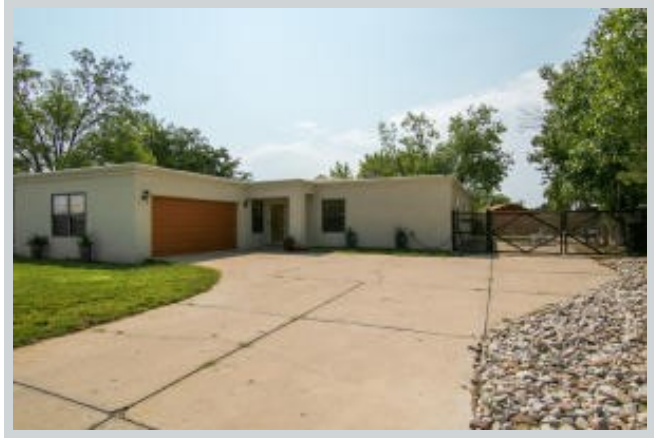
Sold Comp 2 10320 Rempas Ct Nw View Front

Address 5119 Justin Drive, Albuquerque, NM 87114 Loan Number 37256 Suggested List $239,000 Suggested Repaired $239,000 Sale $230,000