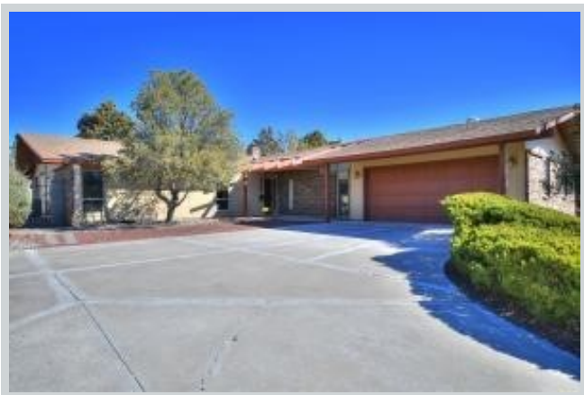
Listing Comp 1 5143 Russell Dr Nw View Front

Address 5119 Justin Drive, Albuquerque, NM 87114 Loan Number 37256 Suggested List $239,000 Suggested Repaired $239,000 Sale $230,000