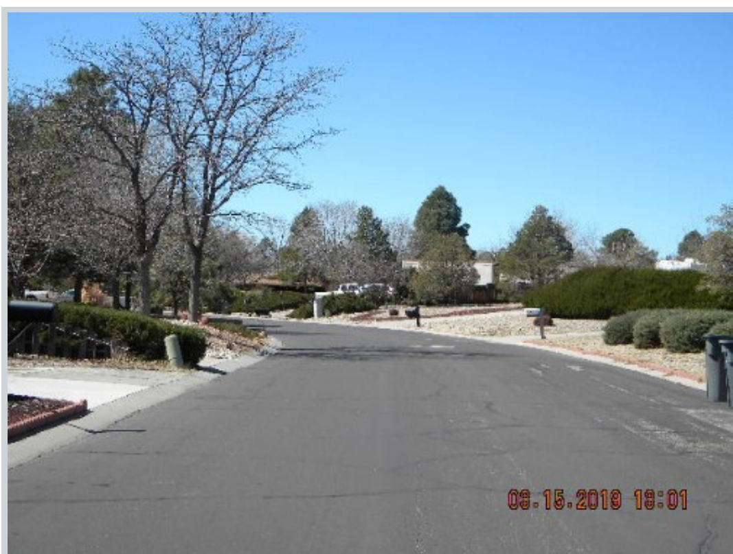
Subject 5119 Justin Dr Nw View Street Comment "Street – West"