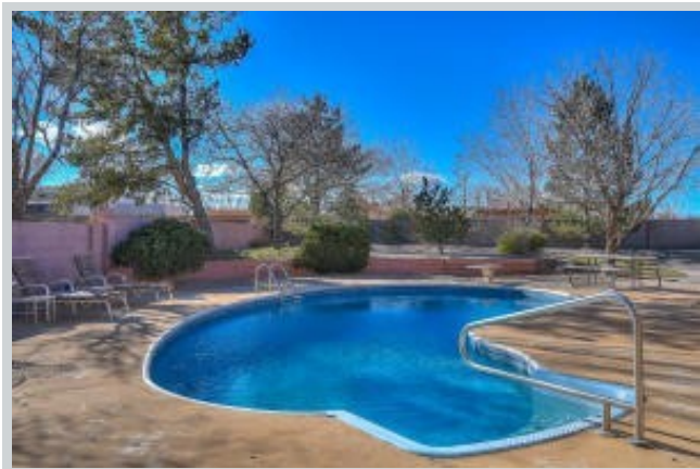
Sold Comp 1 5108 Irving Blvd Nw View Front