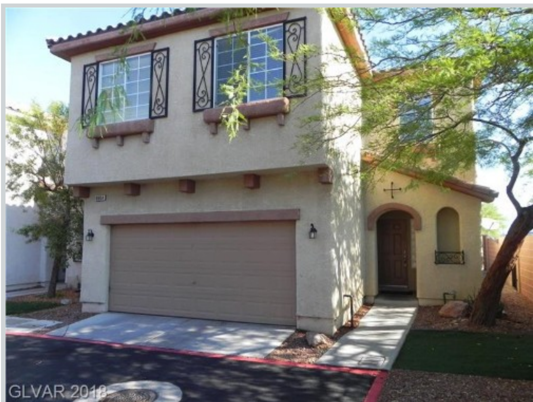
Sold Comp 1 8904 Nautilus Vista Ct