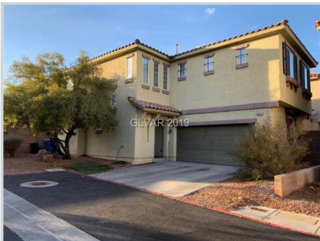
Listing Comp 3 8956 Gray Quail Ct