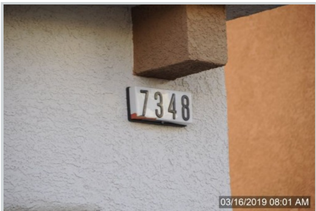
Subject 7348 Nautical Stone Ct