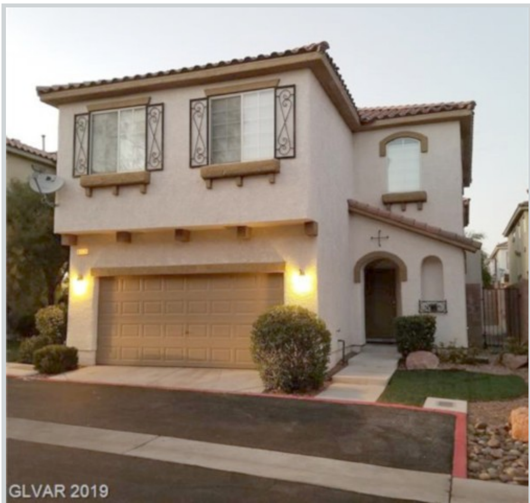
Listing Comp 1 8932 Fargo Fair Ct