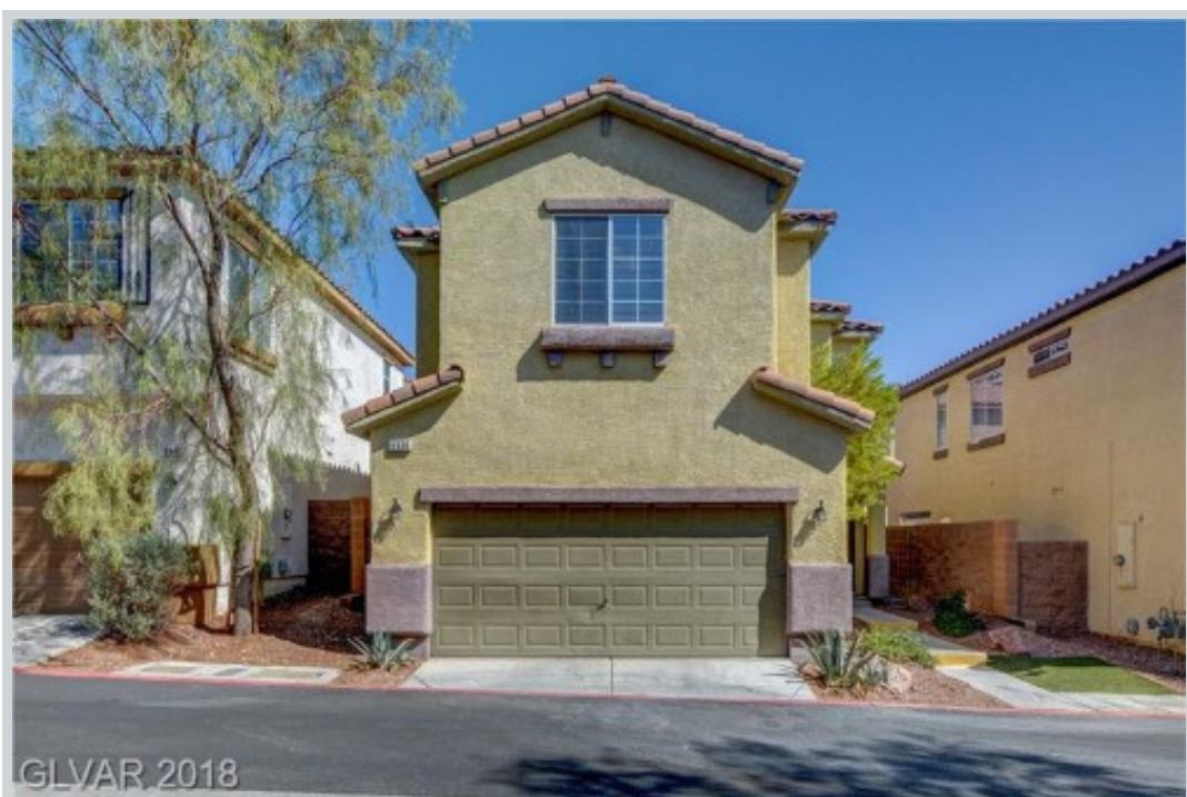
Sold Comp 3 8936 Addison Walk Ct