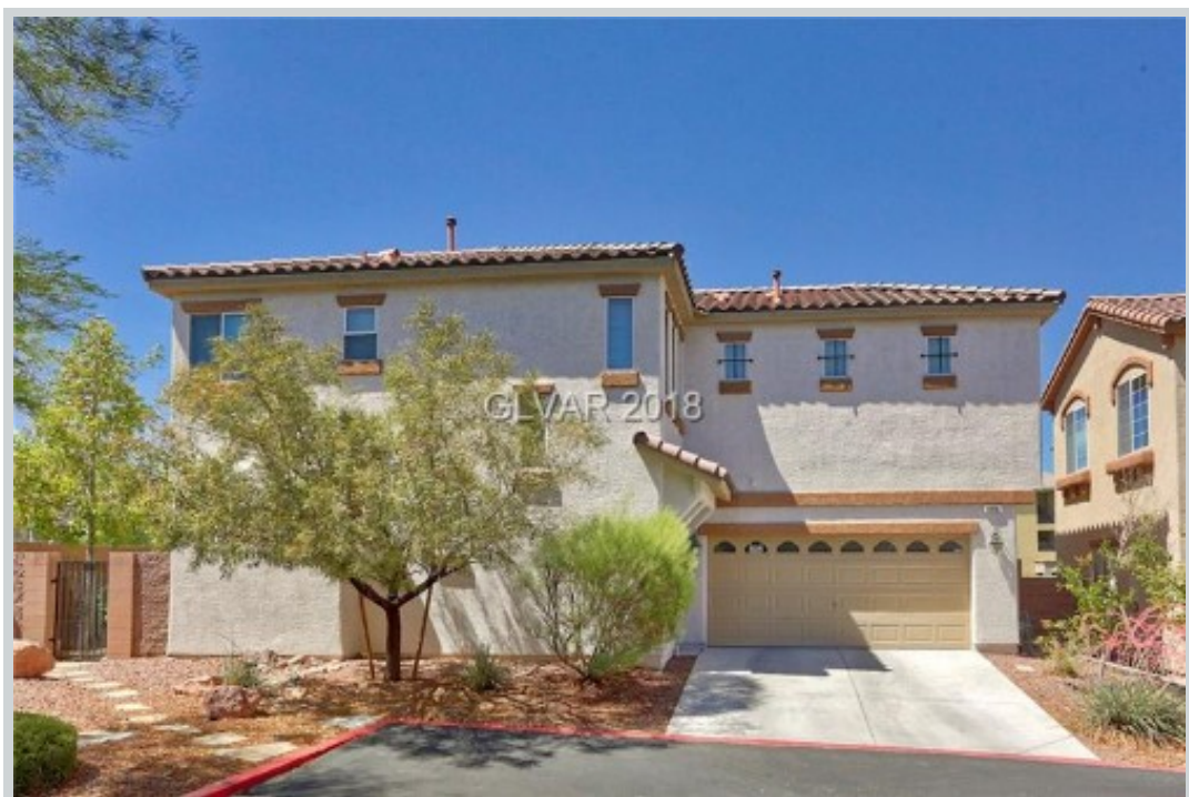
Listing Comp 2 8956 Changing Tides Ct