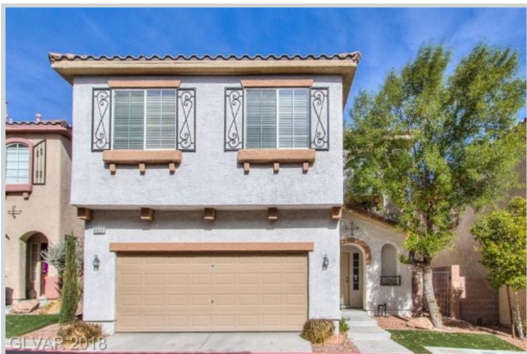
Sold Comp 2 8932 Caledon Ridge Ct