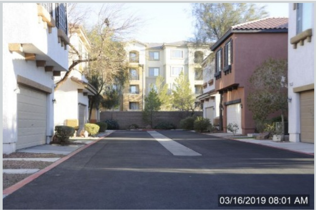
Subject 7348 Nautical Stone Ct