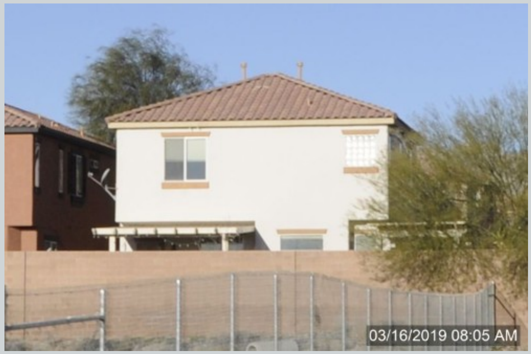
Subject 7348 Nautical Stone Ct