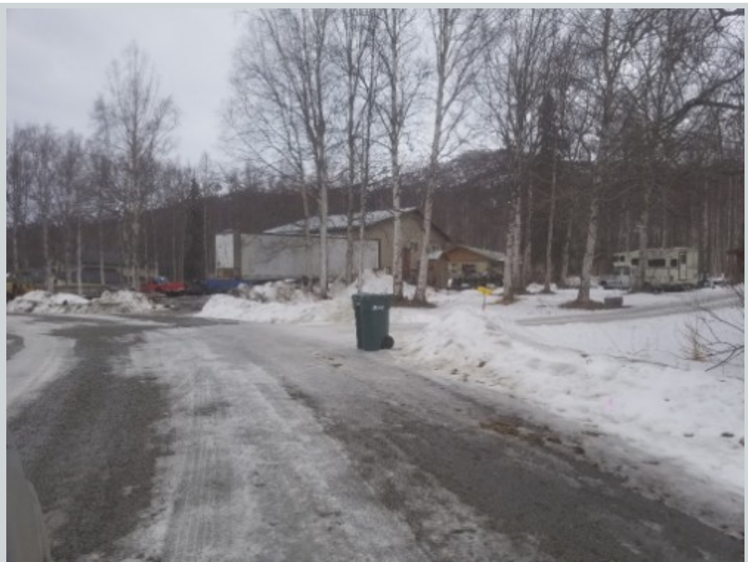
Subject 14206 Harold Loop