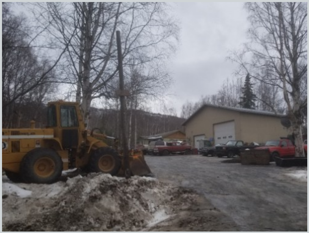
Subject 14206 Harold Loop