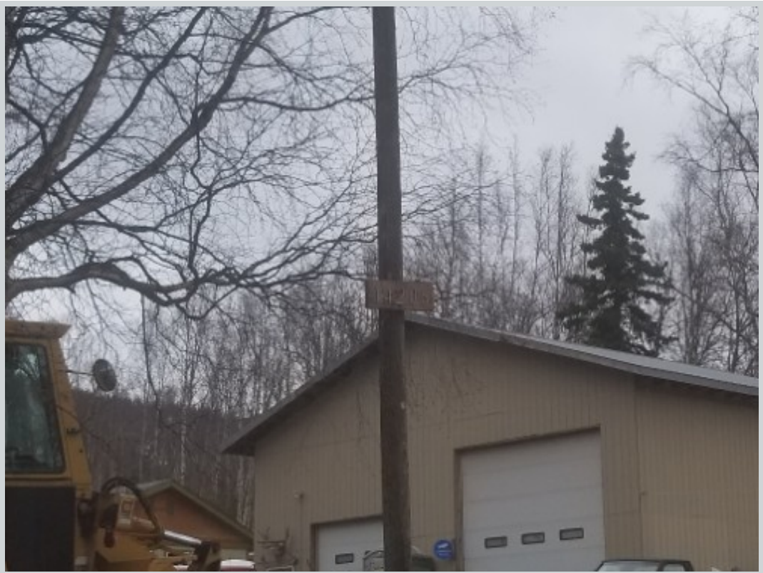
Subject 14206 Harold Loop