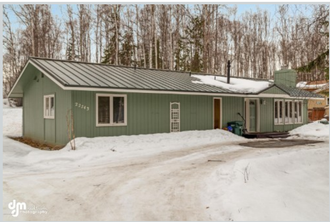
Listing Comp 2 22743 Northwoods Drive