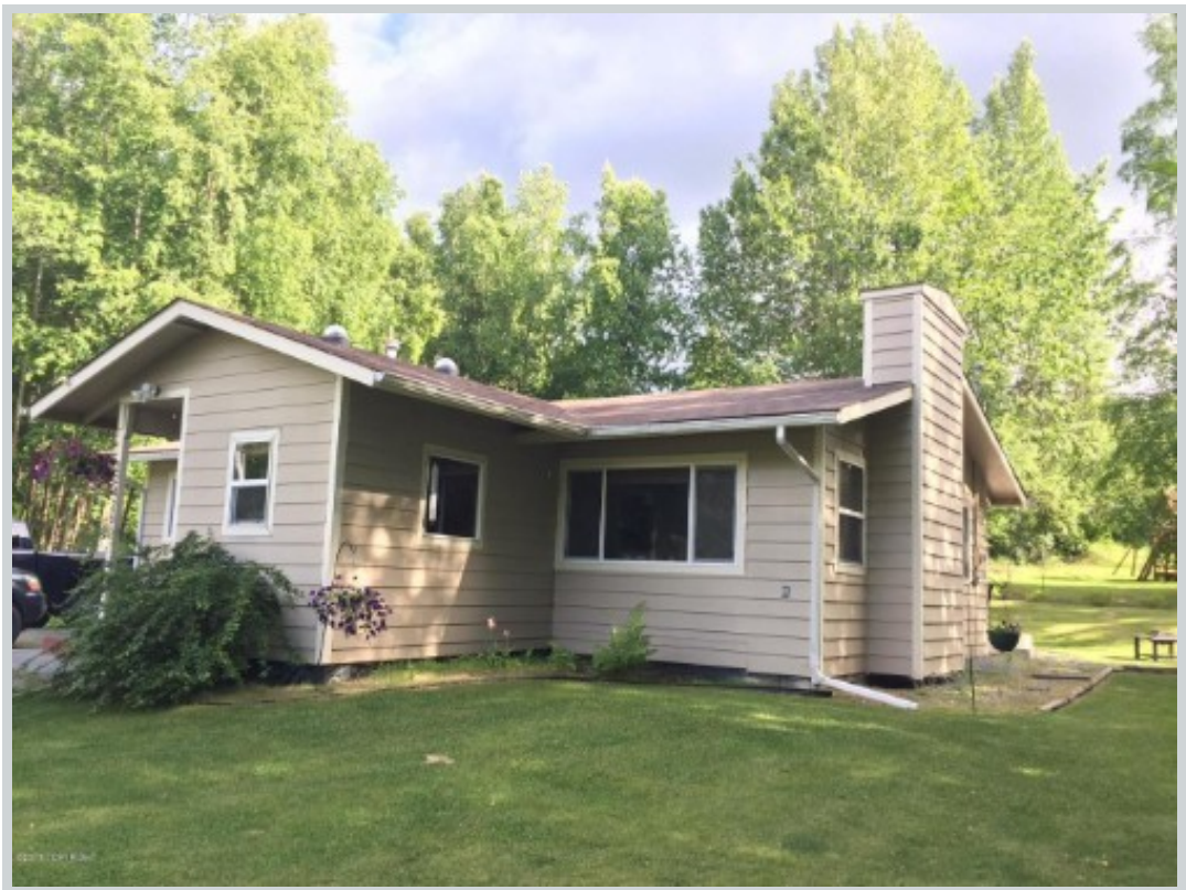
Sold Comp 1 22426 Lampert Circle