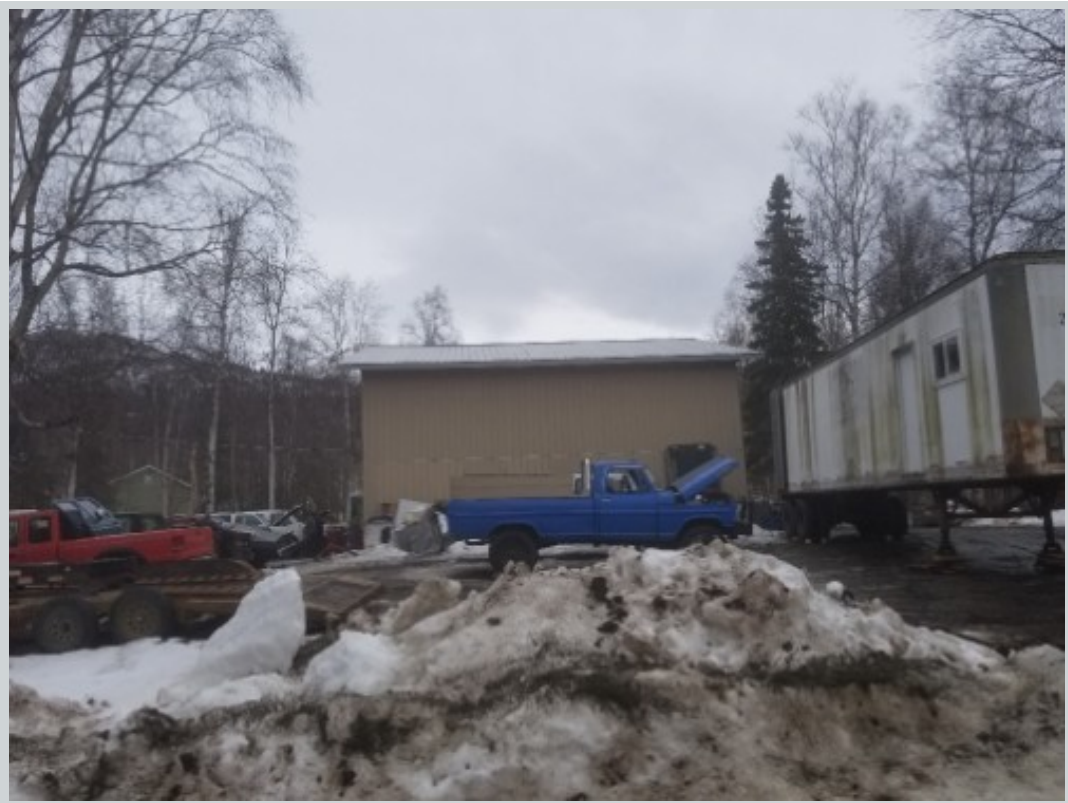
Subject 14206 Harold Loop