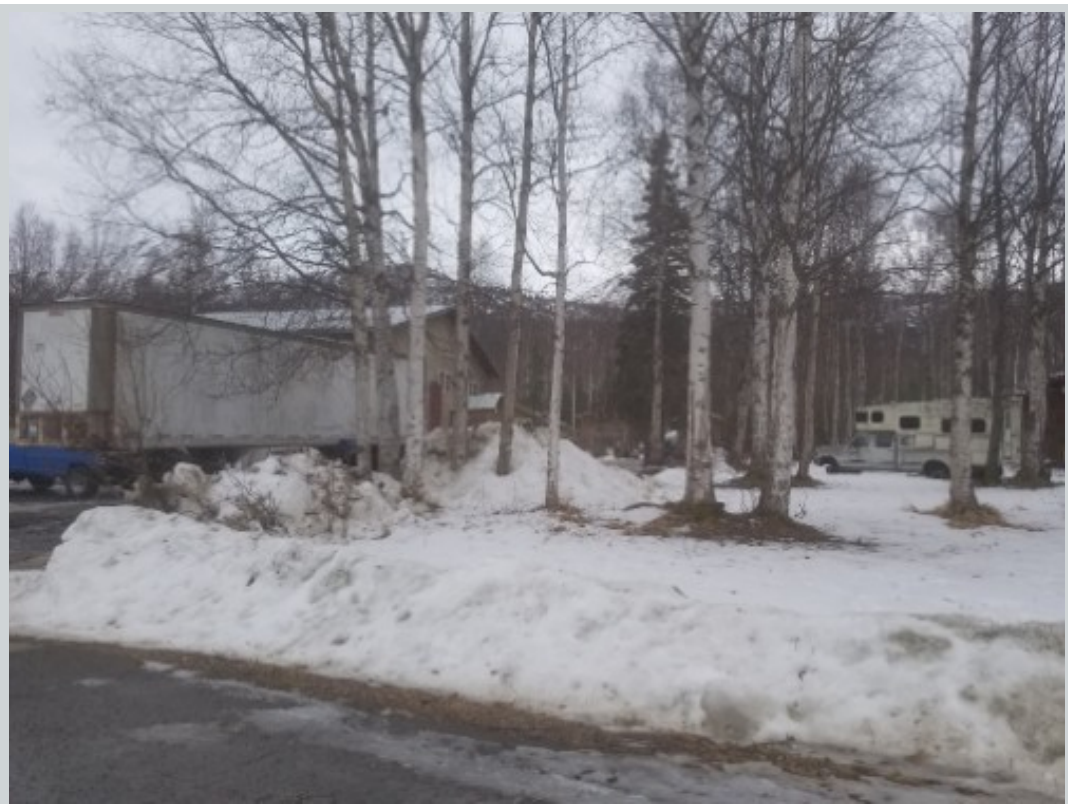
Subject 14206 Harold Loop