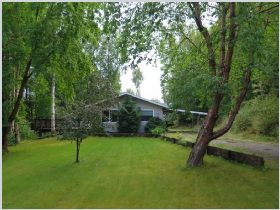
Listing Comp 1 22750 Mcmanus Drive