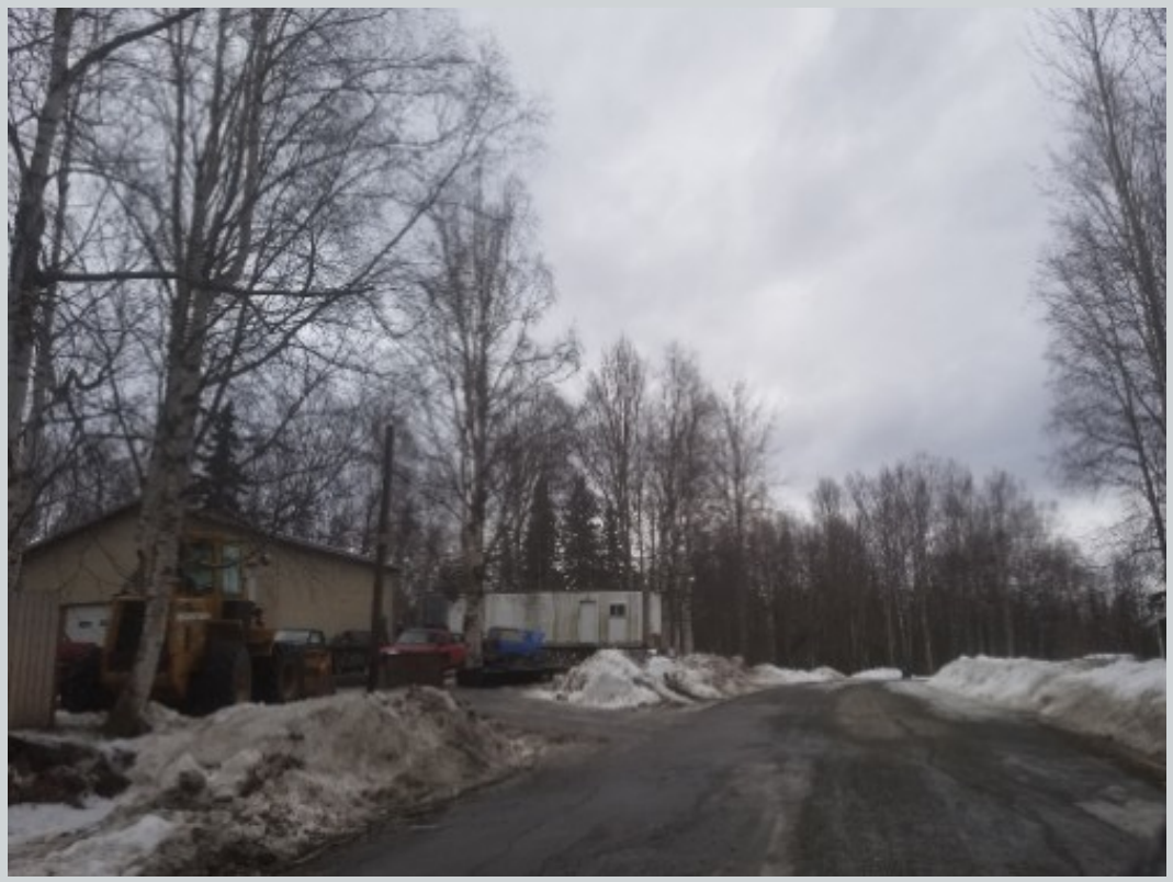
Subject 14206 Harold Loop