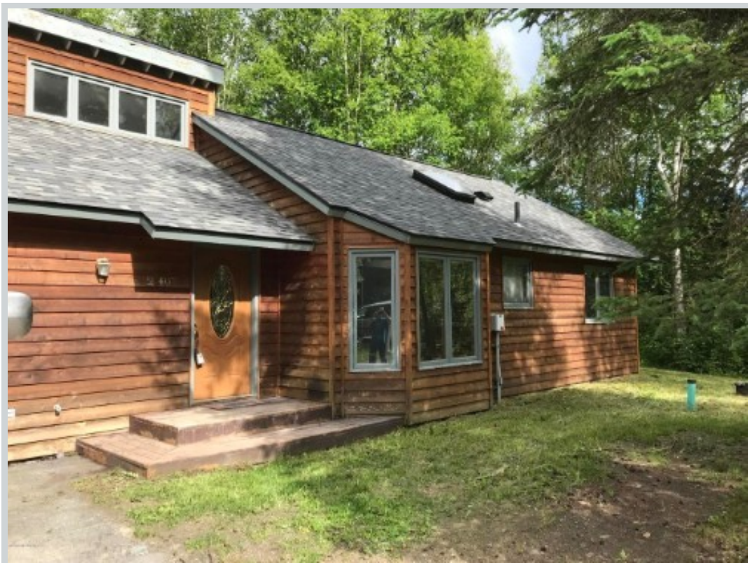
Sold Comp 2 21407 Snowflower Loop