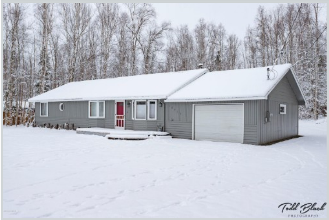
Listing Comp 3 18916 S Birchwood Loop Road