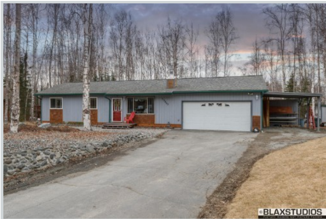
Sold Comp 3 23005 Northwoods Drive