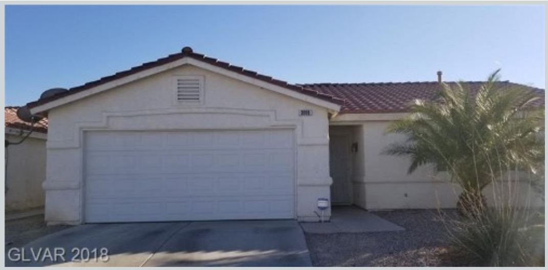
Sold Comp 1