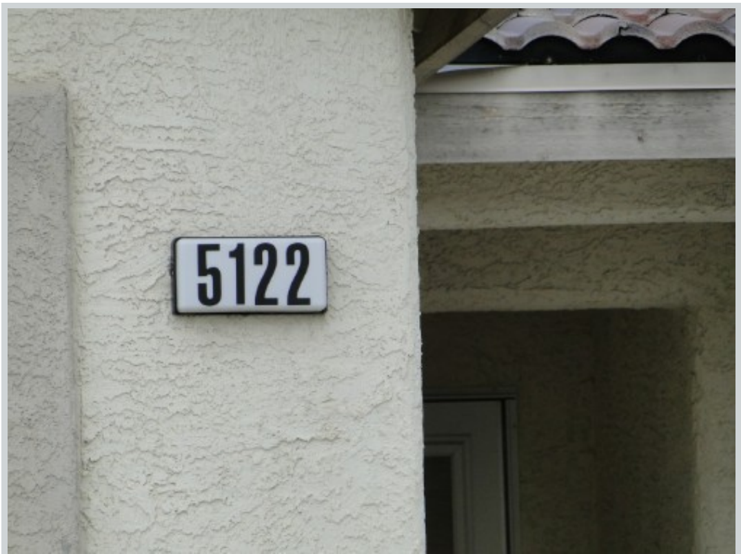
Subject 5122 Crystal Cavern Way