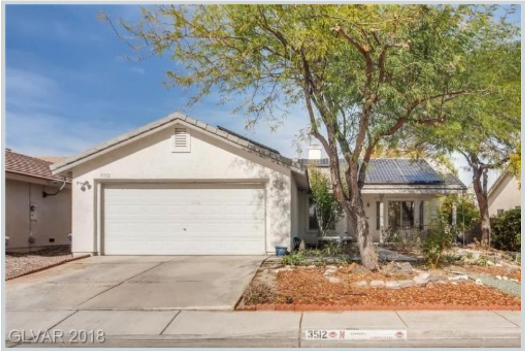
Sold Comp 3