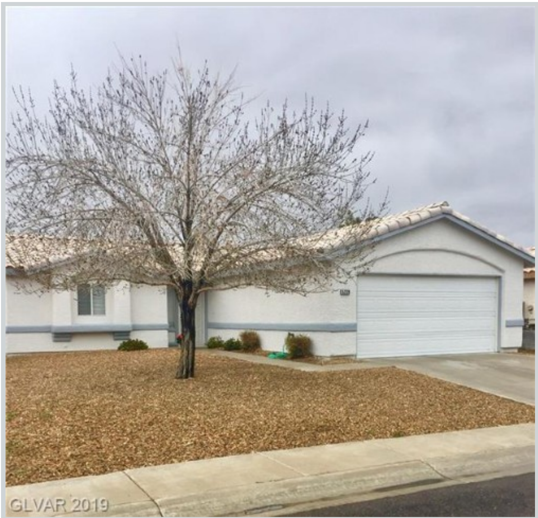
Listing Comp 2