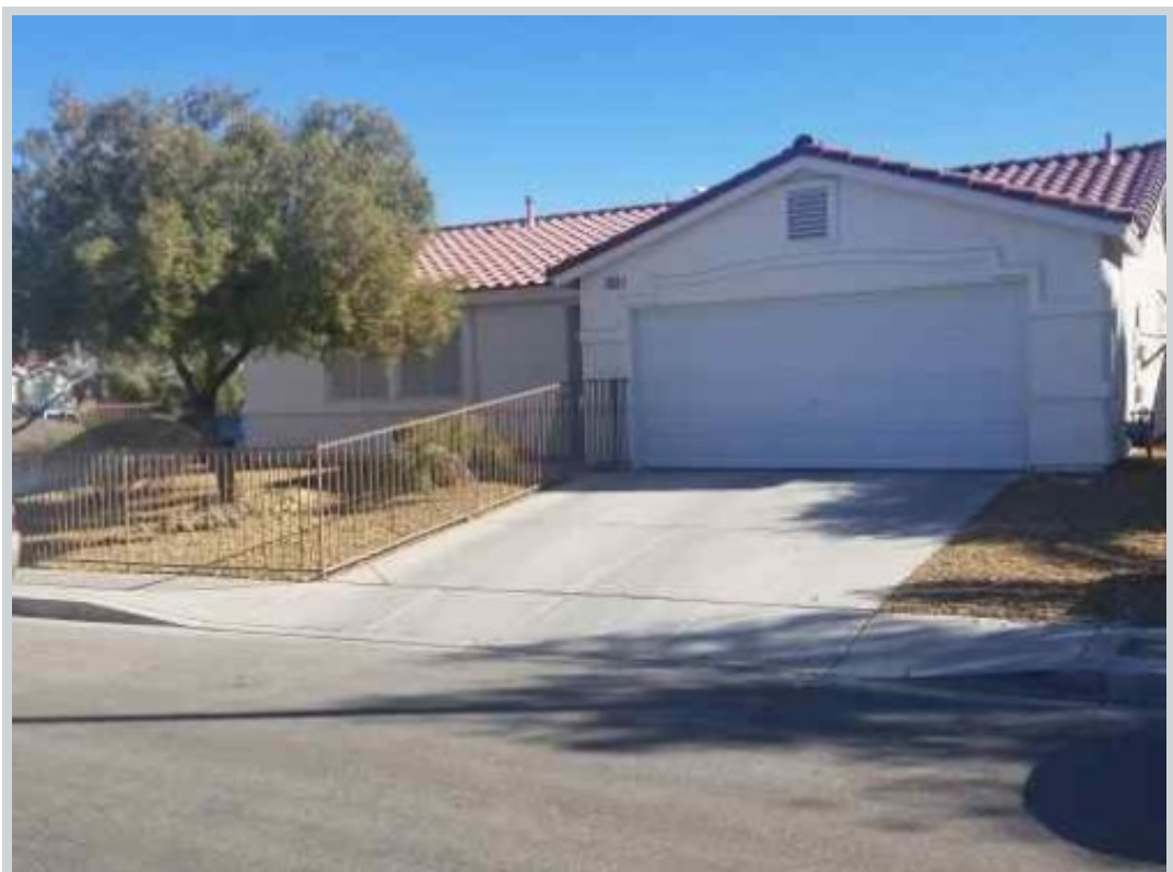
Listing Comp 3