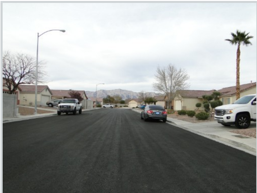
Subject 5122 Crystal Cavern Way

Address 5122 Crystal Cavern Way, North Las Vegas, NV 89031 Loan Number 37289 Suggested List $226,000 Suggested Repaired $226,000 Sale $222,000