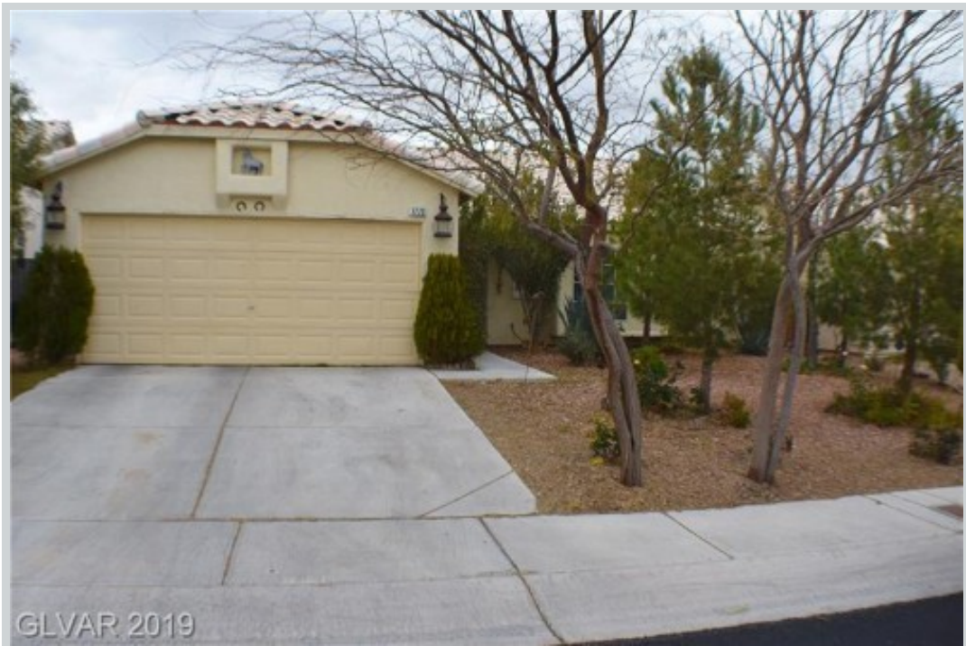
Listing Comp 1