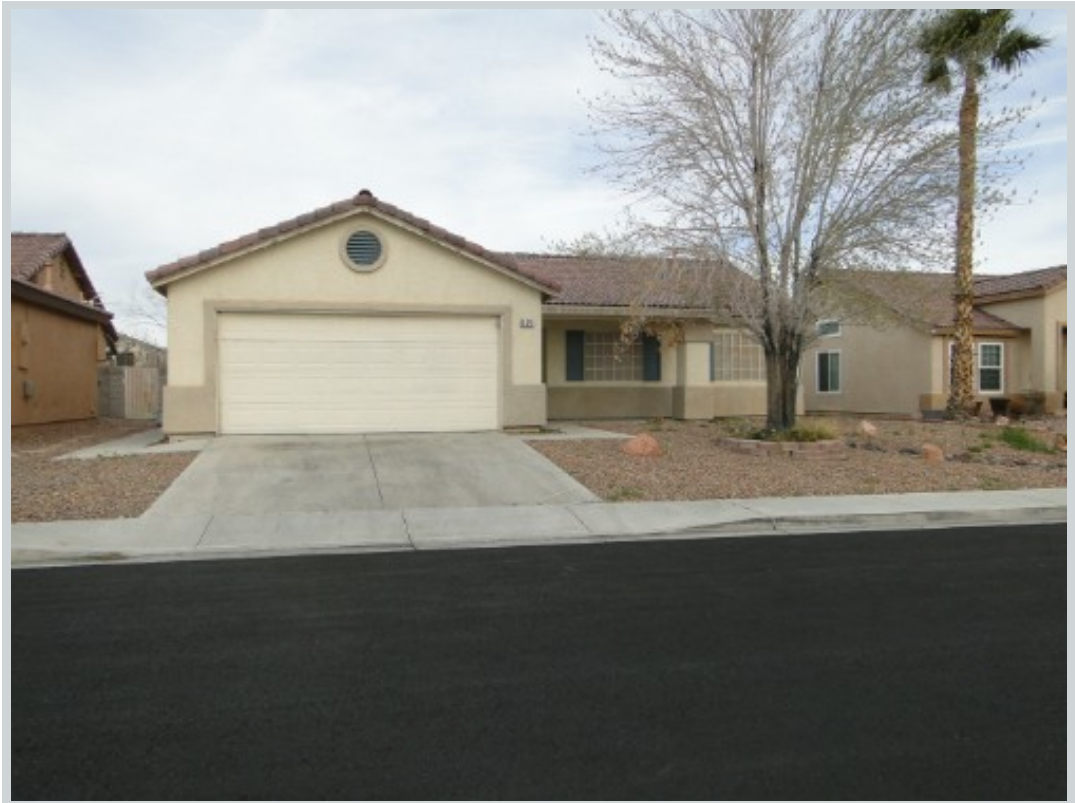
Subject 5122 Crystal Cavern Way