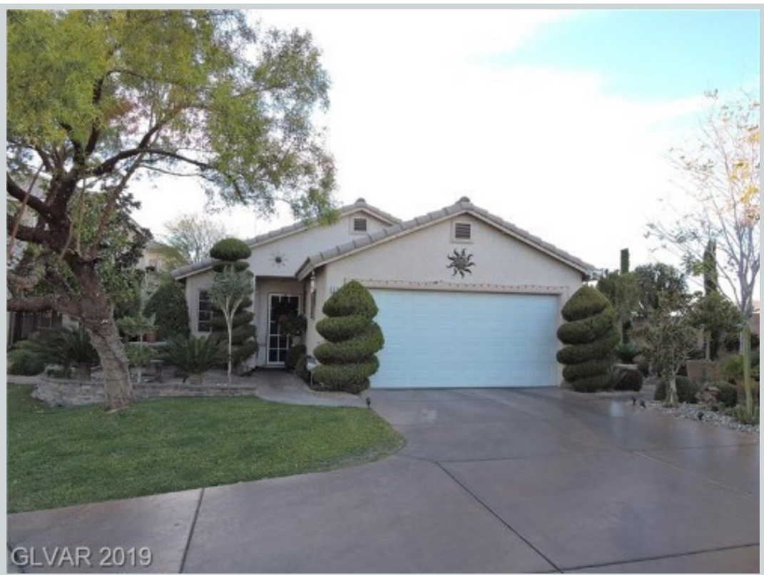
Sold Comp 2