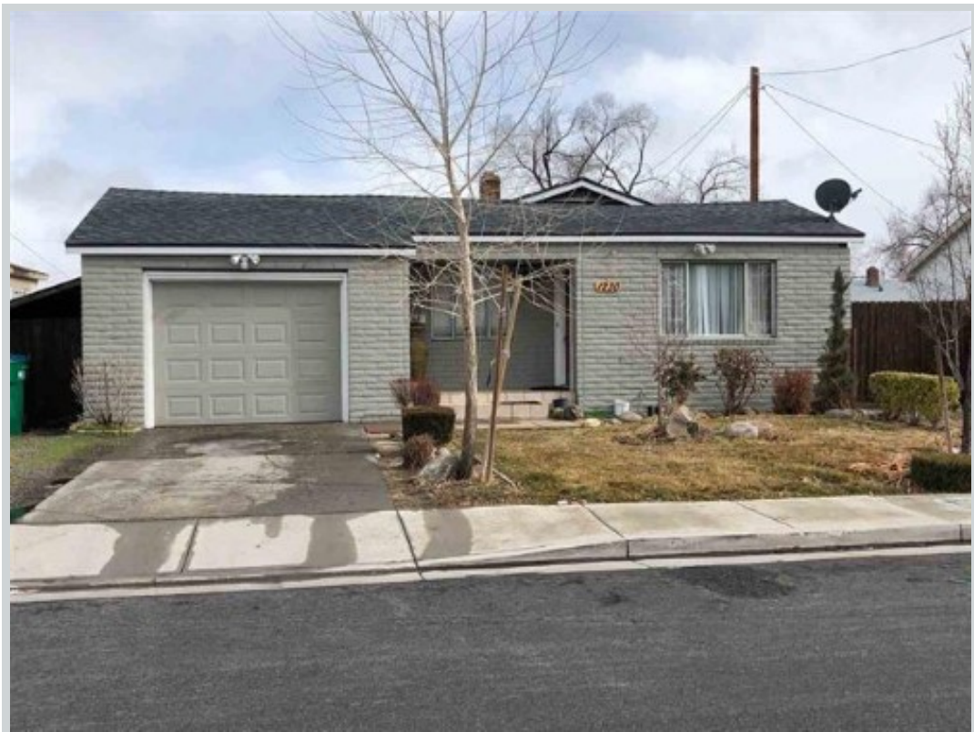
Listing Comp 1 1230 Wilkinson