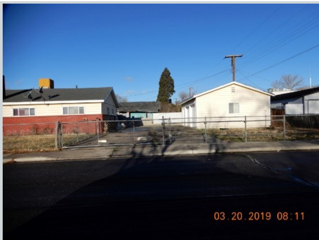
Subject 895 Capitol Hill Ave

Address 895 Capitol Hill Avenue, Reno, NV 89502 Loan Number 37290 Suggested List $300,000 Suggested Repaired $300,000 Sale $295,000