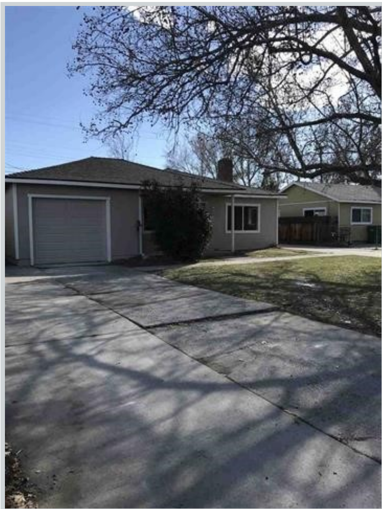
Listing Comp 3 720 Broadway Blvd View Front

Address 895 Capitol Hill Avenue, Reno, NV 89502 Loan Number 37290 Suggested List $300,000 Suggested Repaired $300,000 Sale $295,000