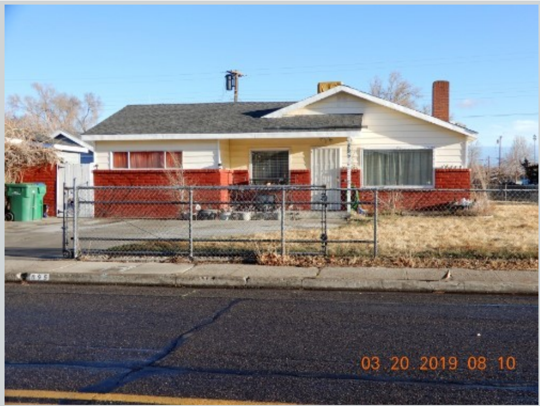
Subject 895 Capitol Hill Ave