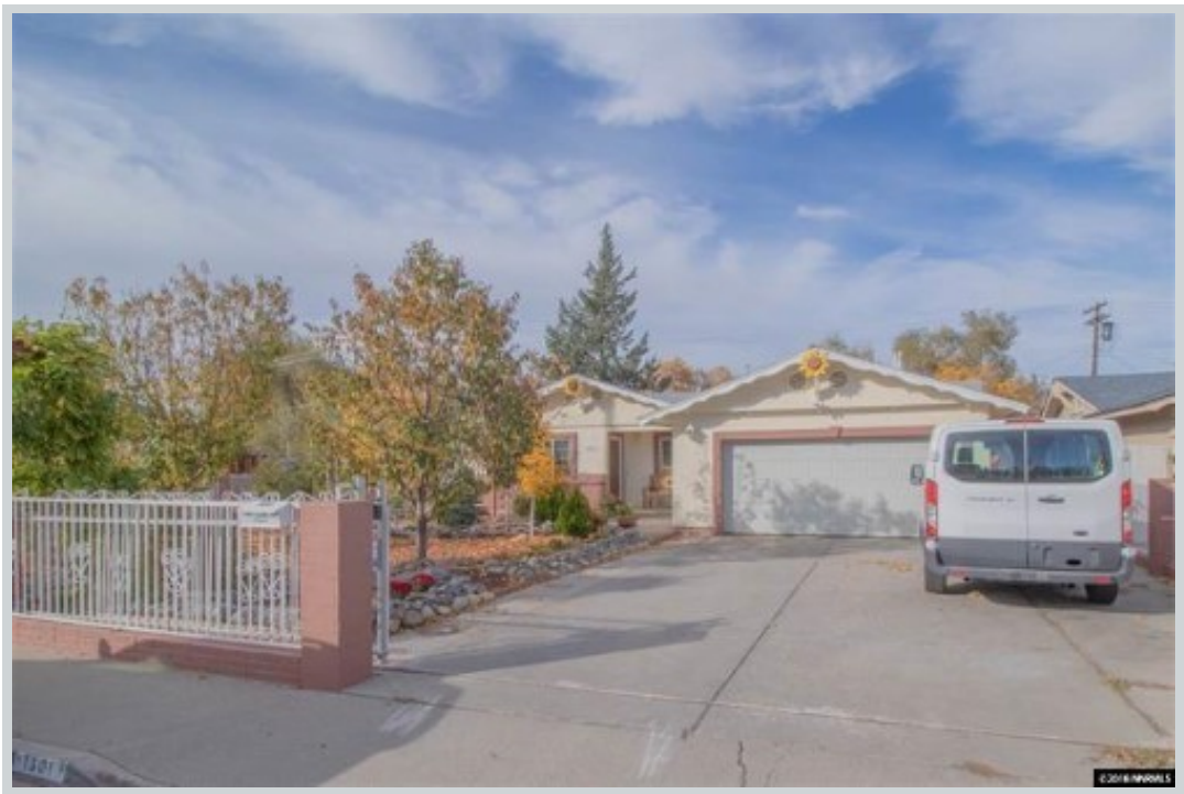
Sold Comp 3 1301 Roberts St