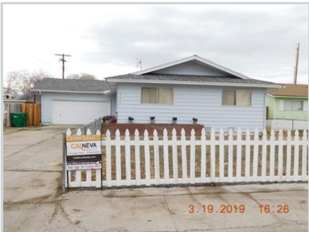
Listing Comp 2 951 Wilkinson