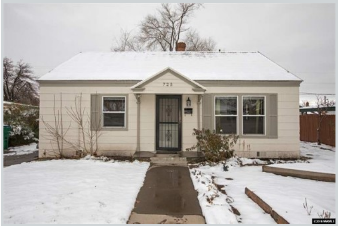
Sold Comp 2 725 Balzar Cir