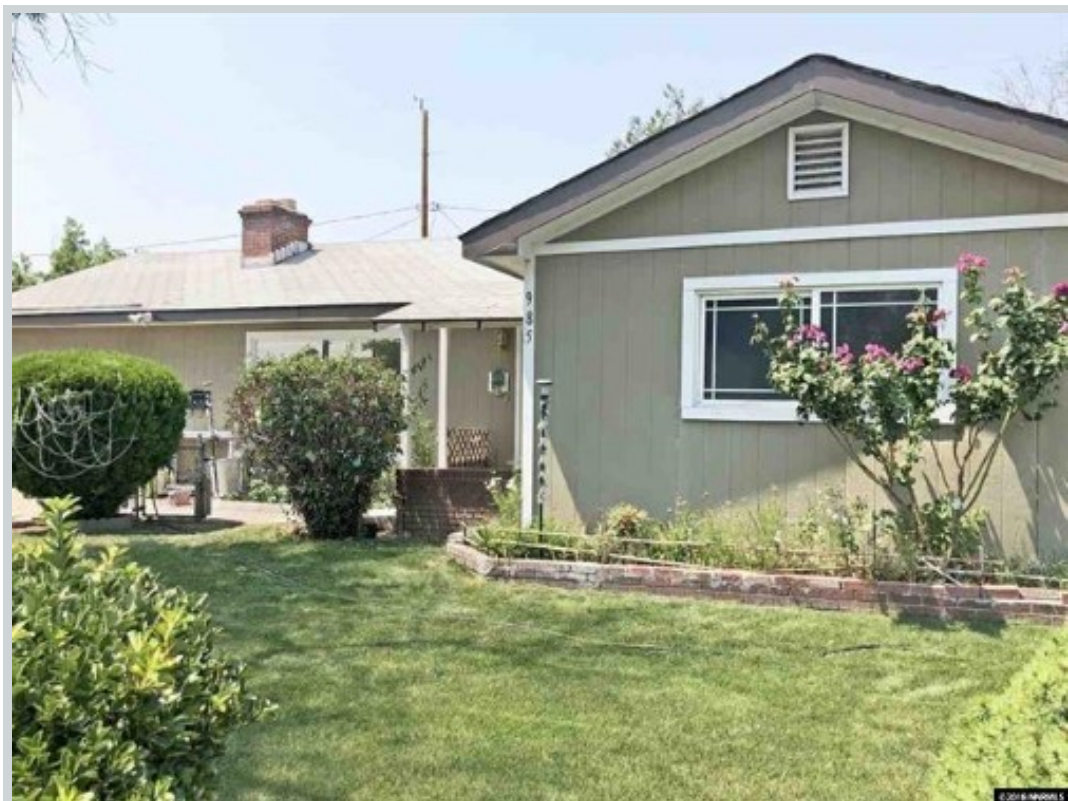
Sold Comp 1 985 Melrose Dr View Front