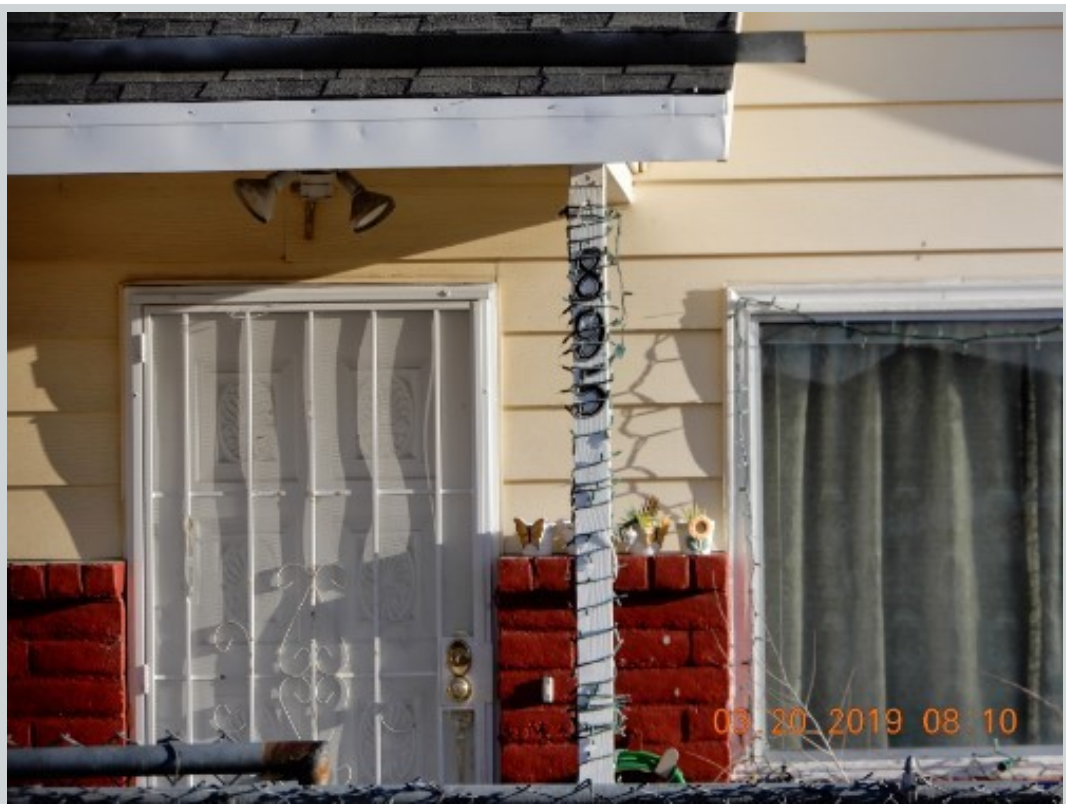
Subject 895 Capitol Hill Ave