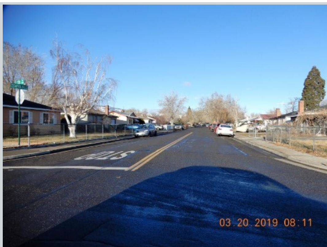
Subject 895 Capitol Hill Ave