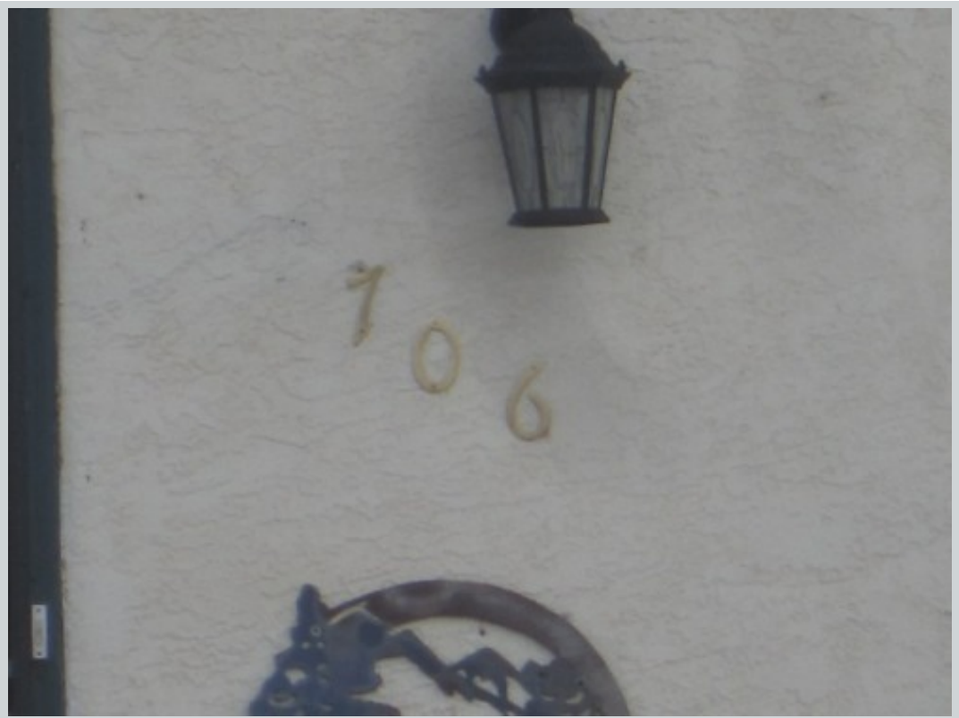
Subject 2706 West St