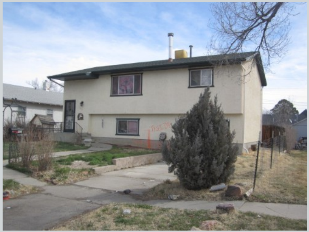
Subject 2706 West St