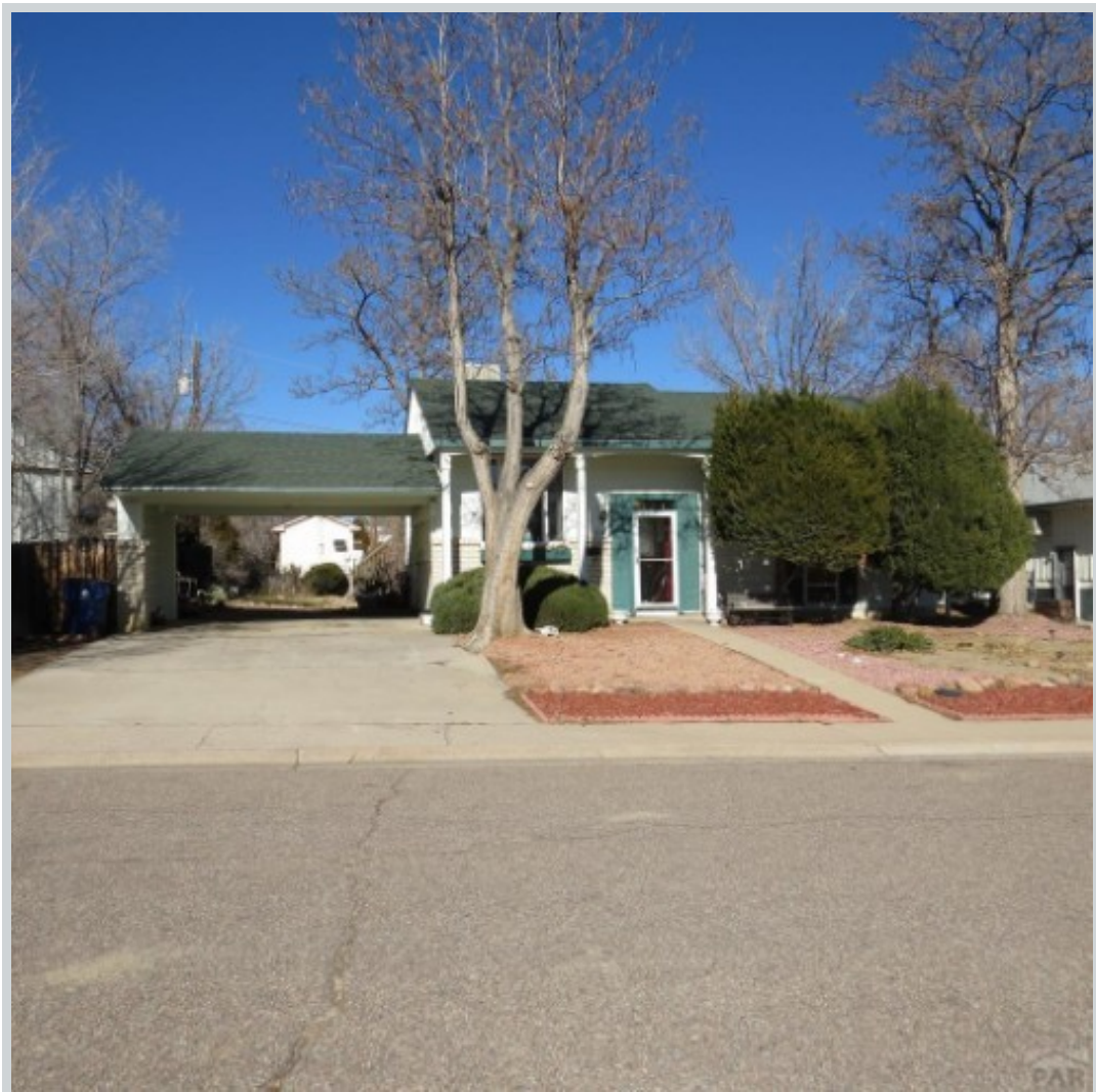
Sold Comp 2 1504 Bunker Hill