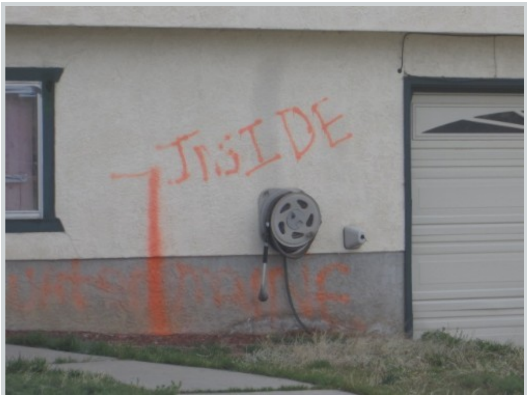
Subject 2706 West St