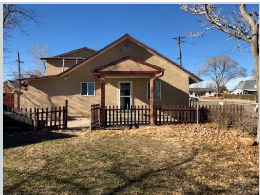
Sold Comp 3 808 W 28th

Address 2706 West Street, Pueblo, CO 81003 Loan Number 37295 Suggested List $146,900 Suggested Repaired $149,900 Sale $145,000