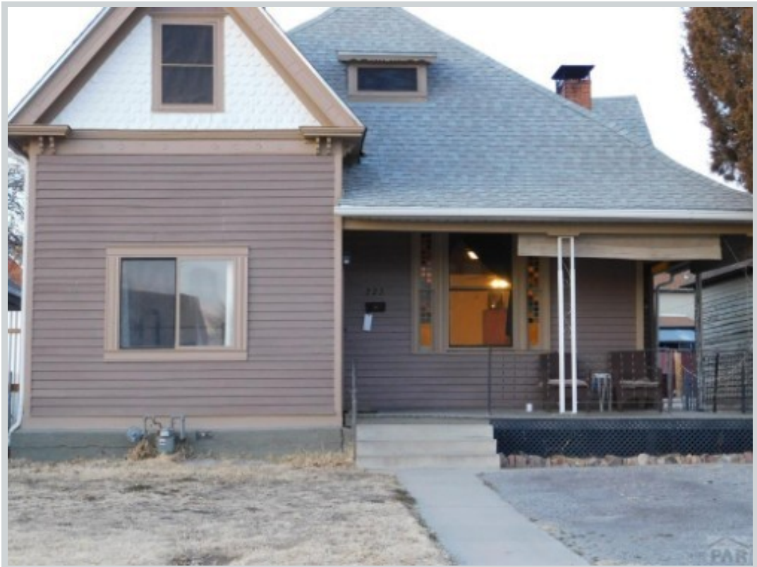
Listing Comp 1 725 W 12th