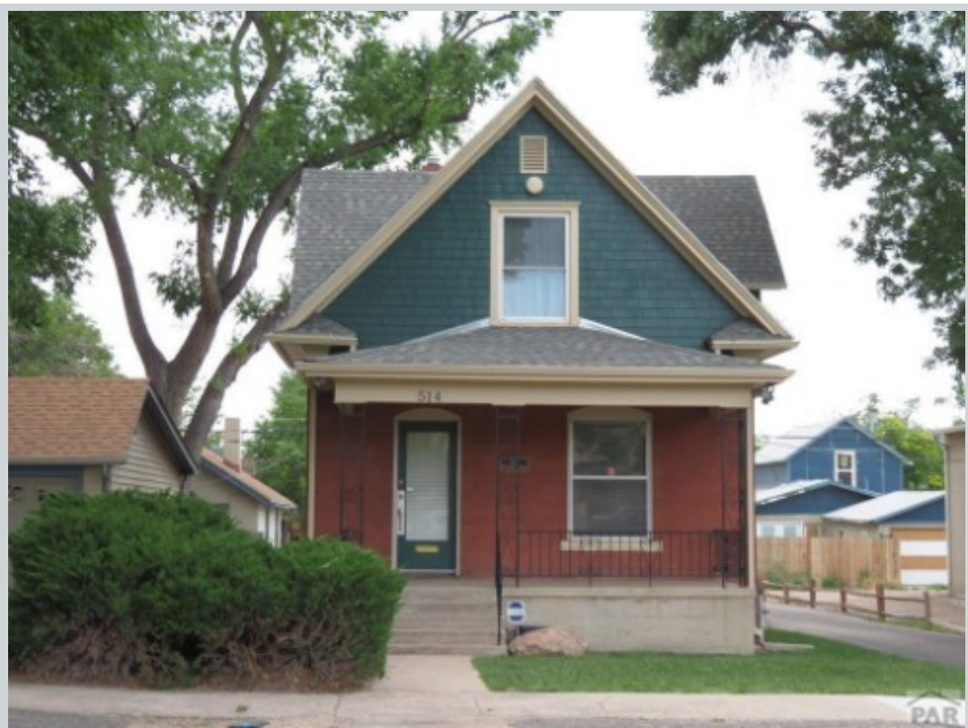
Listing Comp 2 514 W 10th

Address 2706 West Street, Pueblo, CO 81003 Loan Number 37295 Suggested List $146,900 Suggested Repaired $149,900 Sale $145,000