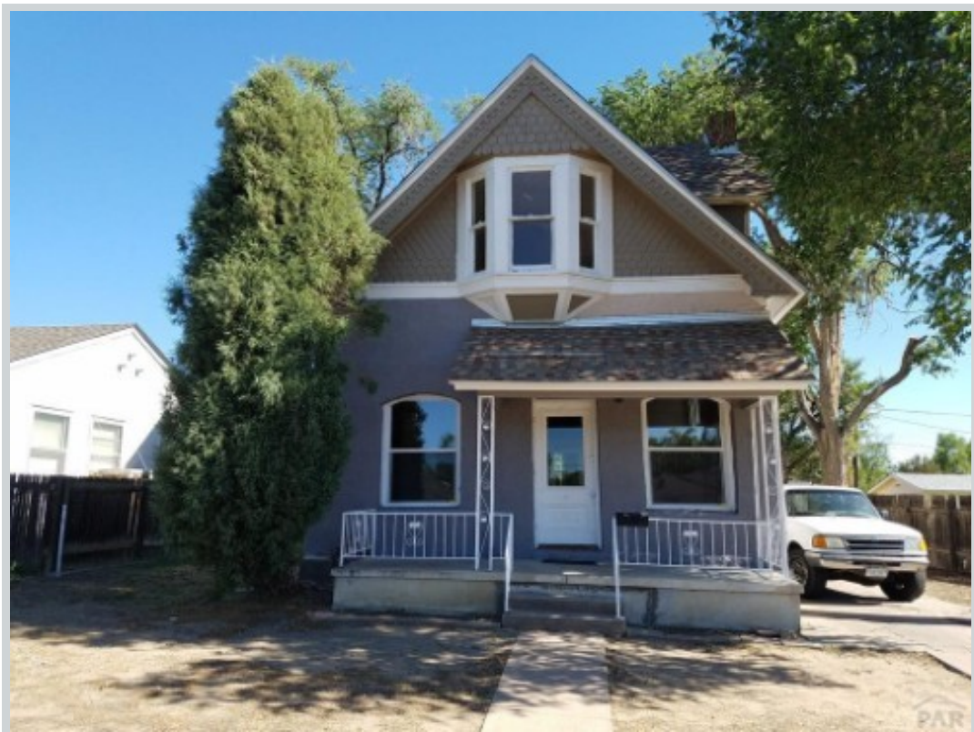
Sold Comp 1 919 W 27th

Address 2706 West Street, Pueblo, CO 81003 Loan Number 37295 Suggested List $146,900 Suggested Repaired $149,900 Sale $145,000