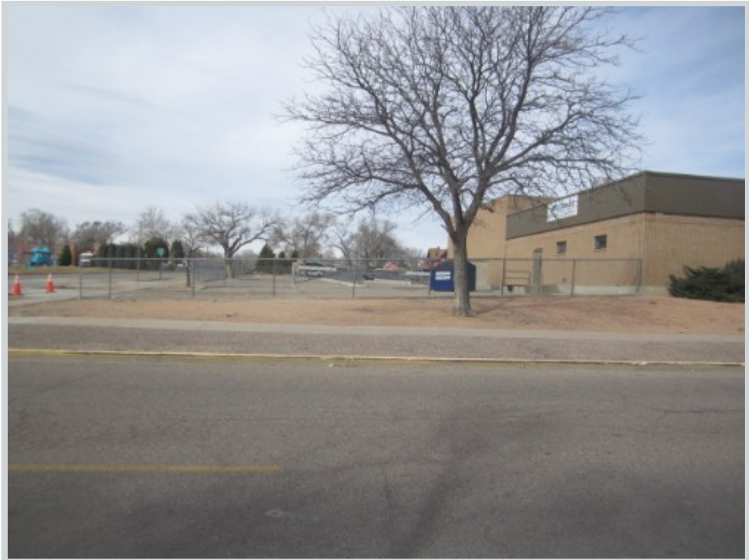
Subject 2706 West St

Address 2706 West Street, Pueblo, CO 81003 Loan Number 37295 Suggested List $146,900 Suggested Repaired $149,900 Sale $145,000