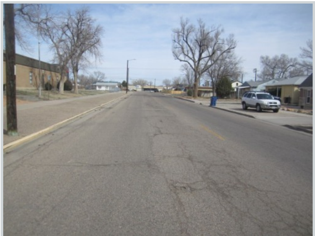
Subject 2706 West St