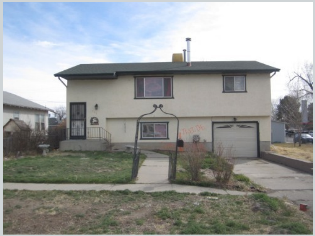
Subject 2706 West St

Address 2706 West Street, Pueblo, CO 81003 Loan Number 37295 Suggested List $146,900 Suggested Repaired $149,900 Sale $145,000