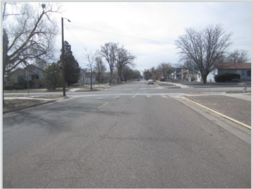
Subject 2706 West St

Address 2706 West Street, Pueblo, CO 81003 Loan Number 37295 Suggested List $146,900 Suggested Repaired $149,900 Sale $145,000