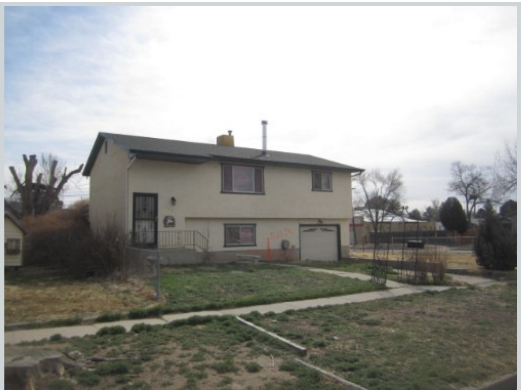
Subject 2706 West St