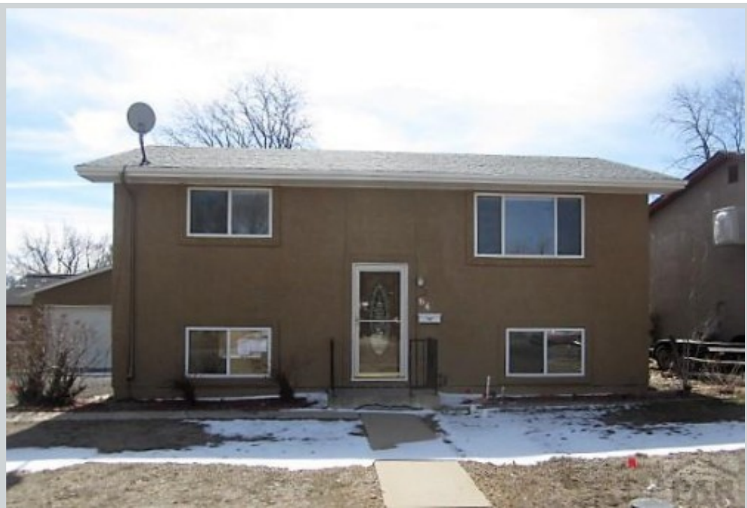
Listing Comp 3 64 Dick Trefz