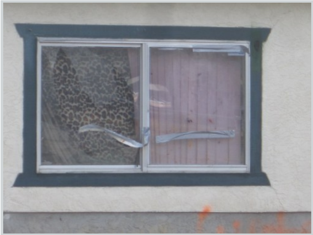
Subject 2706 West St

Address 2706 West Street, Pueblo, CO 81003 Loan Number 37295 Suggested List $146,900 Suggested Repaired $149,900 Sale $145,000