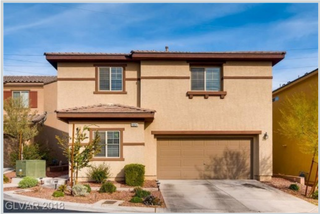
Sold Comp 3