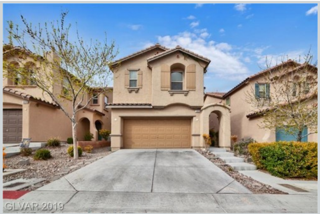
Listing Comp 1