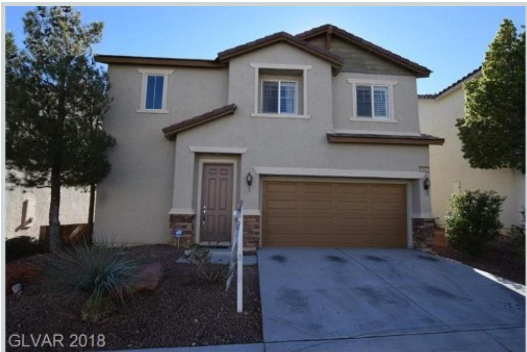
Listing Comp 2