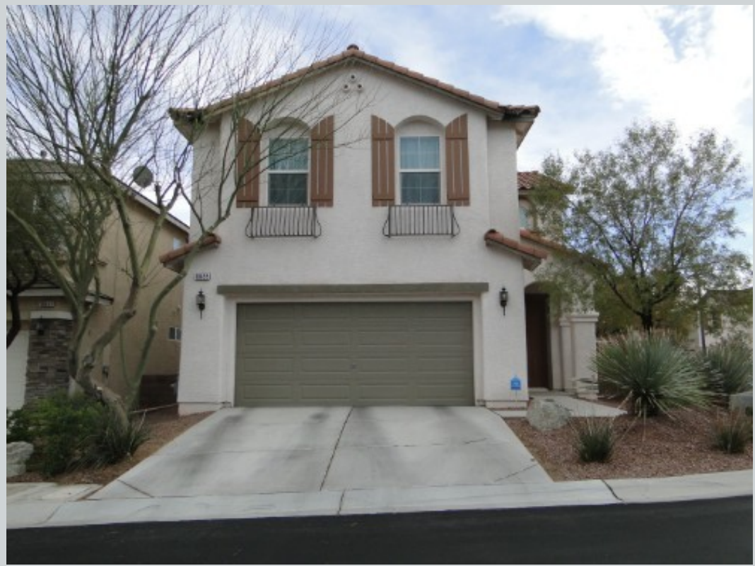
Subject 10655 Tray Mountain Ave