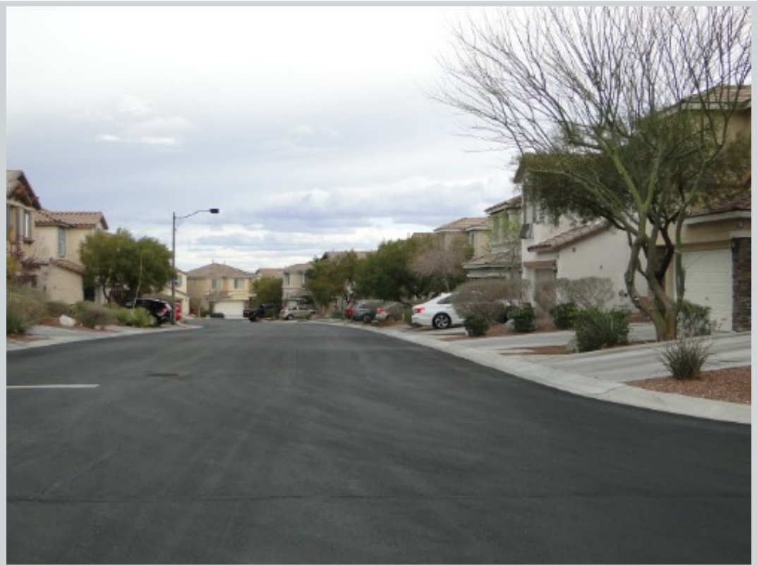
Subject 10655 Tray Mountain Ave