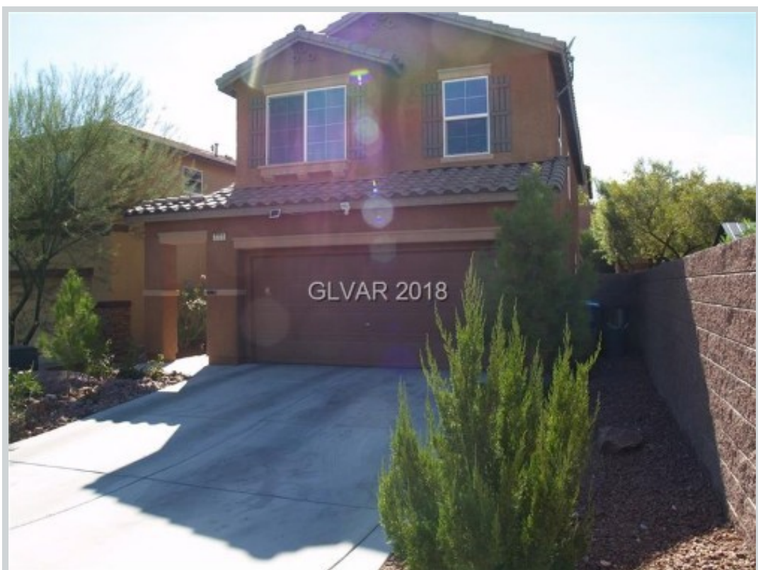
Sold Comp 2