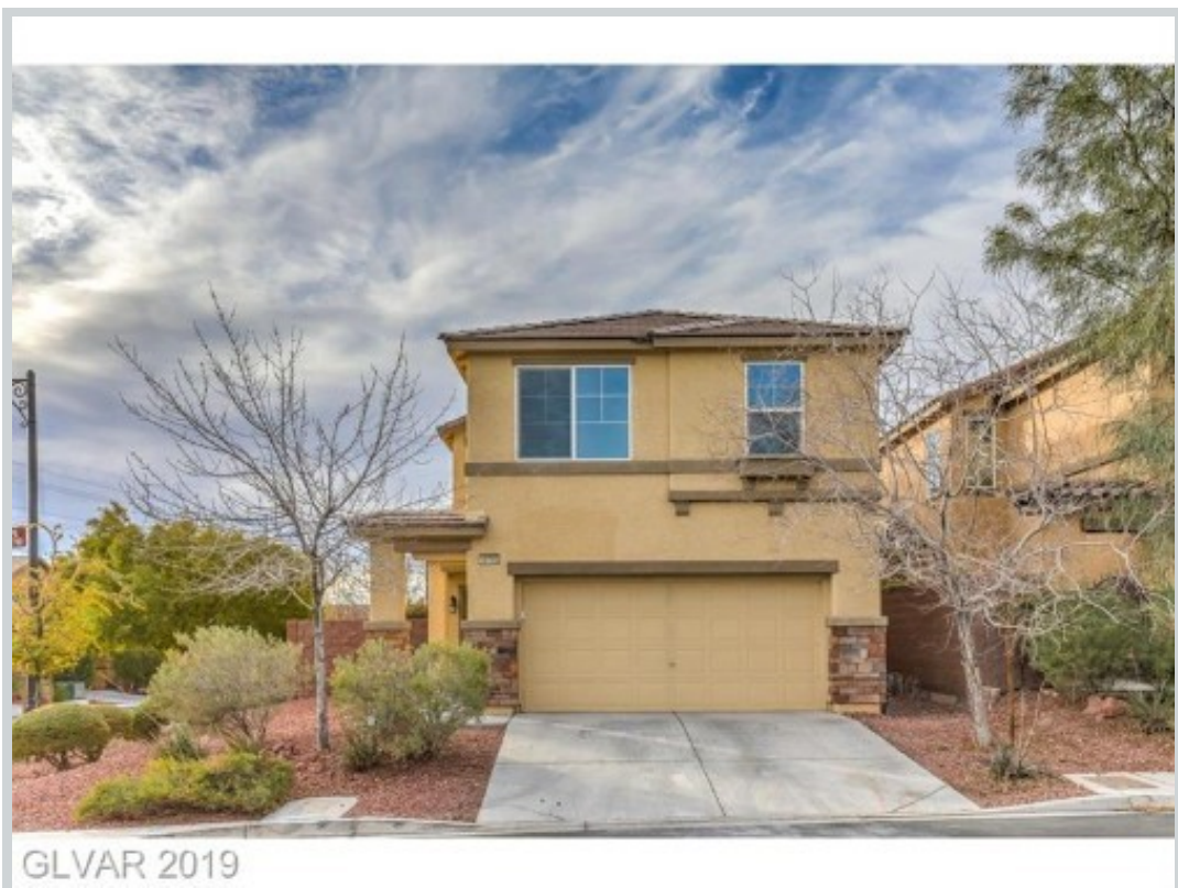
Listing Comp 3