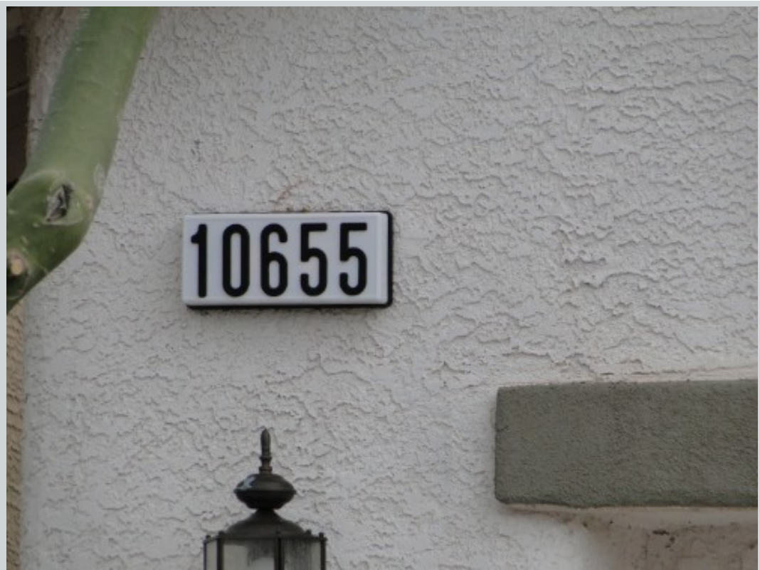
Subject 10655 Tray Mountain Ave