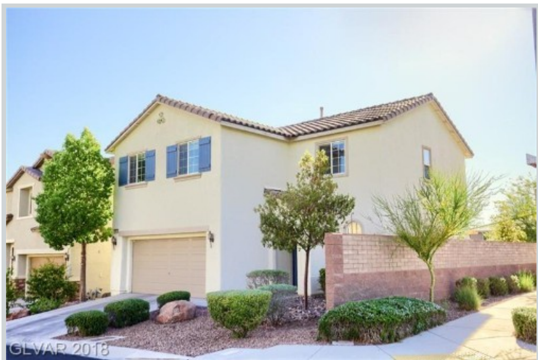
Sold Comp 1