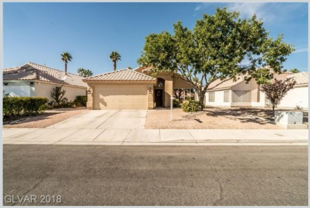
Sold Comp 1