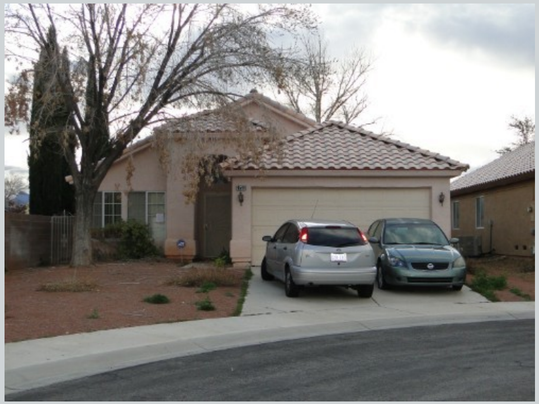
Subject 4549 Del Pappa Ct