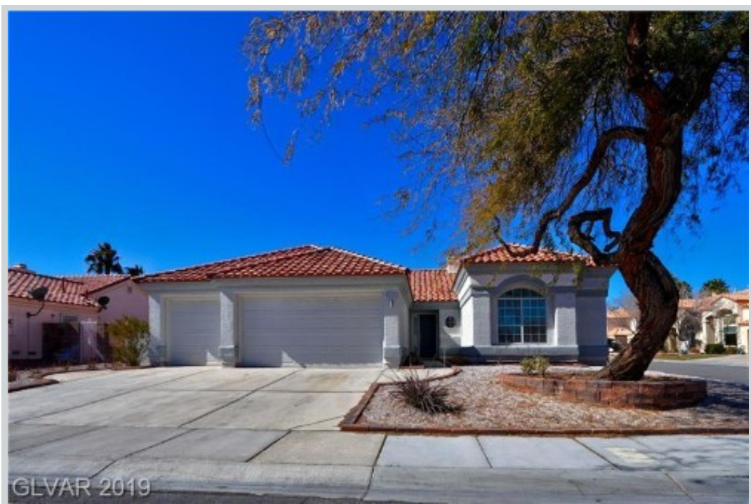
Listing Comp 3