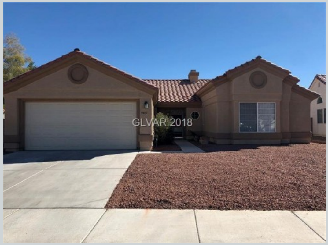
Sold Comp 3