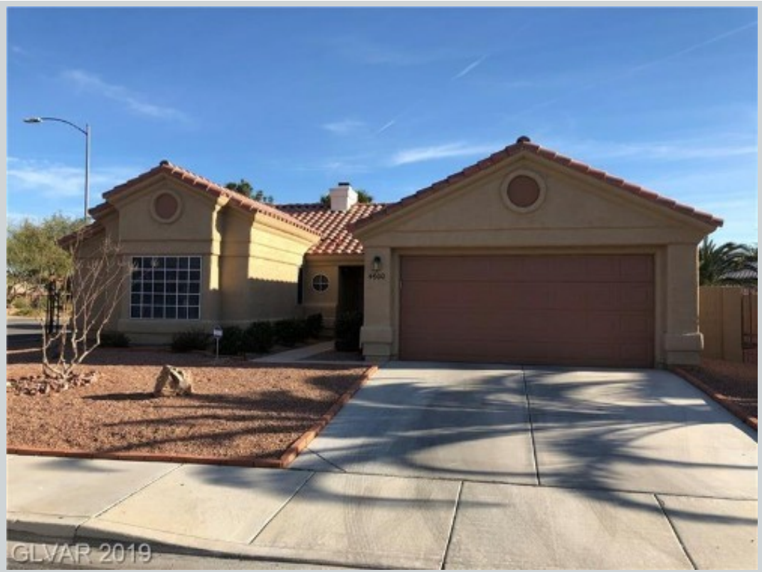
Sold Comp 2