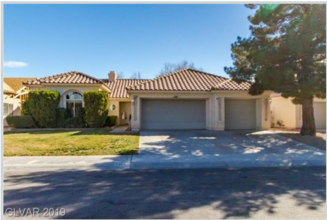
Listing Comp 2

Address 4549 Del Pappa Court, Las Vegas, NV 89130 Loan Number 37299 Suggested List $286,000 Suggested Repaired $286,000 Sale $280,000