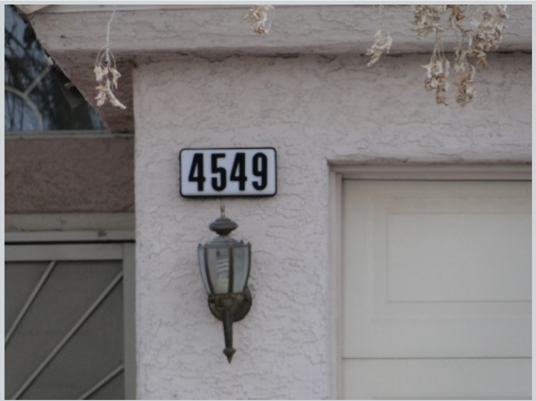
Subject 4549 Del Pappa Ct