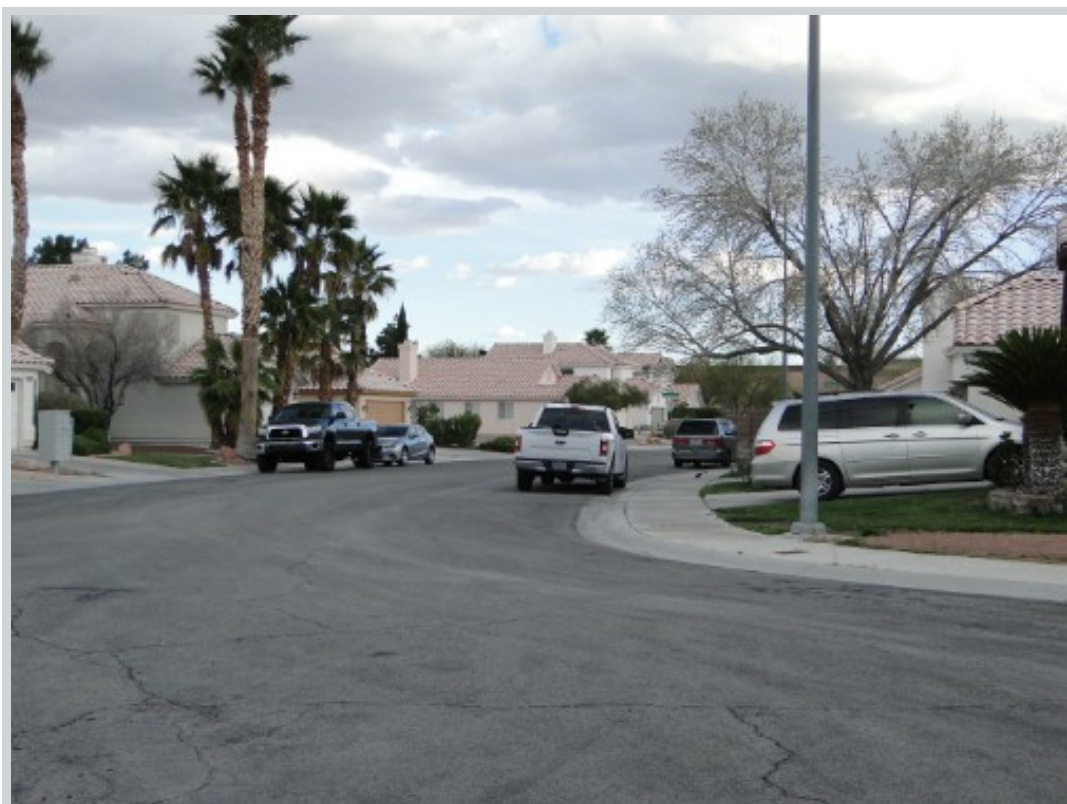
Subject 4549 Del Pappa Ct

Address 4549 Del Pappa Court, Las Vegas, NV 89130 Loan Number 37299 Suggested List $286,000 Suggested Repaired $286,000 Sale $280,000