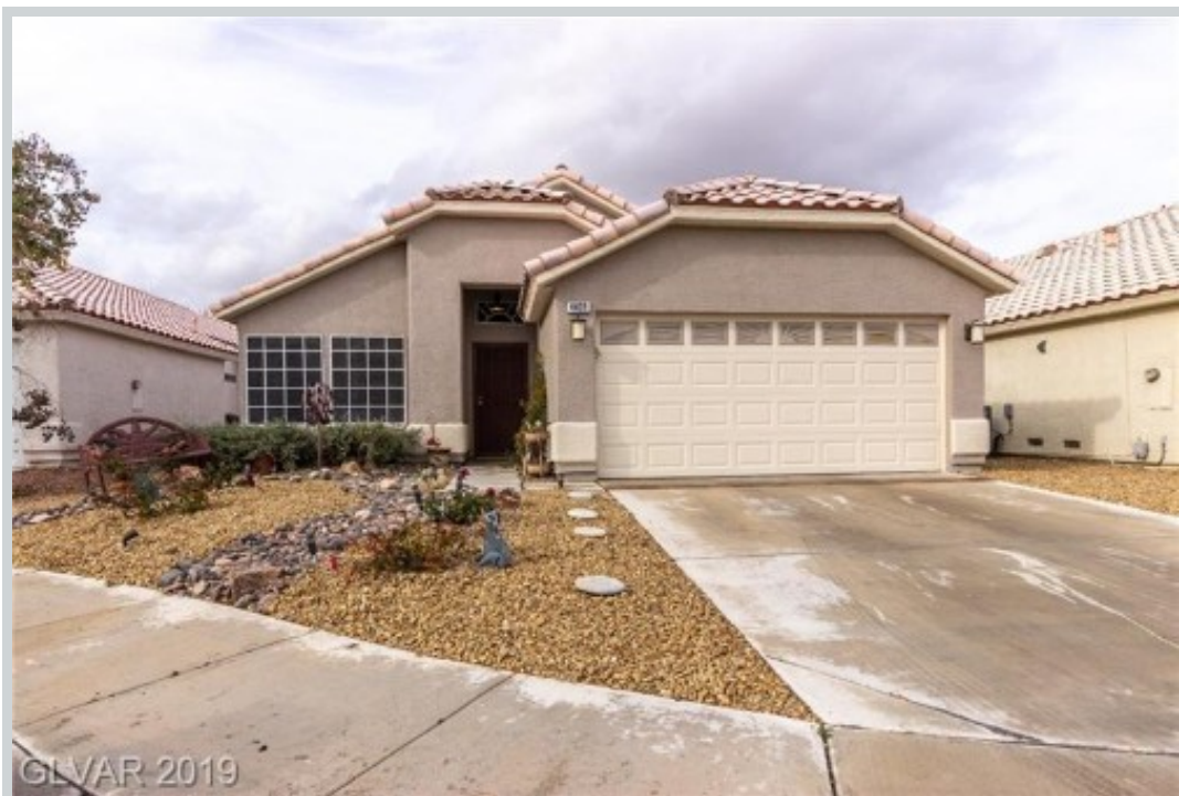
Listing Comp 1