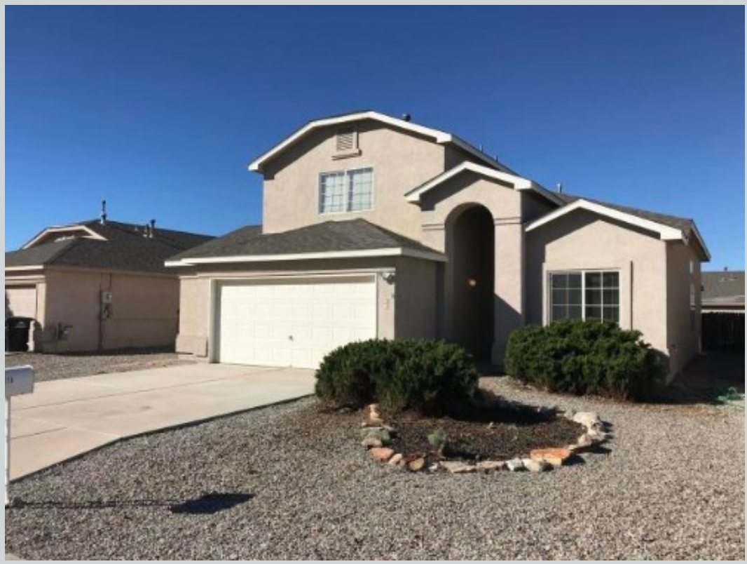
Listing Comp 2 3 Violeta Pl