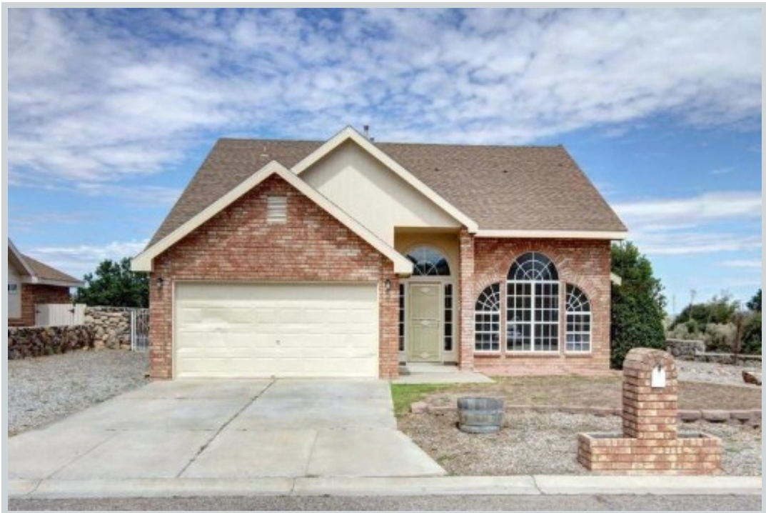
Sold Comp 2 1 Acebo Pl