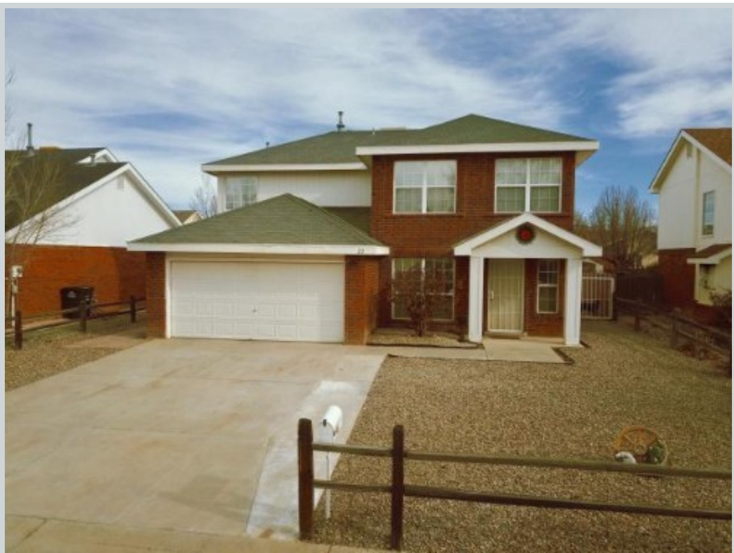
Listing Comp 3 22 Buckbrush