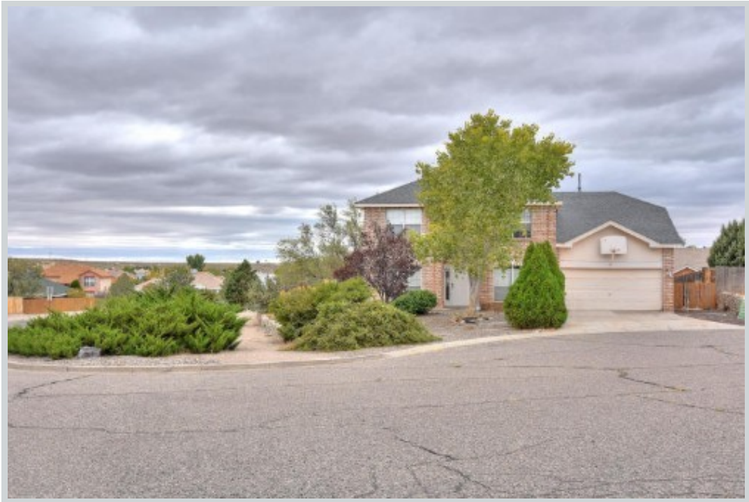
Sold Comp 1 43 Marigold Blvd