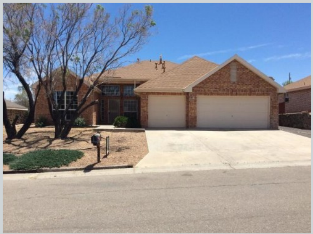
Sold Comp 3 14 Juniper Ave