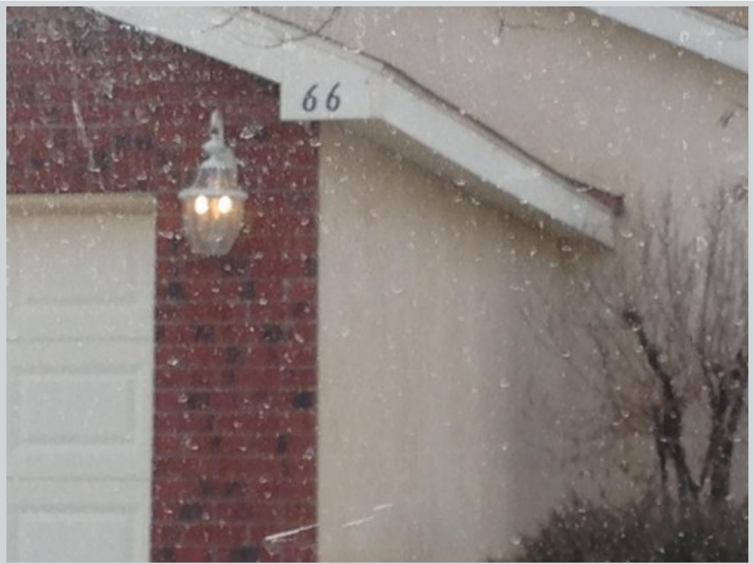
Subject 66 Juniper Ave