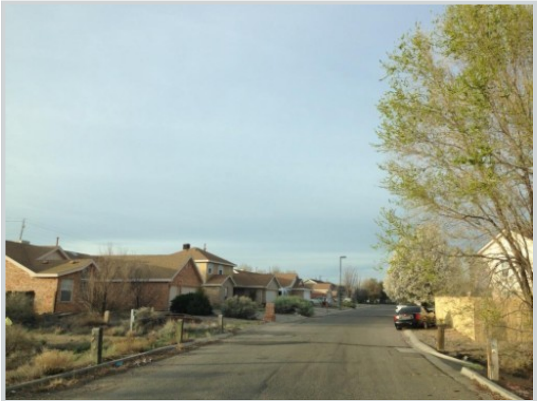
Subject 66 Juniper Ave