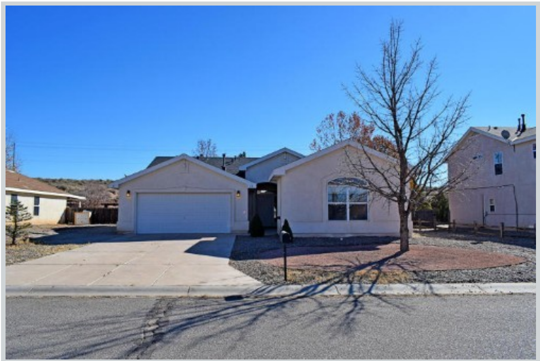
Listing Comp 1 68 Juniper Ave