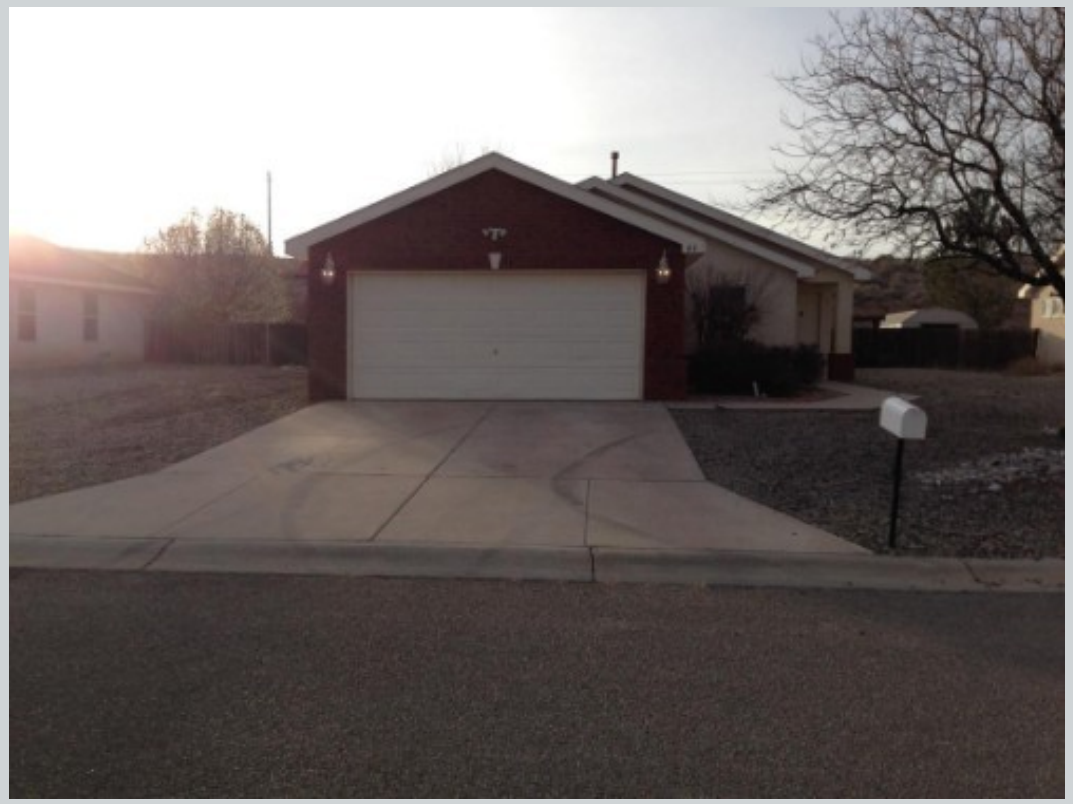
Subject 66 Juniper Ave