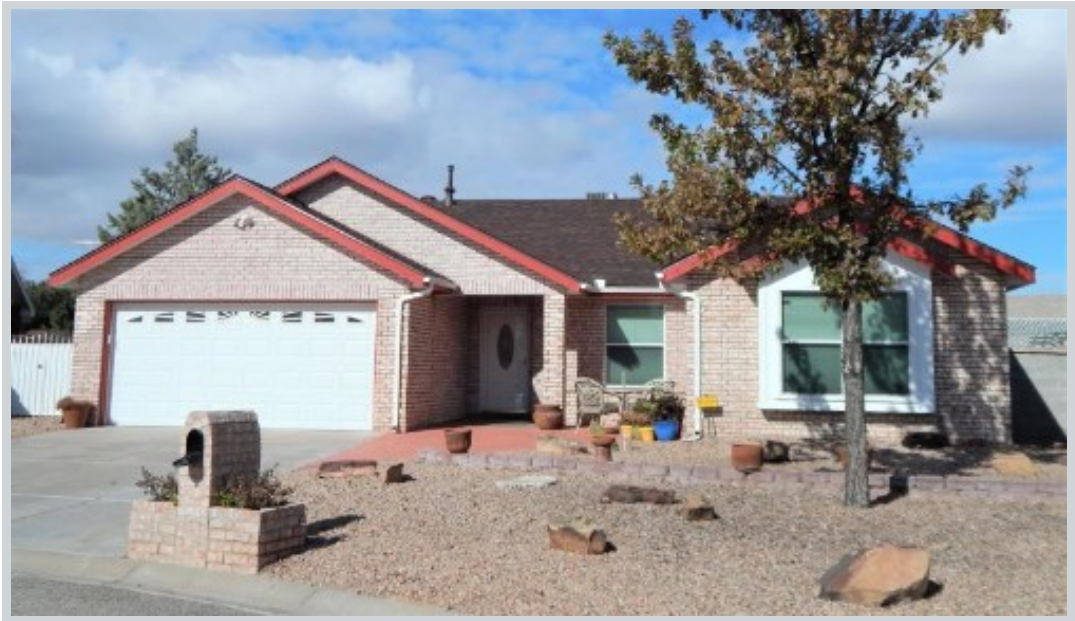
Listing Comp 2 3 Marigold Blvd