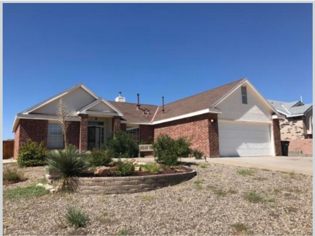
Sold Comp 2 9 Aspen Ter