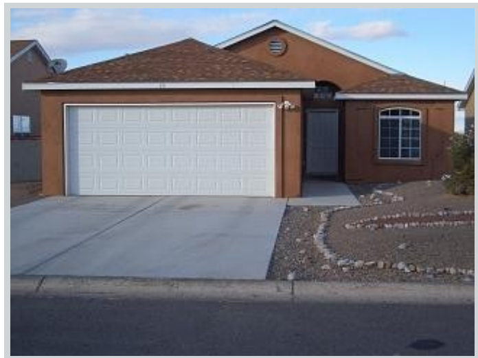
Listing Comp 3 15 Rosa Ave Sw