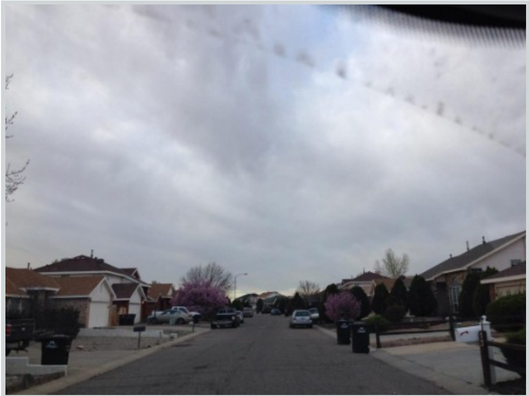
Subject 36 Apache Plume Rd