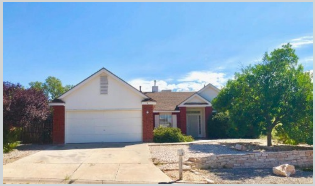
Sold Comp 1 14 Poplar Pl