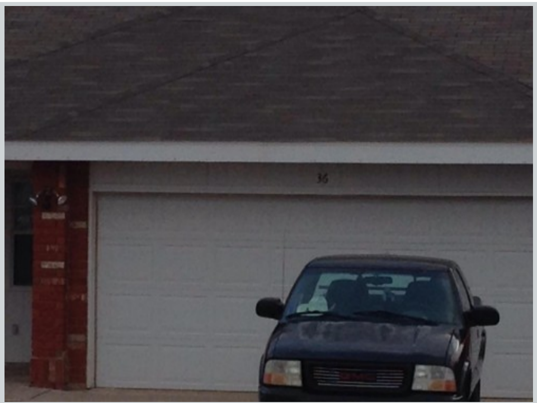
Subject 36 Apache Plume Rd