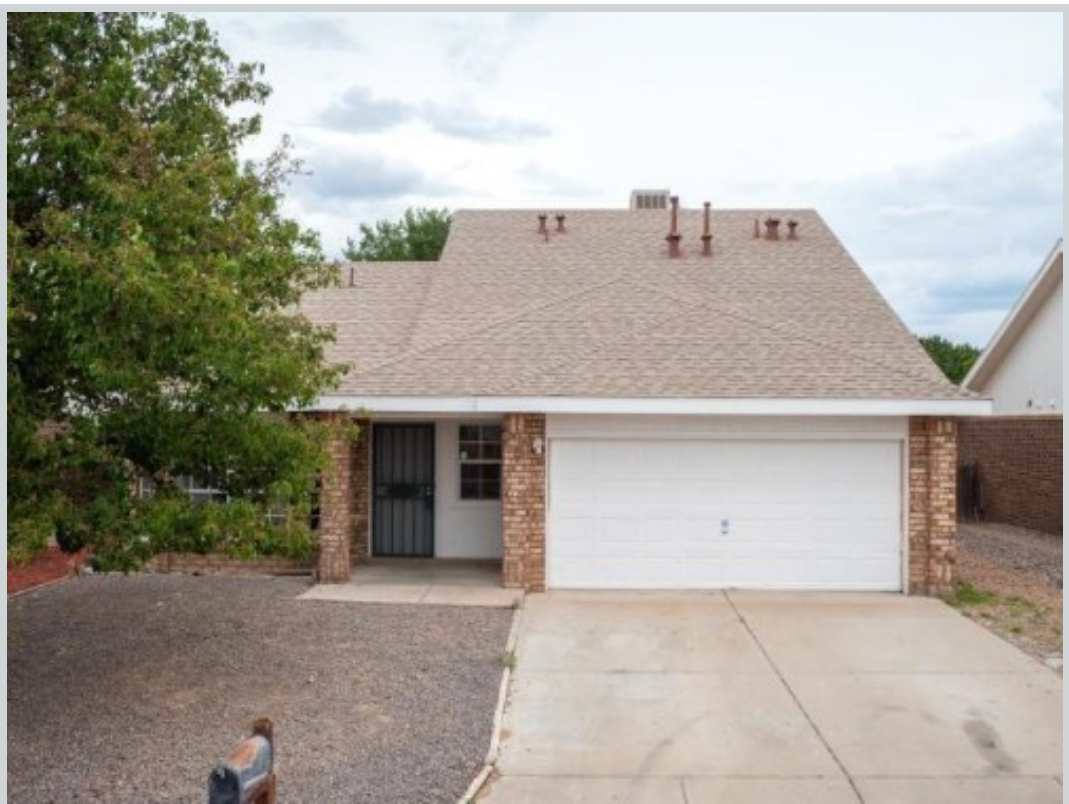
Listing Comp 1 8 Apache Plume Rd