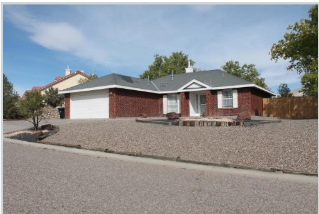
Sold Comp 3 26 Cedar Ave