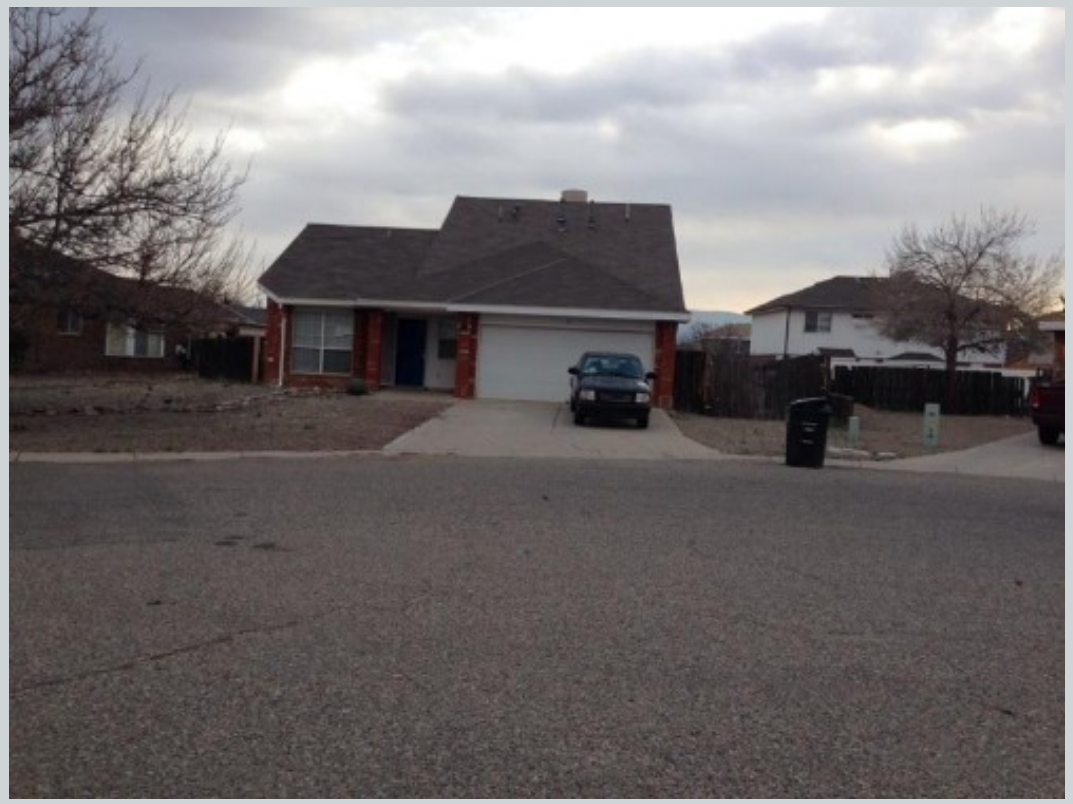
Subject 36 Apache Plume Rd