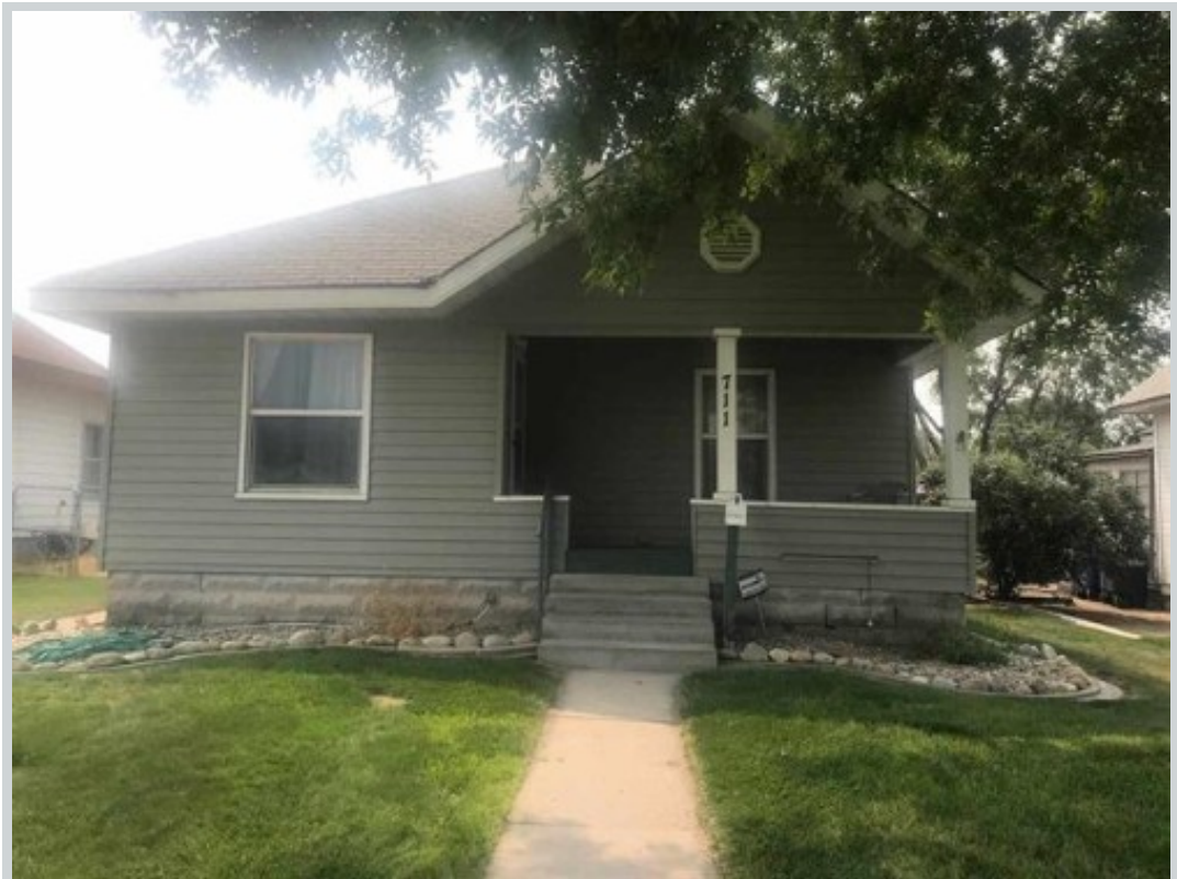
Sold Comp 3 711 2nd Ave. North