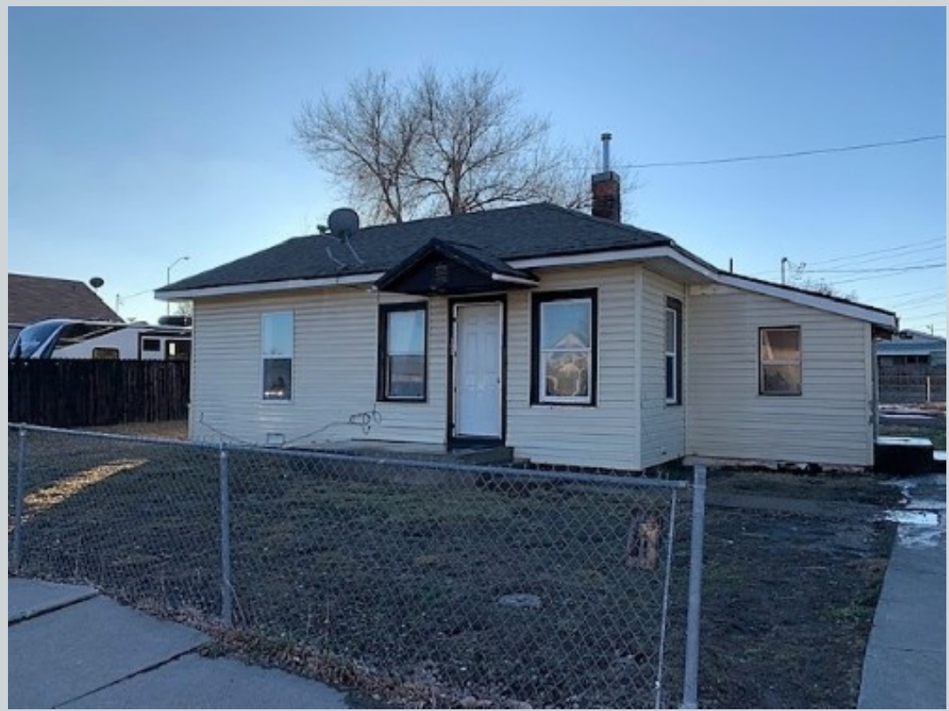
Listing Comp 1 105 Madison