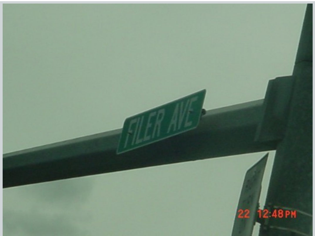
Subject 157 Filer Ave