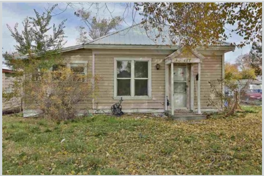
Sold Comp 1 602 2nd Ave. West