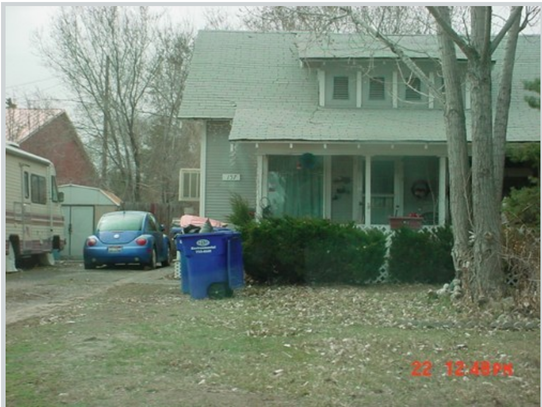
Subject 157 Filer Ave