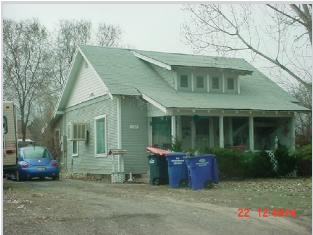
Subject 157 Filer Ave

Address 157 Filer Avenue, Twin Falls, ID 83301 Loan Number 37321 Suggested List $82,000 Suggested Repaired $82,000 Sale $76,500