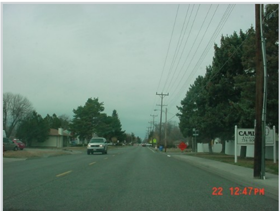
Subject 157 Filer Ave