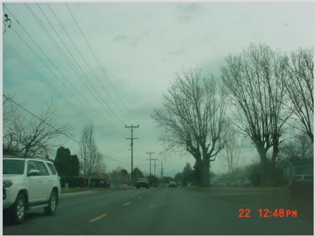
Subject 157 Filer Ave