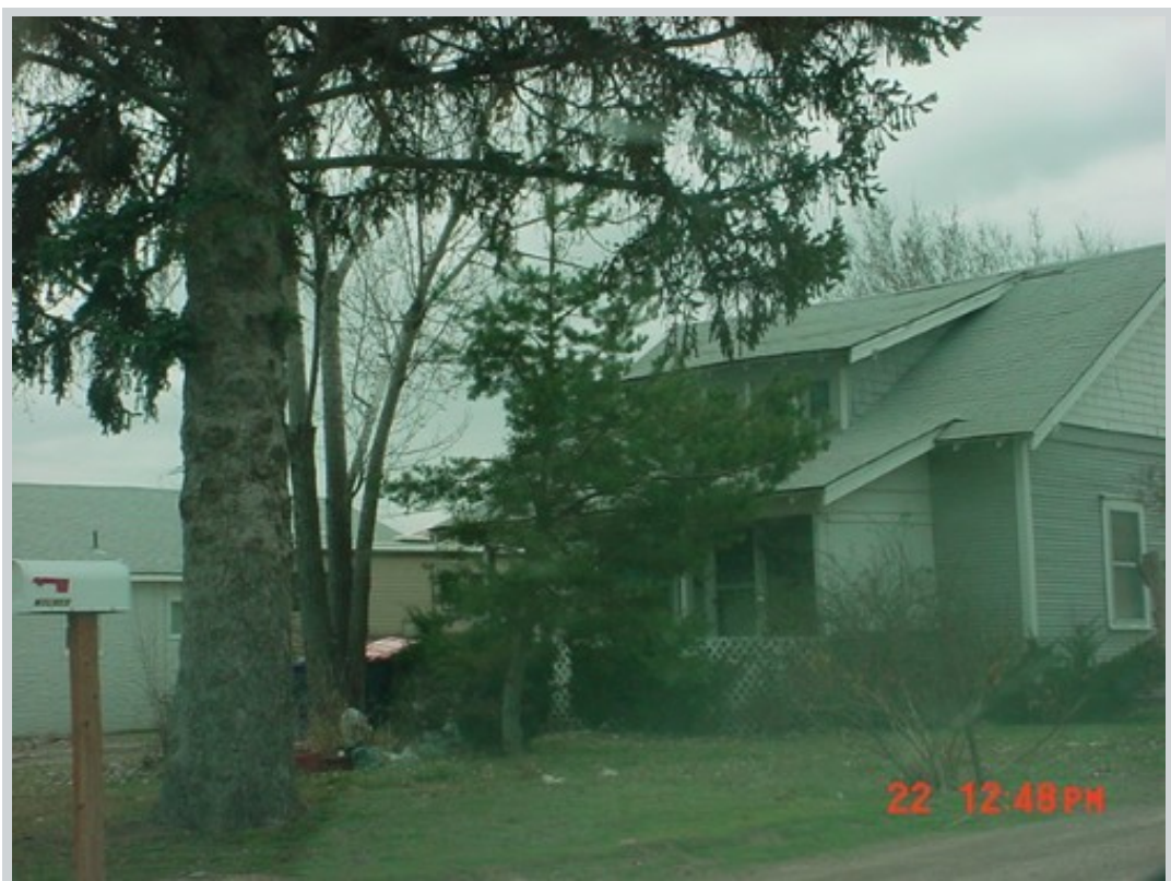
Subject 157 Filer Ave

Address 157 Filer Avenue, Twin Falls, ID 83301 Loan Number 37321 Suggested List $82,000 Suggested Repaired $82,000 Sale $76,500