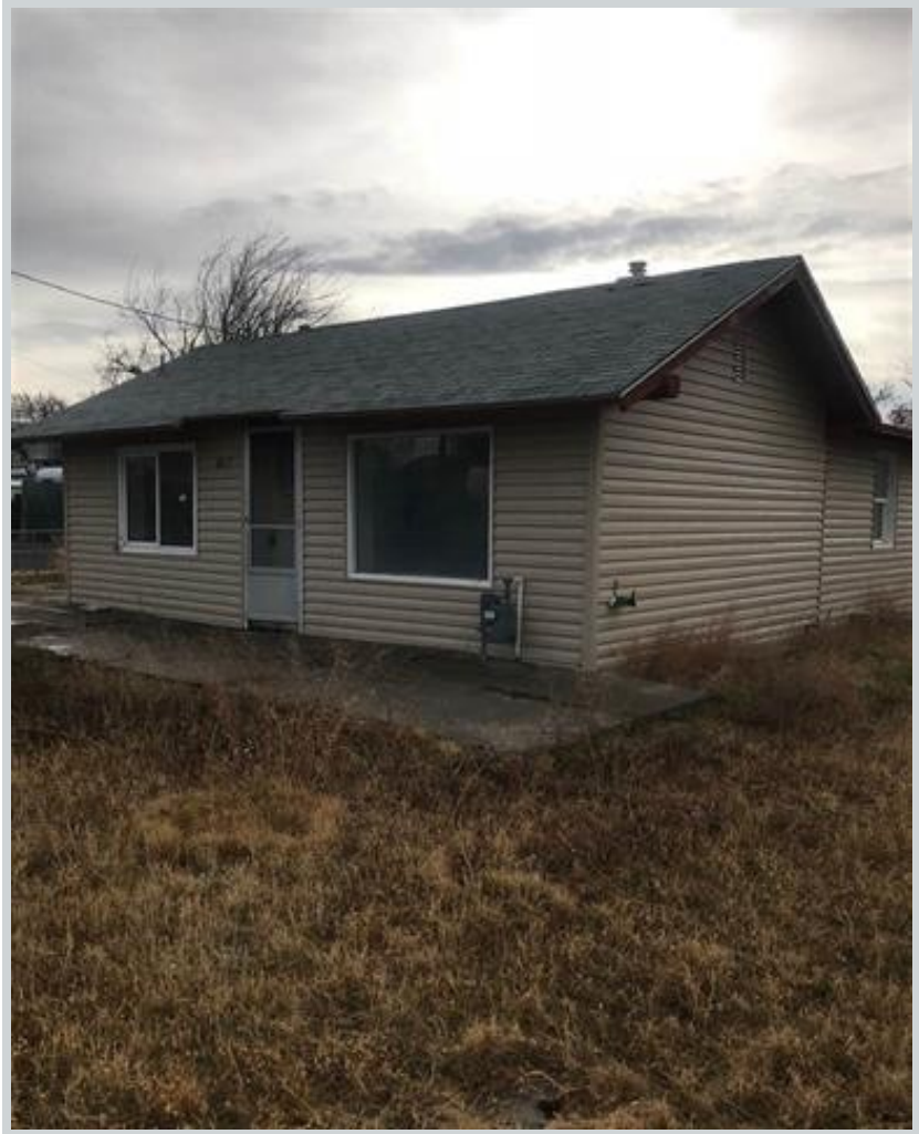
Sold Comp 2 867 3rd Ave. West