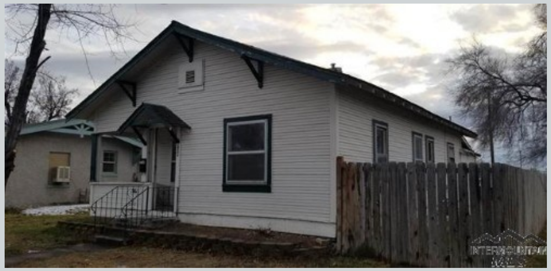
Listing Comp 3 729 2nd Ave. West