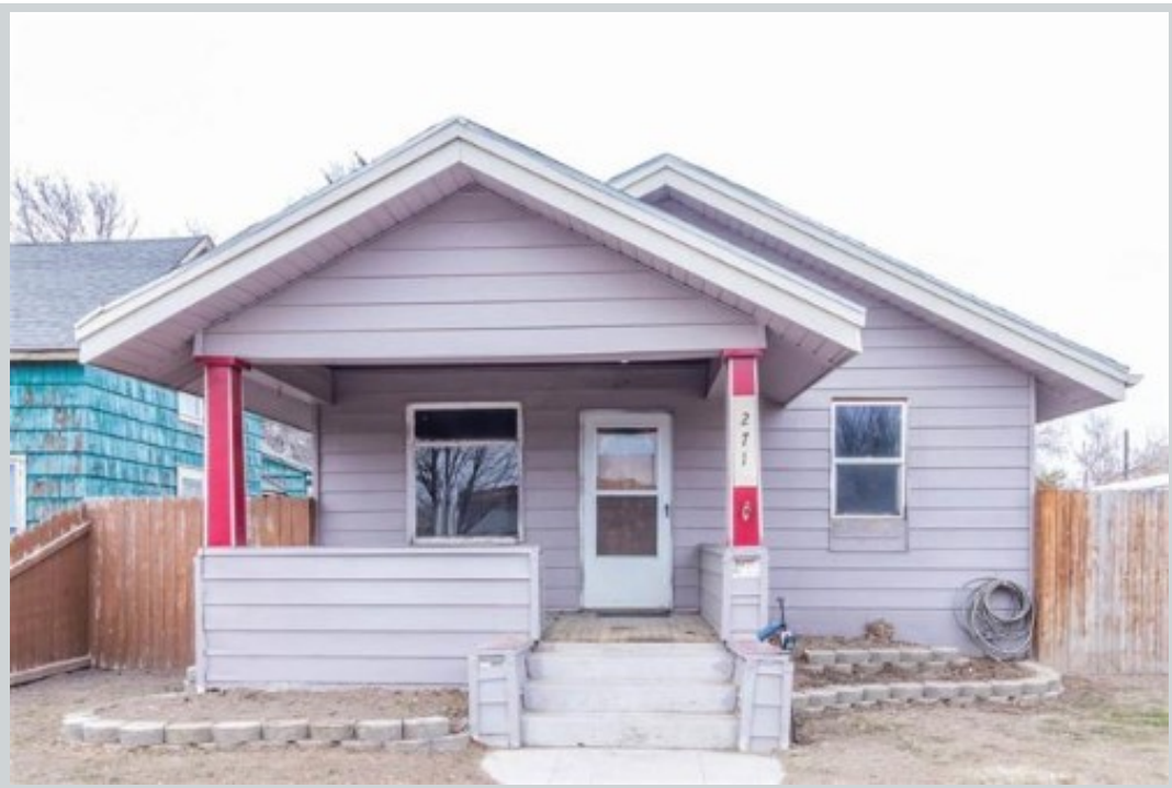
Listing Comp 2 271 Addison