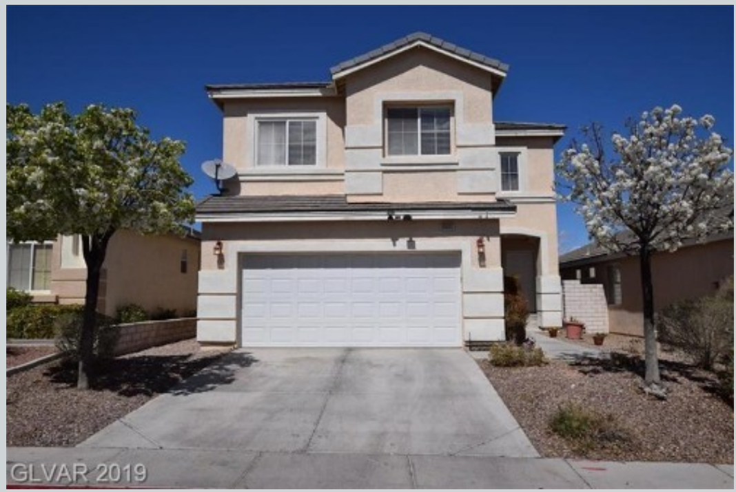
Listing Comp 2 8900 Crooked Shell Av