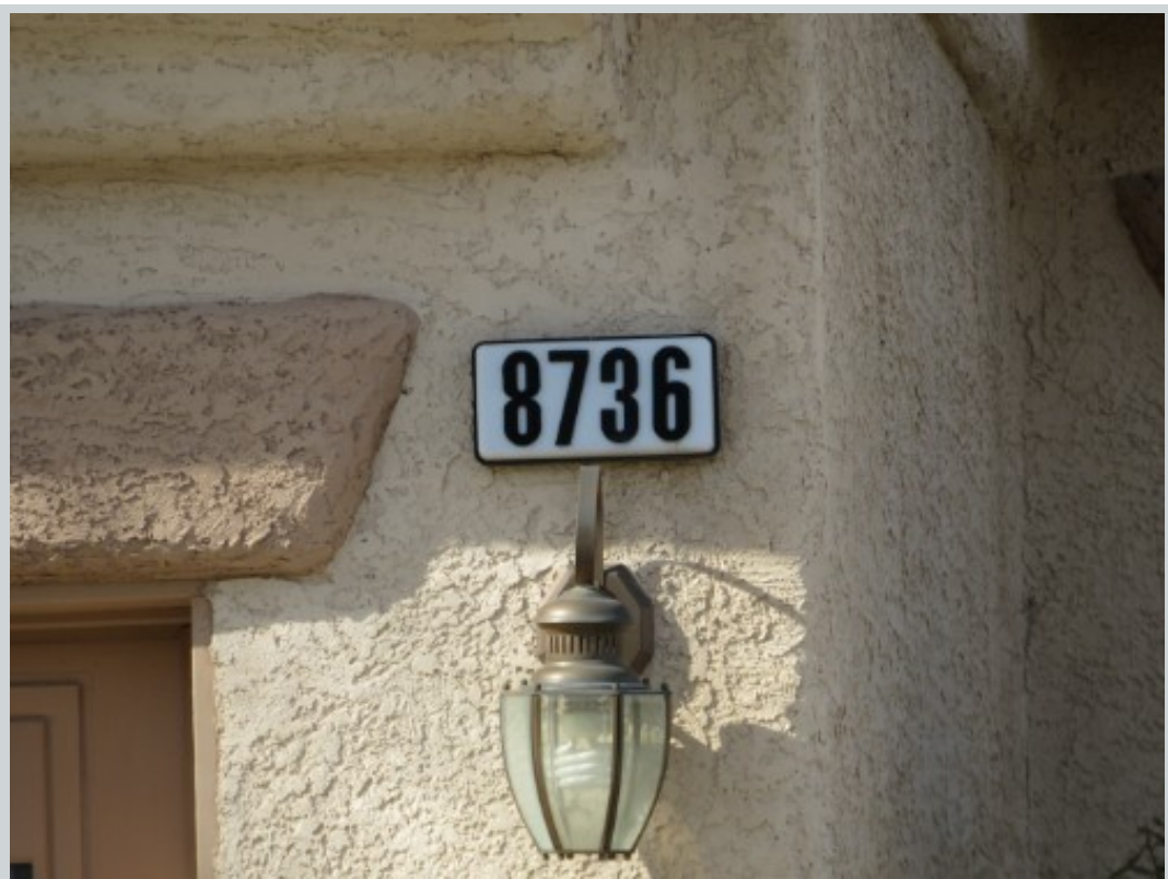
Subject 8736 Shady Pines Dr