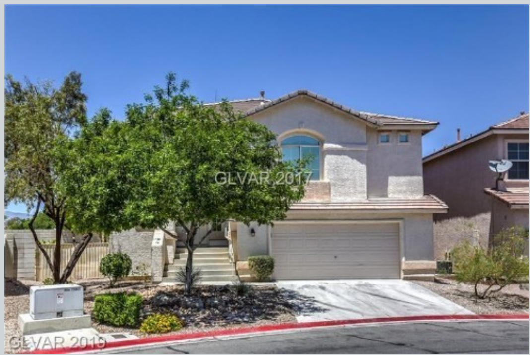
Listing Comp 3 8125 Diamond Heights St