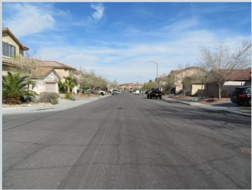
Subject 8736 Shady Pines Dr