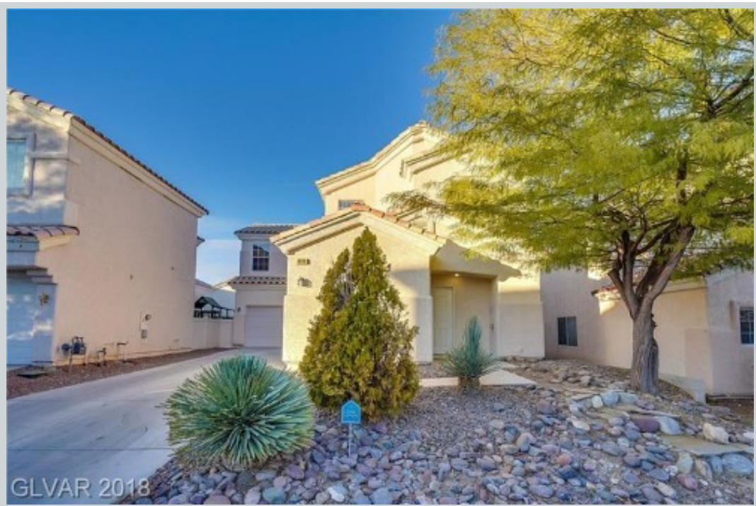
Listing Comp 1 8876 Sparkling Creek Av