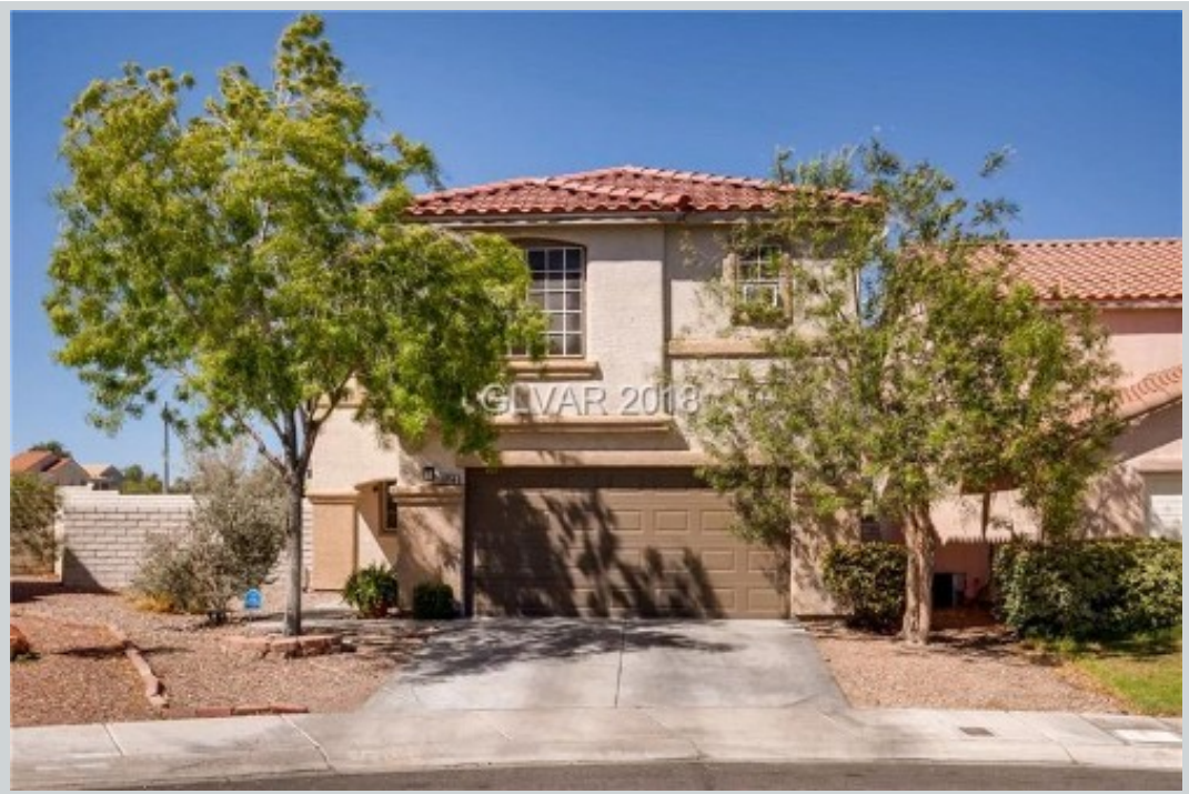
Sold Comp 2 8756 Majestic Pine