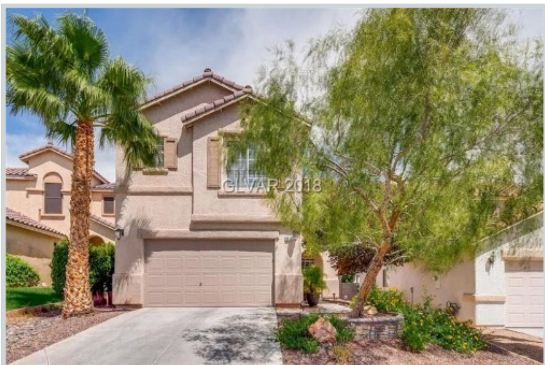
Sold Comp 3 8632 Hidden Pines Av