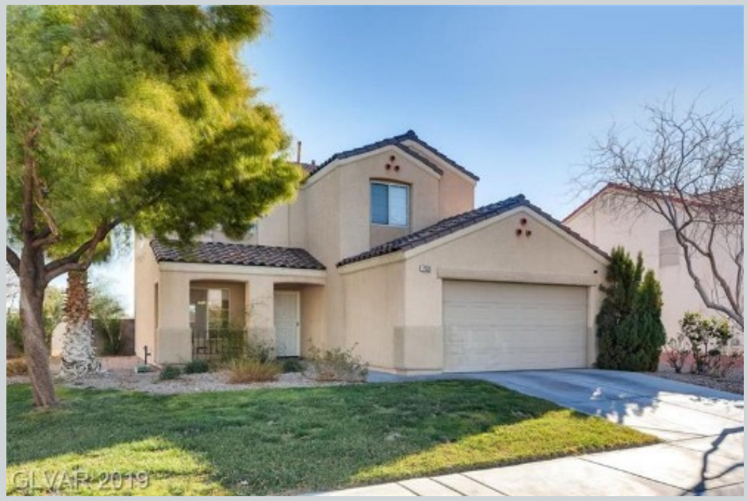
Sold Comp 1 7820 Restless Pines St