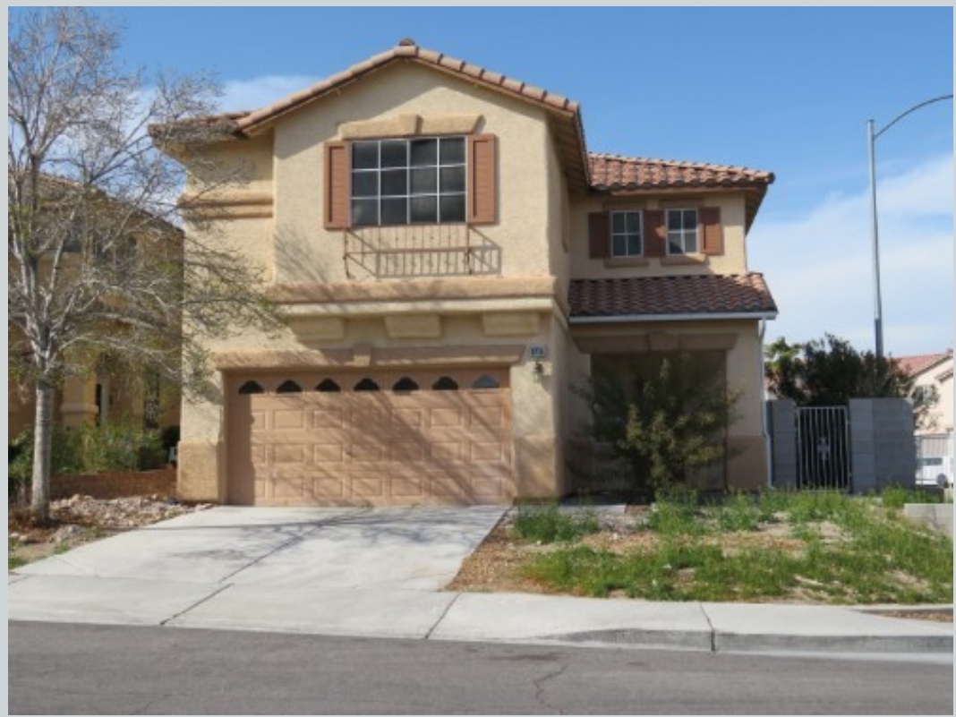
Subject 8736 Shady Pines Dr