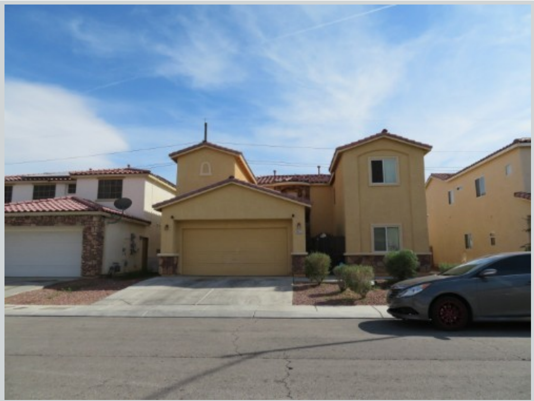
Subject 3617 Tertulia Ave