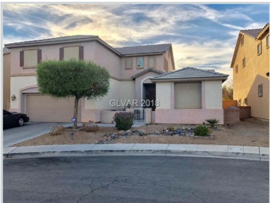
Sold Comp 1 6231 Sun Seed Ct