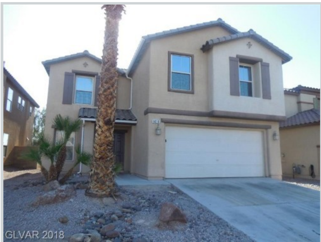
Sold Comp 2 6016 Thornton St