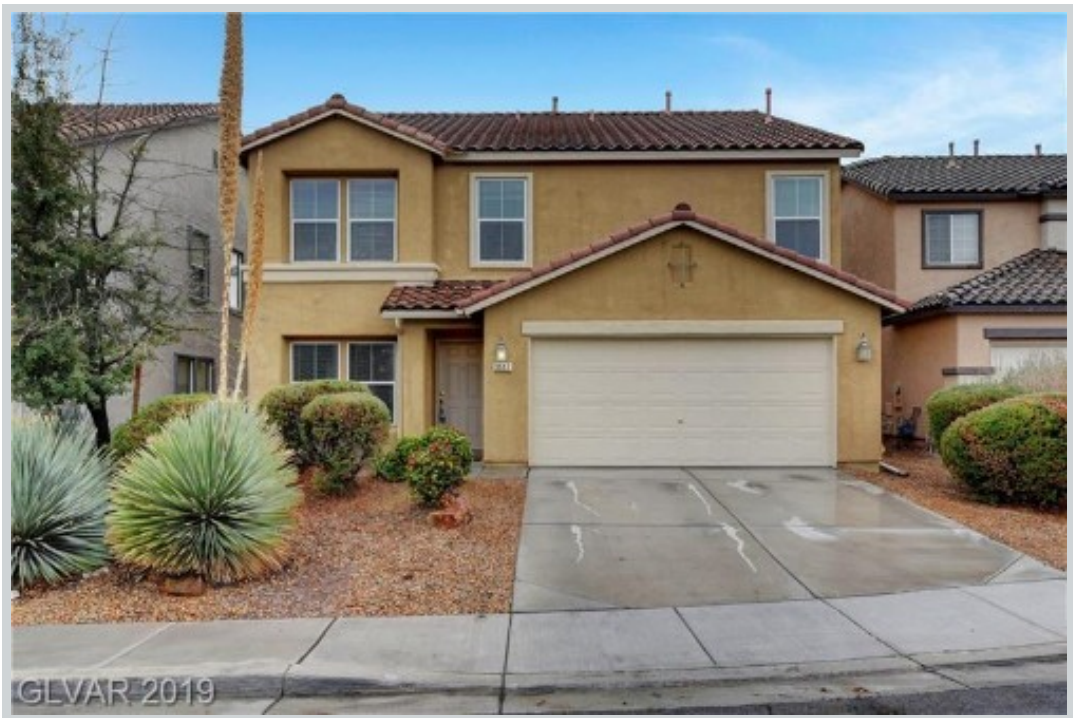
Listing Comp 3 3517 Kendall Point Av