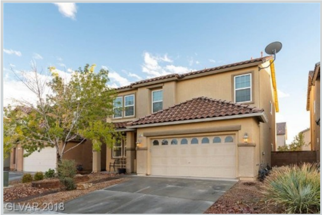
Listing Comp 2 3421 Visionary Bay Av