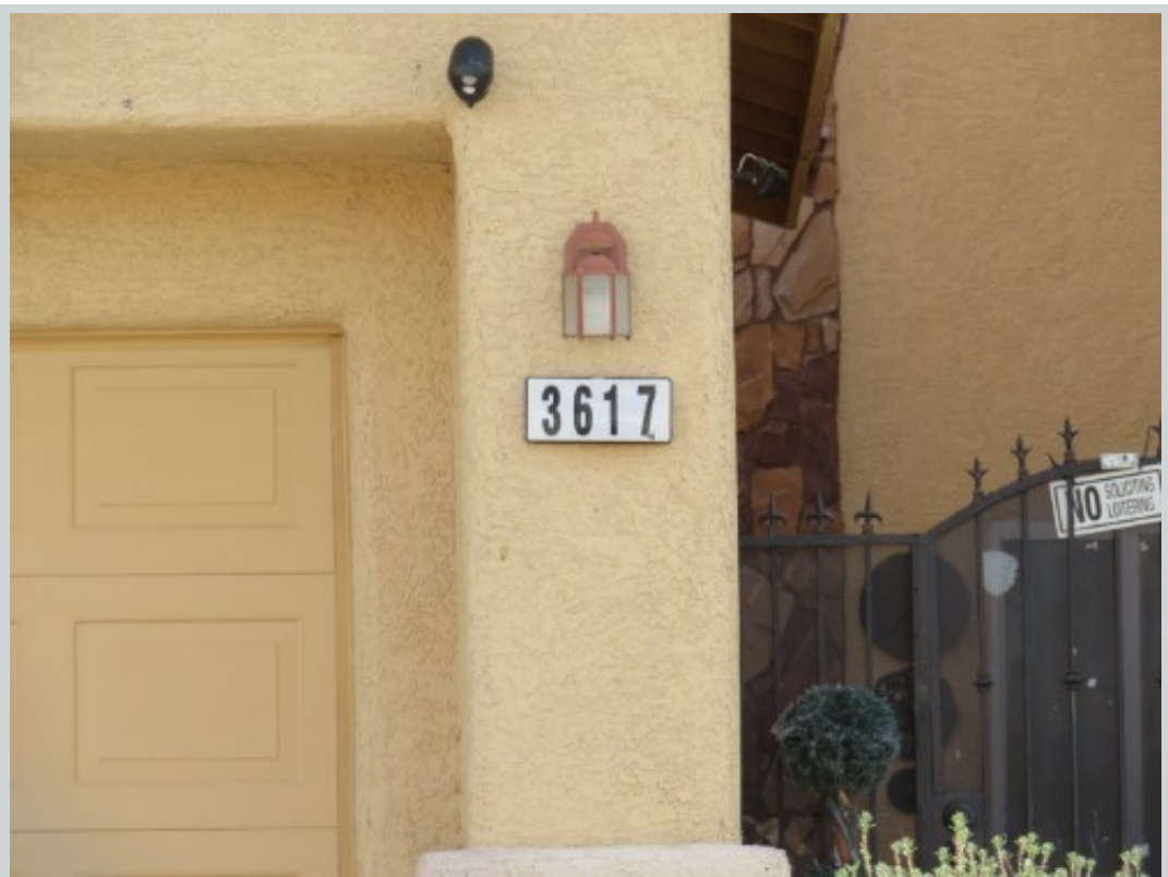
Subject 3617 Tertulia Ave