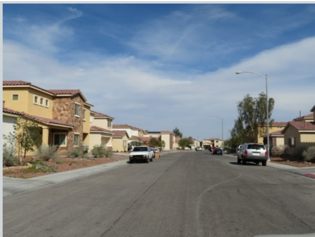
Subject 3617 Tertulia Ave