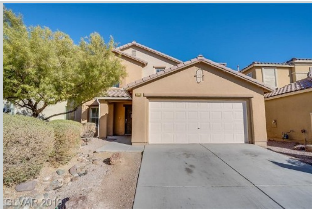
Listing Comp 1 6129 Berrien Springs St