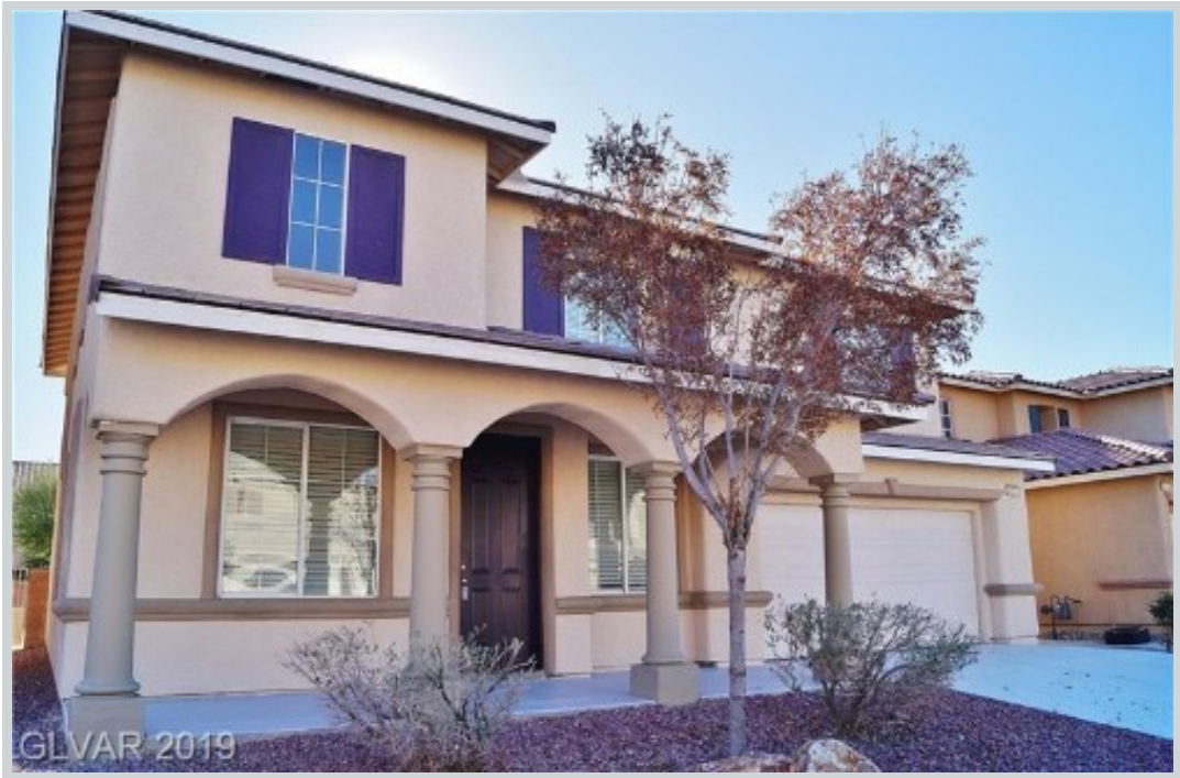
Sold Comp 3 4021 Gaster Av