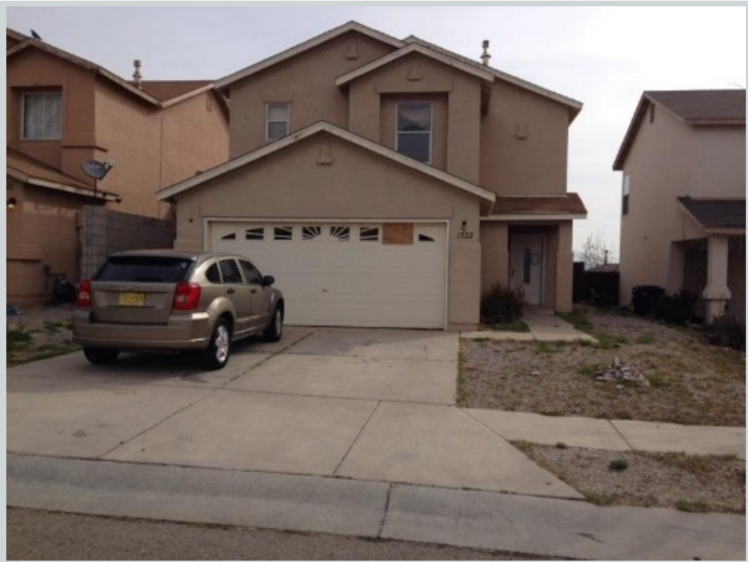
Subject 1322 Ojo Sarco St Sw