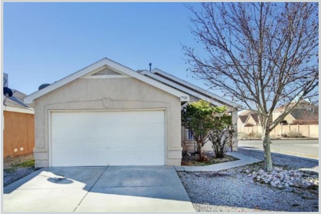
Listing Comp 2 7920 Christopher Rd Sw