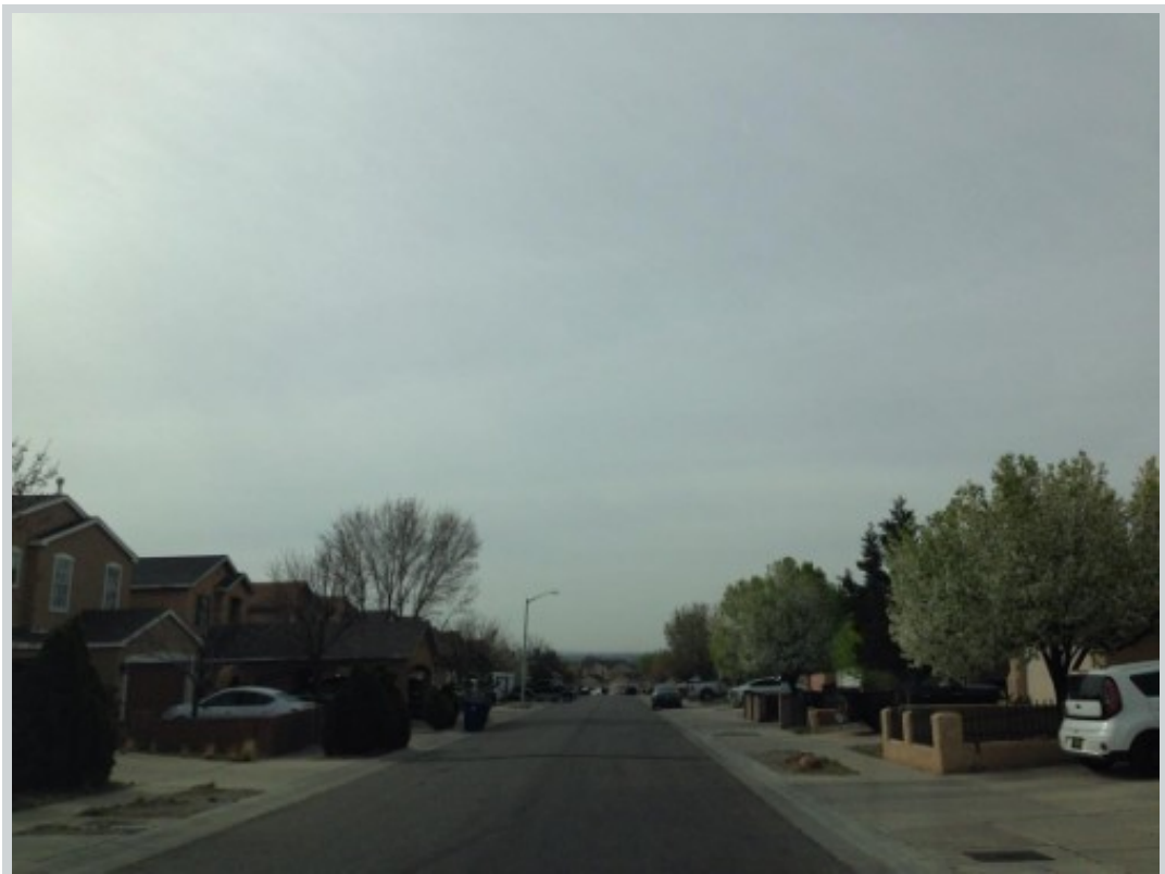
Subject 1322 Ojo Sarco St Sw