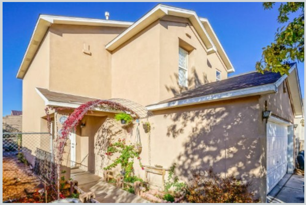
Sold Comp 1 1325 Ojo Sarco St Sw