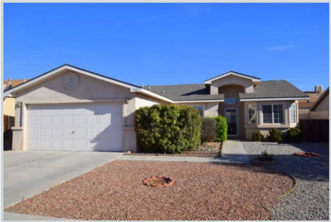
Sold Comp 3 7501 Autumn Canyon Rd Sw