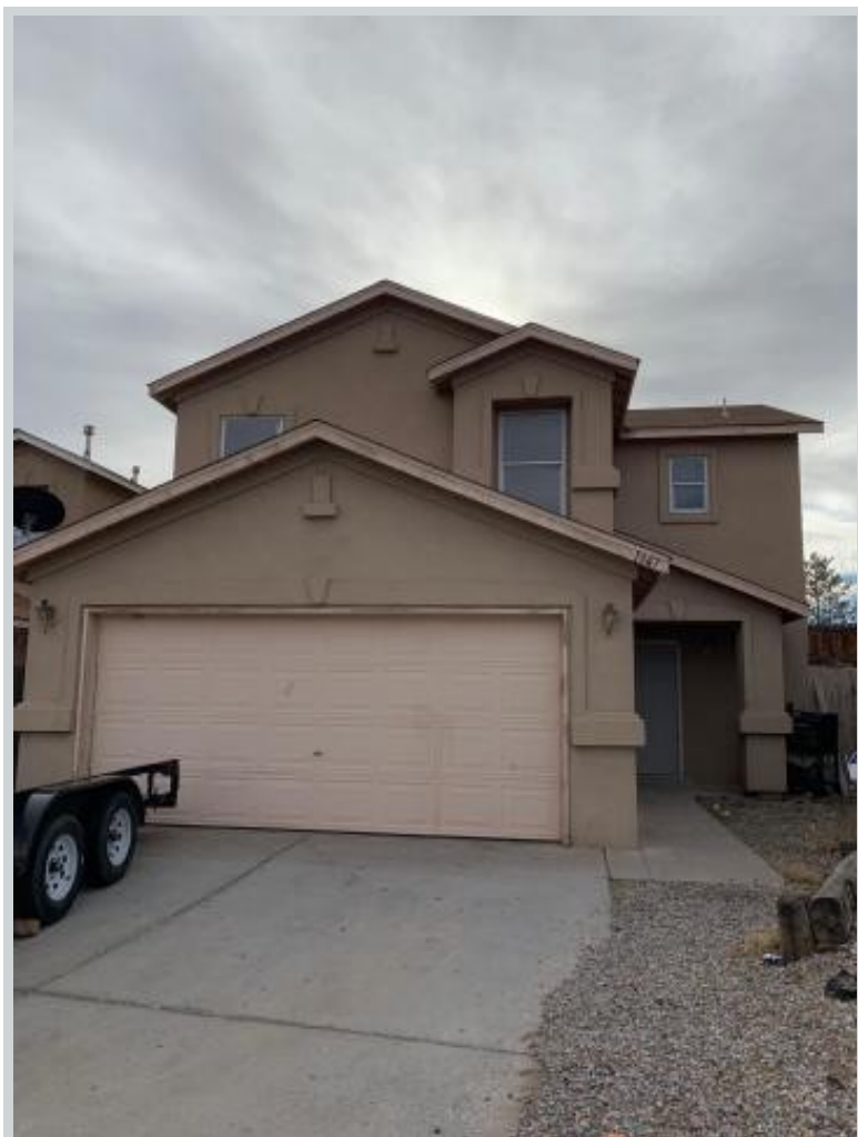
Listing Comp 1 1347 Ojo Sarco St Sw