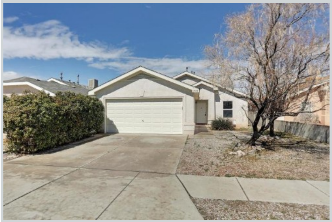
Listing Comp 3 7919 Christopher Rd Sw