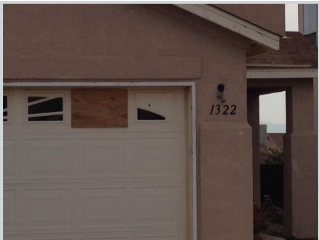
Subject 1322 Ojo Sarco St Sw