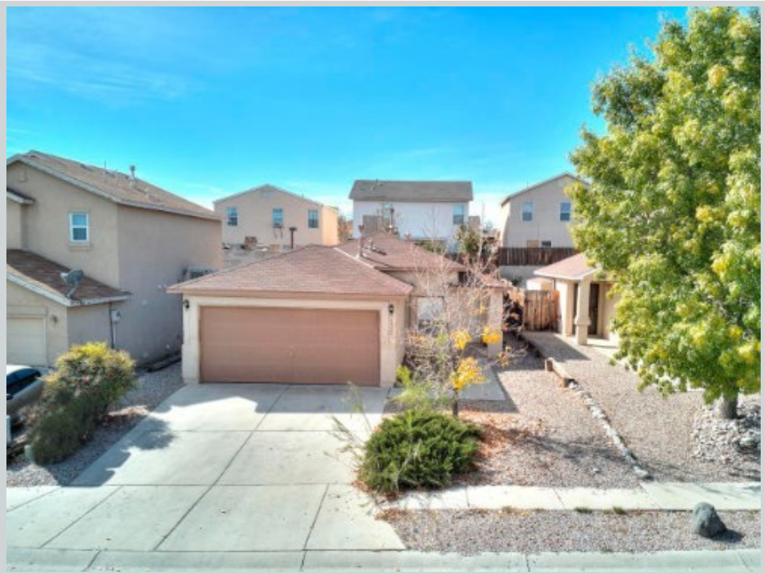
Sold Comp 2 1325 Arroyo Hondo St Sw