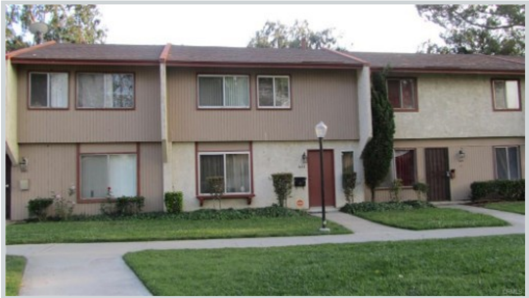
Listing Comp 3 3473 Columbia Avenue