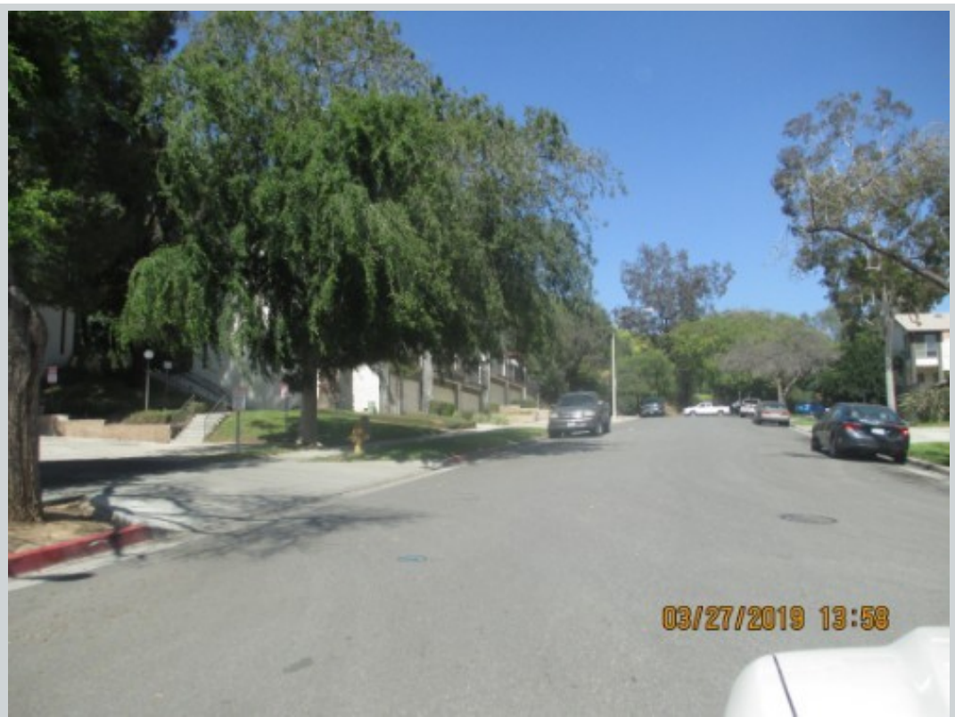
Subject 4670 Maxwell Ct