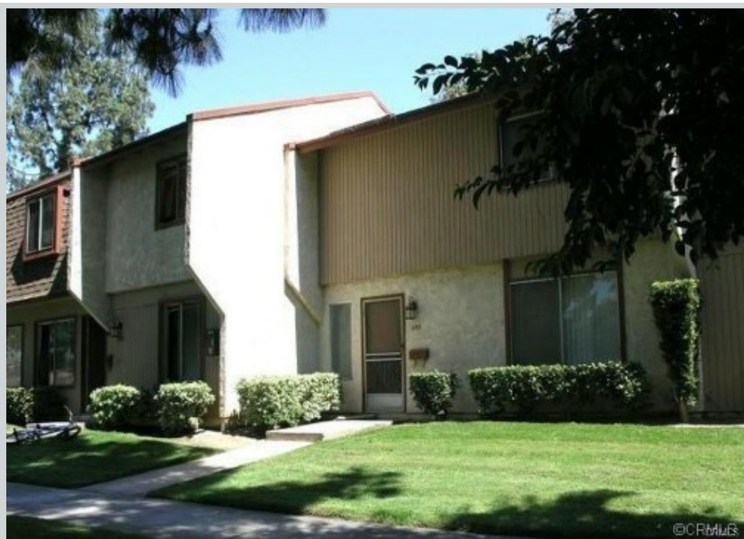
Listing Comp 1 6143 Avenue Juan Diaz View Front

Address 4670 Maxwell Court, Riverside, CA 92501 Loan Number 37342 Suggested List $259,900 Suggested Repaired $259,900 Sale $259,900