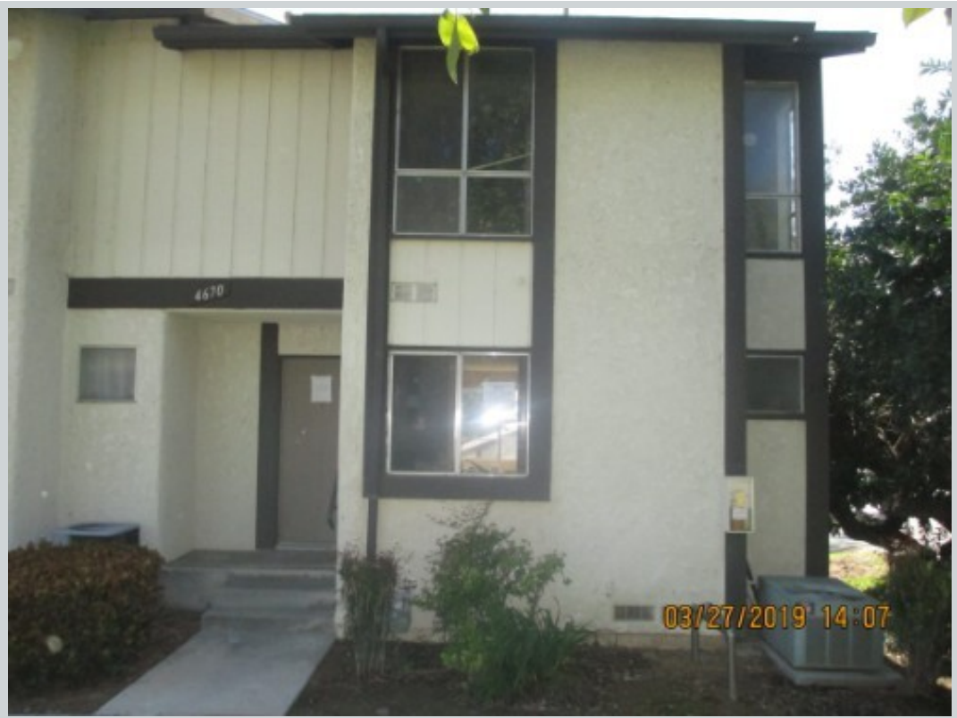
Subject 4670 Maxwell Ct