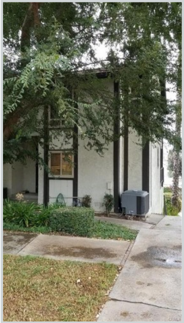
Sold Comp 2 4727 Knickerbocker Lane View Front