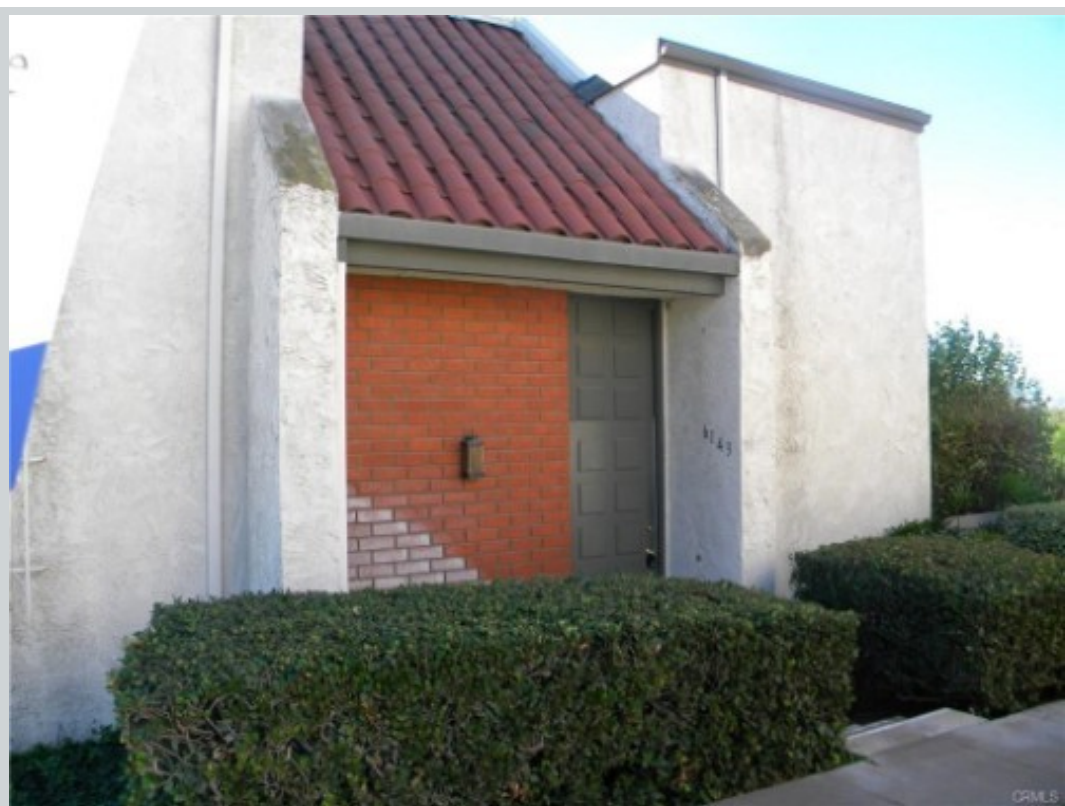
Listing Comp 1 6143 Avenue Juan Diaz View Front