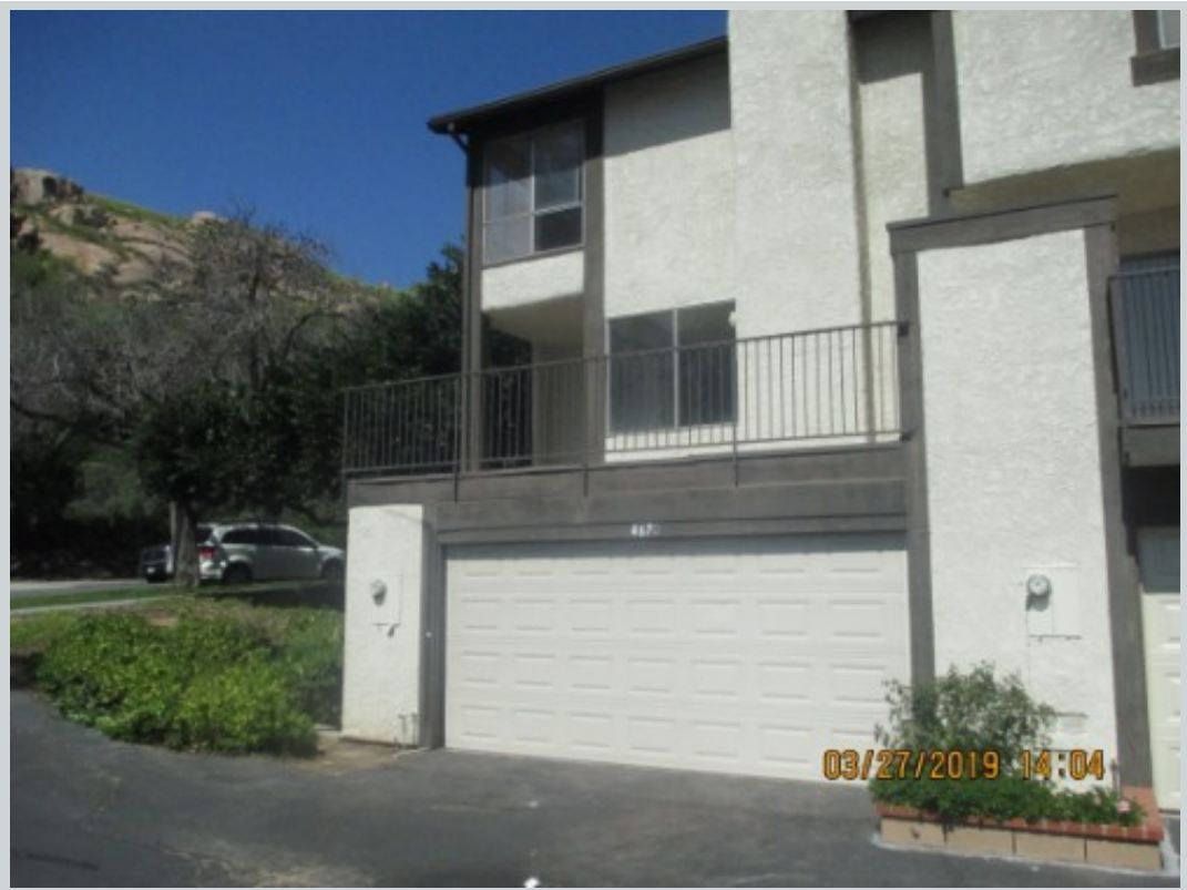
Subject 4670 Maxwell Ct