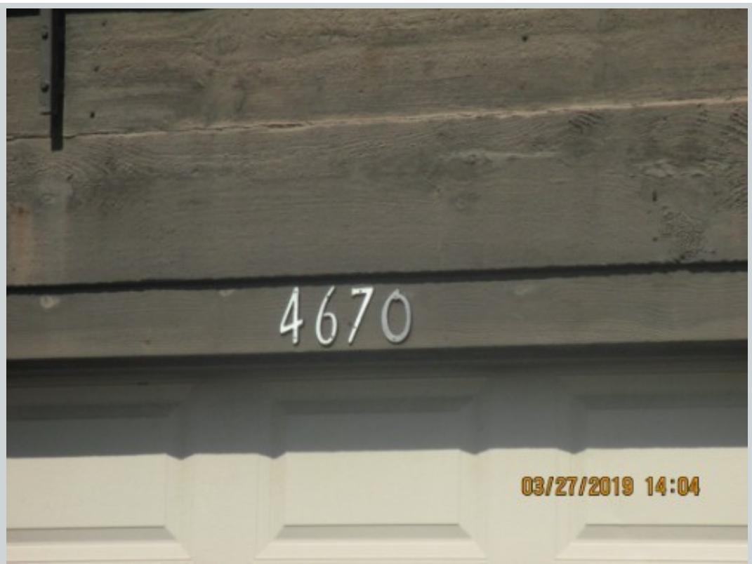
Subject 4670 Maxwell Ct