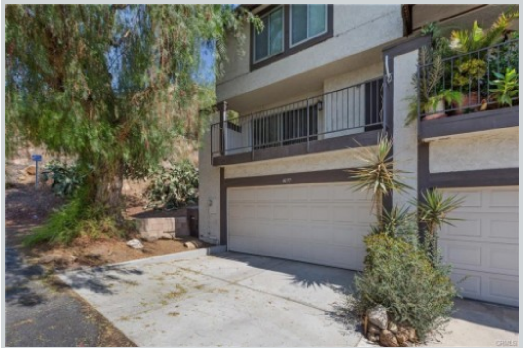
Sold Comp 3 4697 Maxwell Court