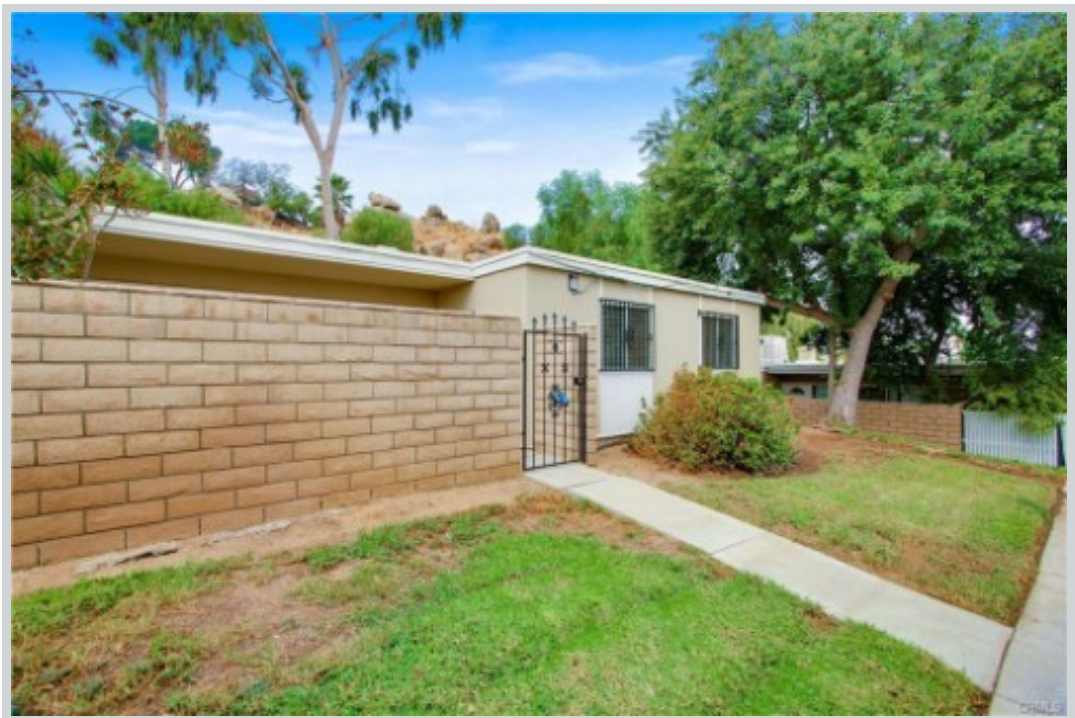
Sold Comp 1 3072 Panorama Road A