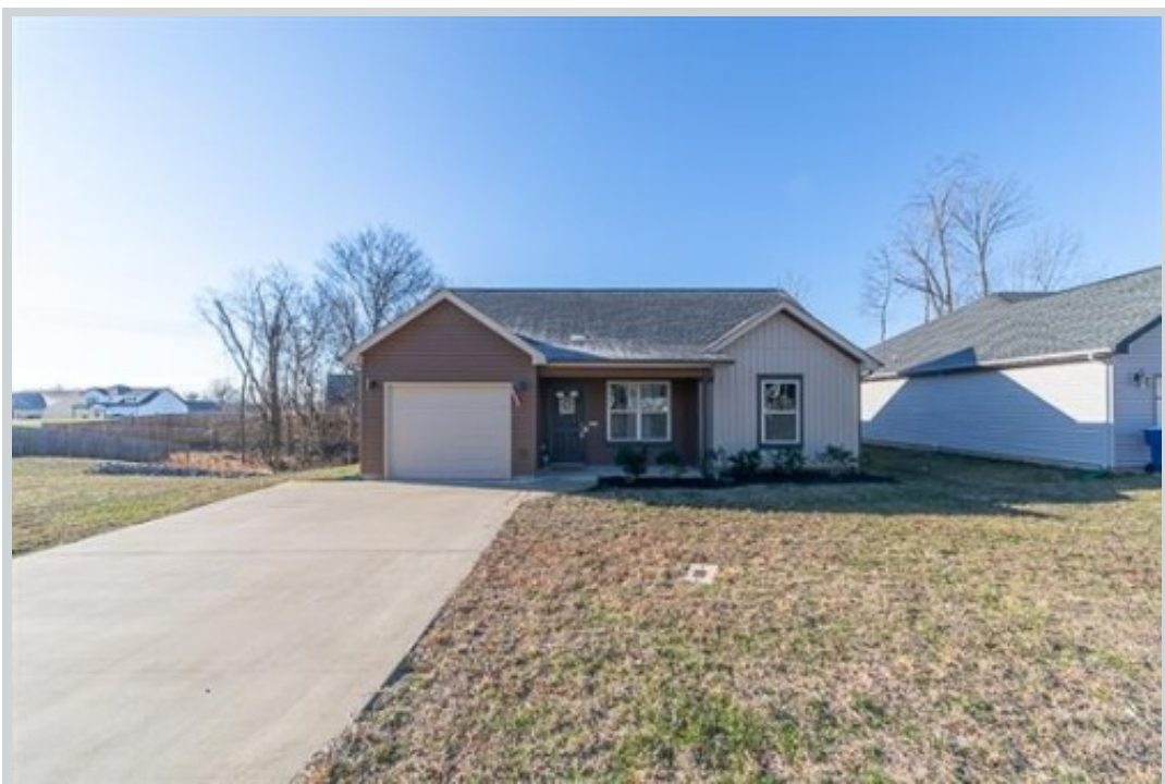
Listing Comp 3 1262 Eagles View Dr View Front Comment "Listing Comparable 3"