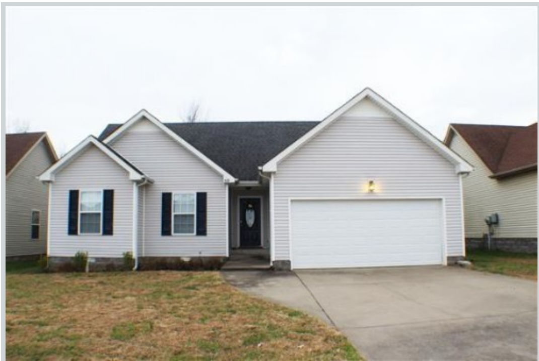
Listing Comp 2 928 Cindy Jo Ct View Front Comment "Listing Comparable 2"

Address 982 Culverson Court, Clarksville, TN 37040 Loan Number 37346 Suggested List $164,900 Suggested Repaired $164,900 Sale $164,900