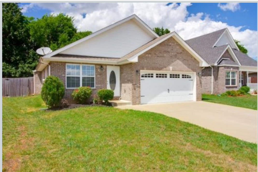
Sold Comp 2 1030 Hendricks Ct