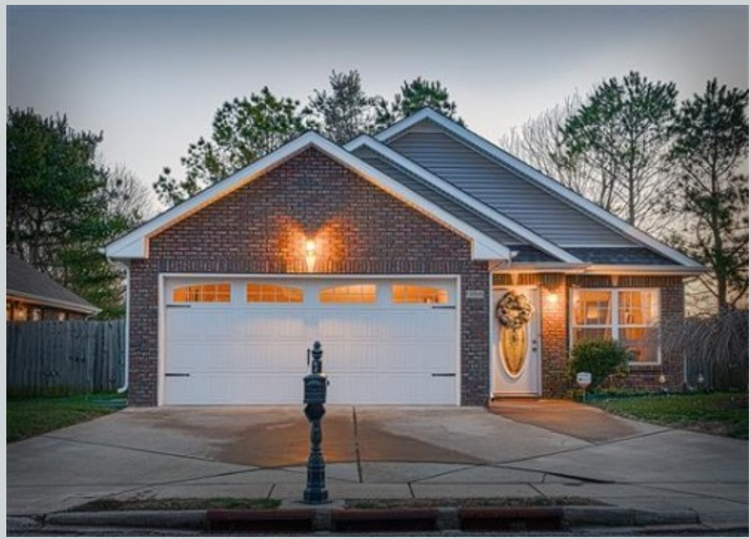
Sold Comp 1 988 Culverson Ct