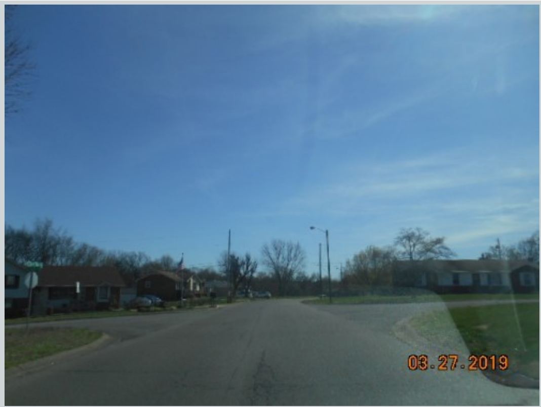
Subject 1574 Cherry Tree Dr