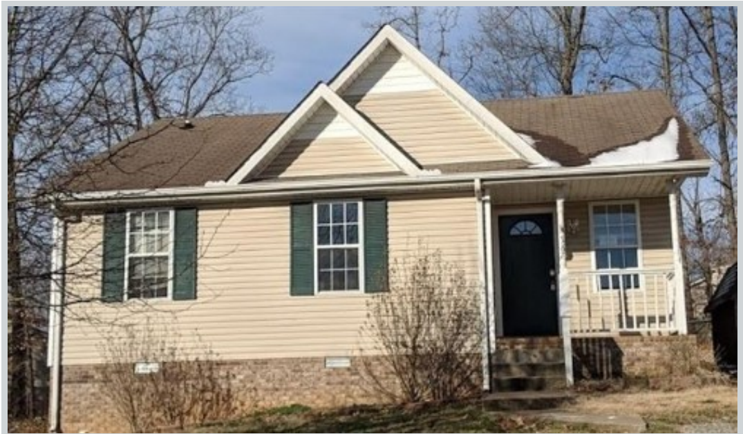
Listing Comp 3 367 Lafayette Point Circle