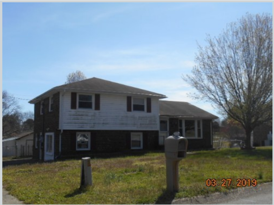
Subject 1574 Cherry Tree Dr