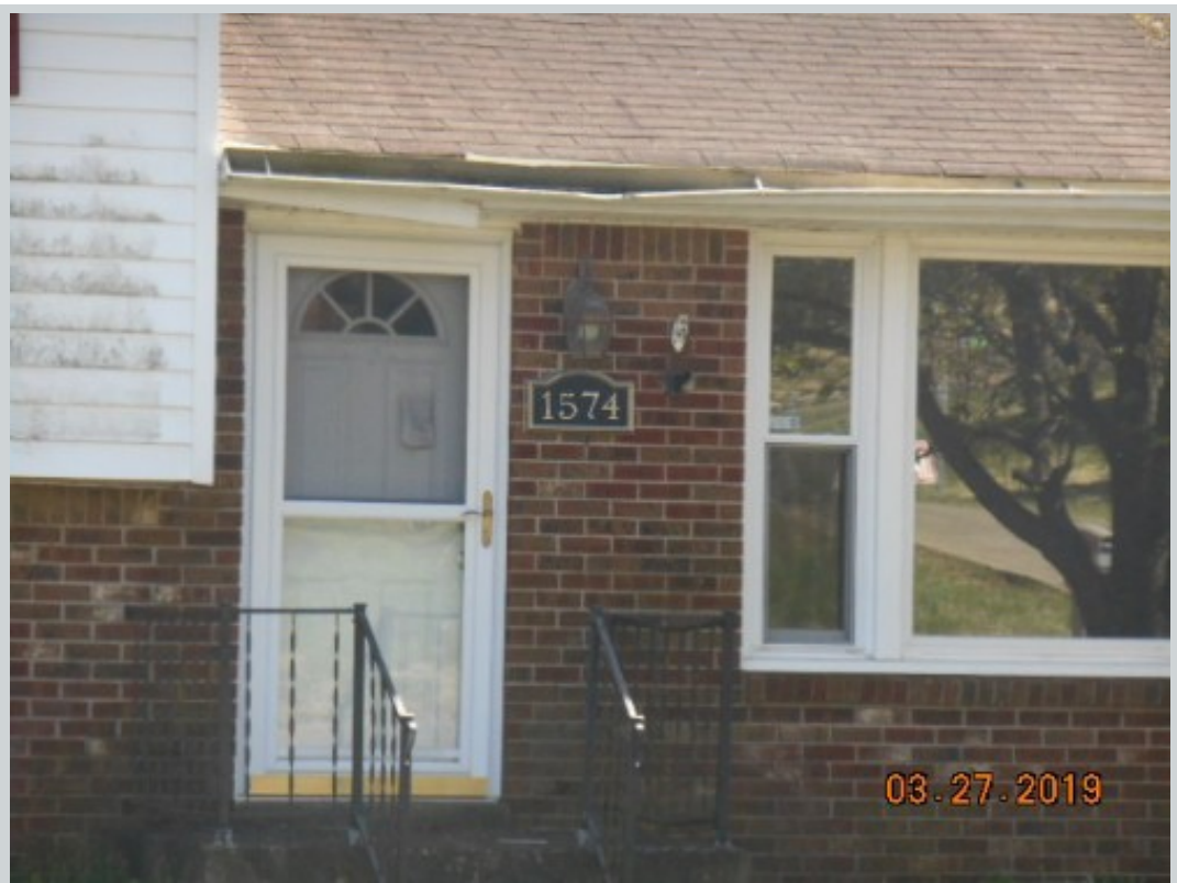
Subject 1574 Cherry Tree Dr