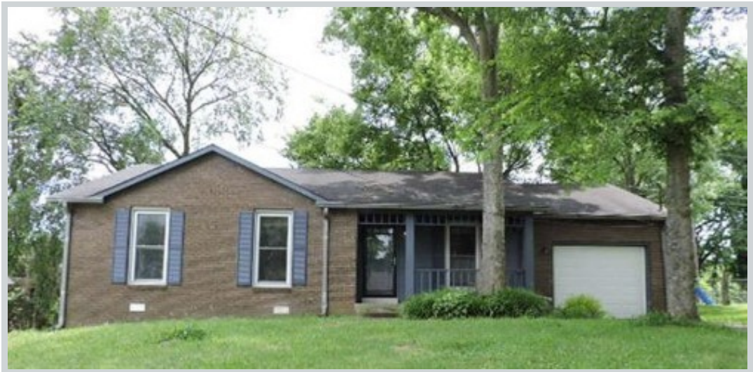
Sold Comp 2 124 Cunningham Place