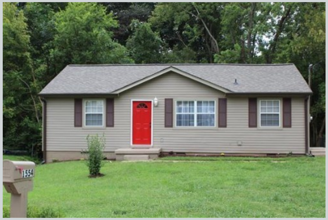
Sold Comp 3 1554 Cherry Tree Dr.