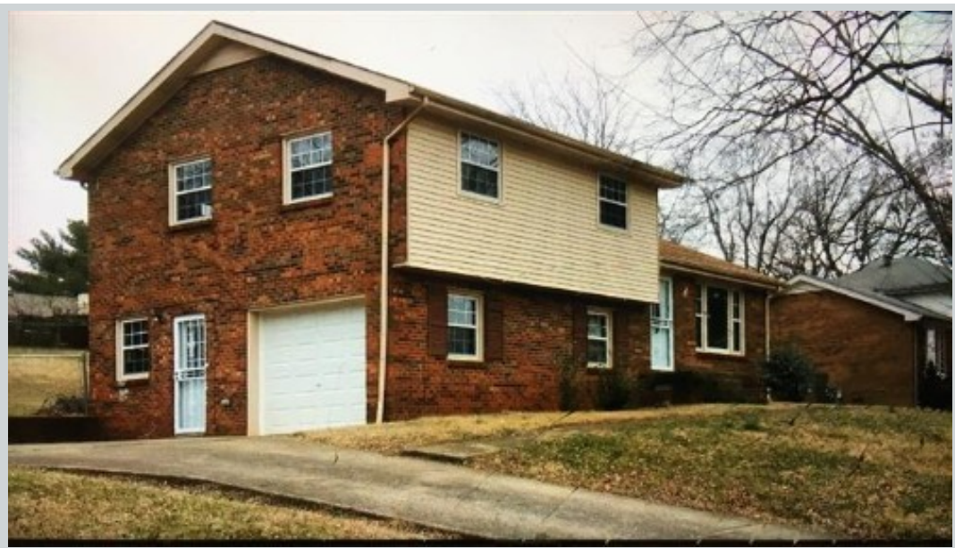
Listing Comp 1 1567 Cherry Tree Dr.