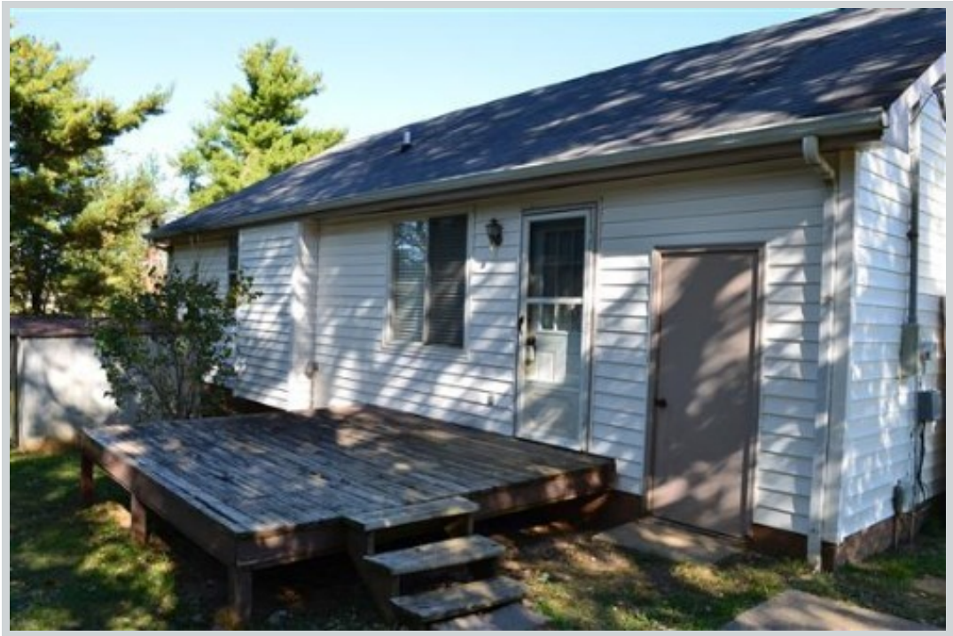
Sold Comp 1 146 Cunningham Place