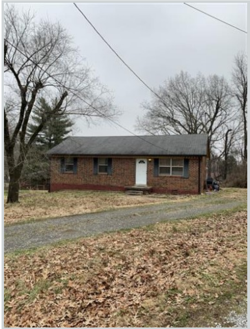
Listing Comp 2 609 Lafayette Ct.