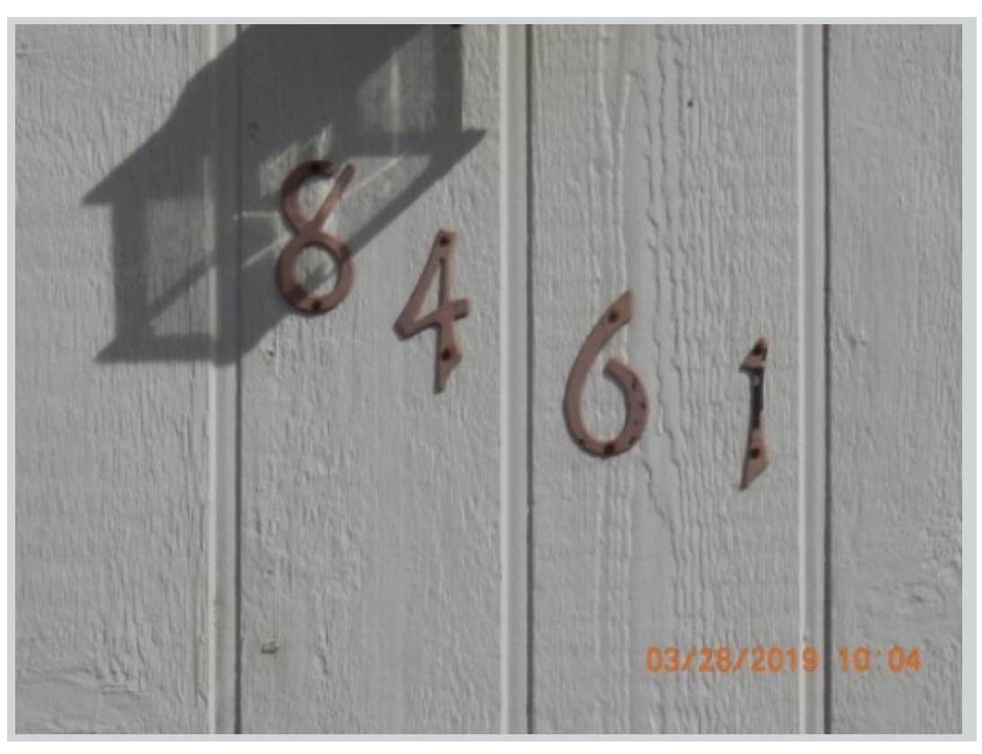
Subject 8461 Madison Way